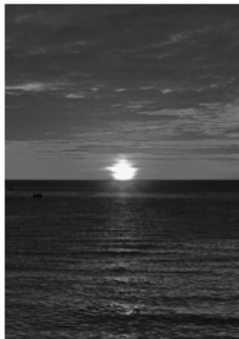
Ko Sin Tung The sun is not here (8) 太陽不在這裏 (8), 2015 Edouard Malingue Gallery HKD $40,000 - 50,000