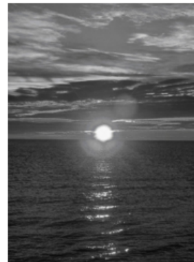
Ko Sin Tung The sun is not here (6) 太陽不在這裏 (6), 2015 Edouard Malingue Gallery HKD $40,000 - 50,000

Also prompting ambiguous questions are Ko's experiments with light in works like The sun is not here , a series of black-and-white photographs of sunrises. Pixelated and blurry, the works lead to larger questions about objectivity: if photographs dictate how we come to see the world, then what value do these 'bad' images, with their visual imperfections, have? Two fine, superimposed diagonal lines meet at the center of the glowing orbs, as if guiding viewers to focus on a point that ultimately bears no fruit.