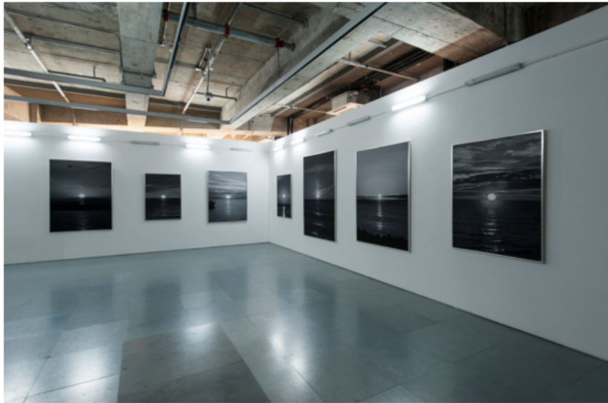
Installation view " underground construction: failed " at Edouard Malingue Gallery, Hong Kong.