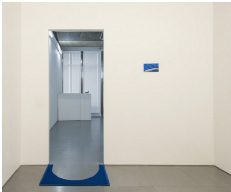
Installation view " underground construction: failed " at Edouard Malingue Gallery, Hong Kong.

Hong Kong artist Ko Sin Tung's latest solo exhibition at Edouard Malingue Gallery provokes an unsettling sense of incompleteness from the outset. Titled "underground construction: failed," the exhibition greets visitors with a kind of bizarre welcome mat: a scrap of carpet, with a half-moon cut out. To the right of the doorway, just before entering, a small photograph covered with thick strips of blue tape also welcomes the viewer. One can only guess that it's an image of the West Kowloon Terminus construction site and its aesthetic is one that is echoed in several other pixelated images of the same site, found throughout the exhibition.