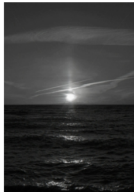
Ko Sin Tung The sun is not here (4) 太陽不在這裏 (4), 2015 Edouard Malingue Gallery HKD $50,000 - 75,000