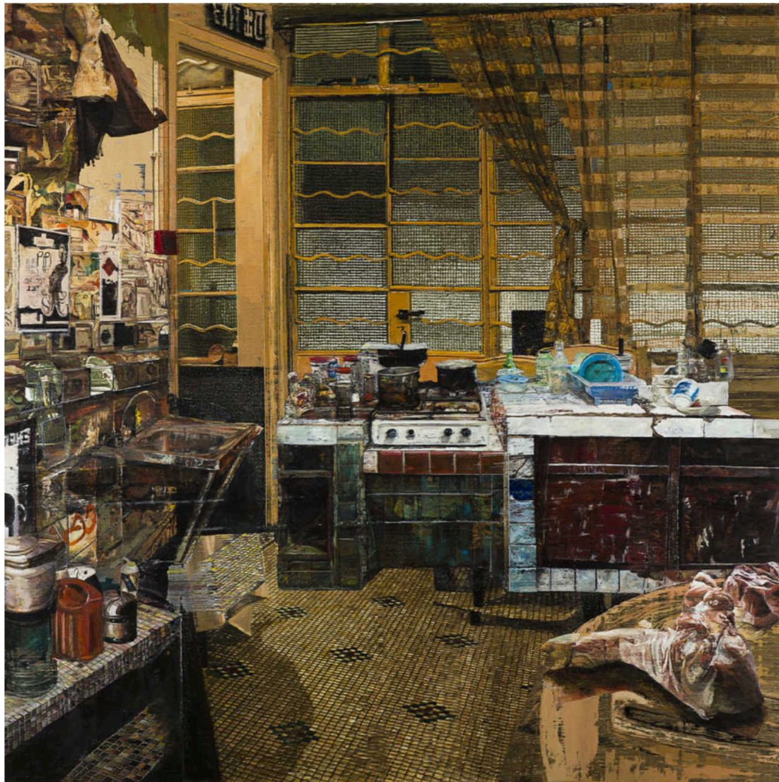
Yuan Yuan, "Mandarin Duck", 2018. Oil on canvas, 200 x 200 cm.

The visual impact of an imaginary alternative space and time is complemented by the display method at Palazzo Terzi. Yuan Yuan's works sometimes are hidden from plain sight and blended into the palatial rooms; at other times they are slightly highlighted by contemporary hanging techniques, leaning against the brocade wall tapestries or the frame of an imposing chimney.