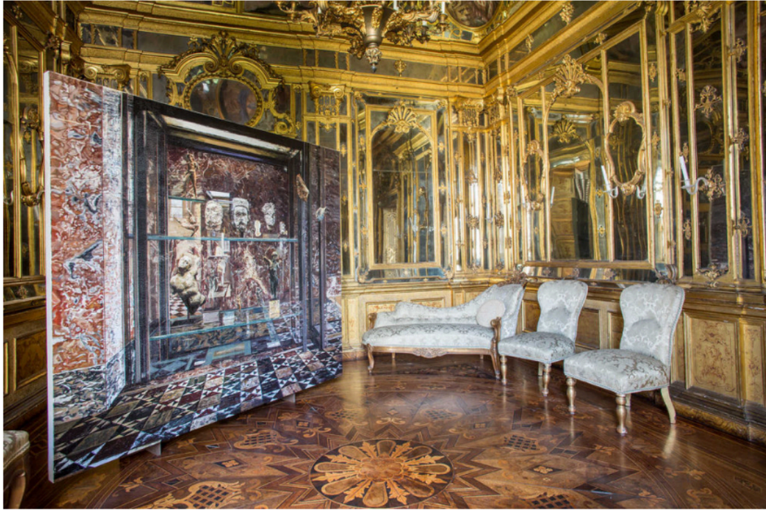
Installation view of 'Alternative Realities' at Palazzo Terzi.