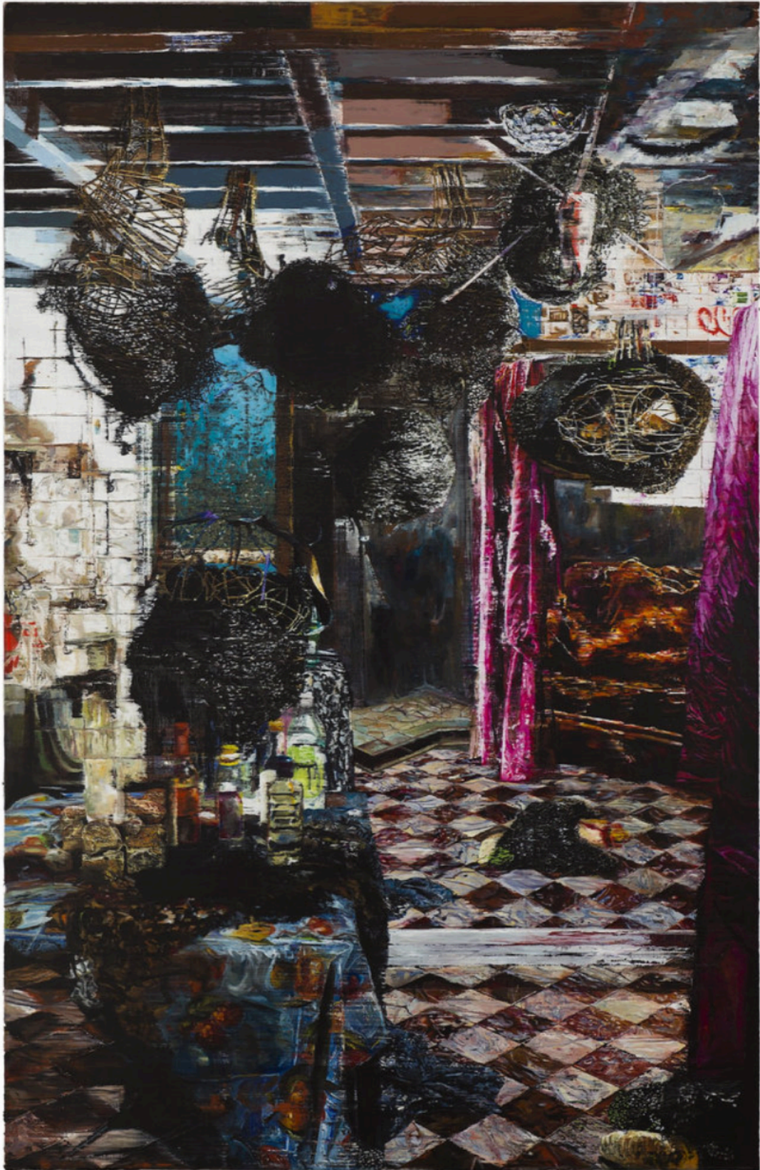
Yuan Yuan, "Dried Food", 2018. Oil on canvas, 189 x 122 cm.