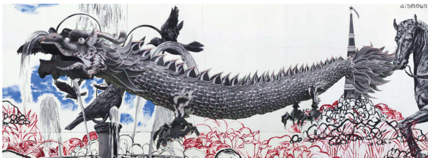
"Magician Party and Dead Crow" (still) (2013) by Sun Xun. Image courtesy of artist.

A strange, yet familiar world is created in Sun Xun's major solo exhibition at the Museum of Contemporary Art Australia. Occupying the first floor of the gallery, the exhibition showcases the last ten years of Sun's oeuvre with drawings, paintings, woodcuts, installations, and animated videos being sprawled across the gallery walls. Curated by Anna Davis, Sun's curious mind is revealed through the bold and surrealist images that conjure up questions about the role of history and memory in contemporary society. An obsessive observer of the present world and meticulous gatherer of its imagery and historical information, Sun creates a parallel universe consisting of familiar monuments, botanical specimens, maps, and industrial machines to comment on 'bugs' or 'cracks' in our everyday systems. Speculating our current world from the imaginative space that Sun has created, the artist creates an expanded view of reality that encompasses both Eastern and Western mythology. Inviting the audience to peruse this world with him, Sun's symbolic visual language is loaded with meaning through every brushstroke.