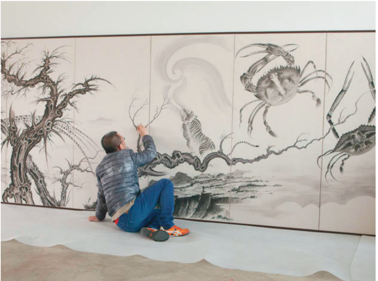
"Invisible Magic" (2018) by Sun Xun. Commissioned by the Museum of contemporary Art Australia and Edouard Malingue Gallery.