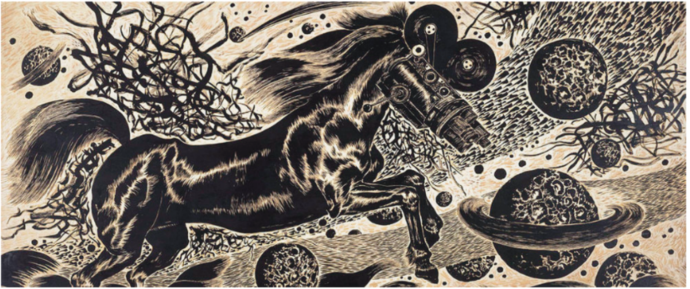
"Time Spy" (still) (2015) by Sun Xun. Commissioned by Audemars Piguet Art Commission.

Growing up in Fuxin (a north-eastern Chinese province of Liaoning) during the 1980s, moving to the modern southern city of Hangzhou during his adolescent years was a fundamental turning point in Sun's perception of the world. Studying at the Central Academy of Fine Arts, Sun witnessed the profound industrial and commercial evolution of China's modernisation. Following Deng Xiaoping's Open Door Policy in 1978, the southern regions of China dove into the capitalist dream whilst the northern regions lingered behind and remained in the fading socialist past. Recognising the drastic contrast between the two regions of the same country during the same time period, Sun's artistic practice often re-visits these conflicting feelings of great change in socio-economic landscapes. It could thus be said that Sun, since his adolescence, has been operating in two worlds at the same time and therefore explains why he has preoccupations with creating an alternate universe in his artistic practice.