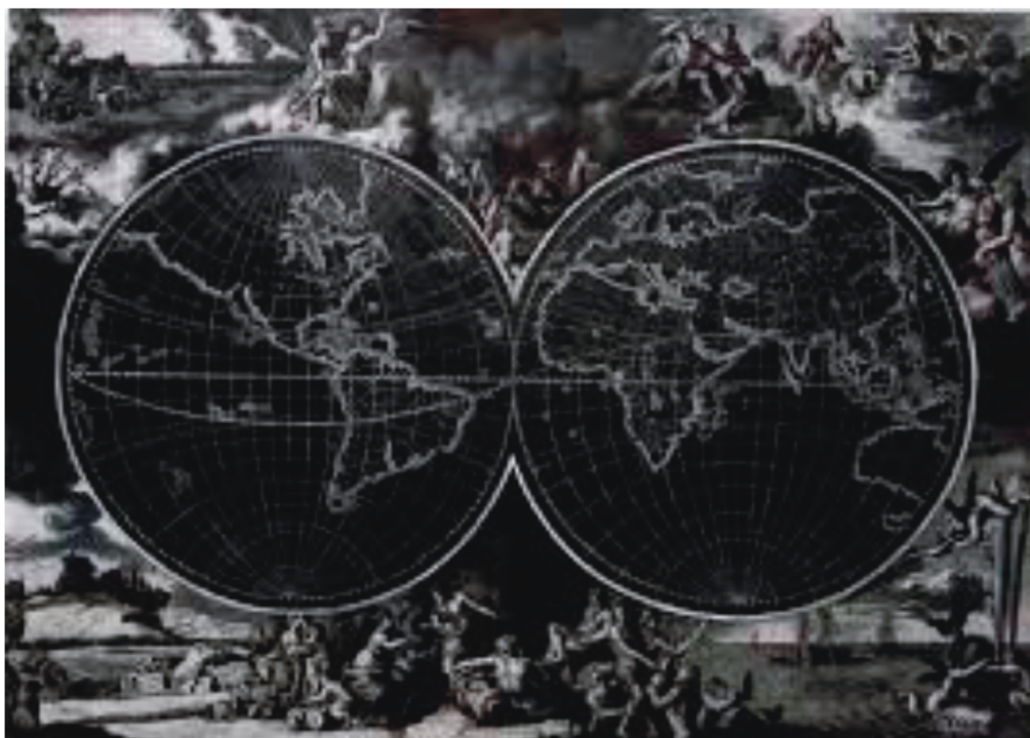
"21 Grams" (still) (2010) by Sun Xun.

" Sun Xun " is on view at the Museum of Contemporary Art Australia until October 14, 2018.