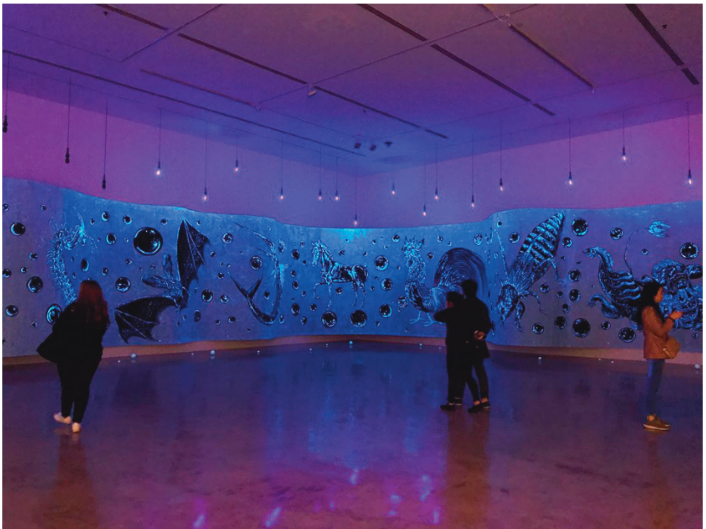
"Maniac Universe" (2018) by Sun Xun.

Commissioned by the MCA and the Edouard Malingue Gallery, Maniac Universe (2018) transforms the Level 1 North Gallery into a cosmic spectacle. Utilising UV-A light to 'paint' the walls a shade of midnight blue, Sun installs a large scroll-like work across the walls. Depicting various familiar animals in a linear procession along the bark paper, the work is reminiscent of the Chinese zodiac. However, upon closer inspection, the audience realises this is not the world they know, but instead a darker alternative universe that emerges with creatures including bat or sea creatures replace the traditional Chinese zodiac animals. Almost as though Sun is alluding to the genesis of the universe, the curatorial decision to place this work here also appears to hint at the beginning of a journey into a fantastical place of new discovery and insight.