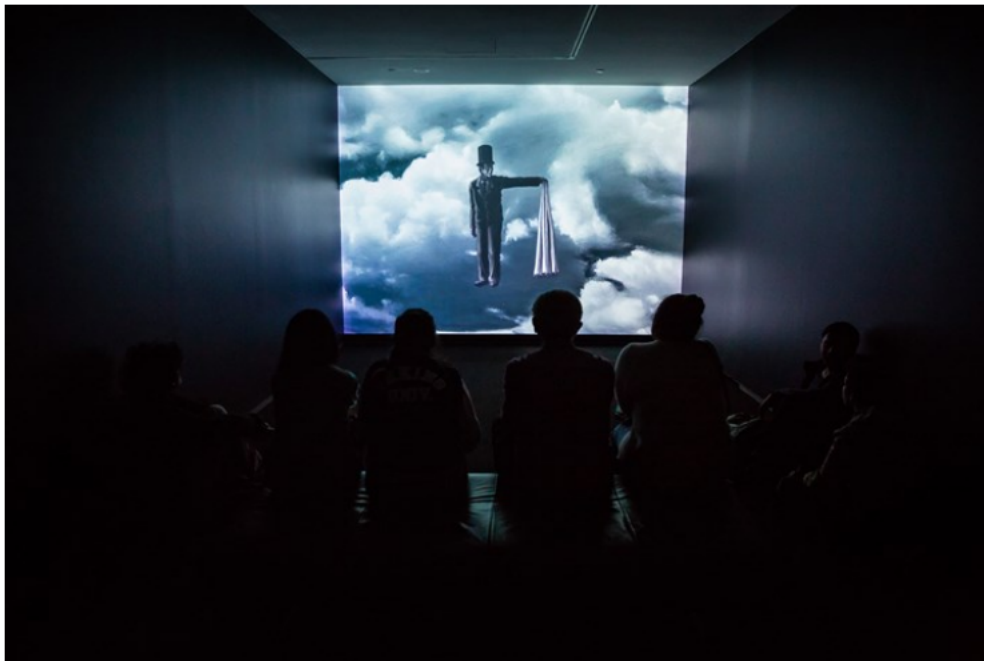
Sun Xun, 21 Grams (2010) (Still). Single-channel animation video, sound. Exhibition view: Sun Xun , Museum of Contemporary Art Australia, Sydney (9 July–14 October 2018). Courtesy the artist and Museum of Contemporary Art Australia. © Sun Xun. Photo: Jacquie Manning.

You grew up in Fuxin, a town in the province of Liaoning in northeast China, which was well-known for coal mining.