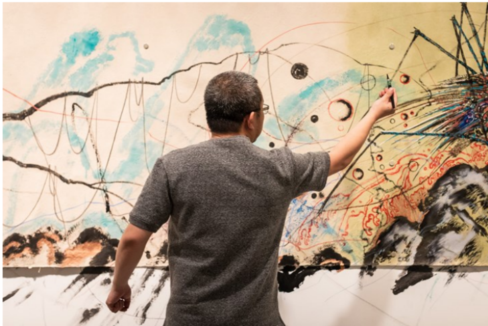
Sun Xun, Untitled (MCA Residency Painting) (2018). Mixed media. Exhibition view: Sun Xun , Museum of Contemporary Art Australia, Sydney (9 July–14 October 2018). Courtesy the artist and Museum of Contemporary Art Australia. © Sun Xun. Photo: Jacquie Manning.

When things get too busy at the studio, do you have somewhere that you retreat to?