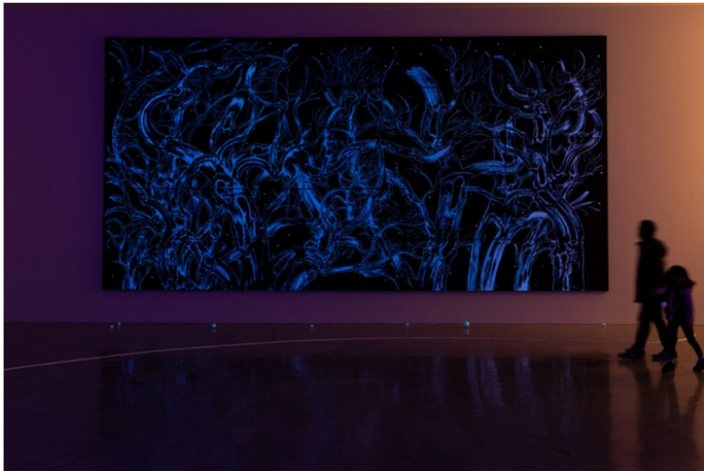
Sun Xun, Who First Saw the Stars (2018). Woodcut painting. Exhibition view: Sun Xun , Museum of Contemporary Art Australia, Sydney (9 July–14 October 2018). Commissioned by the Museum of Contemporary Art Australia and Edouard Malingue Gallery. Courtesy the artist and Museum of Contemporary Art Australia. © Sun Xun. Photo: Jacquie Manning.

I have mixed new and old work, making traditional-style screens just for the show, and I will also show some older animation films—I really had no time to make a long animation film for this exhibition. But the old work for Australia is also new work in a way, because I've never shown such long animation films in Australia before. I made a new collection of my animations, connecting different ideas together, and some of these will be displayed in a loop on level one of MCA. I am showing Who First Saw the Stars? (2018), which consists of 25 woodcut paintings made with glow-in-the-dark pigment that together create a single botanical image, lit by ultraviolet light in the gallery.