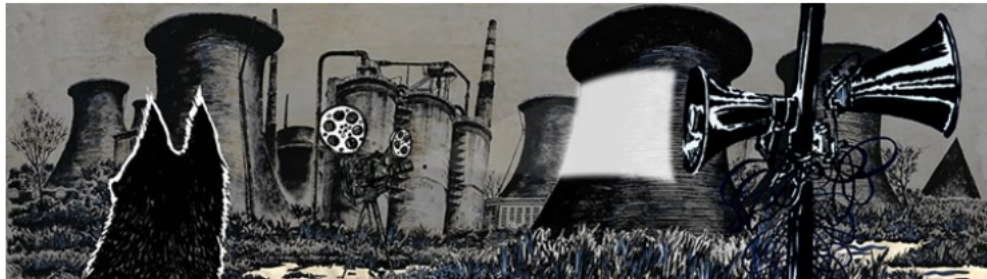
Sun Xun, Mythological Time (2016). (Still) Courtesy the artist and Edouard Malingue Gallery, Hong Kong. © Sun Xun.

Conceptually, Sun Xun is interested in the multiplicities present at any given time, and resists singular narratives or linear story-telling structures. The New China (2008) is a video and site-specific installation that was exhibited at the Hammer Museum in 2008; it uses allegory to question ideas around nationhood through a variety of different motifs, including the top-hatted man who appears in other works by the artist, and mosquitos that the artist uses as representation of parasitic carriers of information and control. These different characters are presented in a larger installation that could be described as a mise-en-scène of the film itself; offering up excerpts and motifs from the film; and spilling these out to a larger installation format. As the artist notes, 'Most people look at history like a performance on a stage. They don't look behind the curtains to see what is really happening'. 1 Thus, he restages history as a surreal play, where symbols and their associations perform like puppets in a theatre.