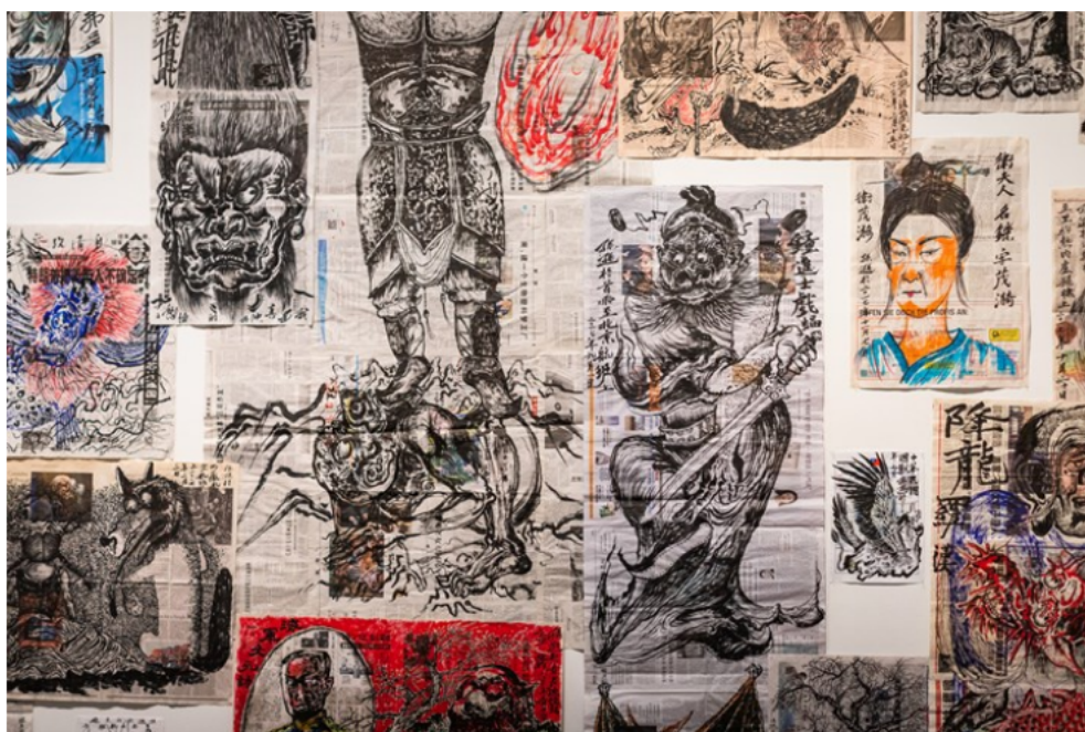
Sun Xun, Newspaper Paintings (2015–2018). Ink and colour on newspaper. Exhibition view: Sun Xun , Museum of Contemporary Art Australia, Sydney (9 July–14 October 2018). Courtesy the artist and Museum of Contemporary Art Australia. © Sun Xun. Photo: Jacquie Manning.

I think if viewers manage to enter a new world, or obtain a new vision of the world, then I think I will have succeeded.