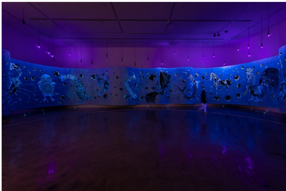
Sun Xun, Maniac Universe (2018). Mixed media on bark paper, UV-A light. Exhibition view: Sun Xun , Museum of Contemporary Art Australia, Sydney (9 July–14 October 2018). Commissioned by the Museum of Contemporary Art Australia and Edouard Malingue Gallery. Courtesy the artist and Museum of Contemporary Art Australia. © Sun Xun. Photo: Jacquie Manning.

This exhibition will imagine a parallel world. I was inspired in a way by Australia—being a big island country, that feels separate to the rest of the world. I wish to draw from this analogy when thinking about a parallel universe. So, for this solo exhibition I'm making totally new work; I want to make the most of the huge space at MCA. It's work that makes me very excited because I don't know what the end result will be.