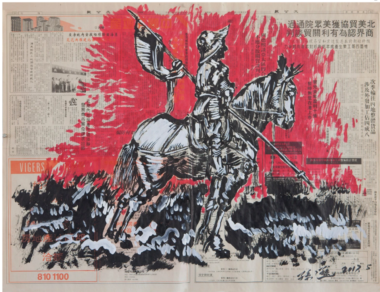
SUN XUN, HETERODOXY III, 2017, IMAGE COURTESY THE ARTIST AND EDOUARD MALINGUE GALLERY, HONG KONG