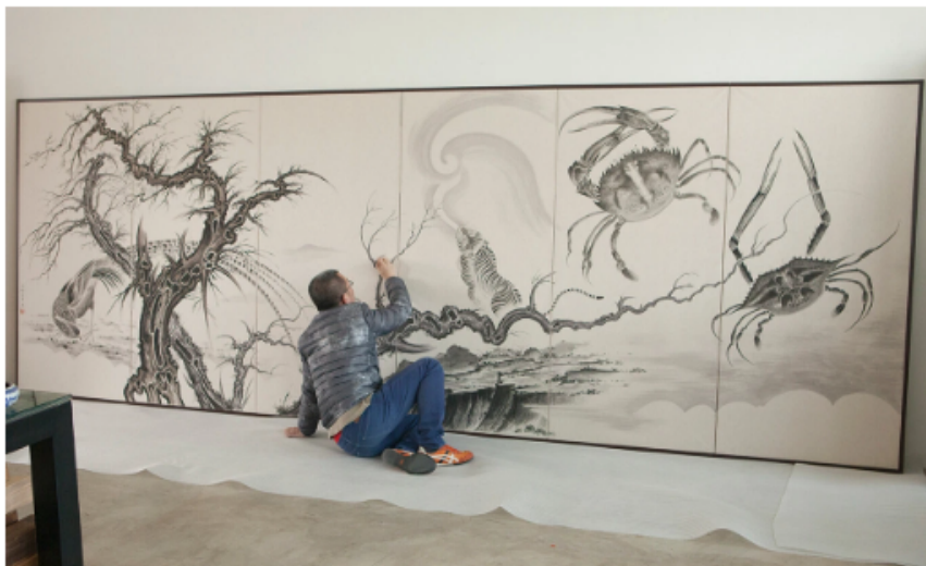
Sun Xun, Invisible Magic , 2018, commissioned by the Museum of Contemporary Art Australia and Edouard Malingue Gallery Image courtesy and © the artist/Photograph: Deng Jing