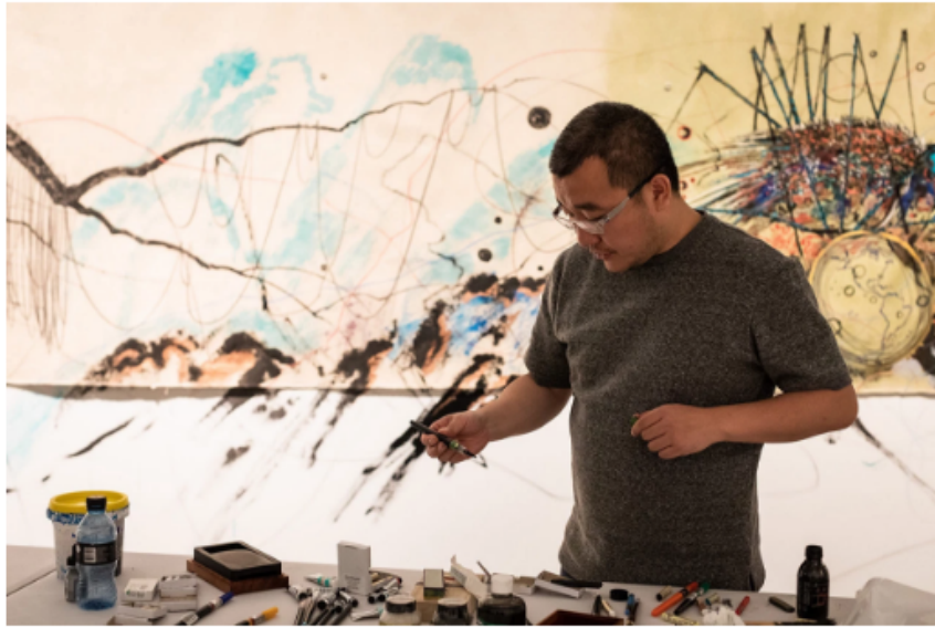
Sun Xun, Untitled (MCA Residency Painting), 2018 installation view, Museum of Contemporary Art Australia, Sydney, 2018, mixed media Image courtesy the artist and Museum of Contemporary Art Australia, Sydney © the artist/Photograph: Jacquie Manning

Sun has visited Australia several times before, for preliminary site visits and for the exhibition of his work at White Rabbit , but never has he done something like this. Included amongst the many staggering works in his namesake show are a number of the artist's signature woodcut animation works from the past 10 years, very little in which adheres to strict narrative structures or employs much dialogue, but all of which are incredibly labour intensive. Included amongst those is 21 Grams , which screened at the Venice Film Festival and accorded Sun, who has often been lauded as one of China's most dynamic contemporary artists, the honour of being the first Chinese artist to screen at the festival. Then there is Time Spy , a 10-minute, non-linear 3D stop-animation that ruminates on time, cosmology and the personal experience through a surrealist lens. Time Spy employs a cast of hybridised characters and landscapes that conflate the human with the animal, the organic with the artificial, and the terrestrial with the cosmic. To create the frames of his animation, Sun Xun used a process that pushed his practice to its limits and which required that he first illustrate each frame as a drawing. He then applied an ink wash that effectively rendered these drawings as painted works. Those images were then turned into nearly 10,000 hand-cut woodblock prints carved into relief with the assistance of over 100 assistants before those prints were filmed at a rate of 18 frames per second.