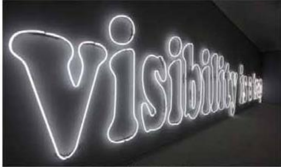
Laurent Grasso, Visibility is a Trap (2012) Neon Transformer, Metal Structure 7.8 (L) x 1 (W) x 3.77 (H) cm

A couple weeks back, Art Basel's first exhibition show in Hong Kong took the art world by storm. Showcasing the impressive variety between galleries and artists from all over the world, it was an understatement to say that Art Basel was a success. However those that were of exquisite innovative conceptual design were selected in this year's Encounters display chosen by art expert and curator Yuko Hasegawa.