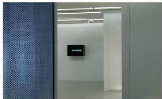
Past Grasso pieces in Edouard Malingue Gallery