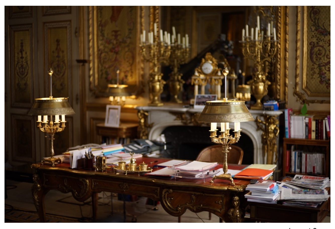
Laurent Grasso 'Élysée', 2016 35mm film, 15 min