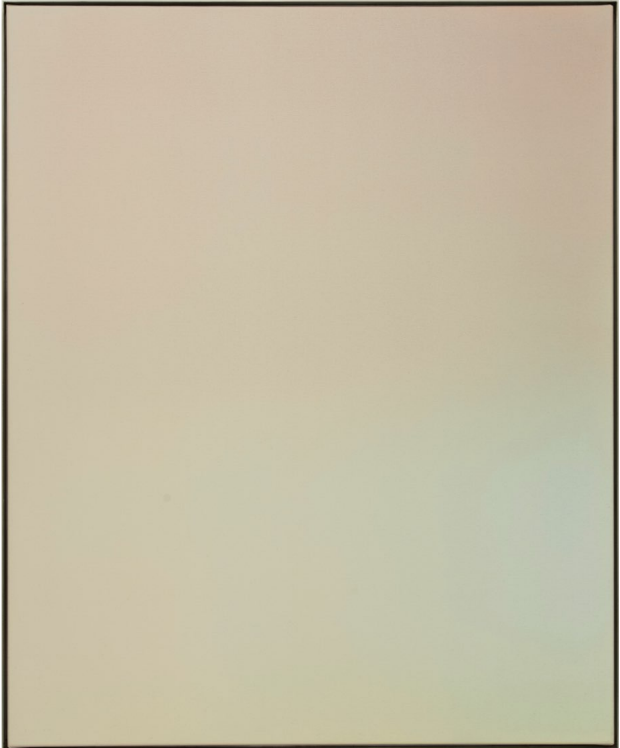
Chou Yu-Cheng, 'Chemical Gilding, Keep Calm, Galvanise, Pray, Gradient, Ashes, Manifestation, Unequal, Dissatisfaction, Capitalise, Incense Burner, Survival, Agitation, Hit, Day Light. II', 2015 Acrylic on canvas, 78 x 3.5 x 94 cm