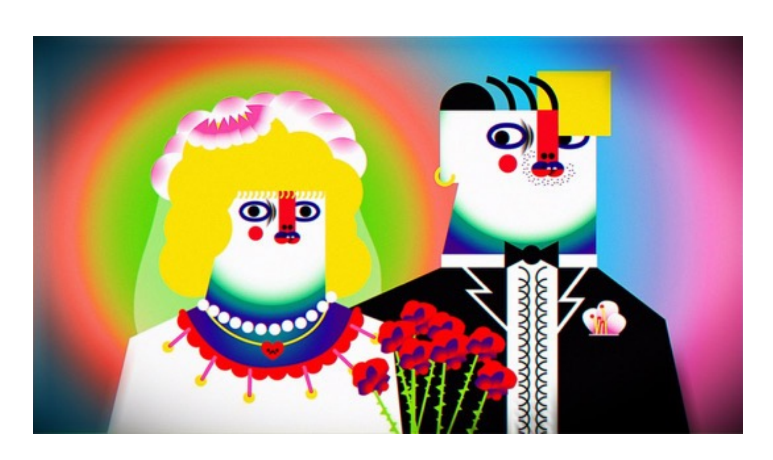
Still from Wong Ping, 'Jungle of desire', 2015 Single channel video animation, 6 min 50 sec