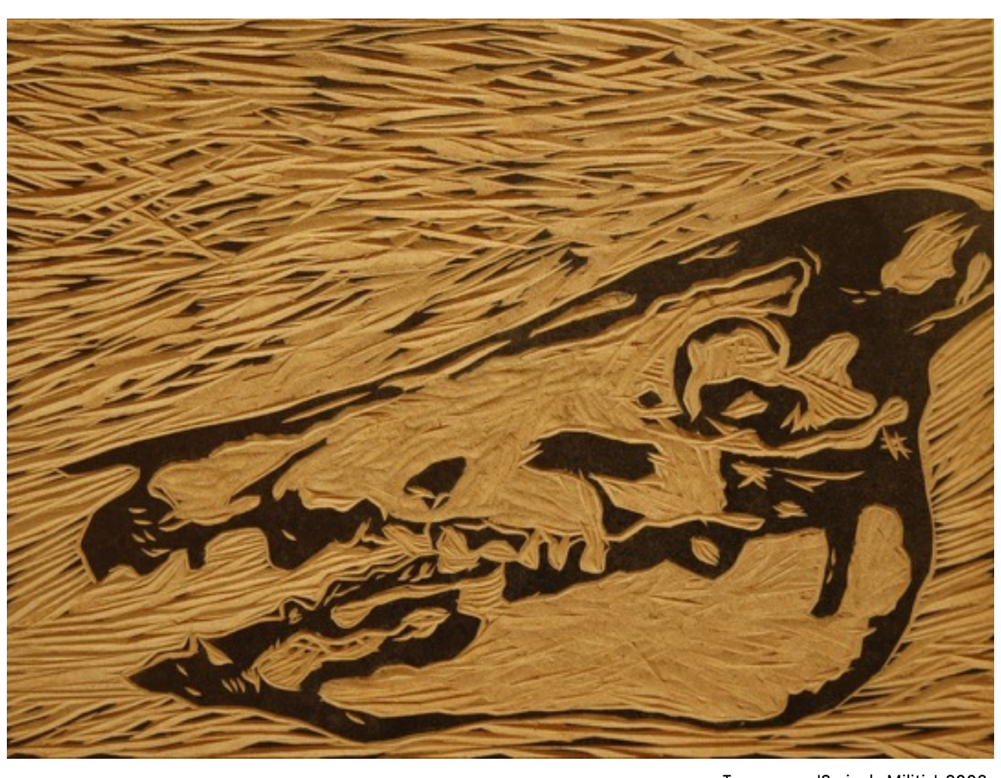
Tromarama, 'Serigala Militia', 2006 Stop motion animation with woodcut plywood boards 4 min 22 sec