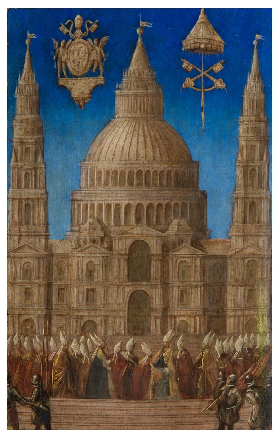
Laurent Grasso, 'Studies into the past' Oil on wood panel 26.4 x 17 cm