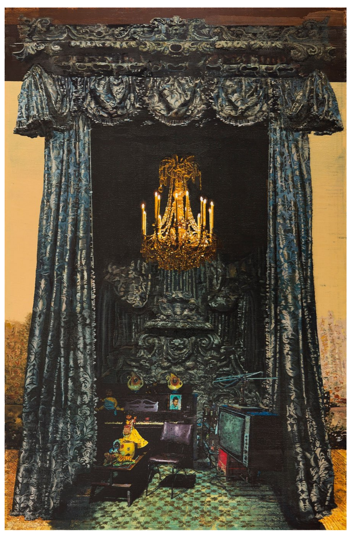
Yuan Yuan, 'Osmel's Toys', 2016 Oil on linen 290 x 190 cm