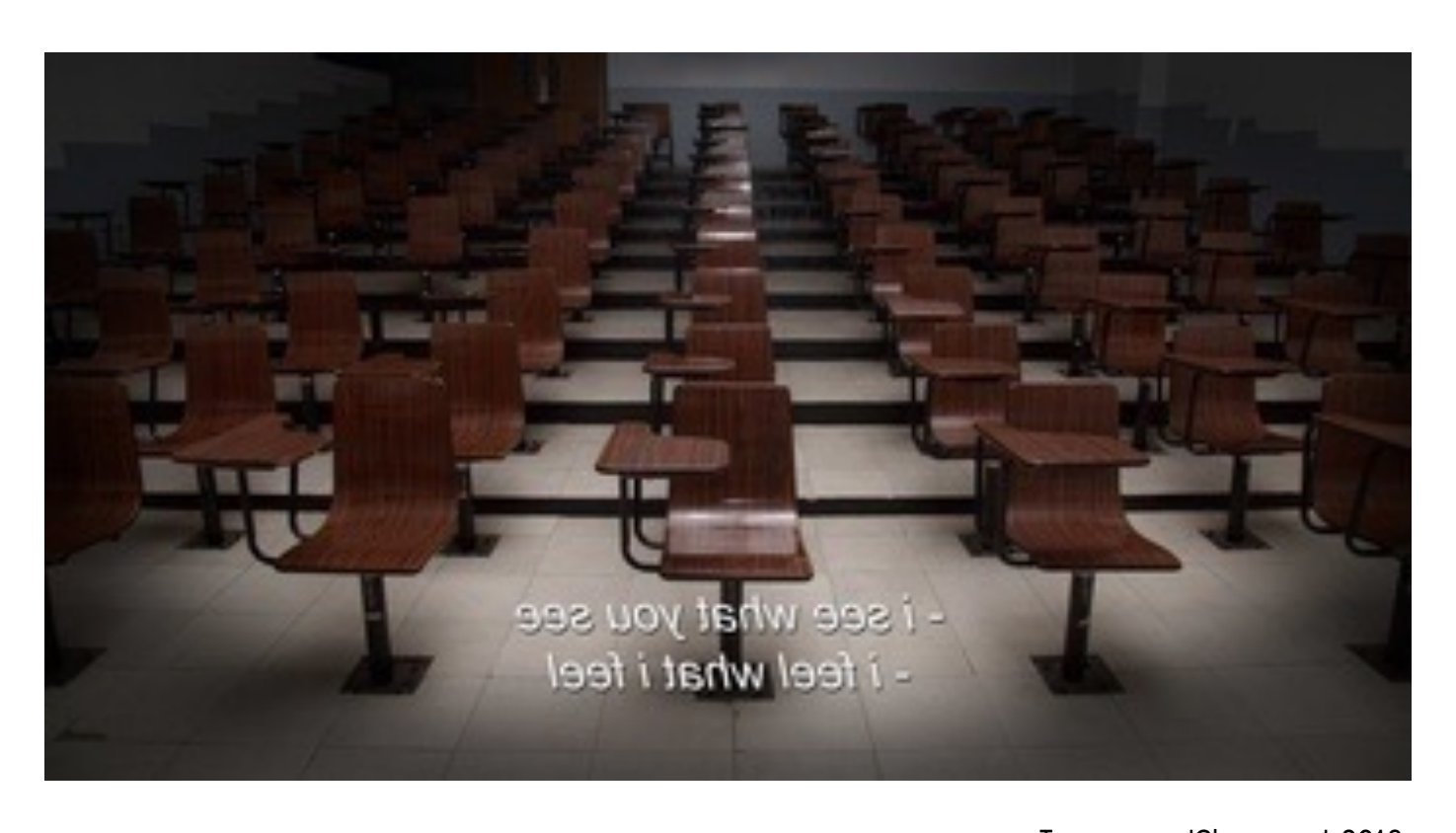
Tromarama, 'Classroom', 2016 Lenticular print 80 x 150 cm