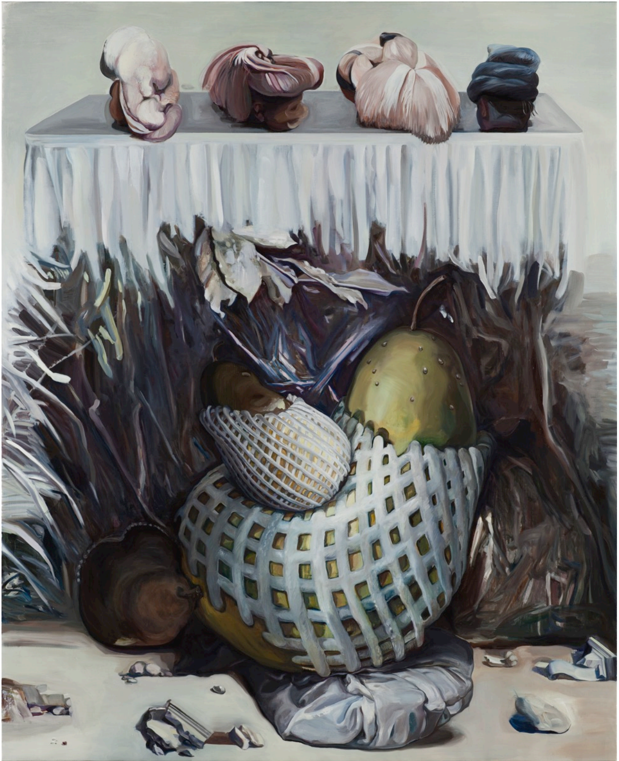
Wang Zhibo 'Swaddling', 2016