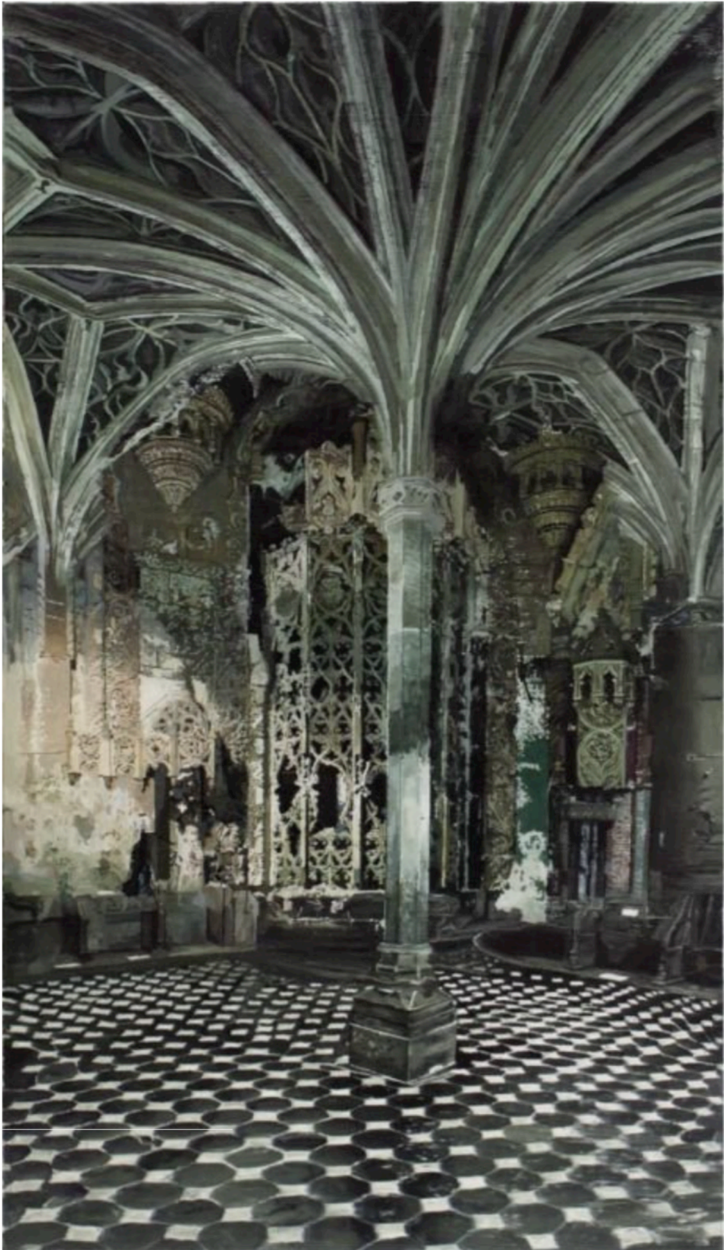
Yuan Yuan 'Confessionary', 2011