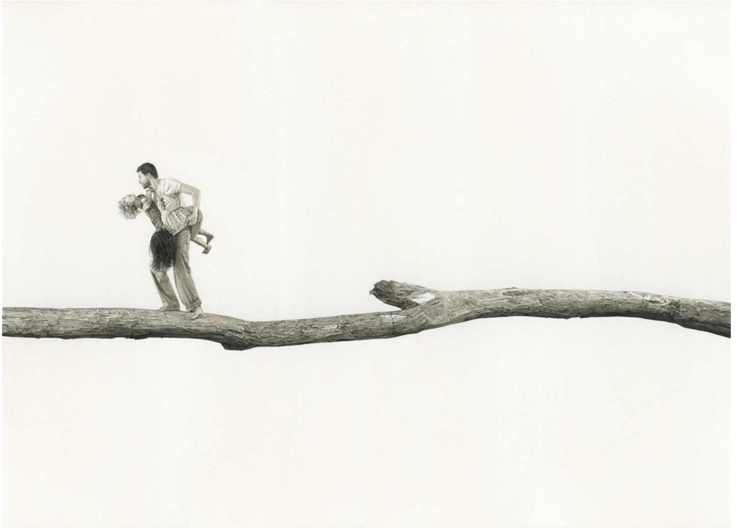
Fabien Mérelle 'Traverser l'existence sans leur montrer qu'on a sans cesse peur pour eux', 2016