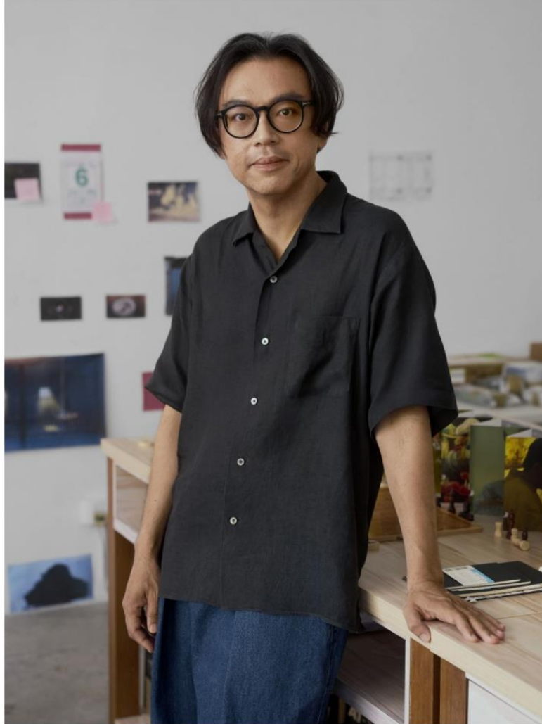
ABOVE Ho Tzu Nyen

Ho's deeply introspective practice encompasses animation, performance, and installation, and is often concerned with the ever-changing identity of the Southeast Asian region. He represented Singapore at the 54th edition of the Venice Biennale , and has held solo exhibitions at iconic institutions such as the Guggenheim Museum in Spain and the Mori Art Museum in Tokyo.