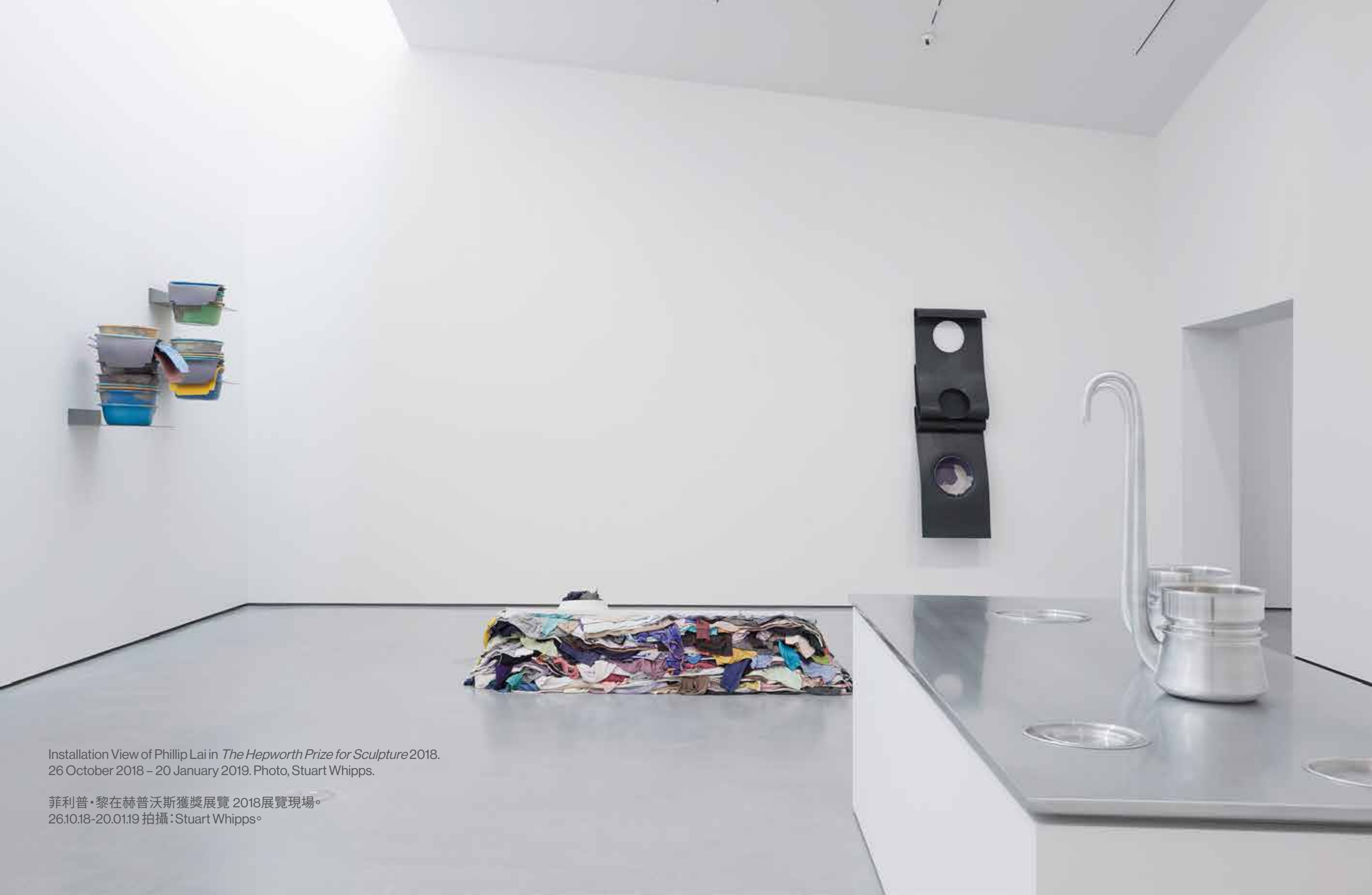
Installation View of Phillip Lai in The Hepworth Prize for Sculpture 2018. 26 October 2018 – 20 January 2019.

菲利普·黎在赫普沃斯獲獎展覽 2018展覽現場。 26.10.18-20.01.19