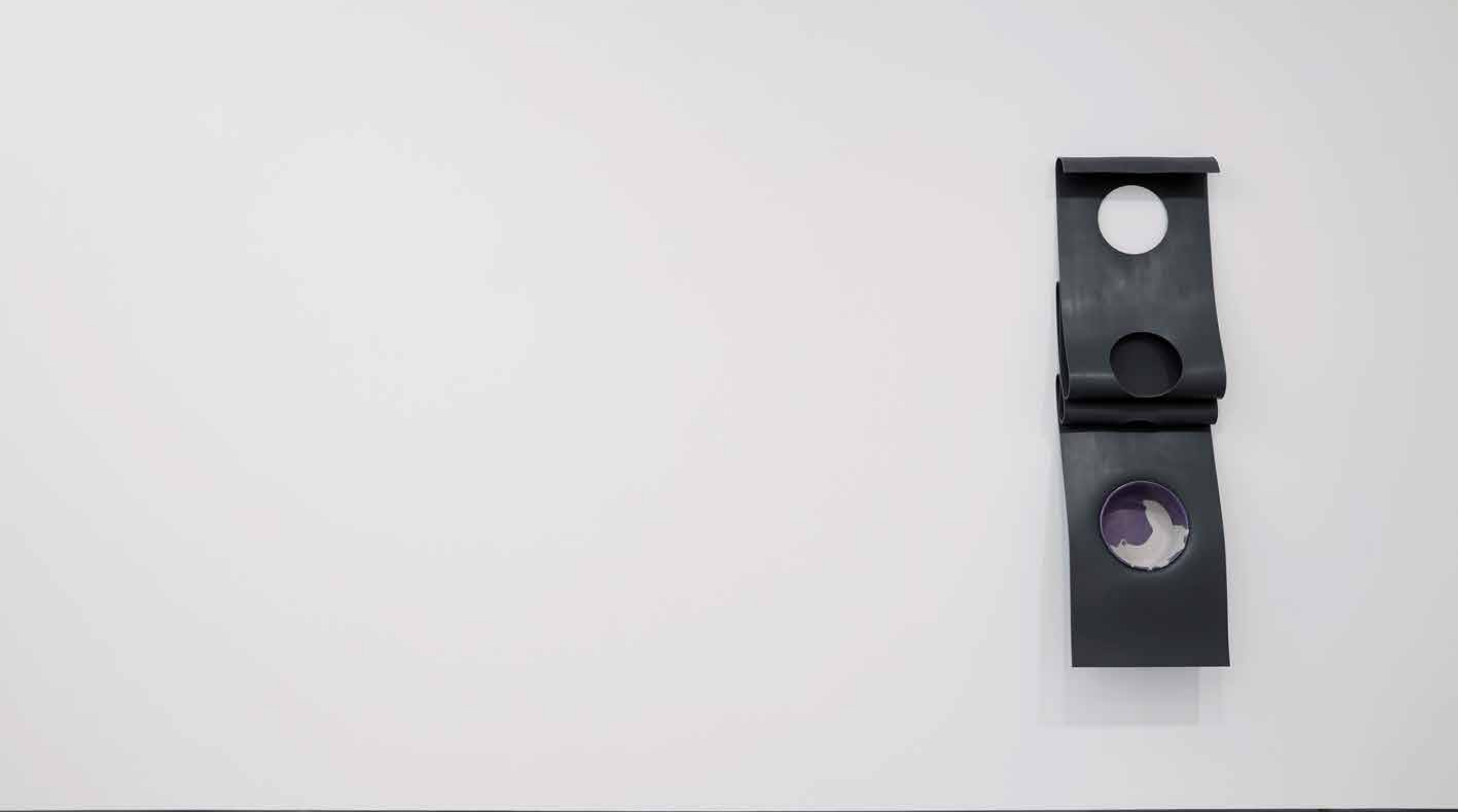
Installation View of Phillip Lai in The Hepworth Prize for Sculpture 2018. 26 October 2018 – 20 January 2019.

菲利普·黎在赫普沃斯獲獎展覽 2018展覽現場。 26.10.18-20.01.19