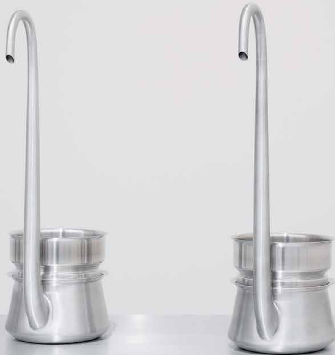
Installation View of Phillip Lai in The Hepworth Prize for Sculpture 2018. 26 October 2018 – 20 January 2019.

菲利普·黎在赫普沃斯獲獎展覽 2018展覽現場。 26.10.18-20.01.19