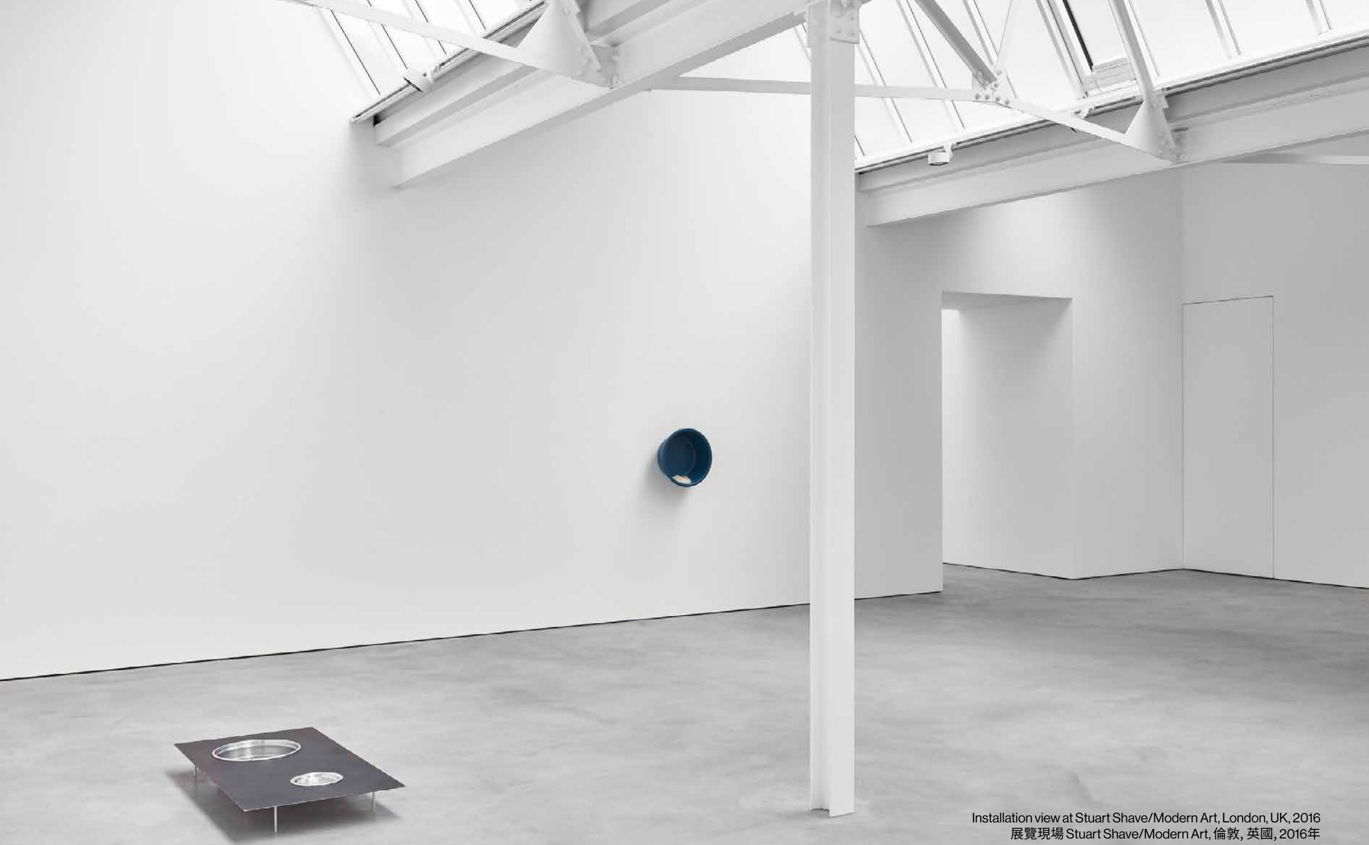
Installation view at Stuart Shave/Modern Art, London, UK, 2016 展覽現場 Stuart Shave/Modern Art, 倫敦, 英國, 2016年