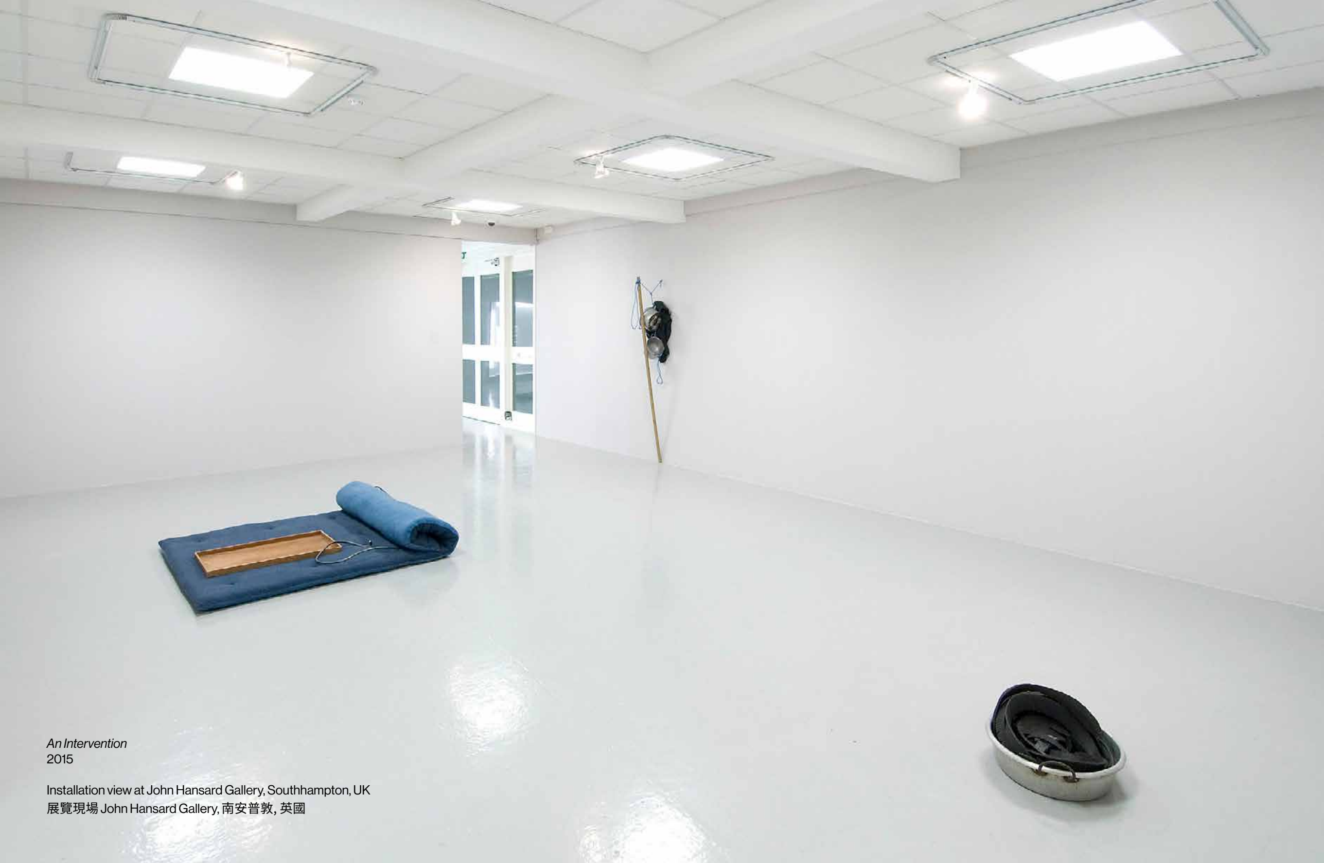
An Intervention 2015

Installation view at John Hansard Gallery, Southampton, UK 展覽現場 John Hansard Gallery, 南安普敦, 英國