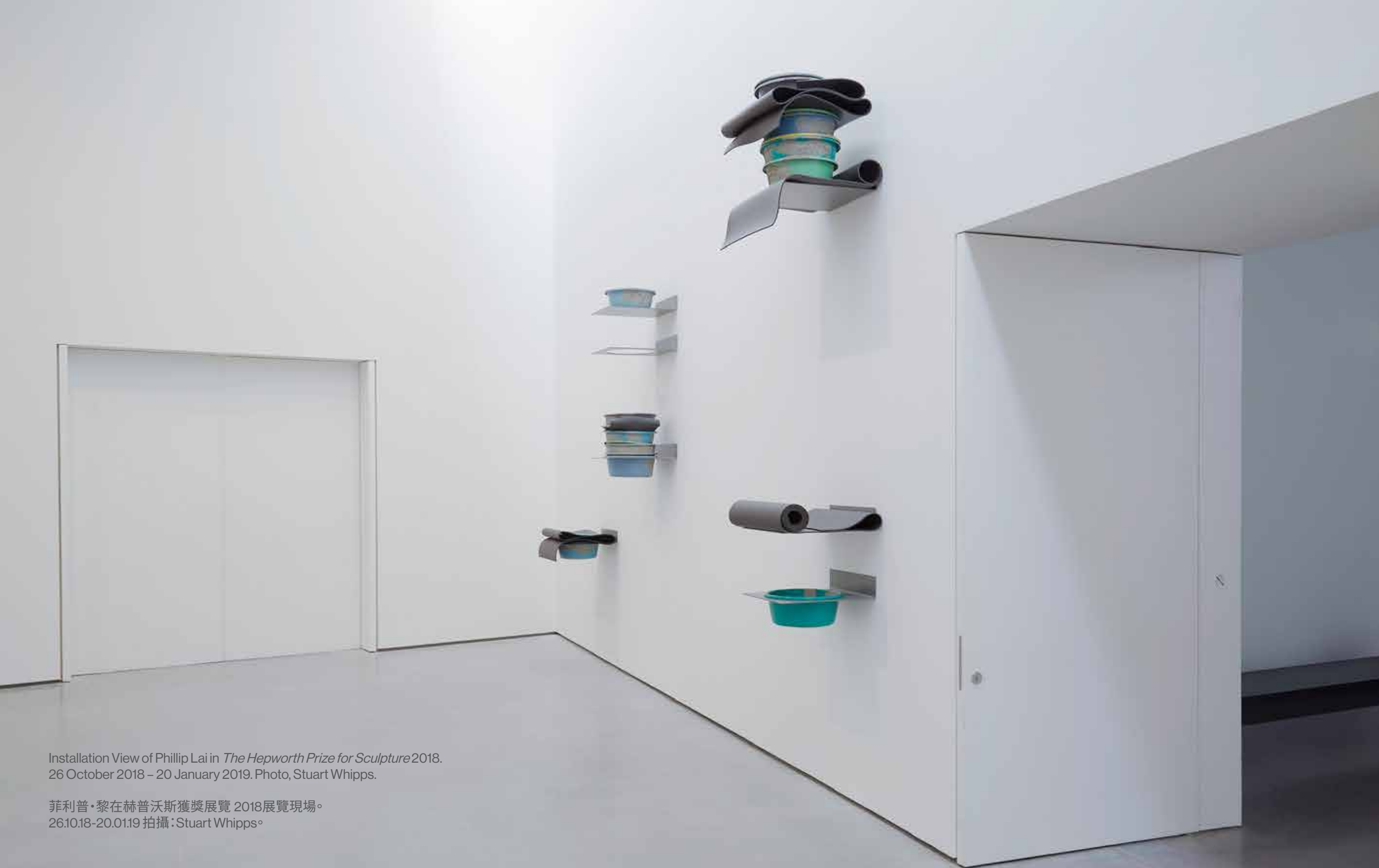
Installation View of Phillip Lai in The Hepworth Prize for Sculpture 2018. 26 October 2018 – 20 January 2019.

菲利普·黎在赫普沃斯獲獎展覽 2018展覽現場。 26.10.18-20.01.19