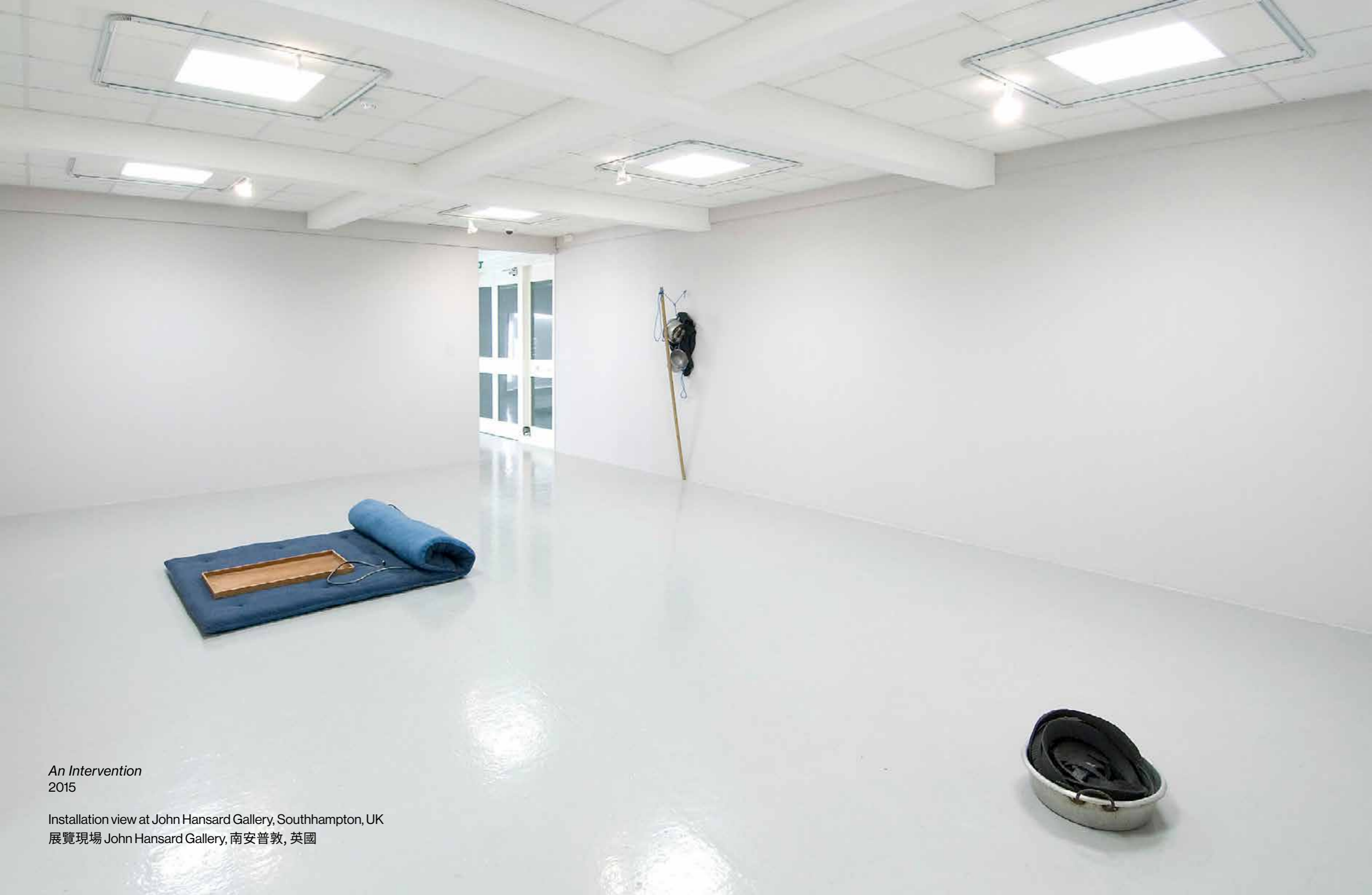
An Intervention 2015

Installation view at John Hansard Gallery, Southampton, UK 展覽現場 John Hansard Gallery, 南安普敦, 英國