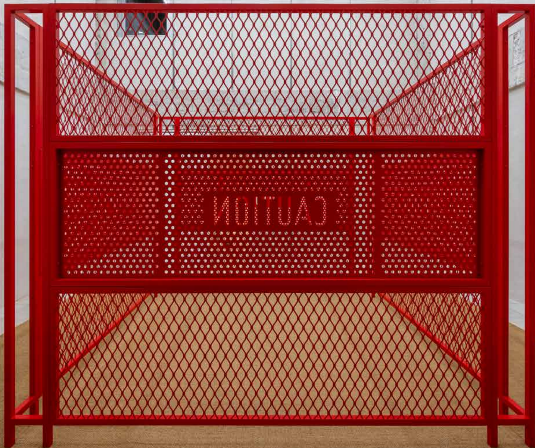
Four Cautions 《四個警醒》 2023

Powder-coated steel 粉末塗層鋼 201.3 x 241 x 241 cm