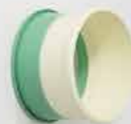
Untitled #1-4 2018