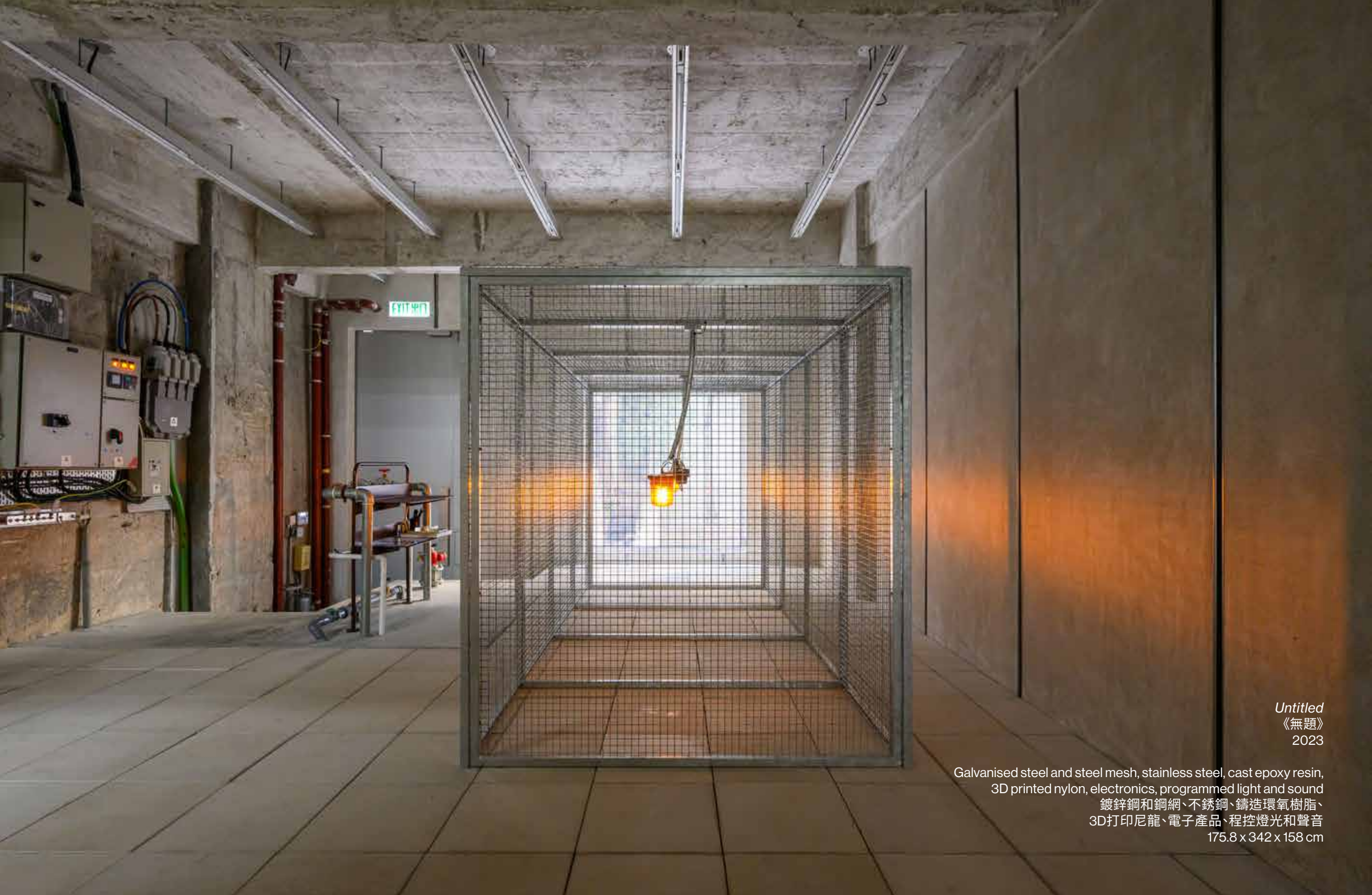
Untitled 《無題》 2023

Galvanised steel and steel mesh, stainless steel, cast epoxy resin, 3D printed nylon, electronics, programmed light and sound 鍍鋅鋼和鋼網、不銹鋼、鑄造環氧樹脂、 3D打印尼龍、電子產品、程控燈光和聲音 175.8 x 342 x 158 cm