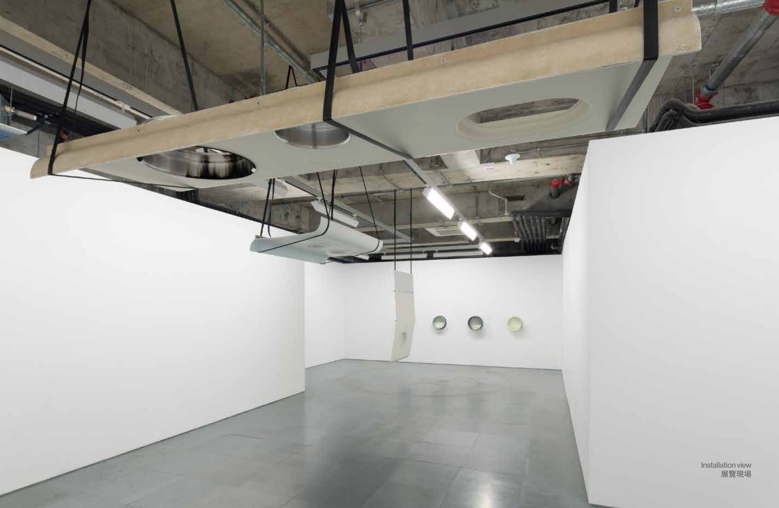
Installation view 展覽現場