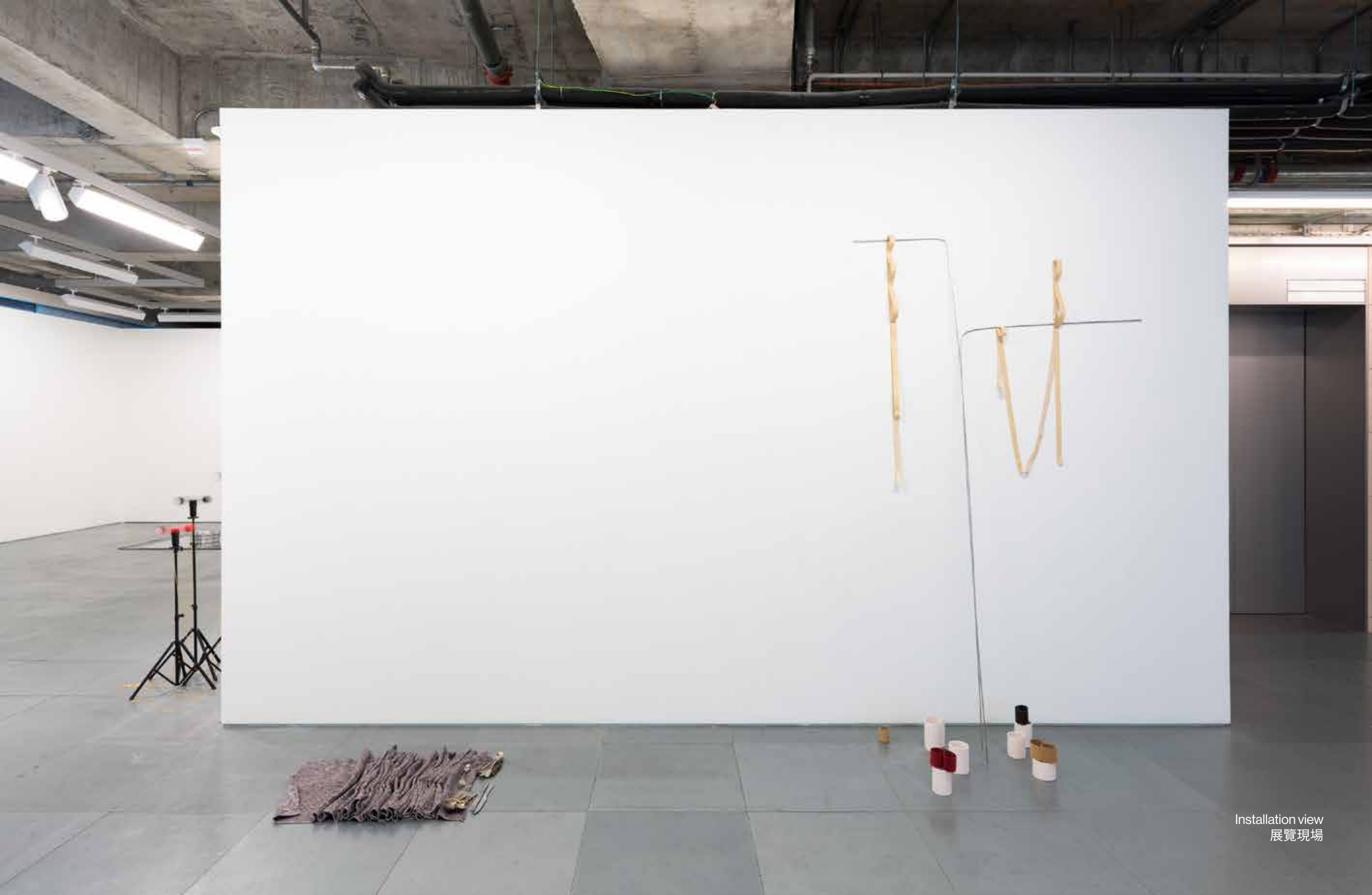
Installation view 展覽現場