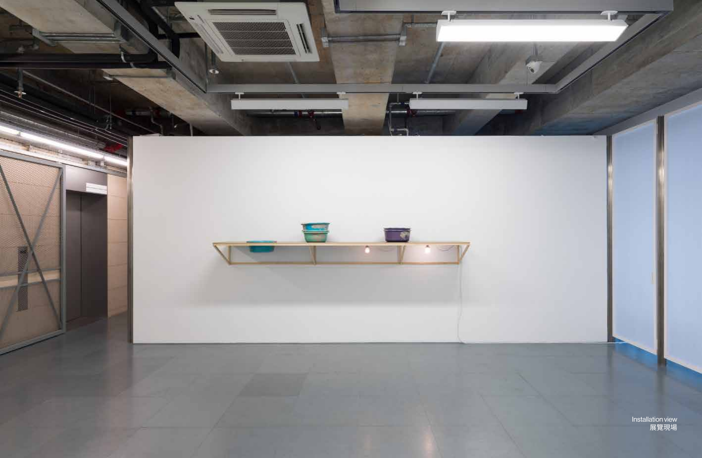
Installation view 展覽現場