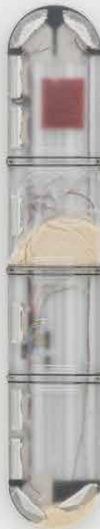
Untitled 《無題》 2023

Eergency vehicle light fitting chassis, cast epoxy resin, cast pewter, aluminium, steel brackets, miscellaneous wiring, polythene bag, rice 緊急車輛燈具底盤、鑄造環氧樹脂、鑄造錫鑼、鋁、鋼支架、雜線、聚乙烯袋、米 153 x 29 x 10.6 cm