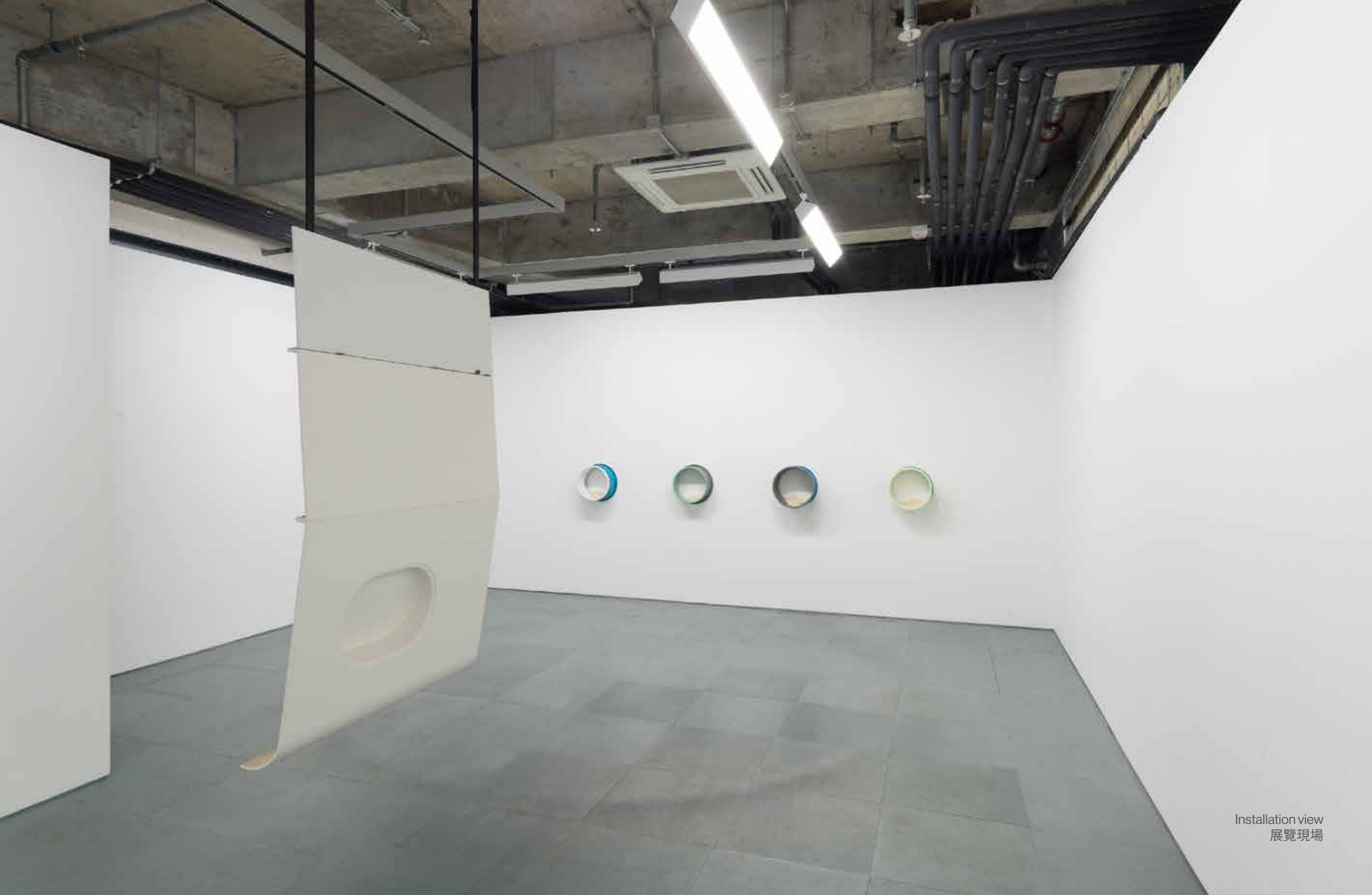
Installation view 展覽現場