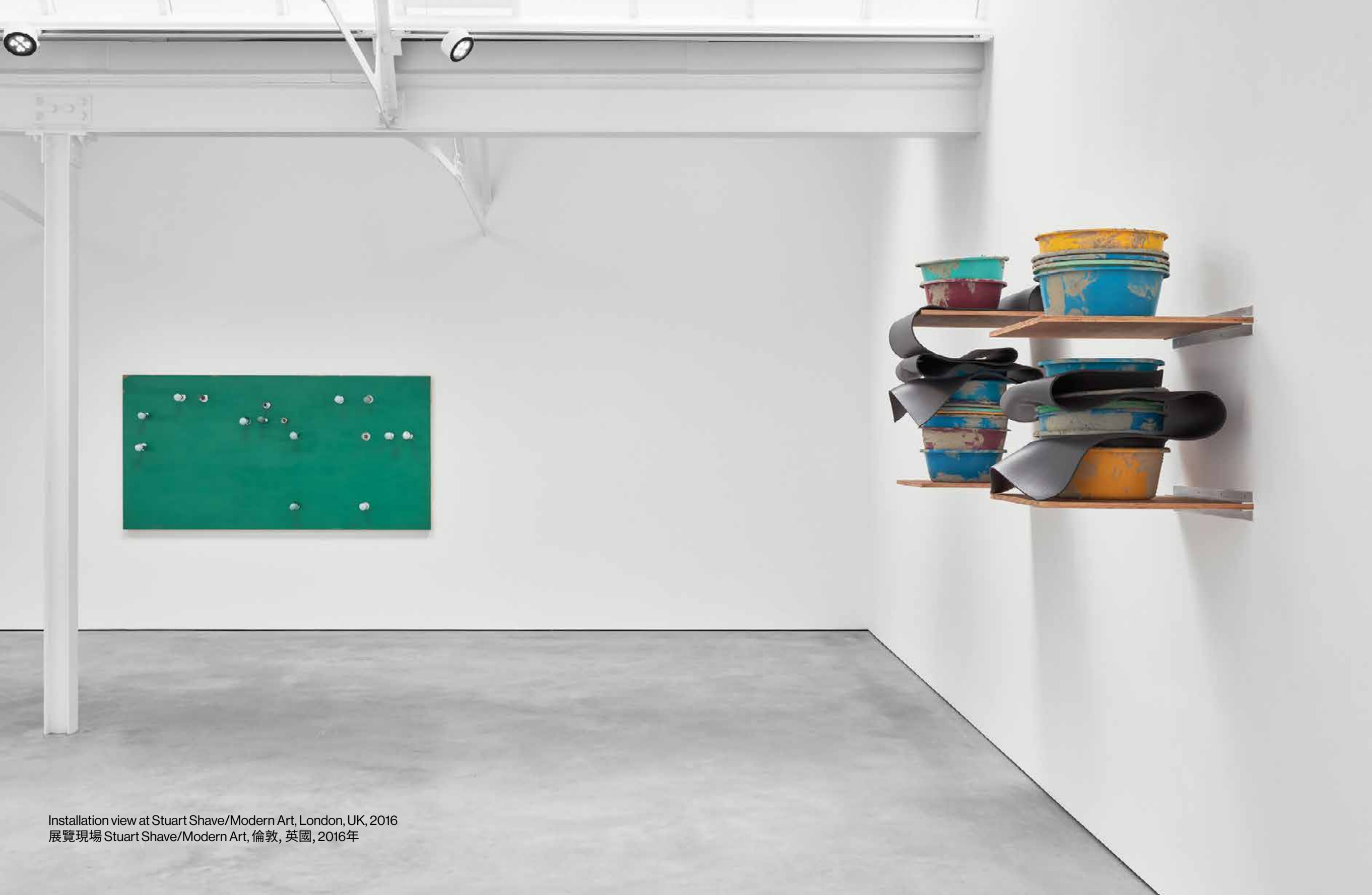
Installation view at Stuart Shave/Modern Art, London, UK, 2016 展覽現場 Stuart Shave/Modern Art, 倫敦, 英國, 2016年