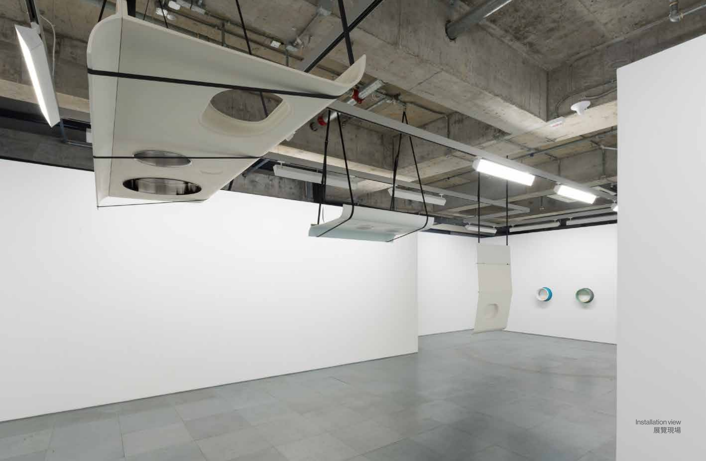
Installation view 展覽現場