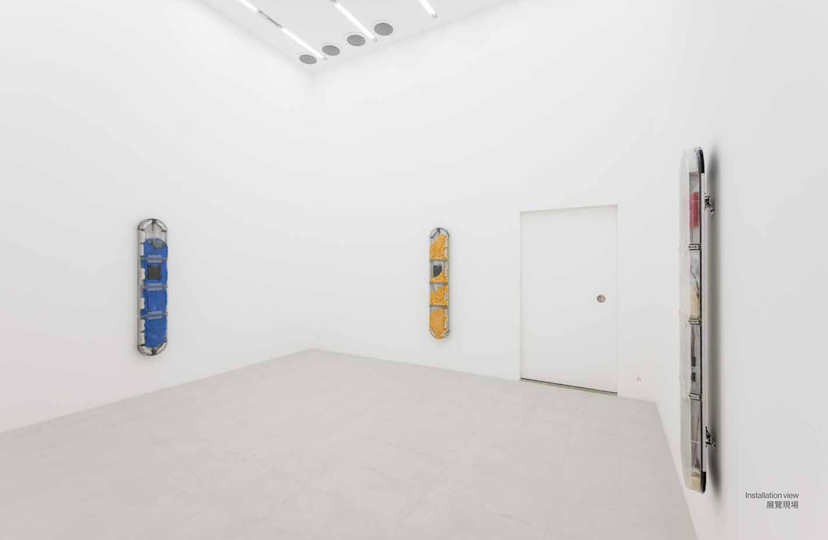
Installation view 展覽現場