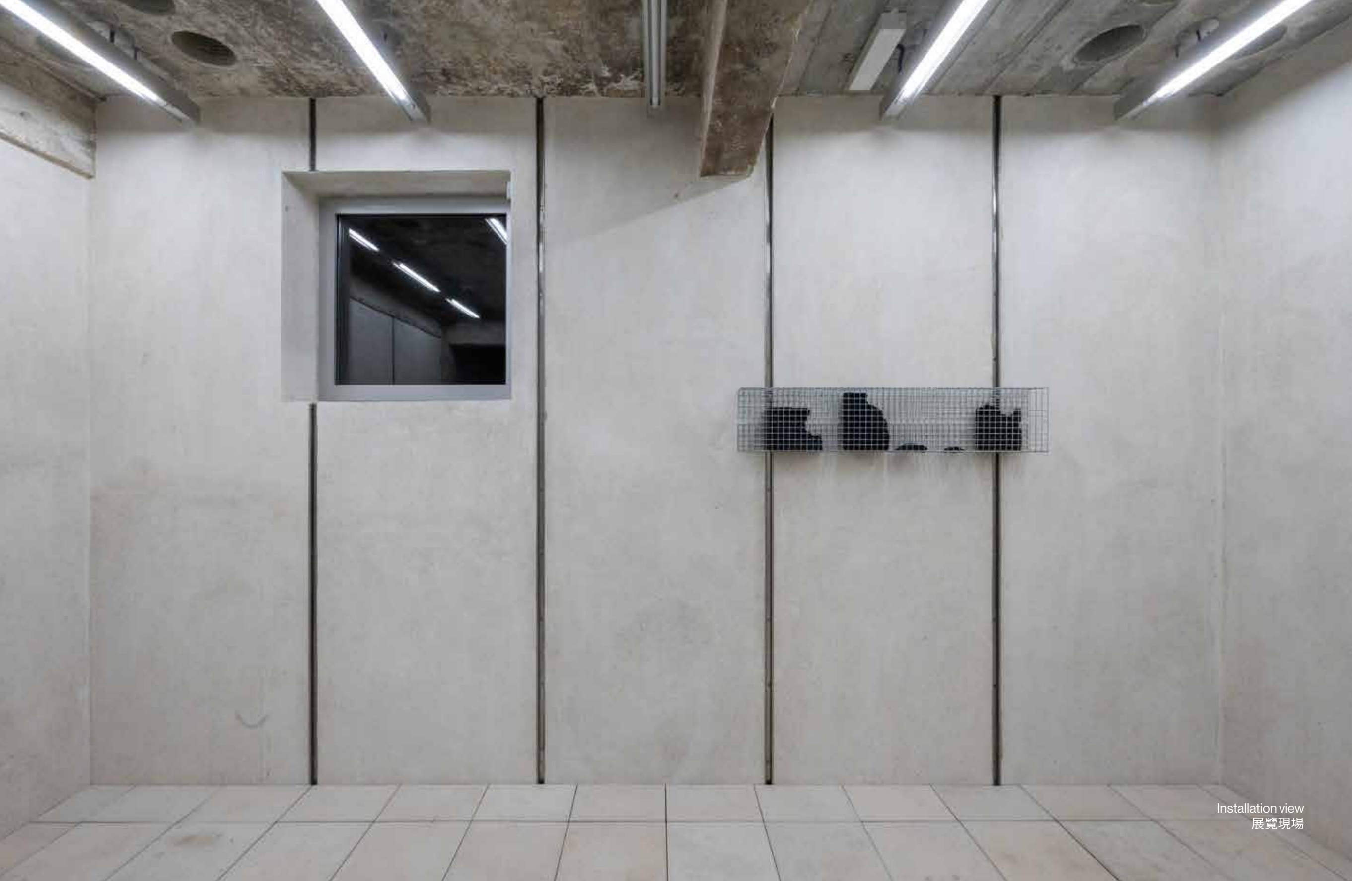
Installation view 展覽現場