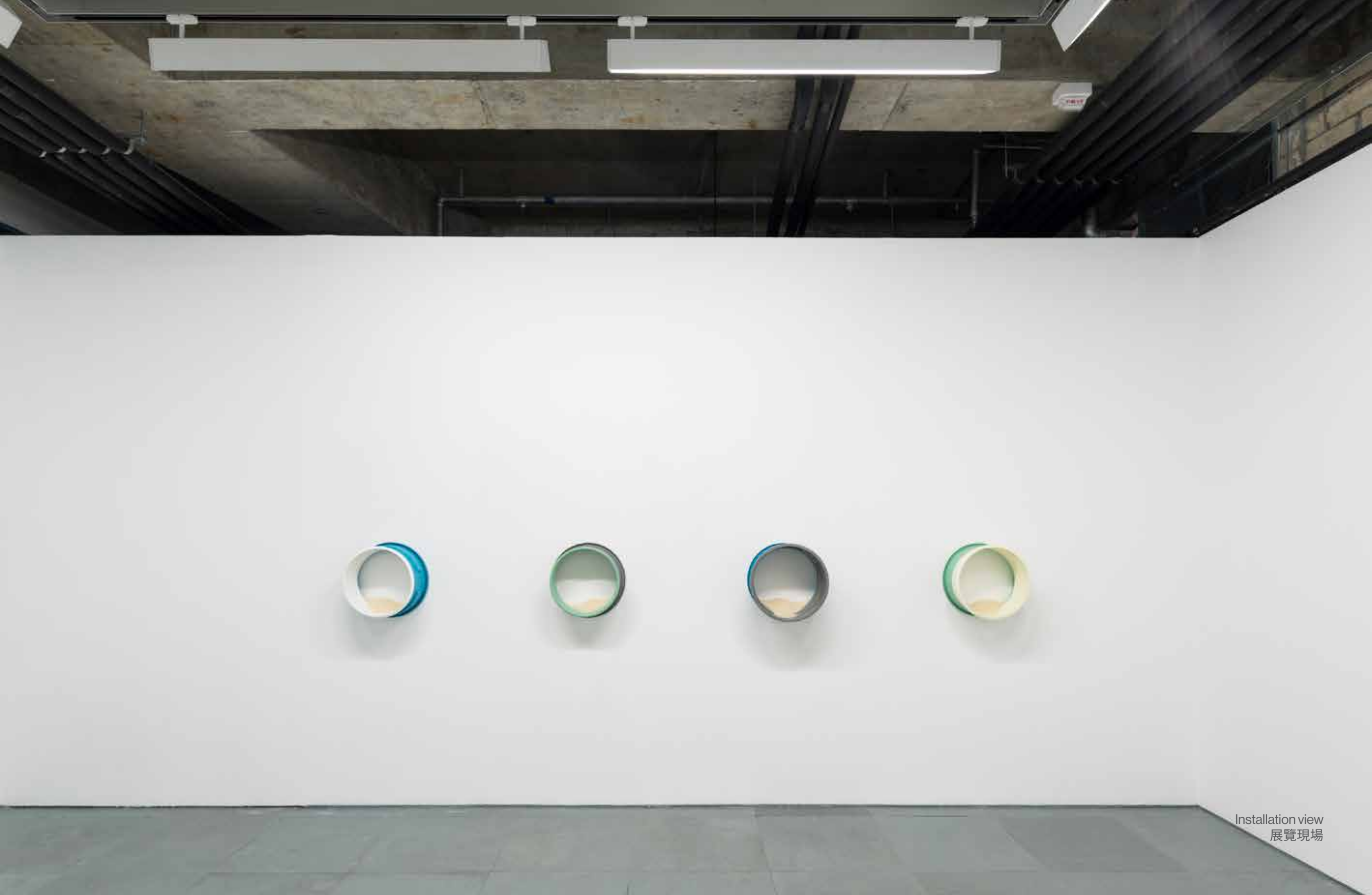
Installation view 展覽現場