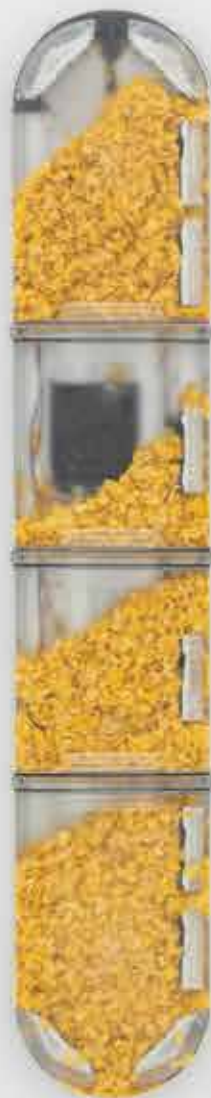
Untitled 《無題》 2023

Emergency vehicle light fitting chassis, cast epoxy resin, cast pewter, aluminium, steel brackets, miscellaneous wiring, cornflakes 緊急車輛燈具底盤、鑄造環氧樹脂、鑄造錫鑼、鋁、鋼支架、雜線、玉米片 153 x 29 x 10.6 cm