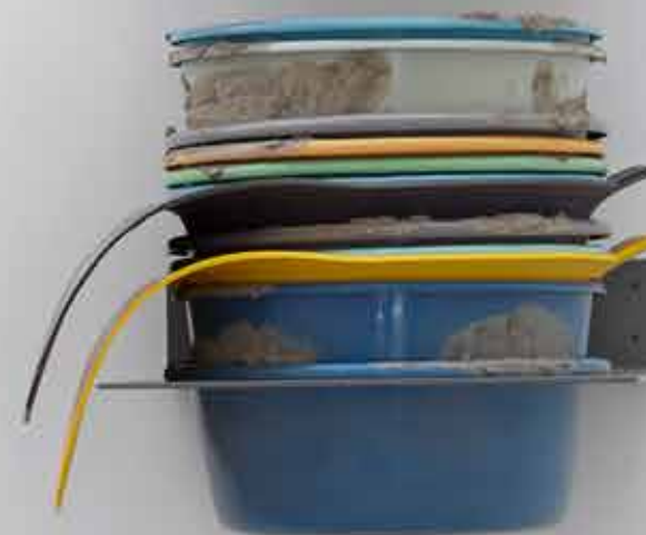
Installation View of Phillip Lai in The Hepworth Prize for Sculpture 2018. 26 October 2018 – 20 January 2019.

菲利普·黎在赫普沃斯獲獎展覽 2018展覽現場。 26.10.18-20.01.19