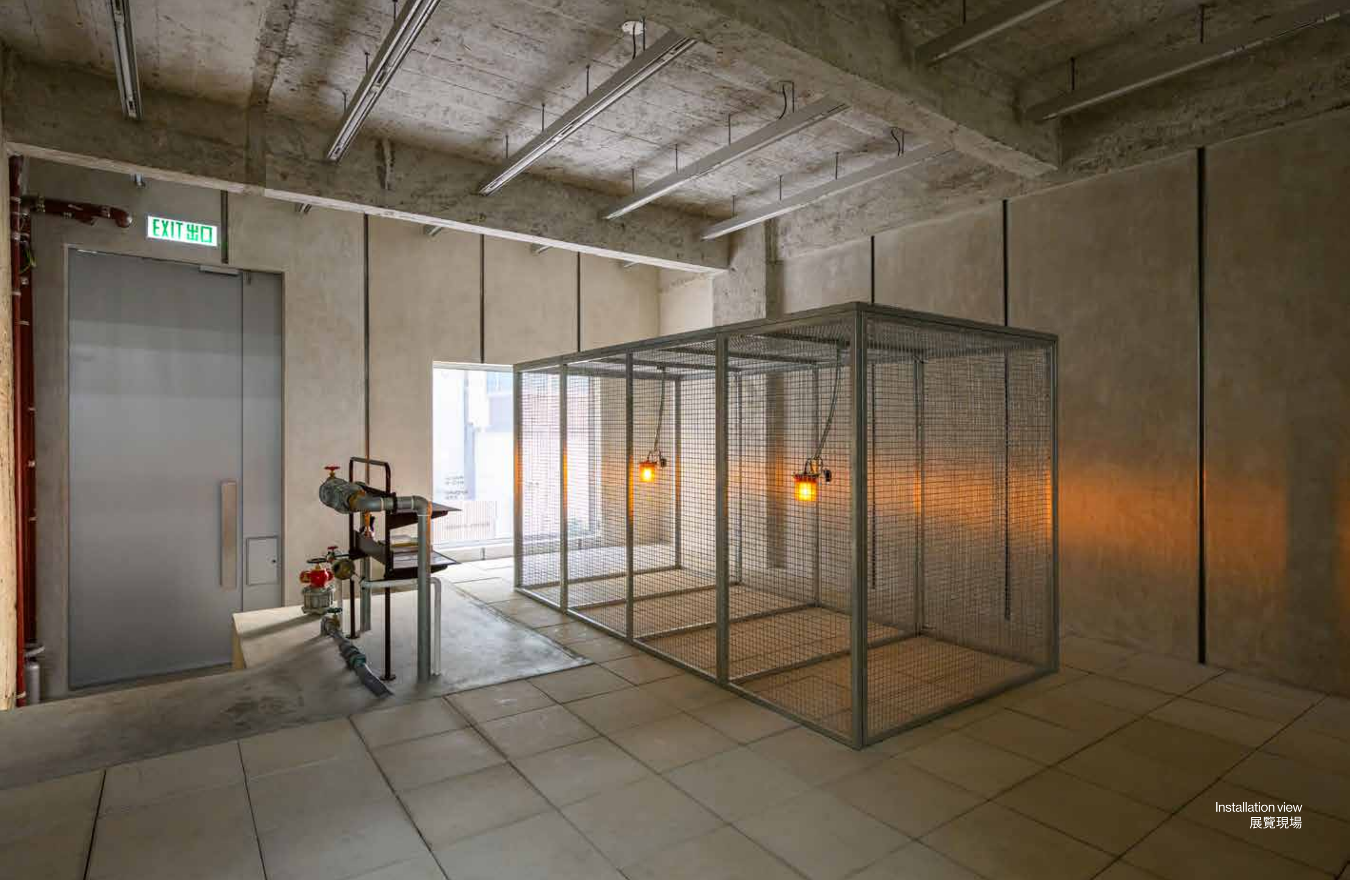
Installation view 展覽現場