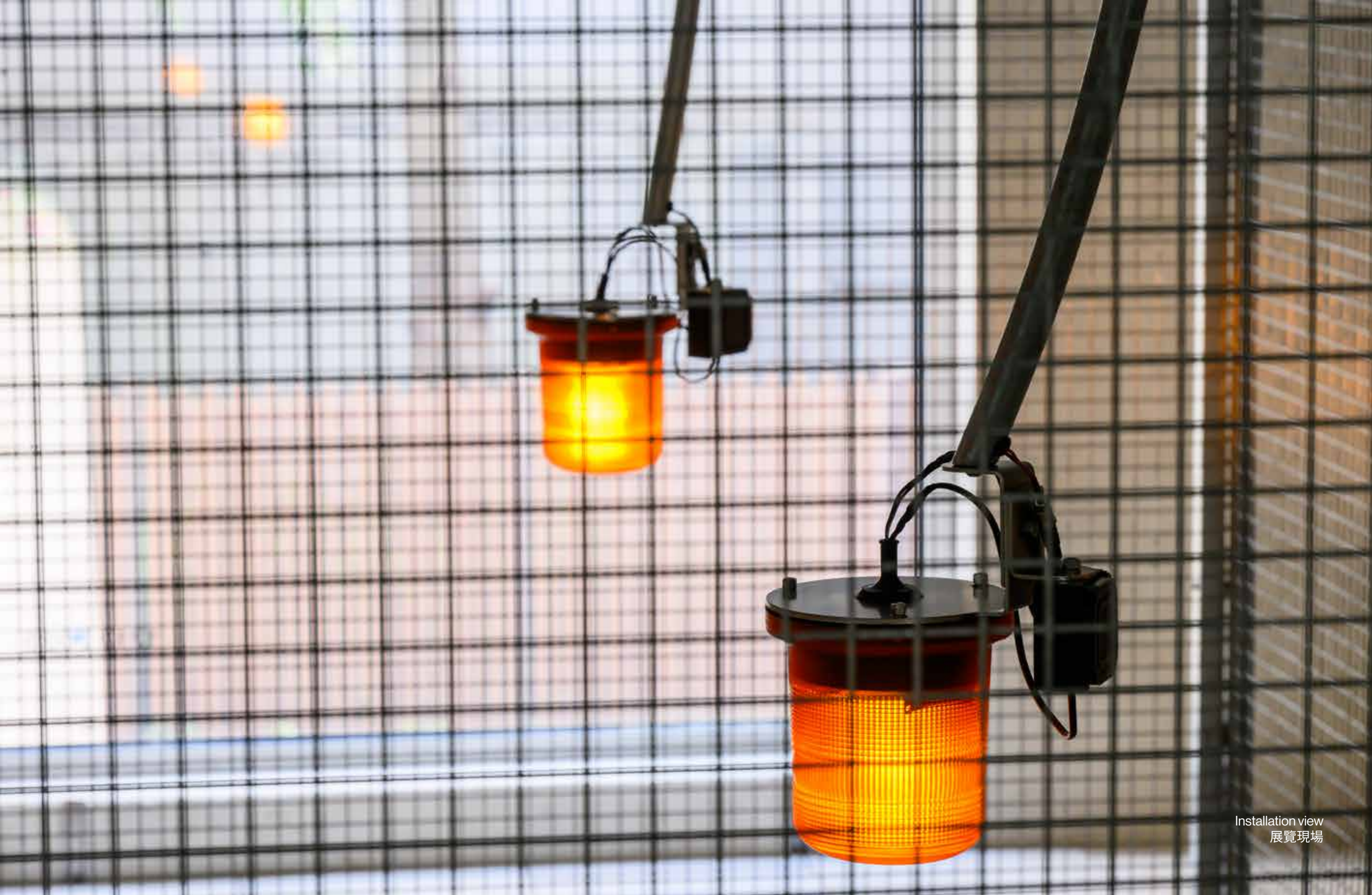
Installation view 展覽現場