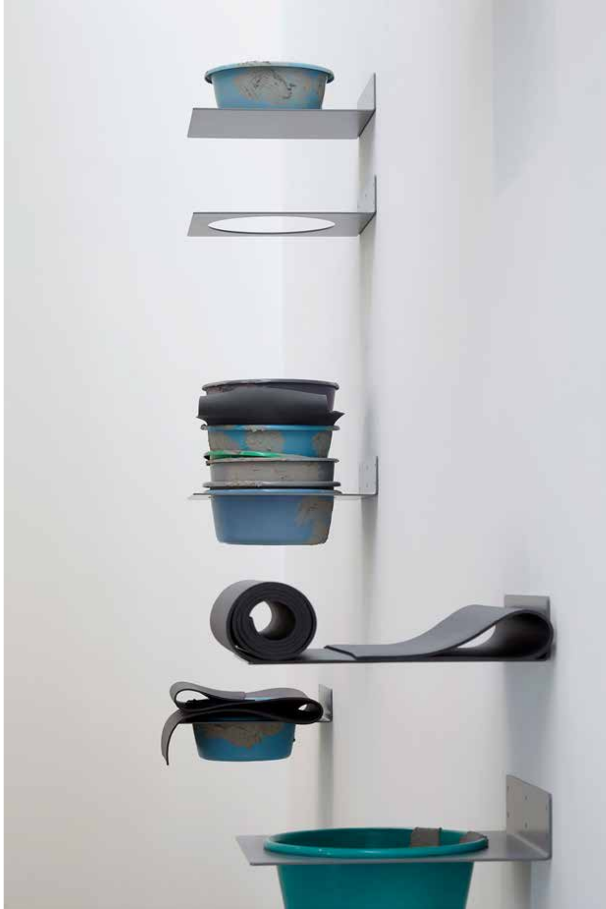
Installation View of Phillip Lai in The Hepworth Prize for Sculpture 2018. 26 October 2018 – 20 January 2019.

菲利普·黎在赫普沃斯獲獎展覽 2018展覽現場。 26.10.18-20.01.19