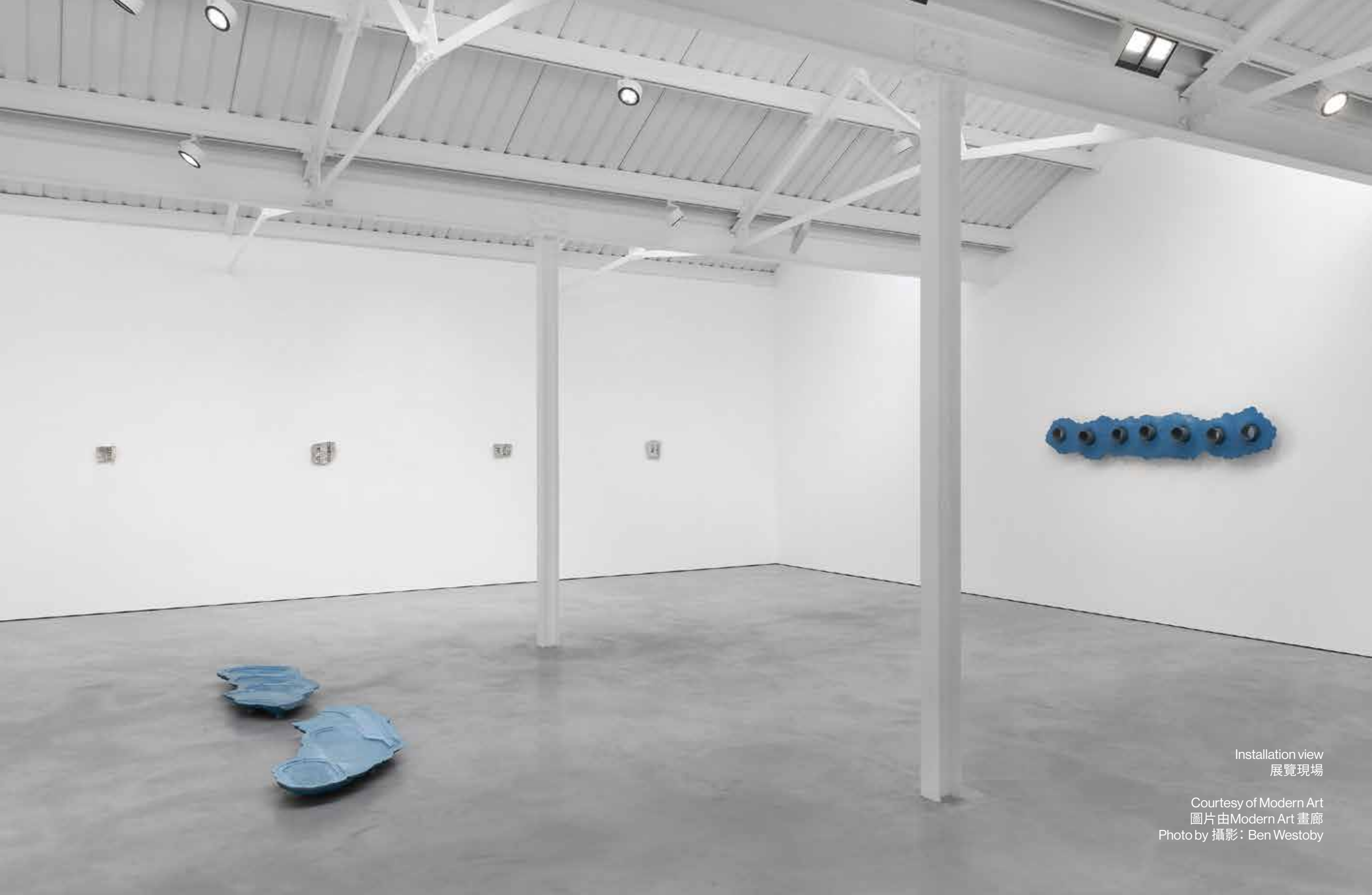
Installation view 展覽現場