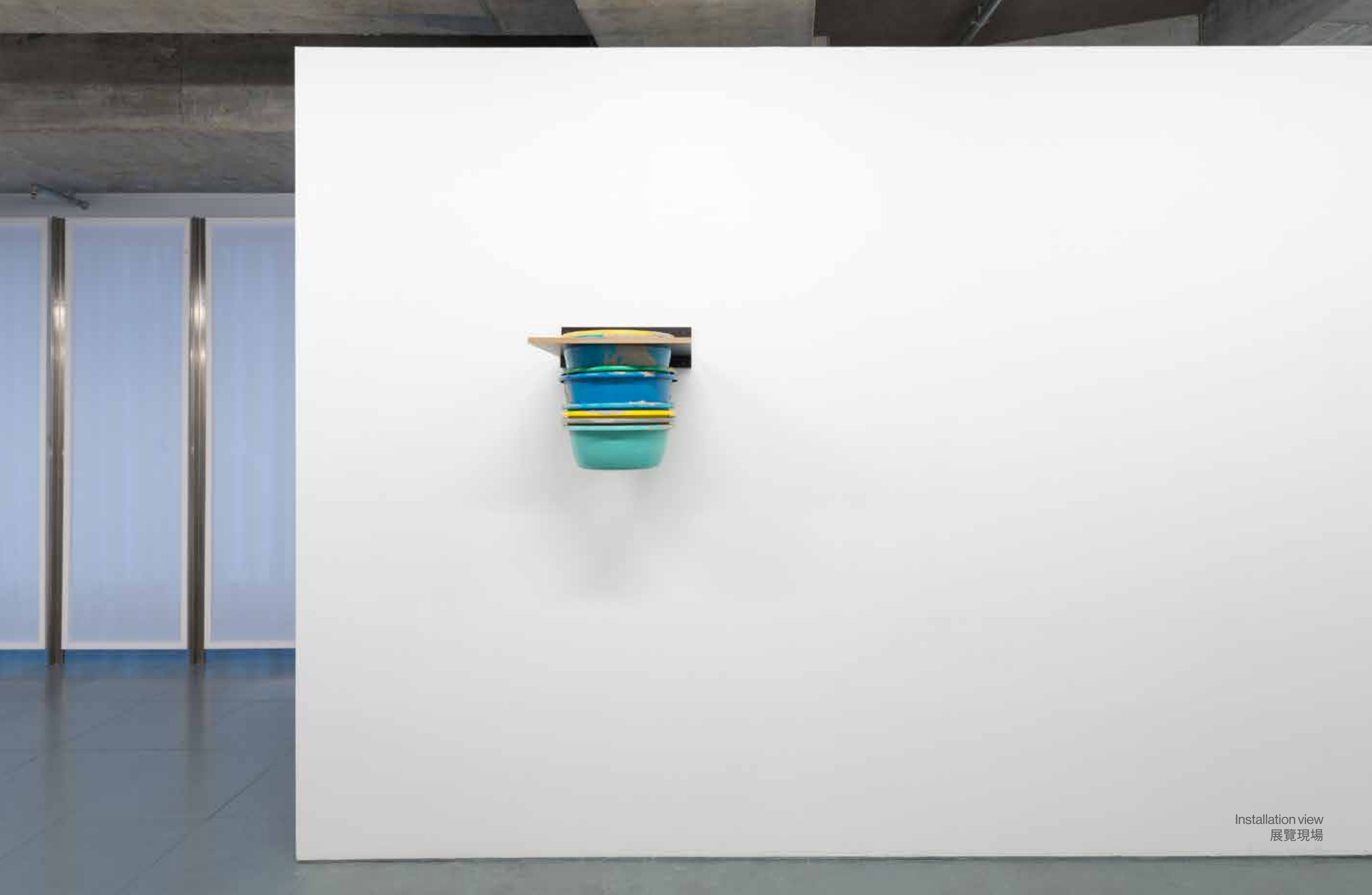
Installation view 展覽現場