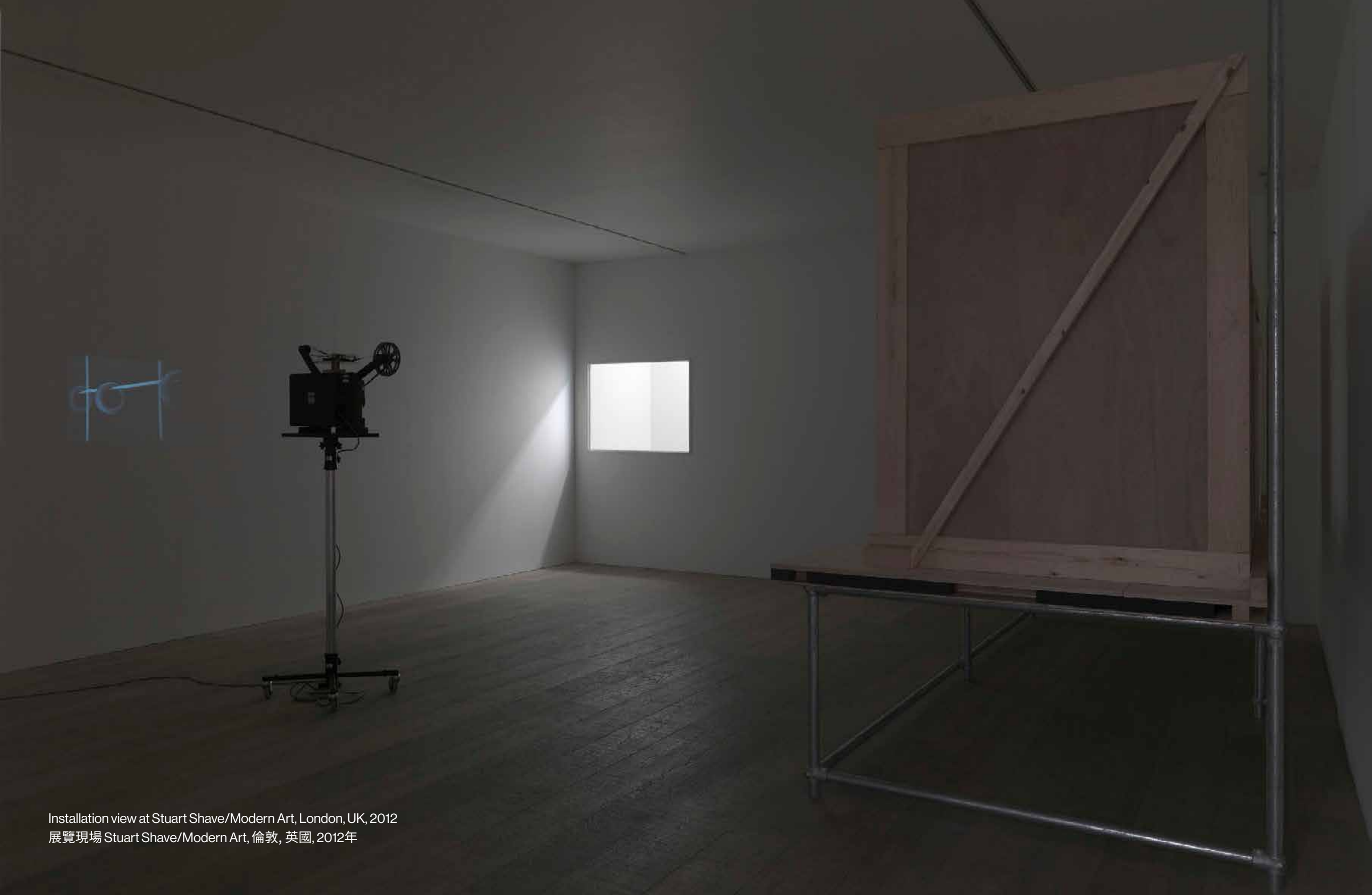
Installation view at Stuart Shave/Modern Art, London, UK, 2012 展覽現場 Stuart Shave/Modern Art, 倫敦, 英國, 2012年