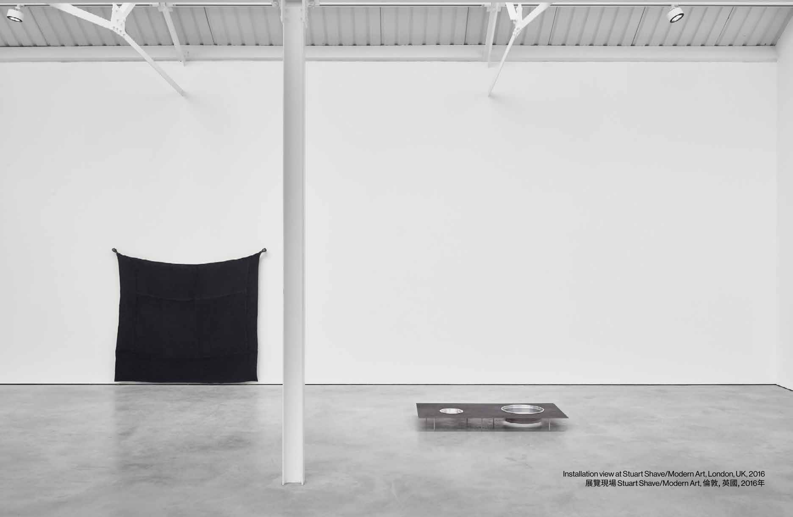
Installation view at Stuart Shave/Modern Art, London, UK, 2016 展覽現場 Stuart Shave/Modern Art, 倫敦, 英國, 2016年