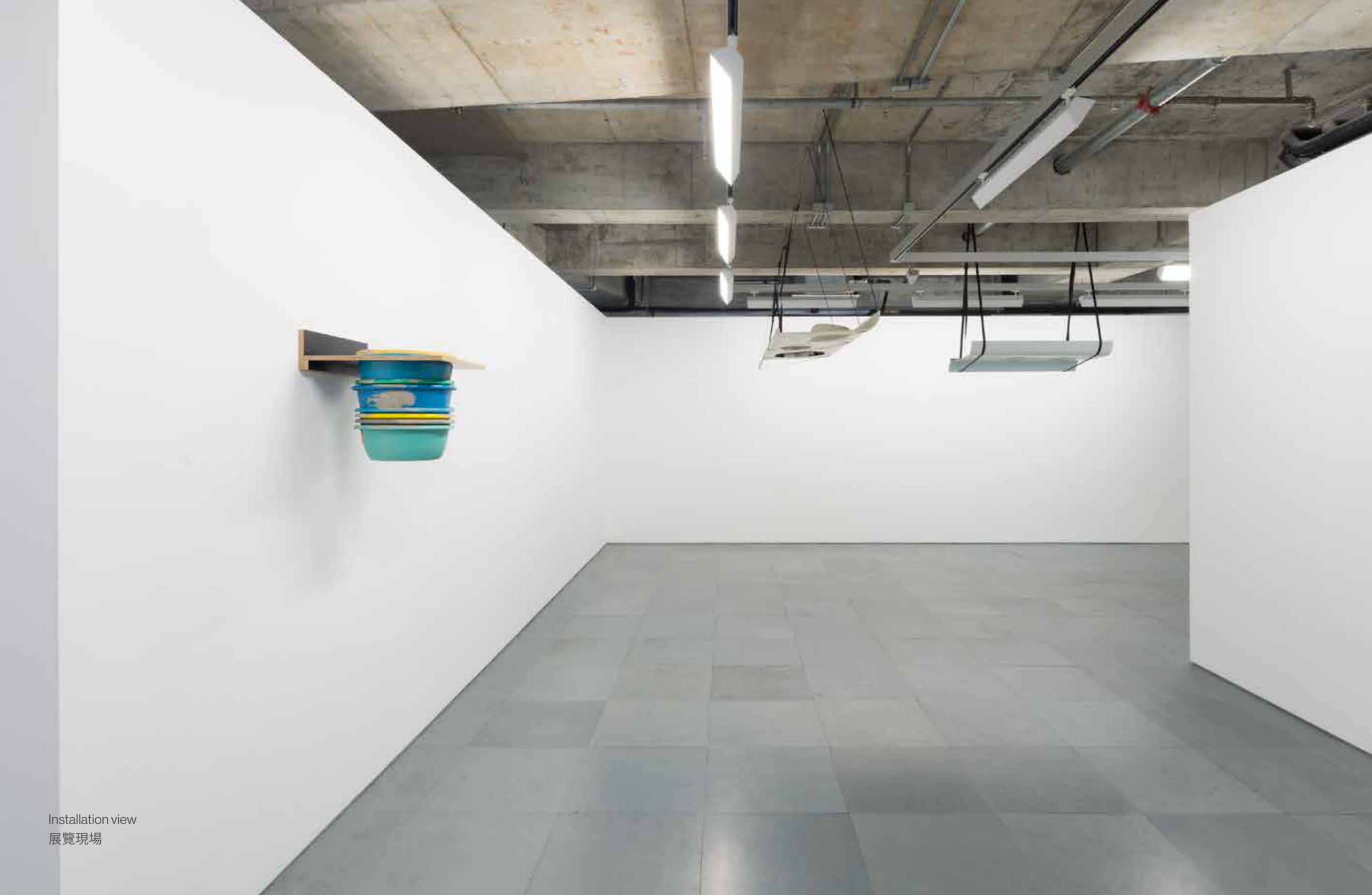
Installation view 展覽現場