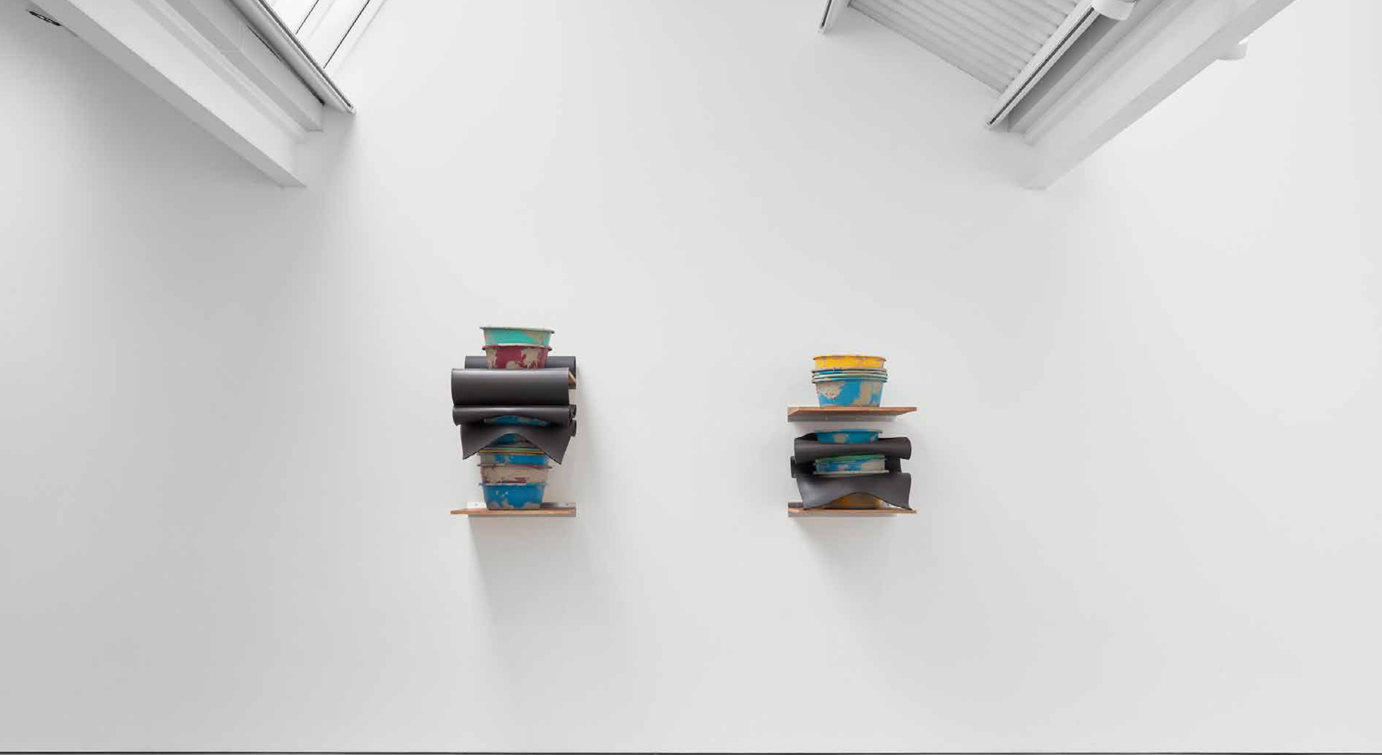
Installation view at Stuart Shave/Modern Art, London, UK, 2016 展覽現場 Stuart Shave/Modern Art, 倫敦, 英國, 2016年