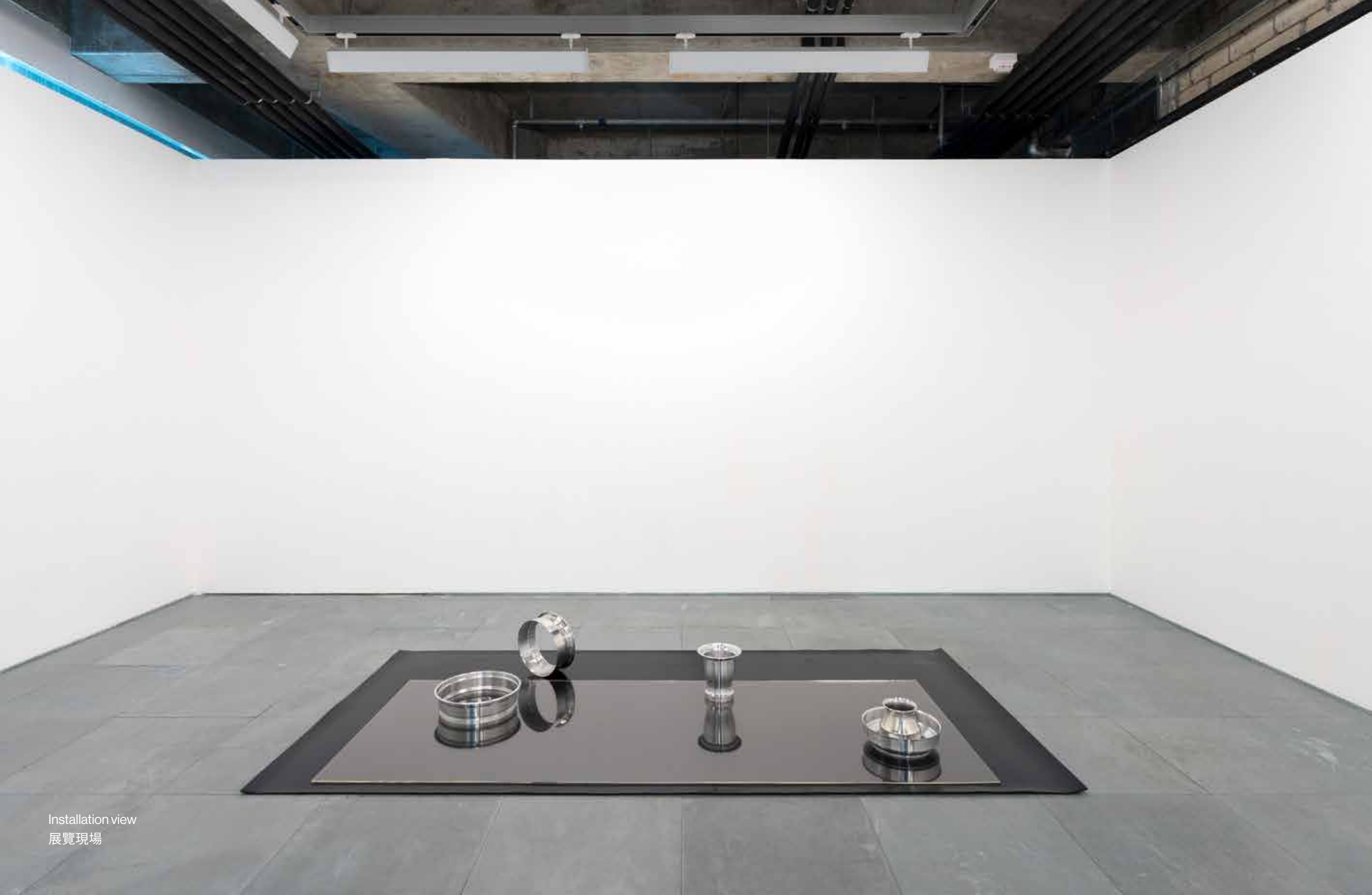
Installation view 展覽現場