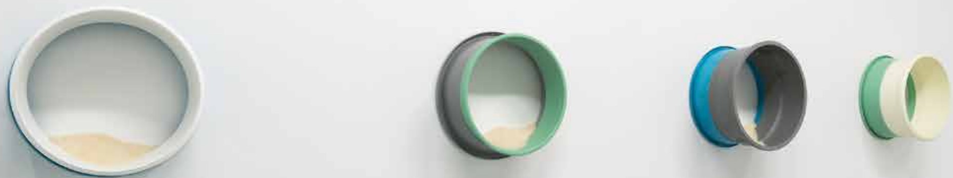
Untitled #1-4 2018