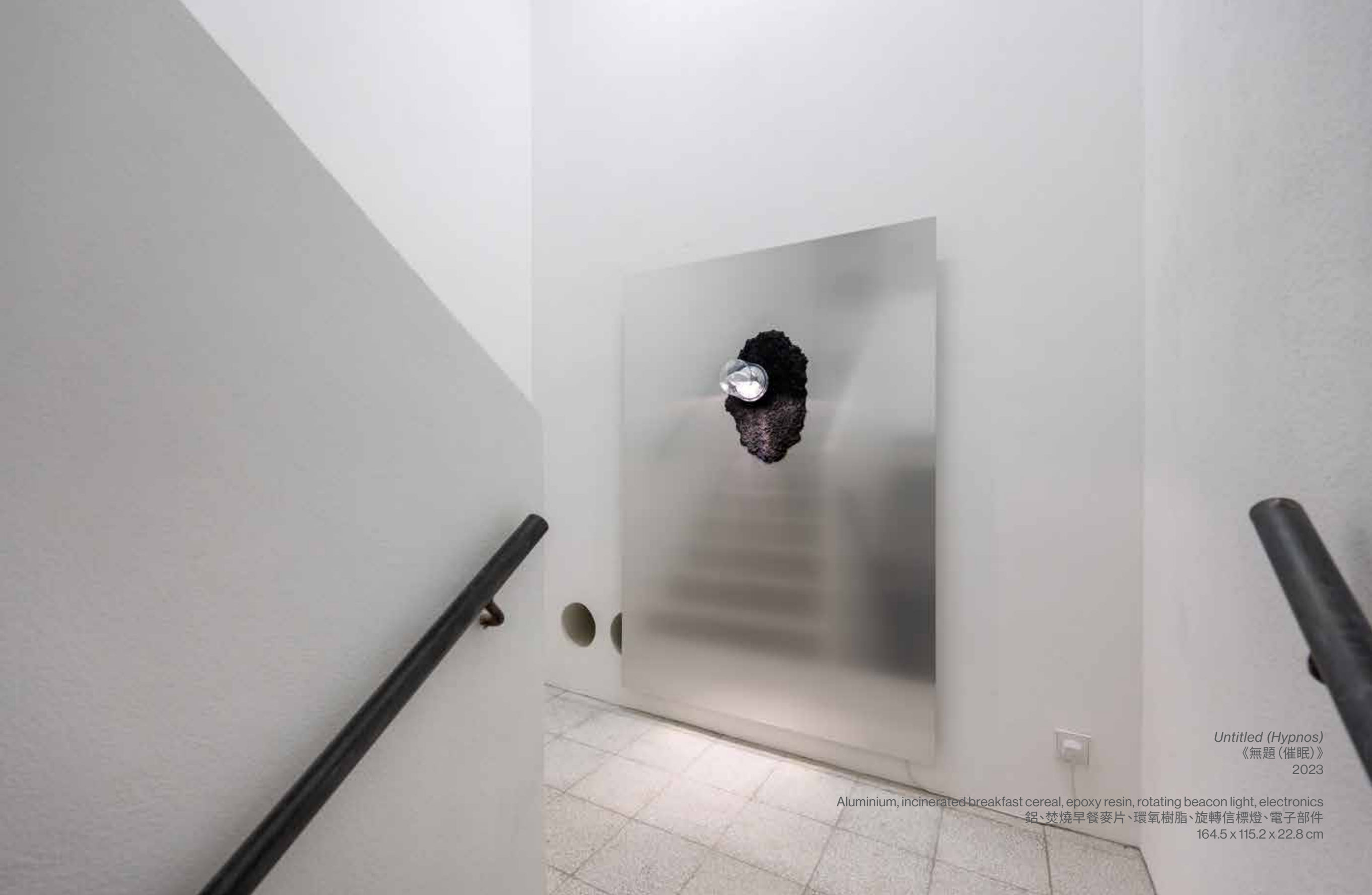
Untitled (Hypnos) 《無題(催眠)》 2023

Aluminium, incinerated breakfast cereal, epoxy resin, rotating beacon light, electronics 鋁、焚燒早餐麥片、環氧樹脂、旋轉信標燈、電子部件 164.5 x 115.2 x 22.8 cm