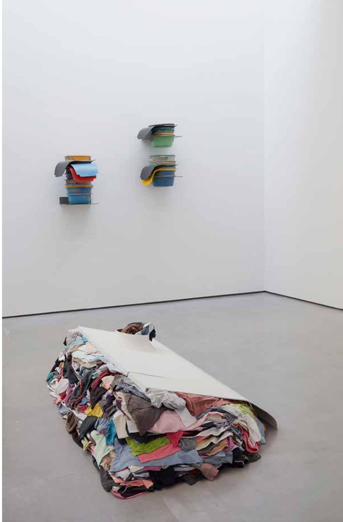
Installation View of Phillip Lai in The Hepworth Prize for Sculpture 2018. 26 October 2018 – 20 January 2019.

菲利浦·黎在赫普沃斯獲獎展覽 2018展覽現場。 26.10.18-20.01.19