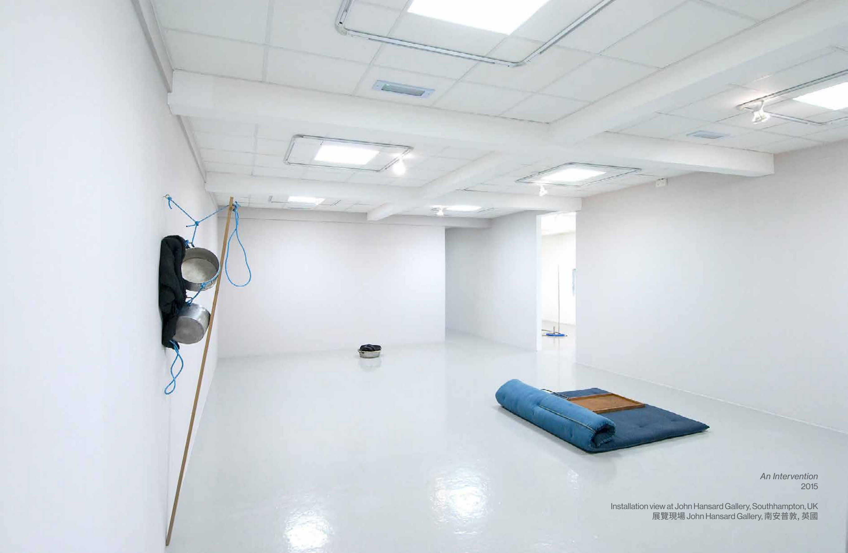
An Intervention 2015

Installation view at John Hansard Gallery, Southampton, UK 展覽現場 John Hansard Gallery, 南安普敦, 英國