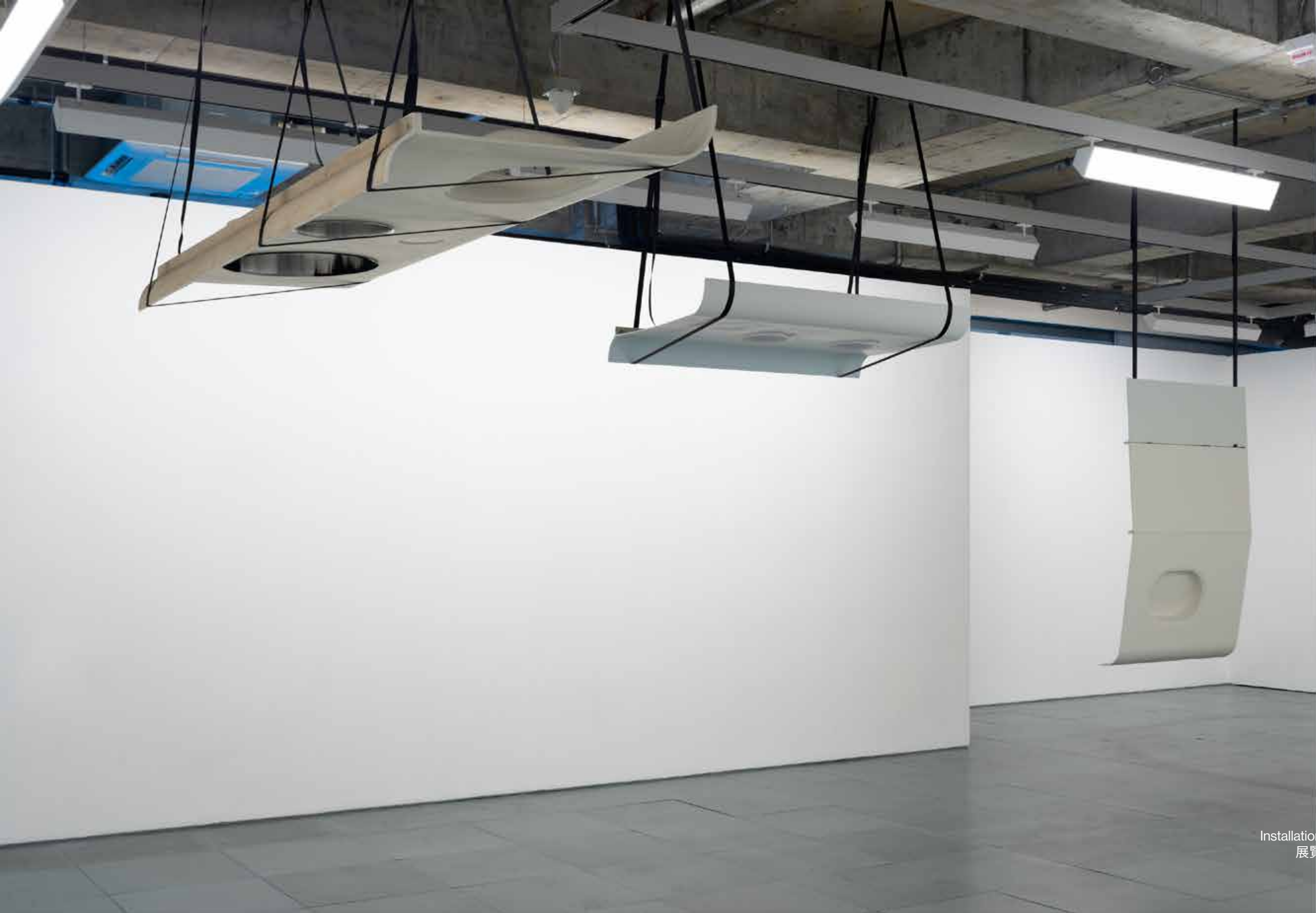
Installation view 展覽現場