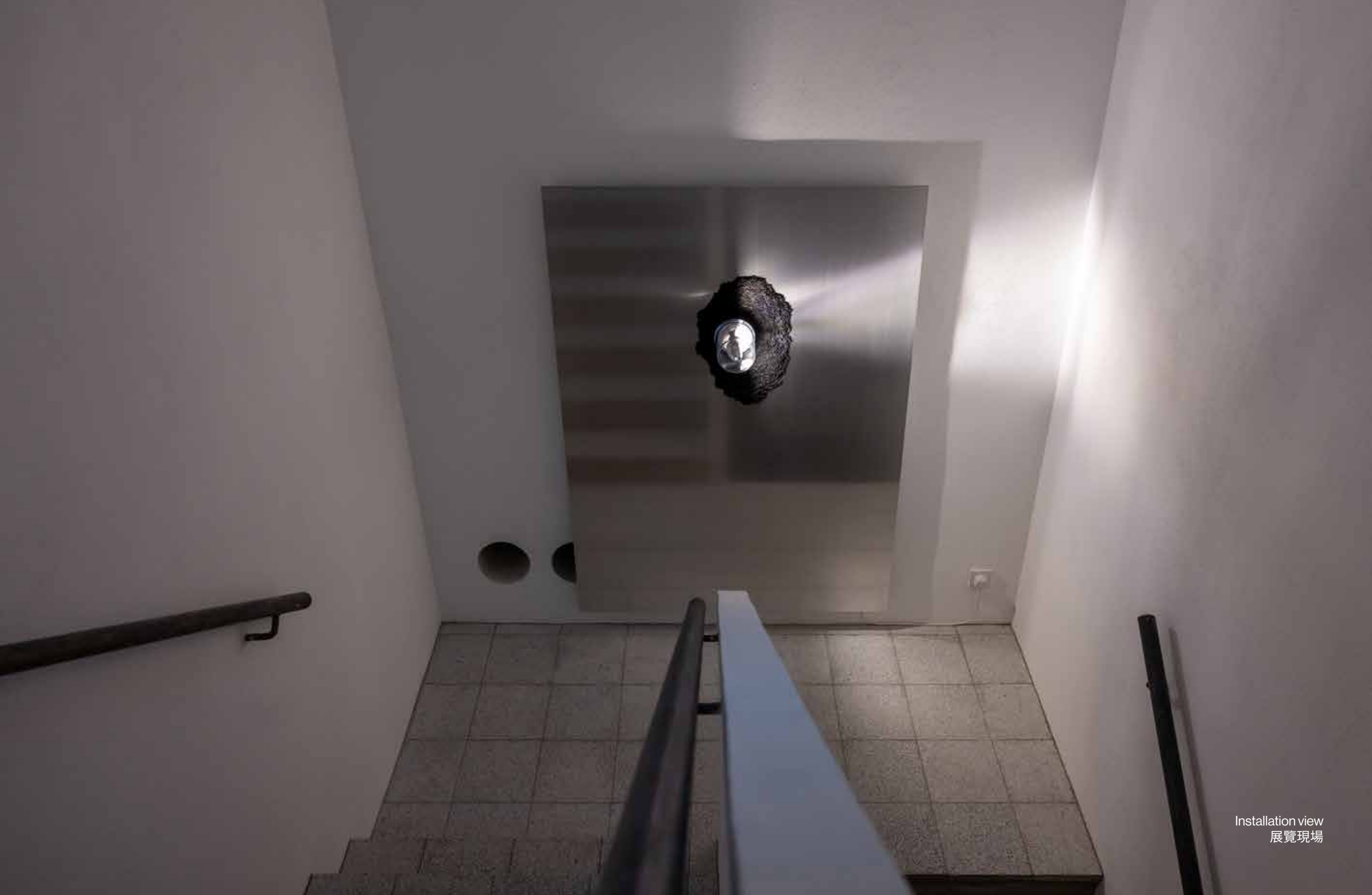
Installation view 展覽現場