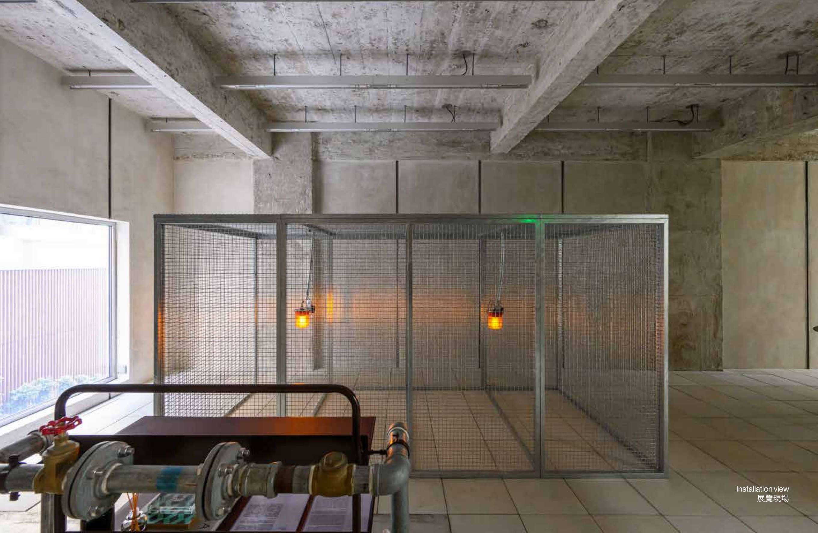
Installation view 展覽現場