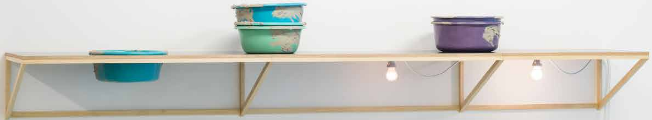
The empties 2018

Cast polyurethane, concrete, laminated plywood, timber, lamp holders, bulbs 聚氨酯, 混凝土, 層壓膠合板, 木材, 燈座, 燈泡 333 W x 60 D x 35 H cm