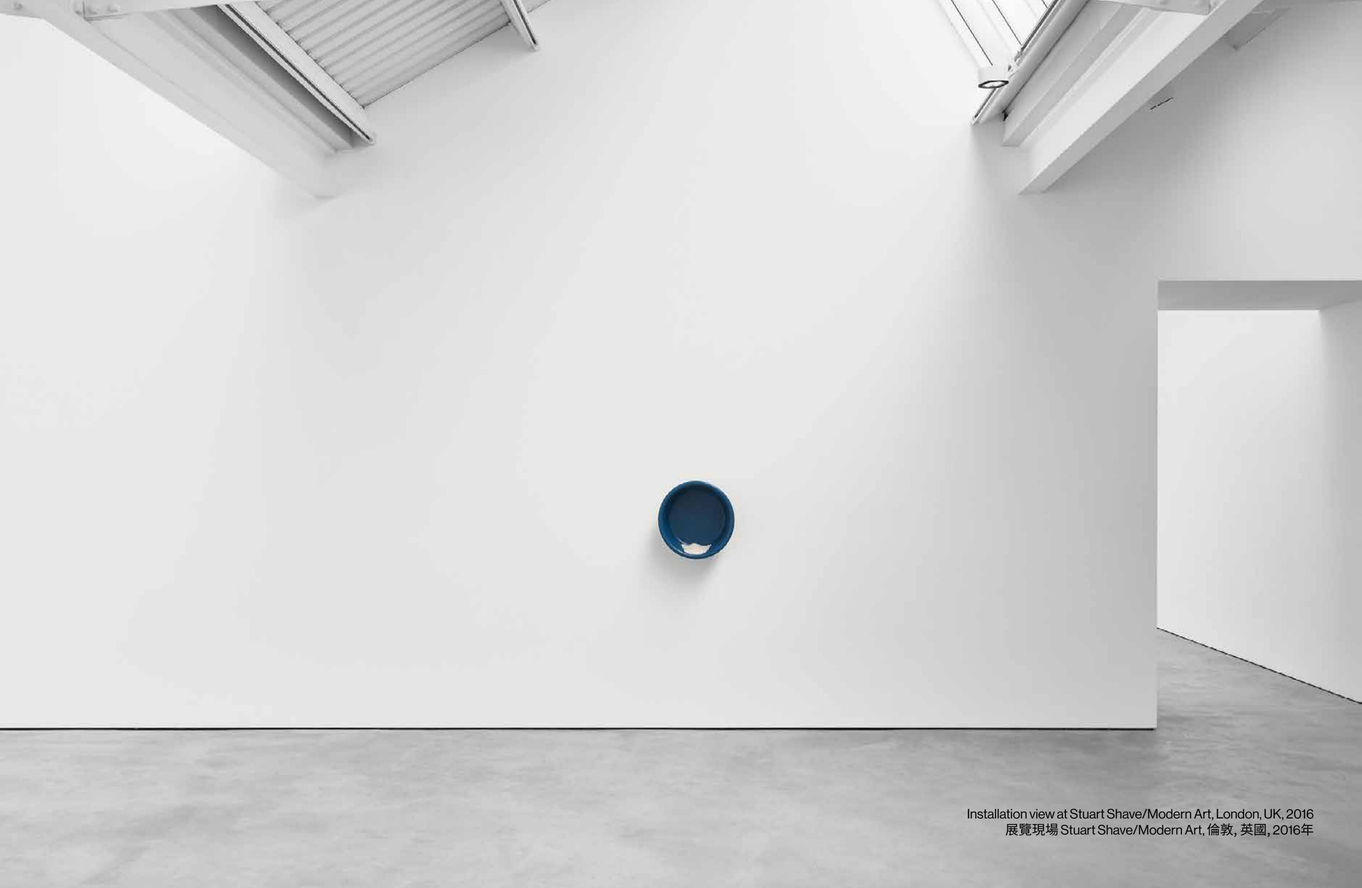
Installation view at Stuart Shave/Modern Art, London, UK, 2016 展覽現場 Stuart Shave/Modern Art, 倫敦, 英國, 2016年