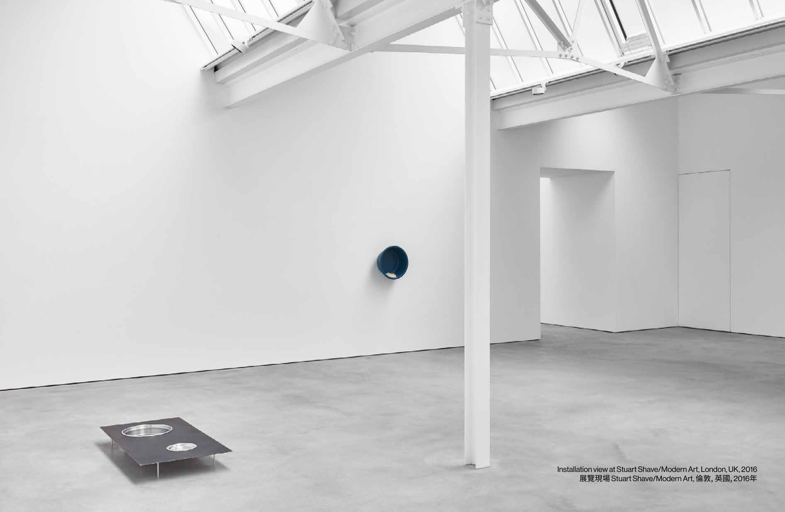
Installation view at Stuart Shave/Modern Art, London, UK, 2016 展覽現場 Stuart Shave/Modern Art, 倫敦, 英國, 2016年