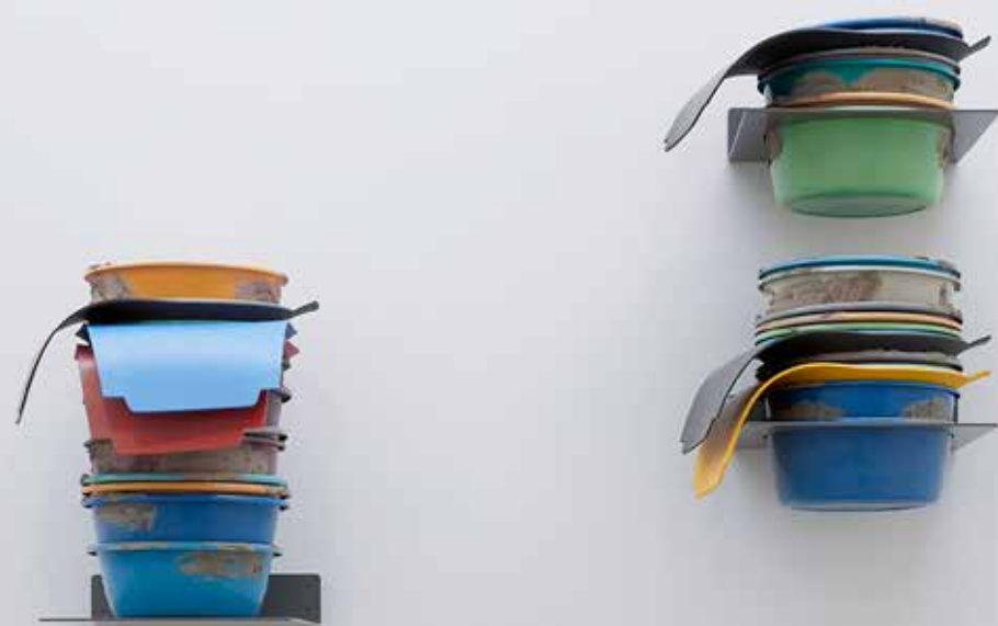
Installation View of Phillip Lai in The Hepworth Prize for Sculpture 2018. 26 October 2018 – 20 January 2019.

菲利浦·黎在赫普沃斯獲獎展覽 2018 展覽現場。 26.10.18-20.01.19