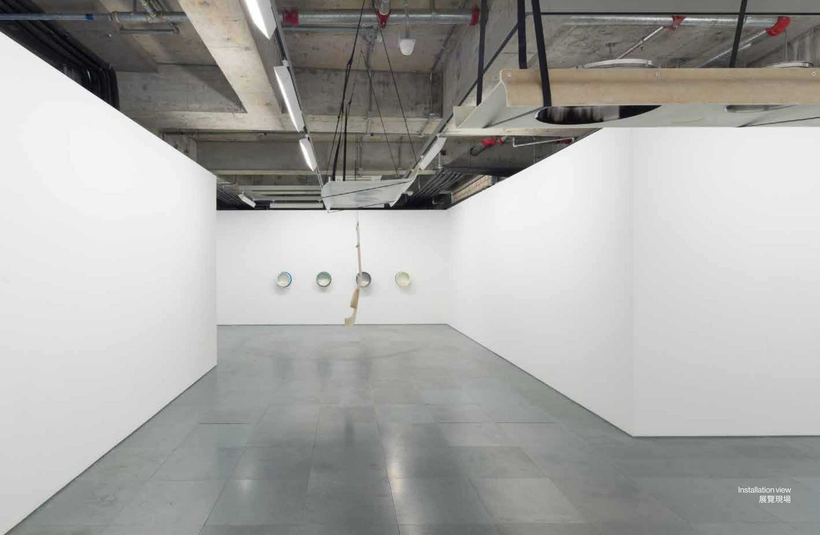
Installation view 展覽現場