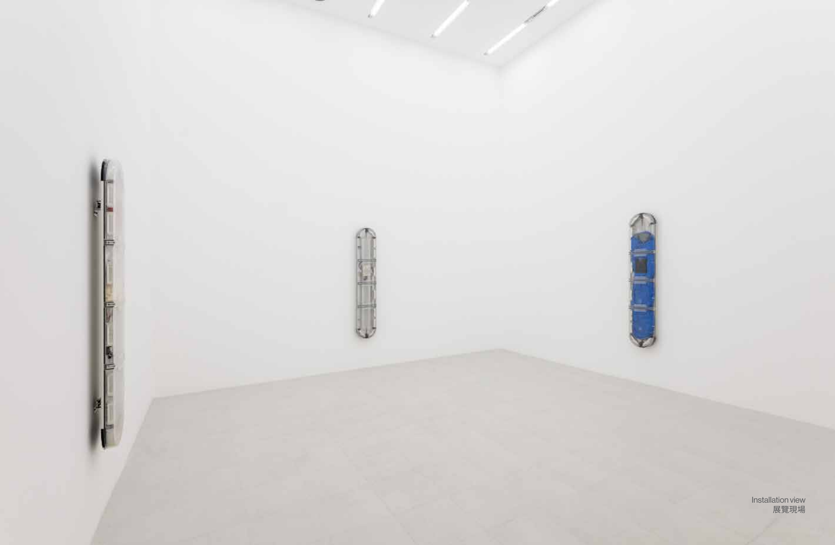
Installation view 展覽現場