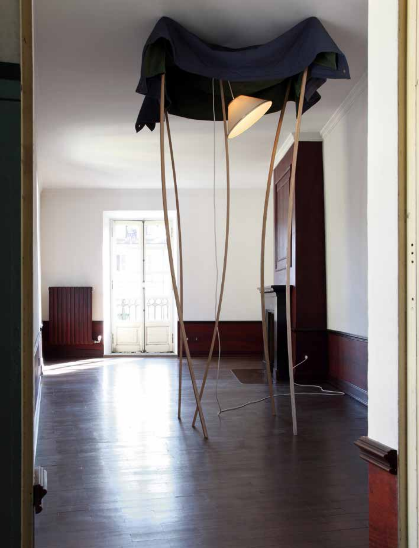
Subjects and objects that cannot meet 2012

Dyed fabrics, eyelets, laminated wood, lampshade, bulb 染色面料, 孔眼, 層壓木, 燈罩, 燈泡 260 x 126 x 120 cm