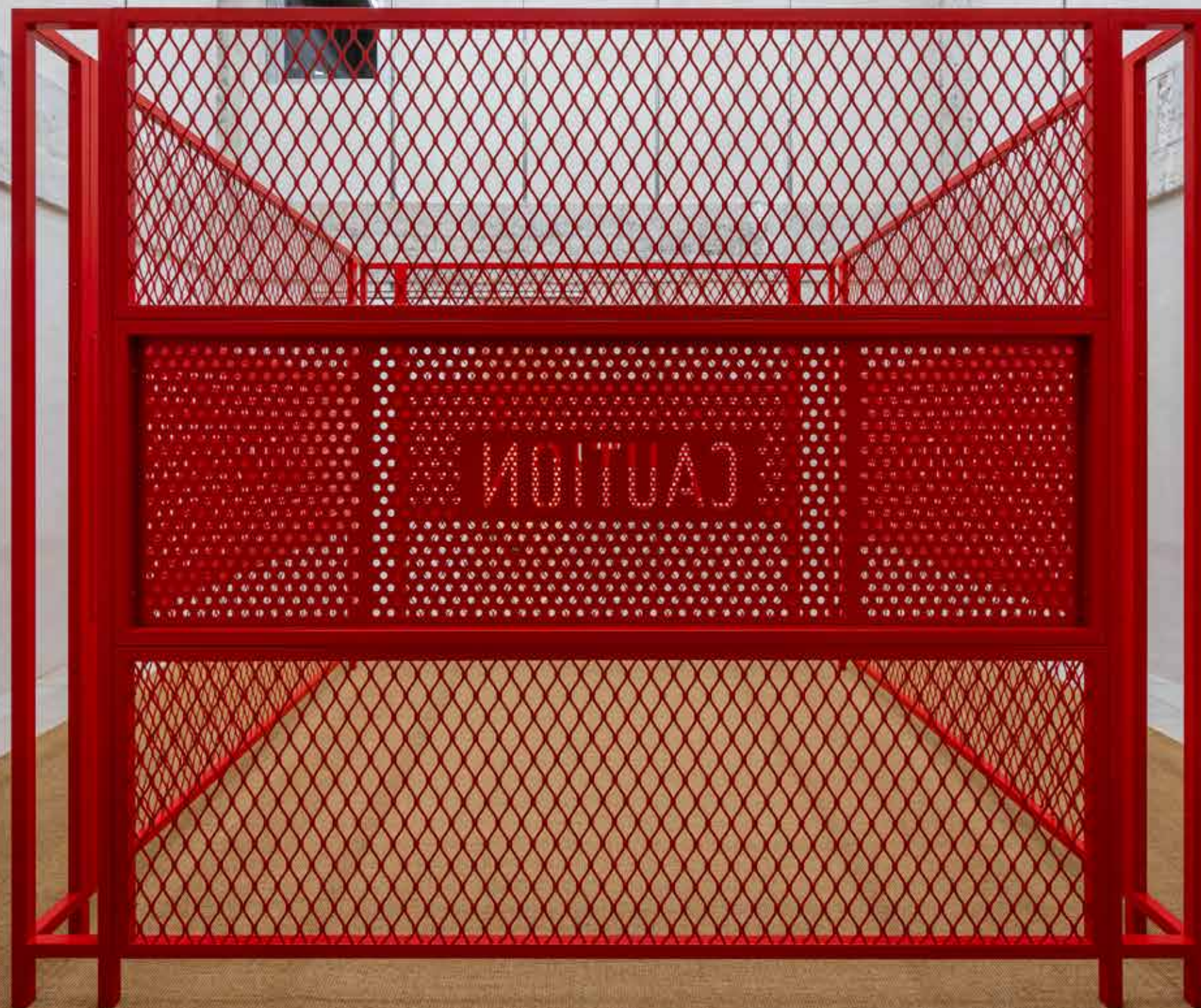
Four Cautions 《四個警醒》 2023

Powder-coated steel 粉末塗層鋼 201.3 x 241 x 241 cm