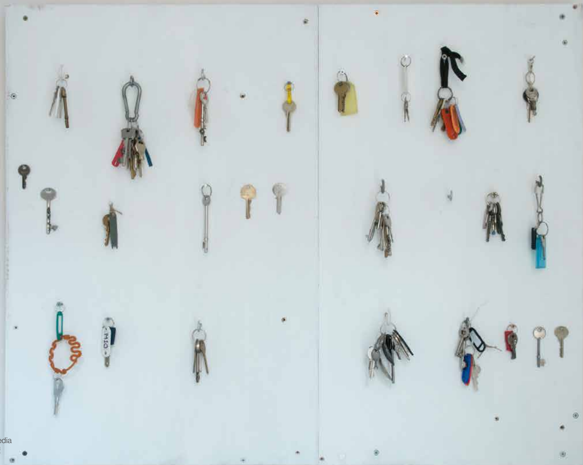
Untitled (keys) 2012

Wood, paint, keys, mixed media 木材, 油漆, 鑰匙, 混合媒體 79.5 x 89.5 x 11cm