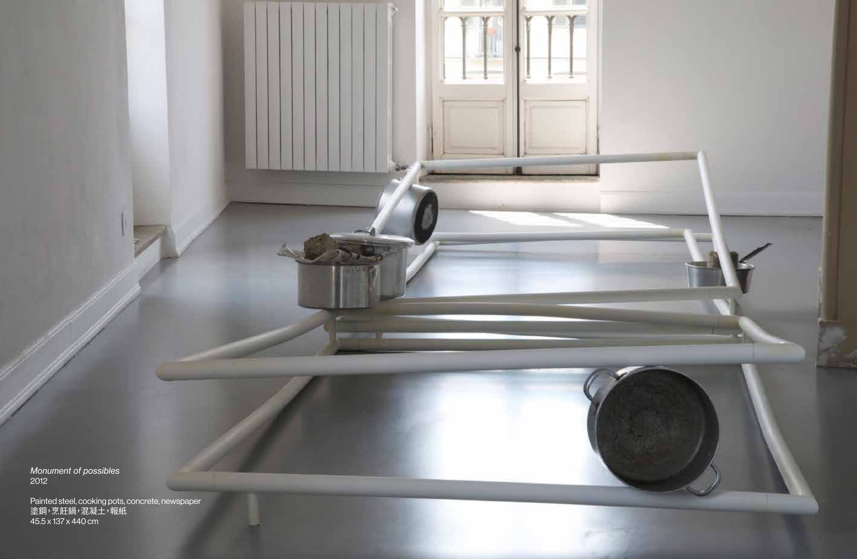
Monument of possibles 2012

Painted steel, cooking pots, concrete, newspaper 塗鋼, 烹飪鍋, 混凝土, 報紙 45.5 x 137 x 440 cm