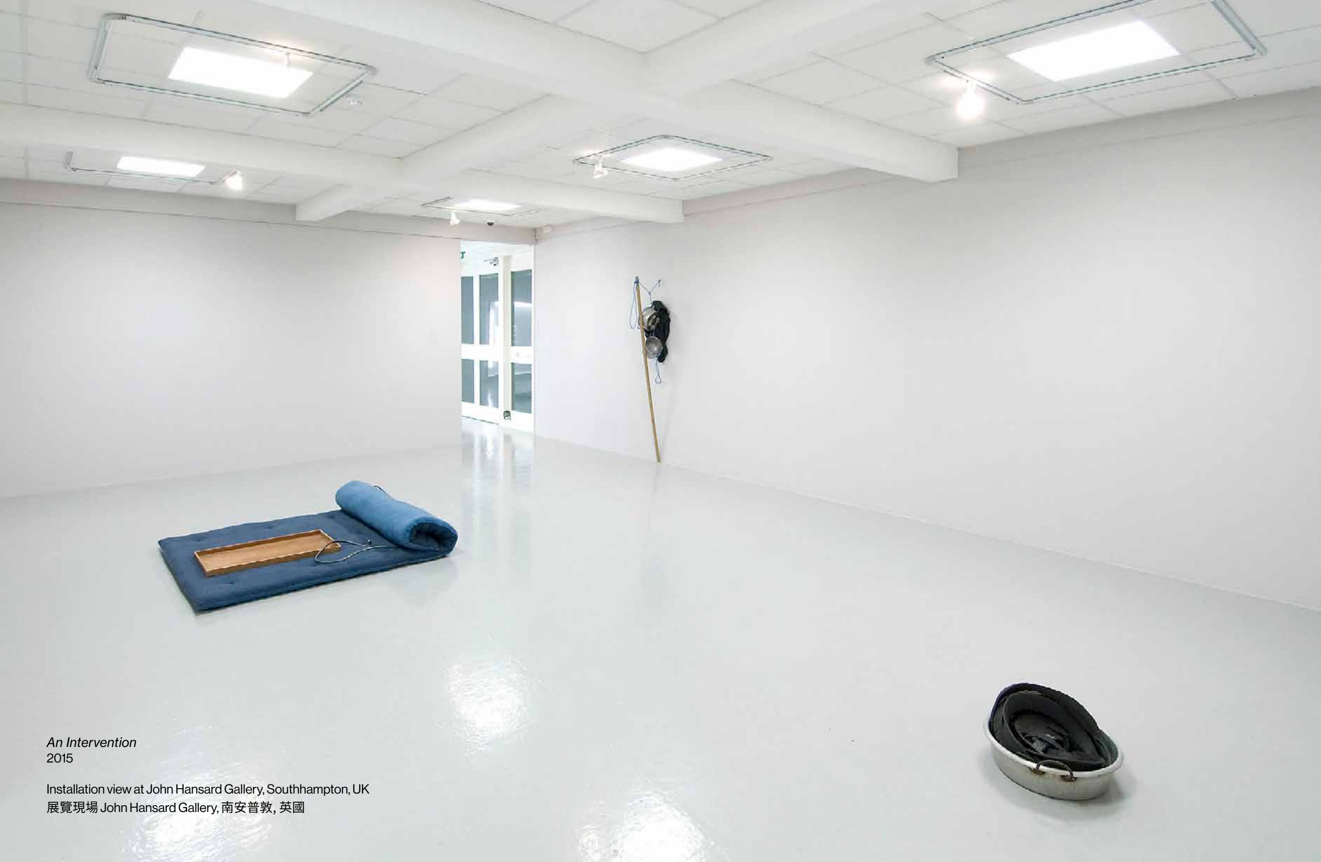
An Intervention 2015

Installation view at John Hansard Gallery, Southampton, UK 展覽現場 John Hansard Gallery, 南安普敦, 英國