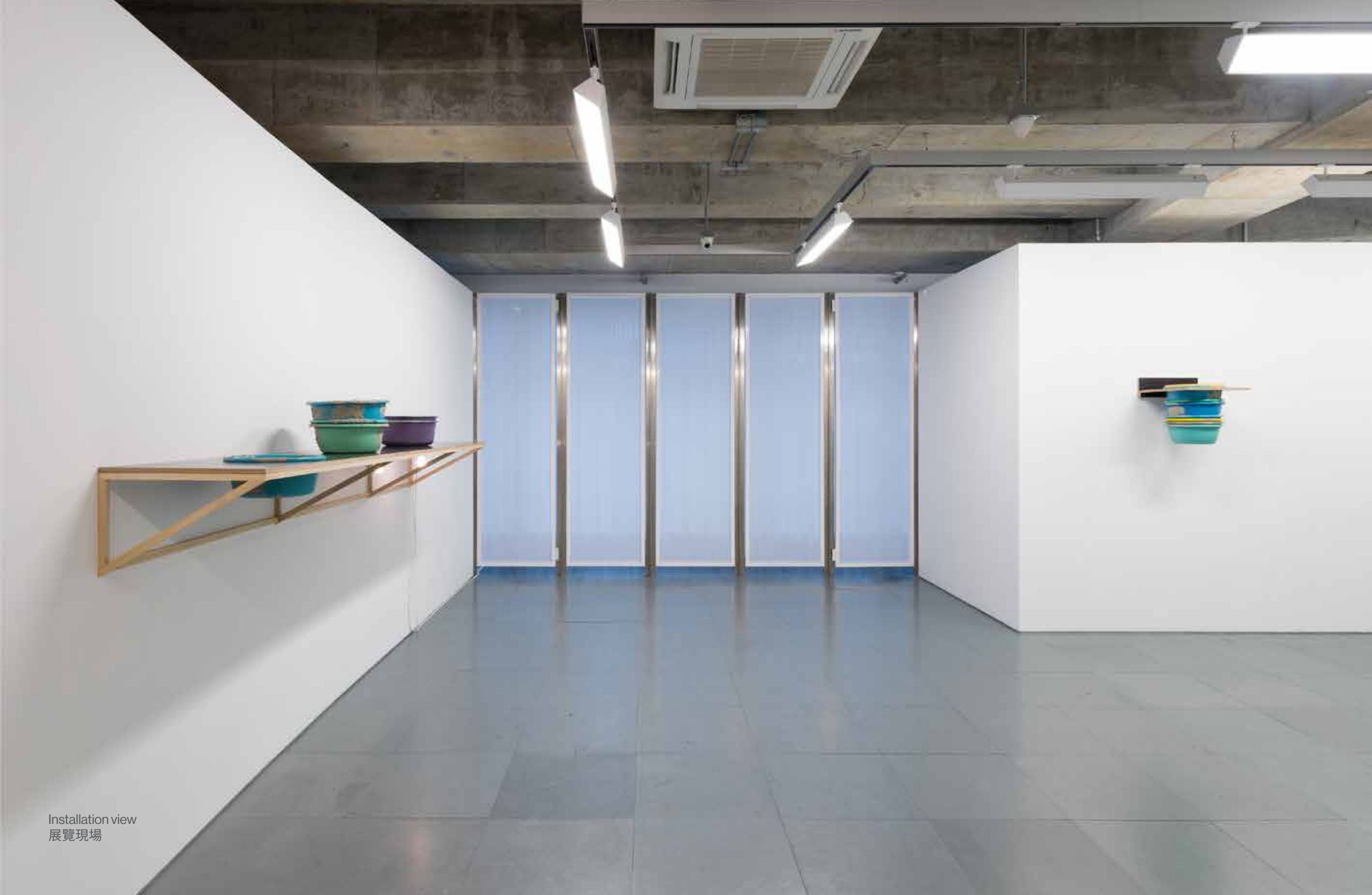
Installation view 展覽現場