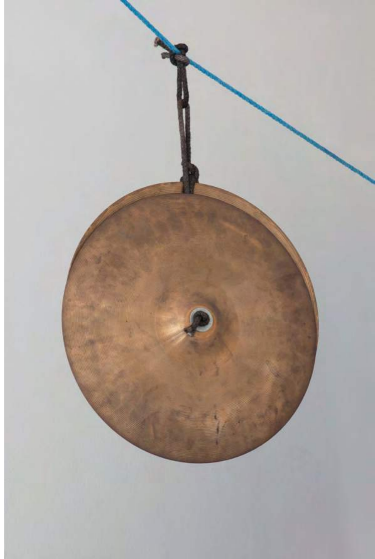
(Detail 細節) 'Co-presence', 2012