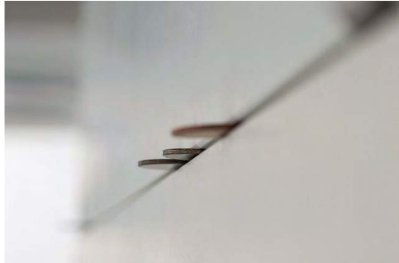
(Detail 細節) 'Untitled', 2018