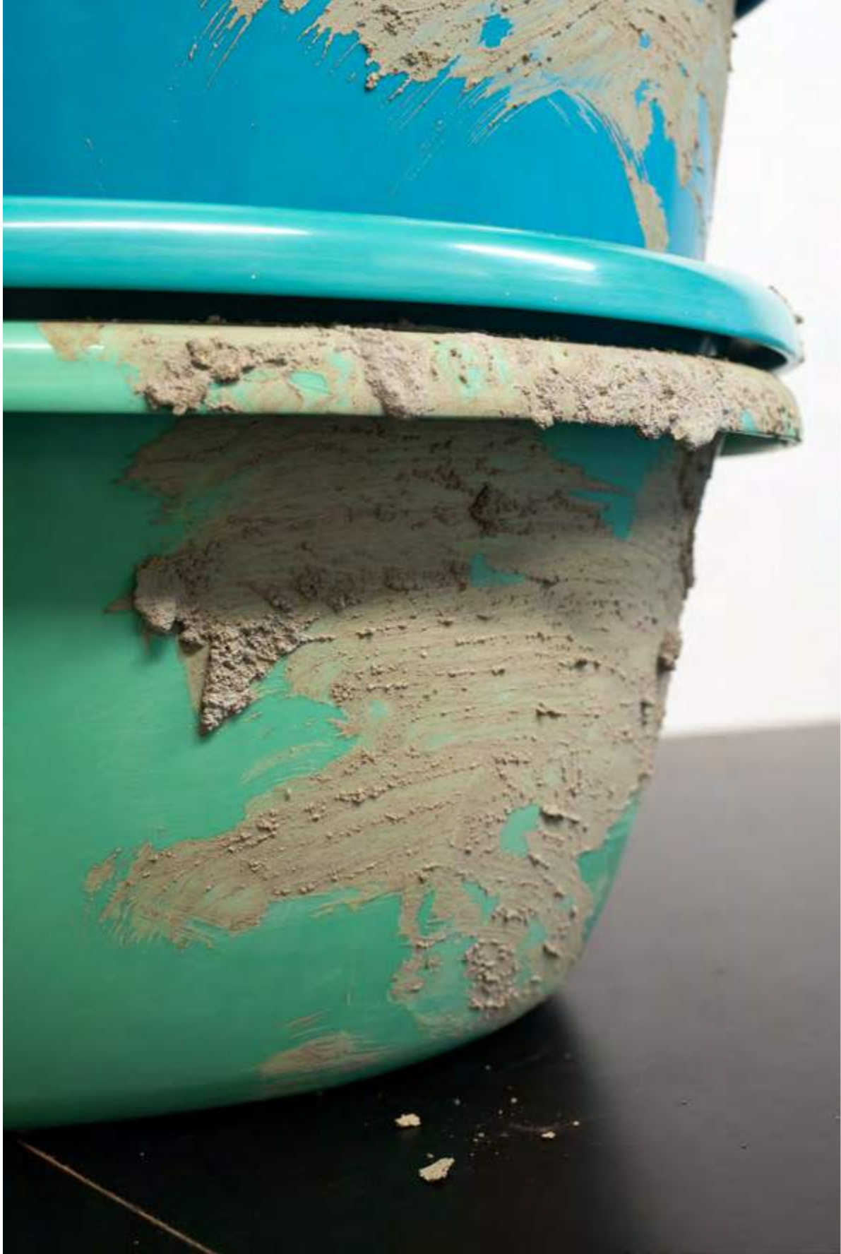
(Detail 細節) 'The empties', 2018