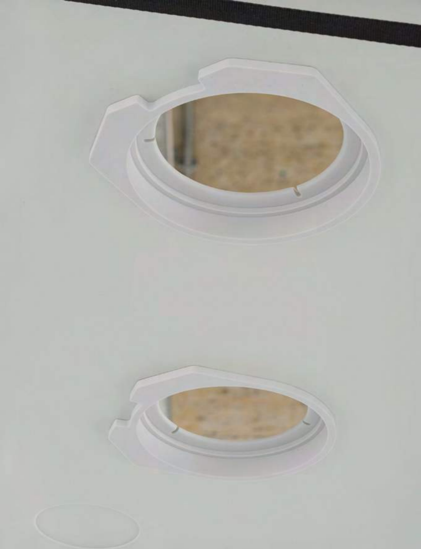
(Detail 細節) 'Untitled', 2018