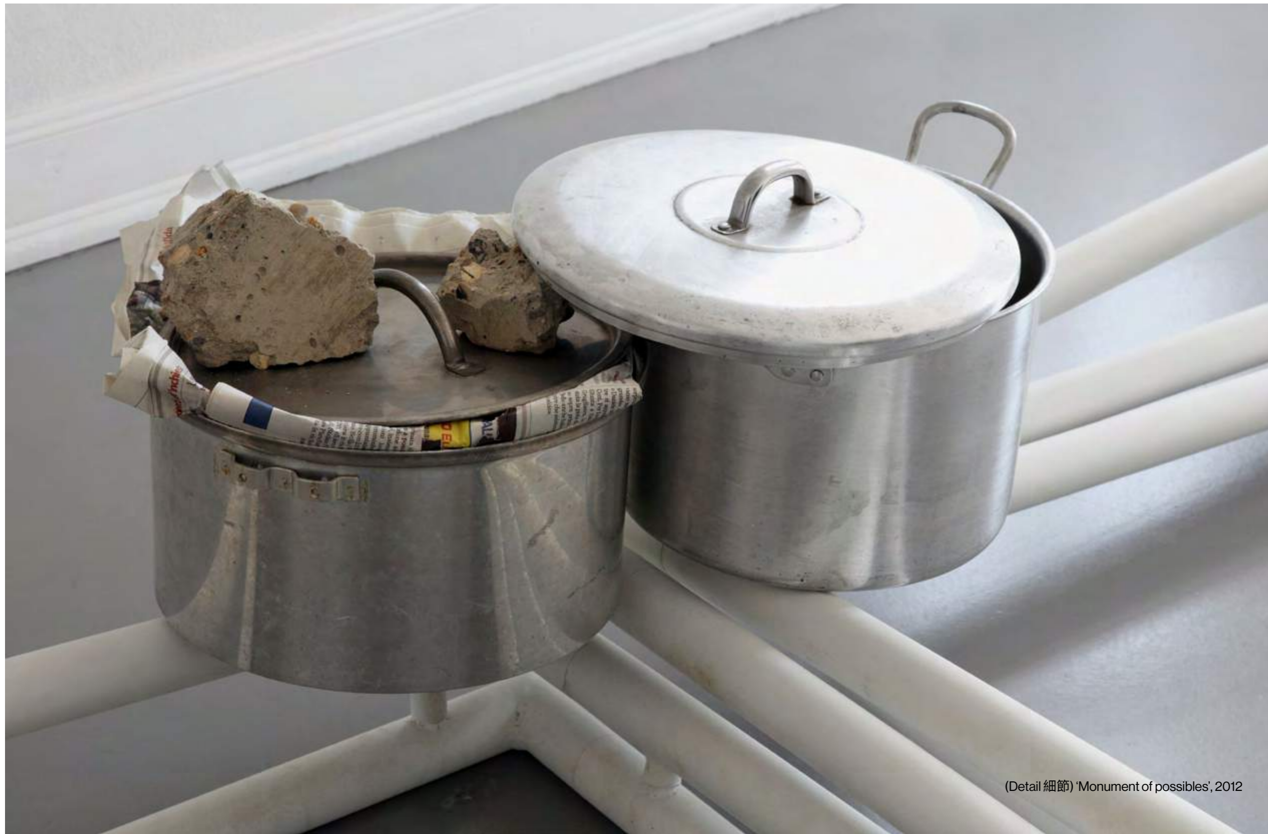
(Detail 細節) 'Monument of possibles', 2012