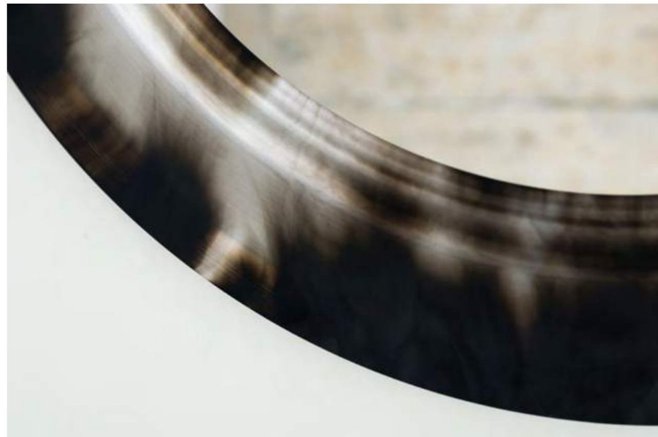
(Detail 細節) 'Untitled', 2018