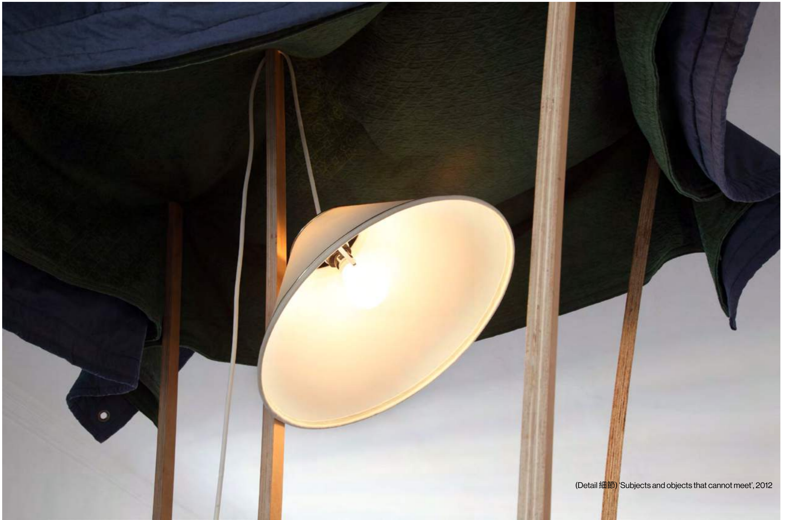
(Detail 細節) 'Subjects and objects that cannot meet', 2012