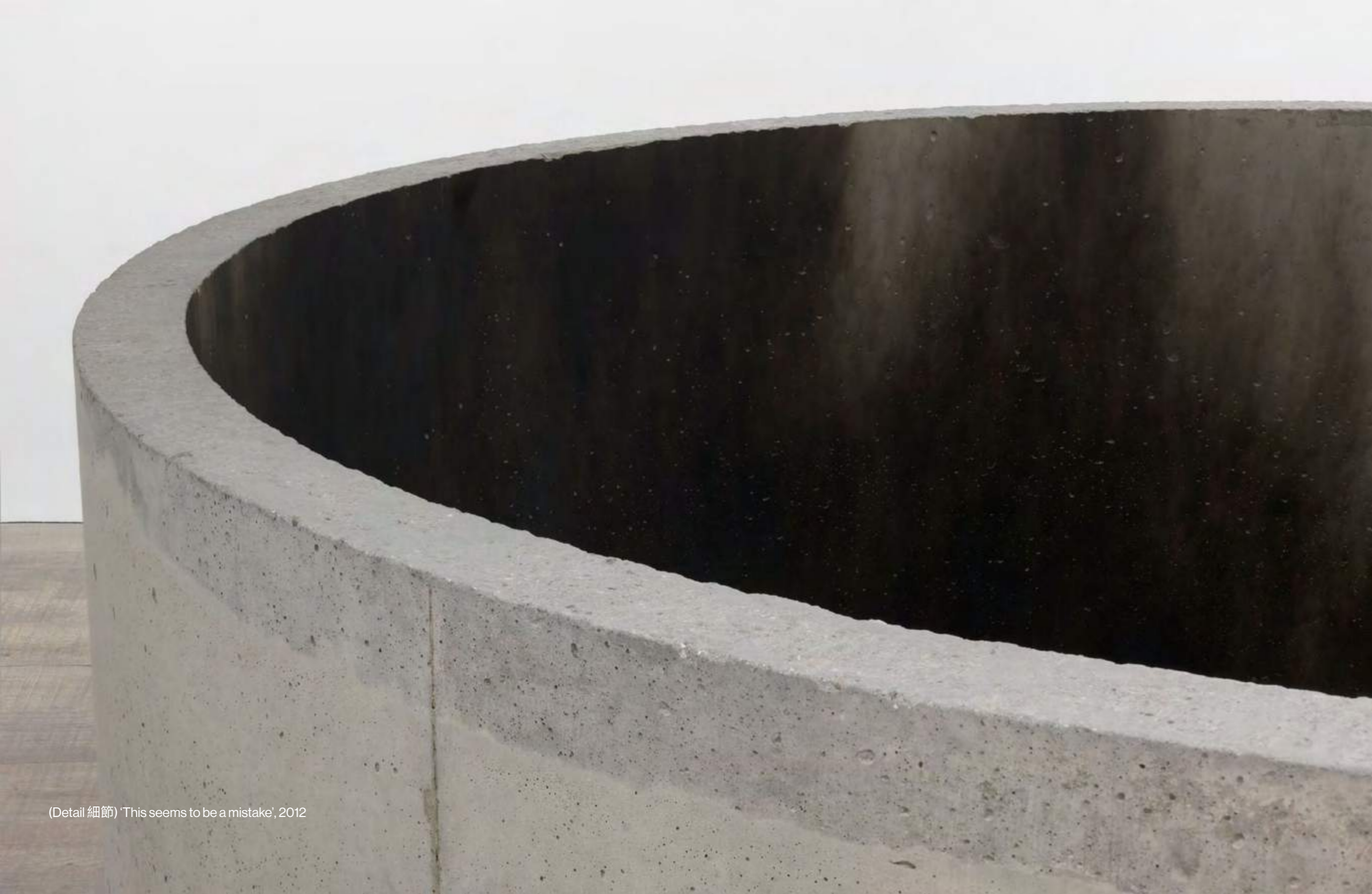
(Detail 細節) 'This seems to be a mistake', 2012