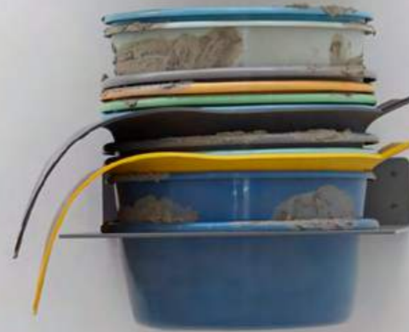
Installation View of Phillip Lai in The Hepworth Prize for Sculpture 2018. 26 October 2018 – 20 January 2019.