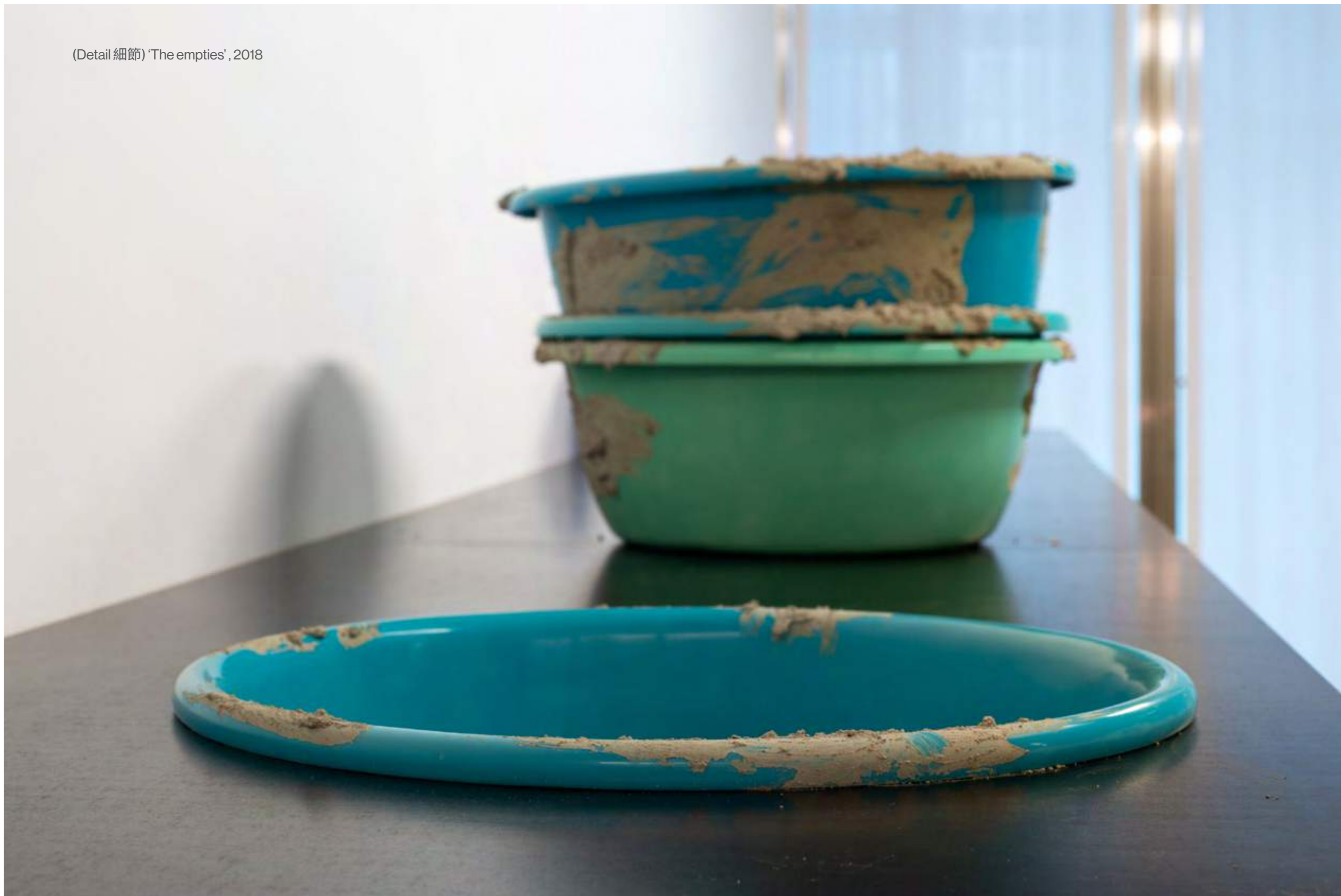
(Detail 細節) 'The empties', 2018