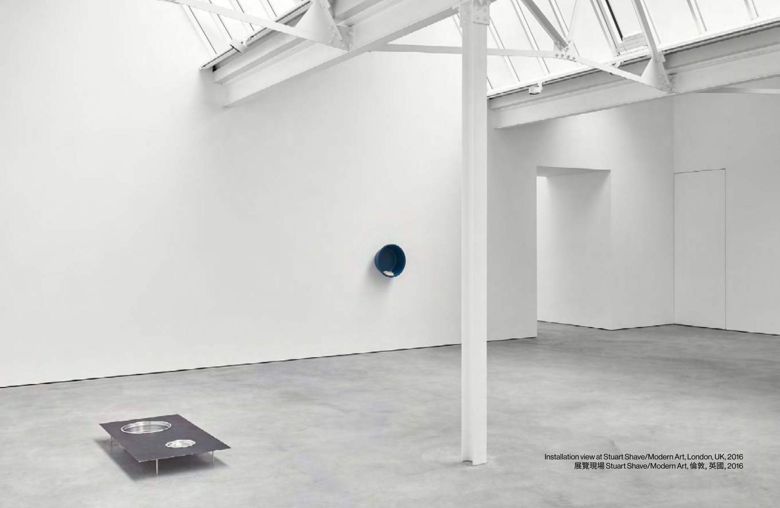
Installation view at Stuart Shave/Modern Art, London, UK, 2016 展覽現場 Stuart Shave/Modern Art, 倫敦, 英國, 2016