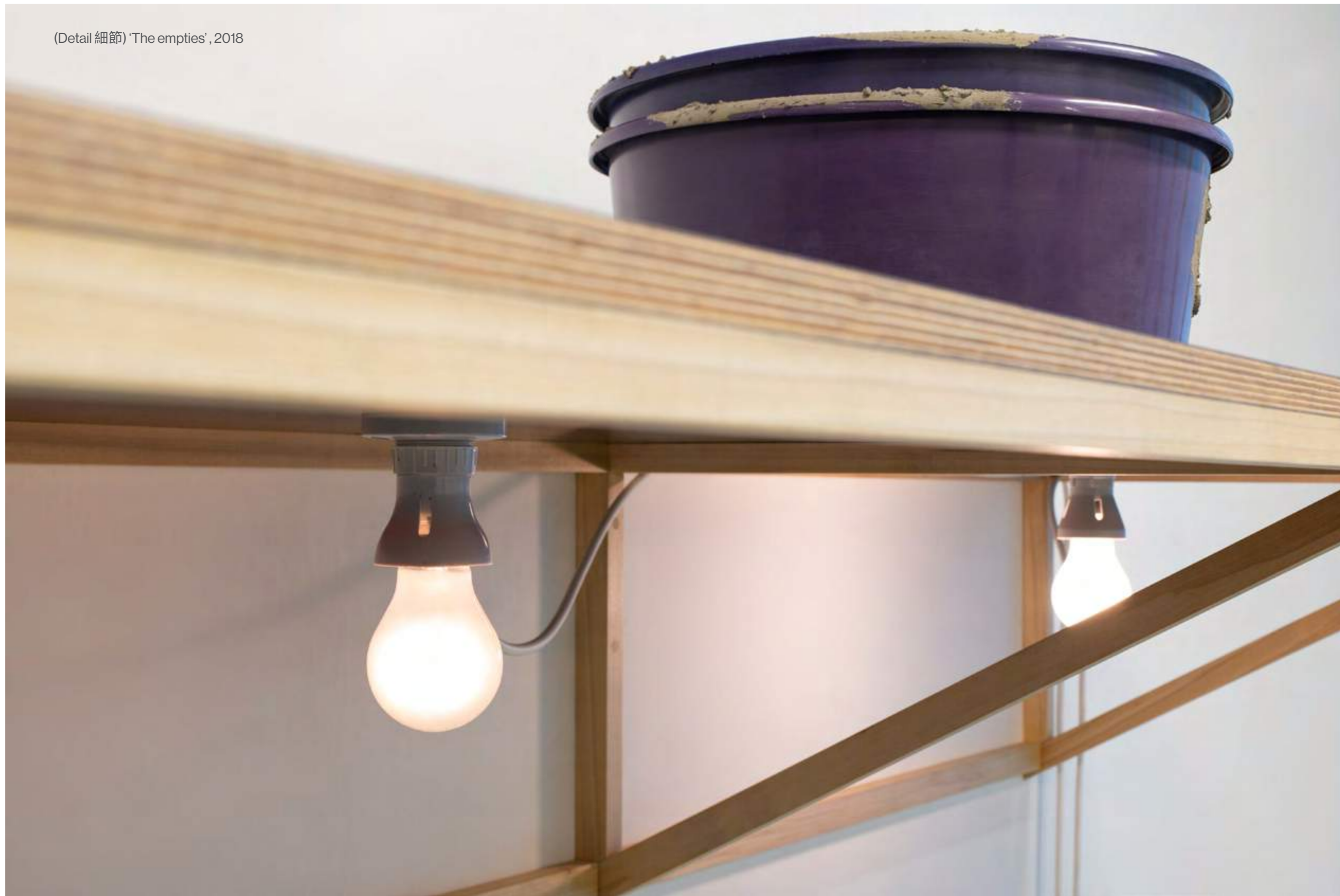
(Detail 細節) 'The empties', 2018