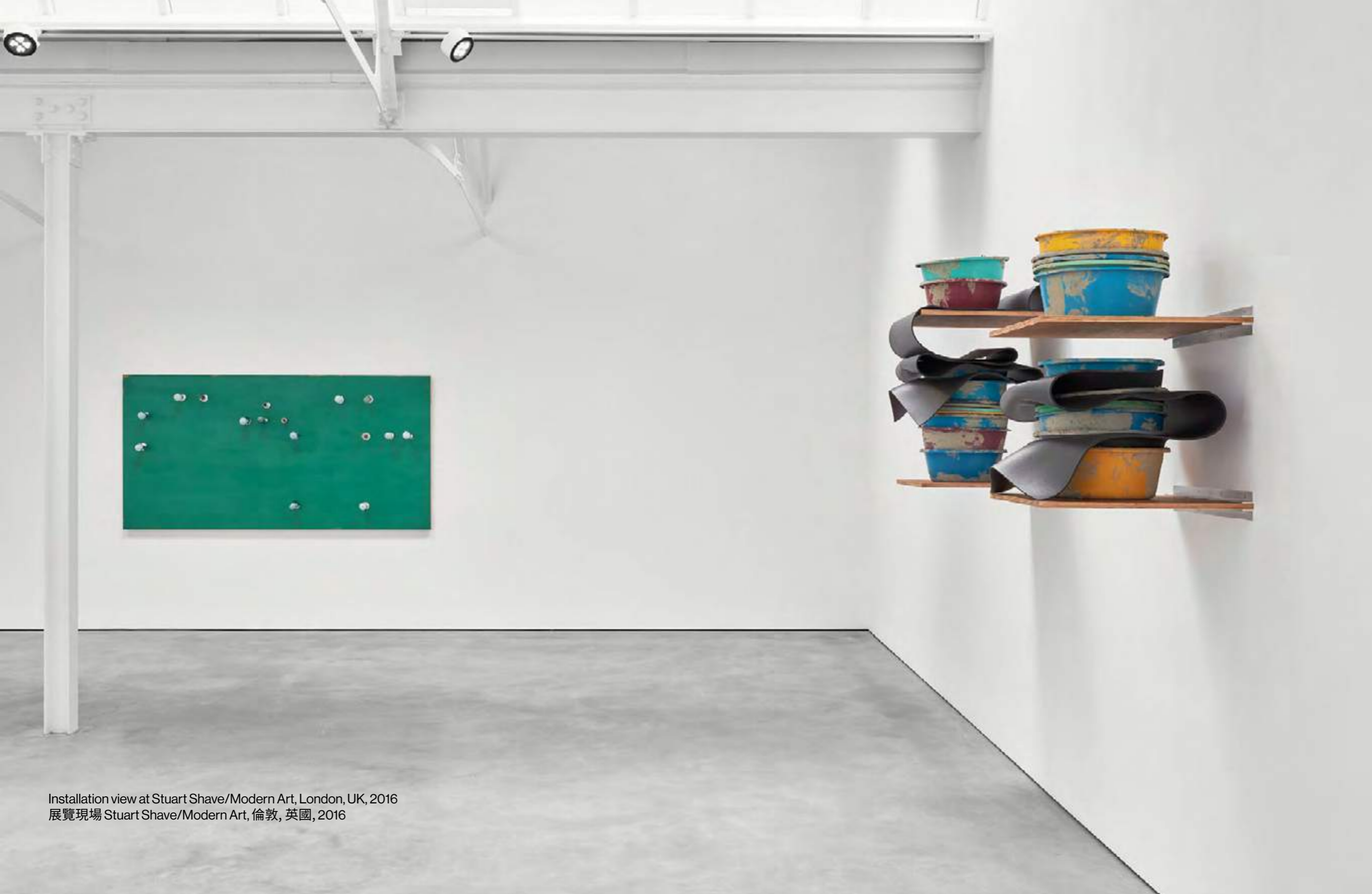
Installation view at Stuart Shave/Modern Art, London, UK, 2016 展覽現場 Stuart Shave/Modern Art, 倫敦, 英國, 2016