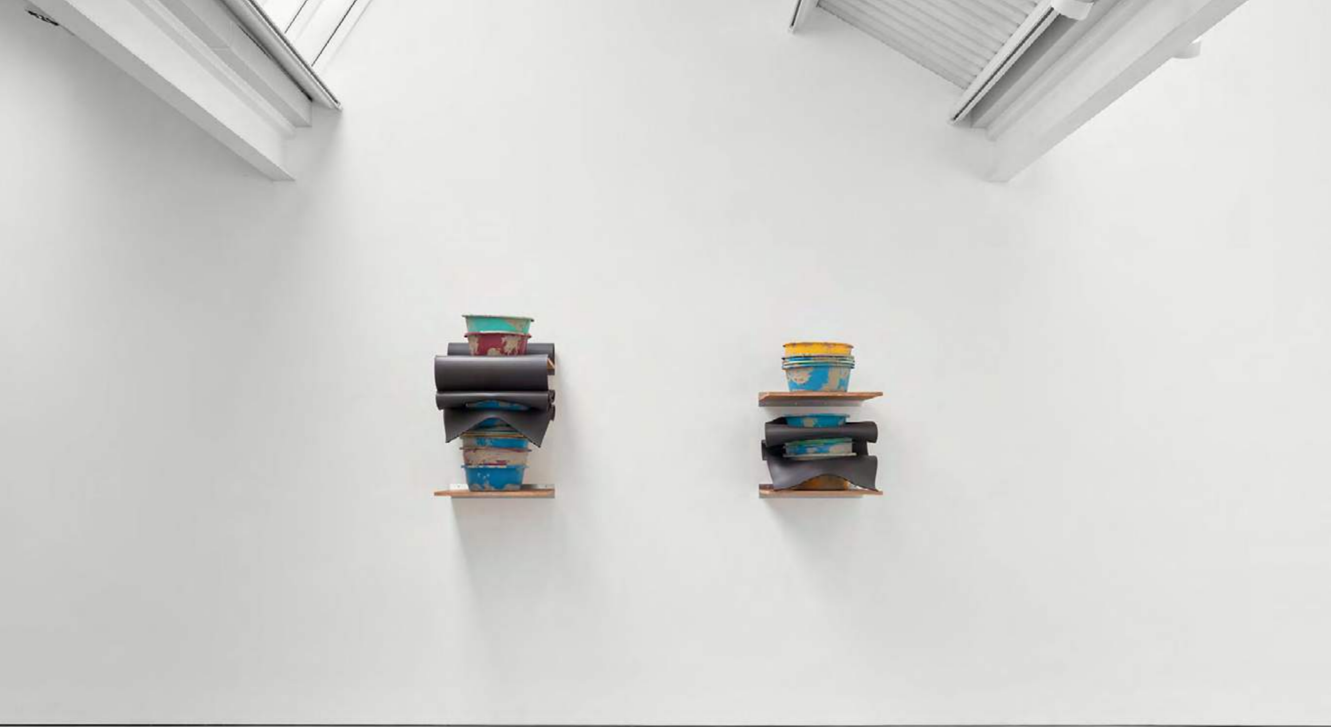
Installation view at Stuart Shave/Modern Art, London, UK, 2016 展覽現場 Stuart Shave/Modern Art, 倫敦, 英國, 2016