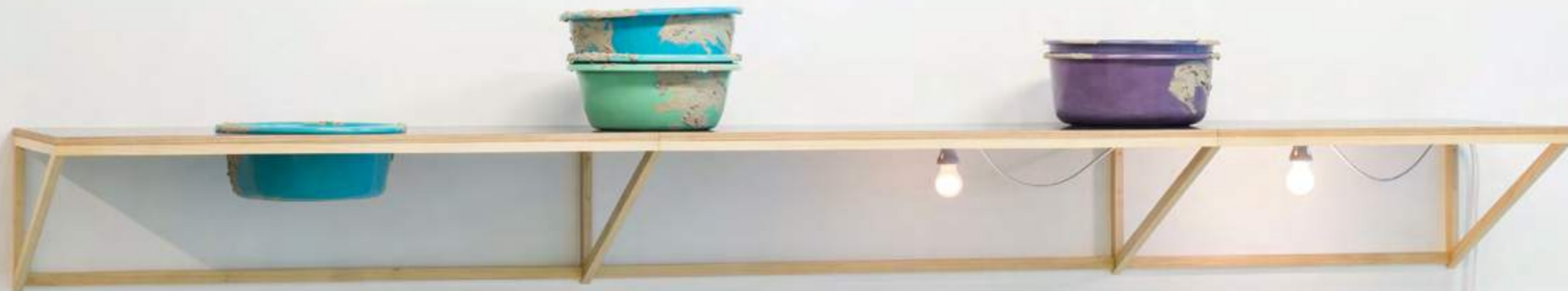
'The empties', 2018

Cast polyurethane, concrete, laminated plywood, timber, lamp holders, bulbs