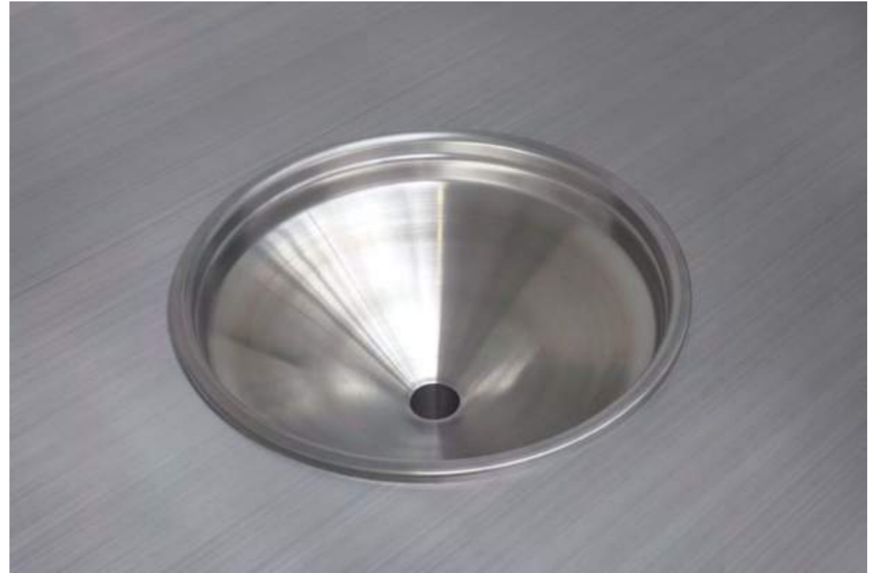
(Detail 細節) 'Guest loves host in a way like no other', 2016