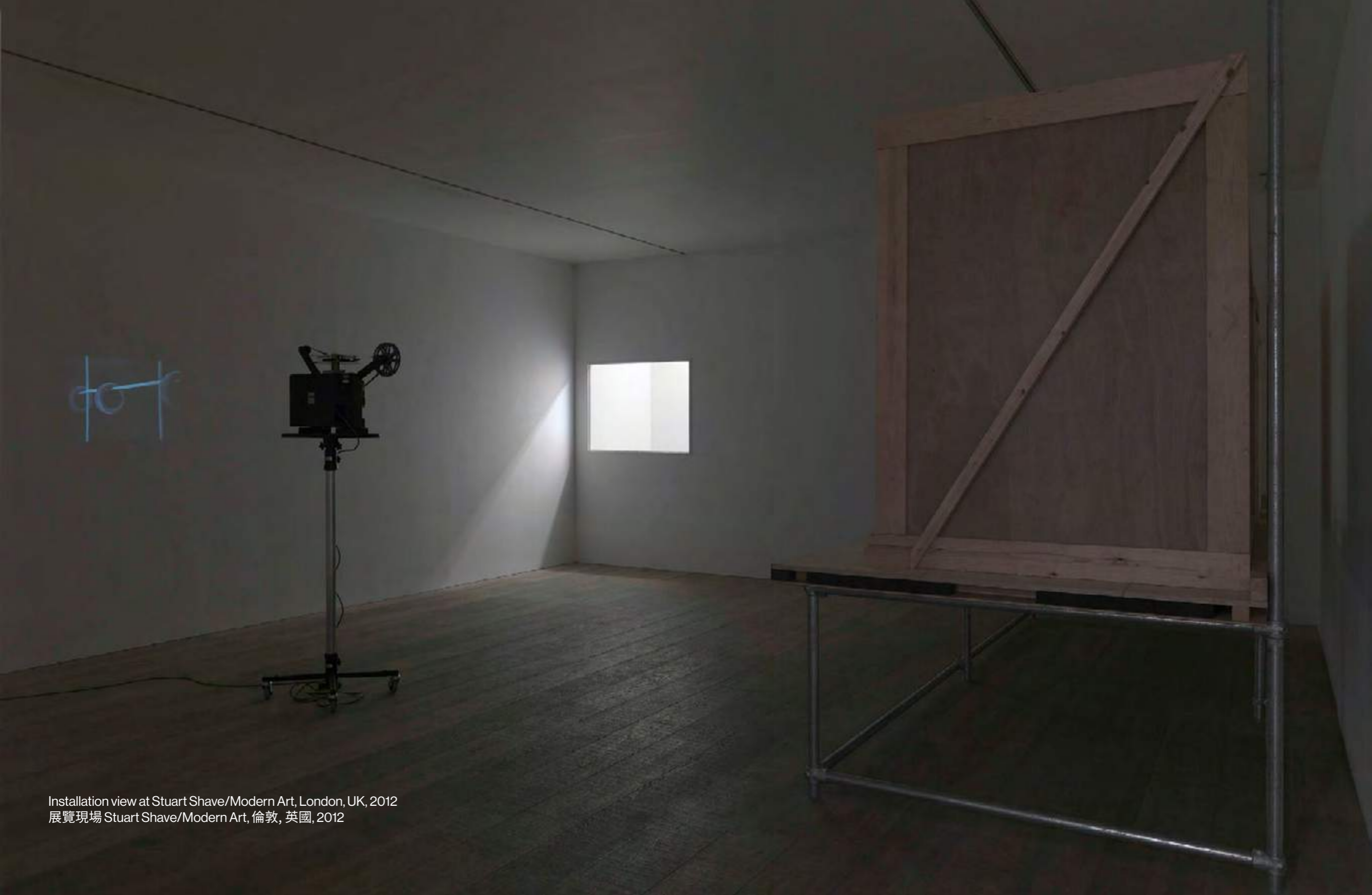
Installation view at Stuart Shave/Modern Art, London, UK, 2012 展覽現場 Stuart Shave/Modern Art, 倫敦, 英國, 2012