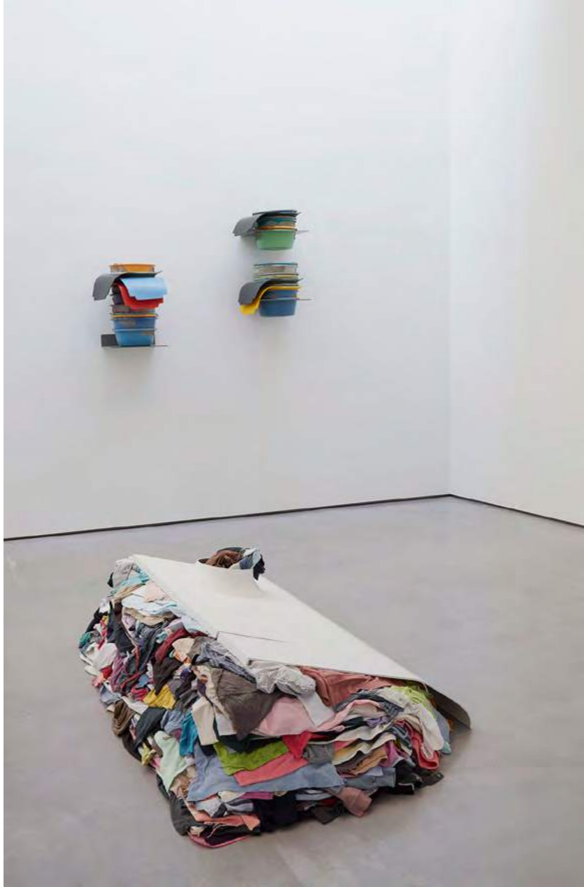
Installation View of Phillip Lai in The Hepworth Prize for Sculpture 2018. 26 October 2018 – 20 January 2019.

菲利普·賴在赫普沃斯獲獎展覽 2018展覽現場。 26.10.18-20.01.19