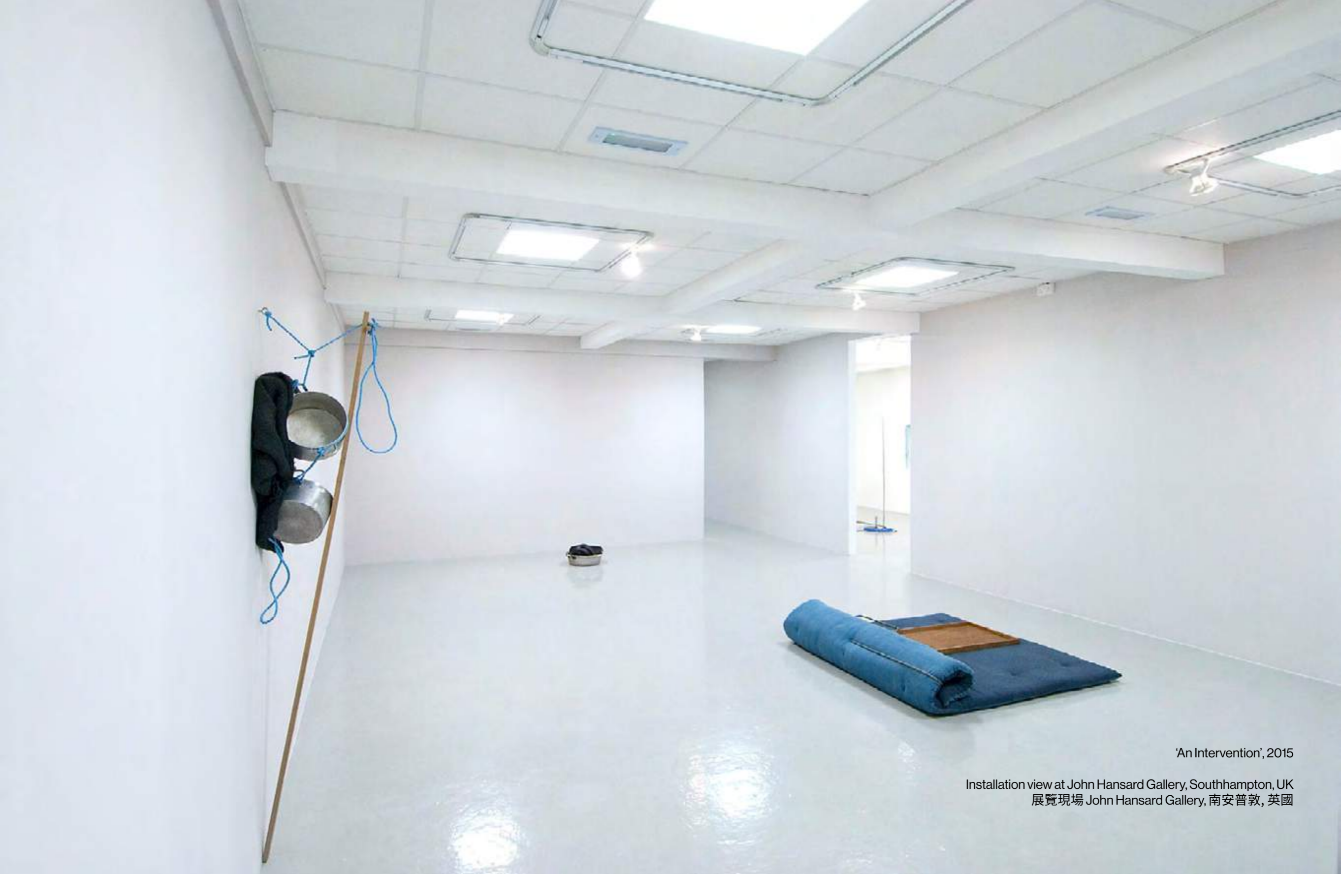
'An Intervention', 2015

Installation view at John Hansard Gallery, Southampton, UK 展覽現場 John Hansard Gallery, 南安普敦, 英國