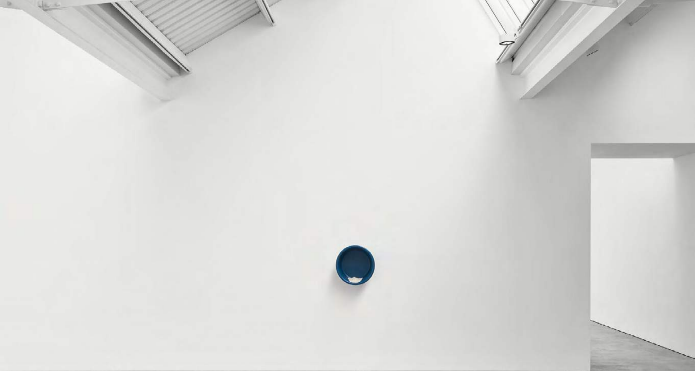
Installation view at Stuart Shave/Modern Art, London, UK, 2016 展覽現場 Stuart Shave/Modern Art, 倫敦, 英國, 2016