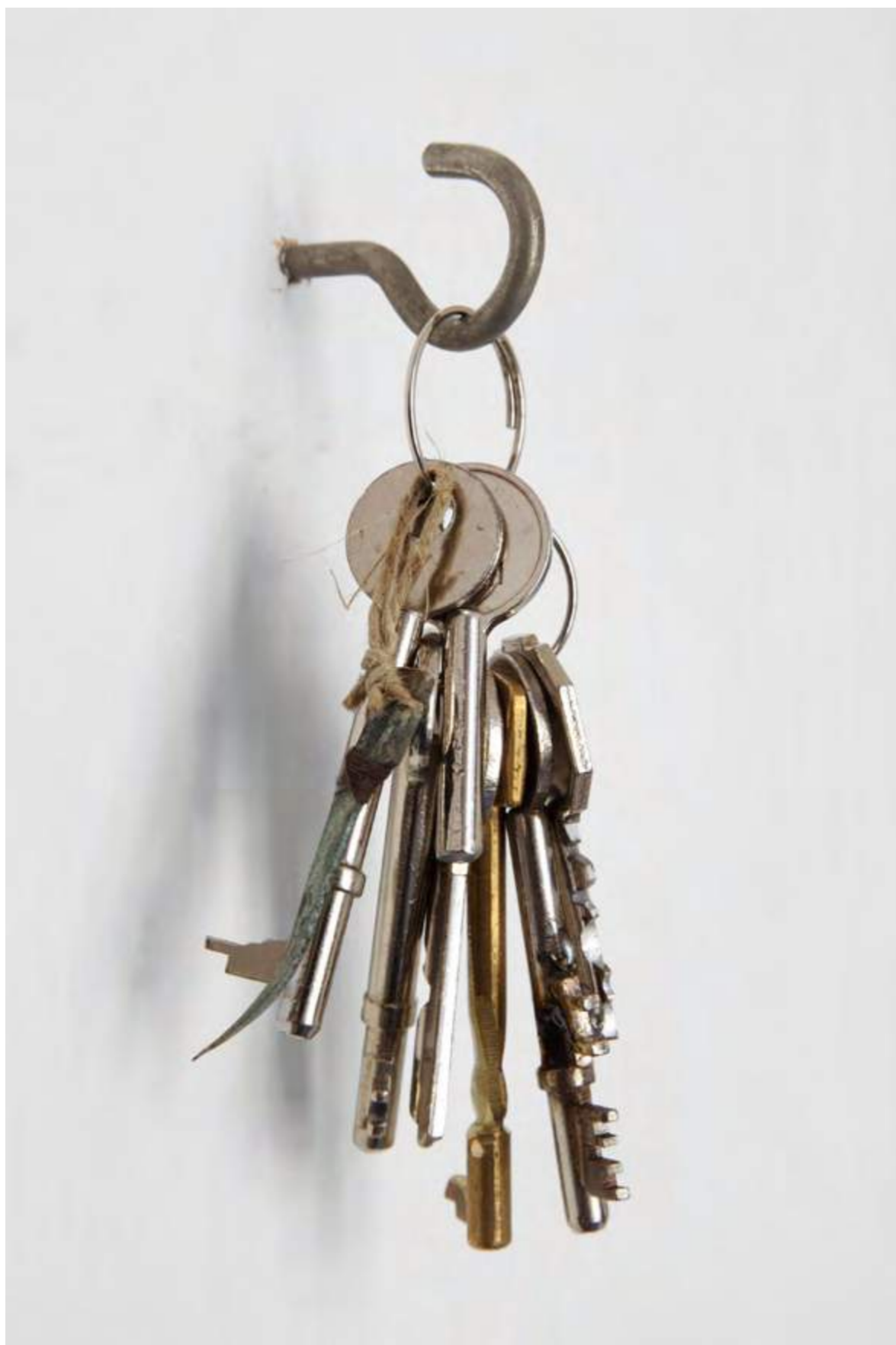
(Detail 細節) 'Untitled (keys)', 2012