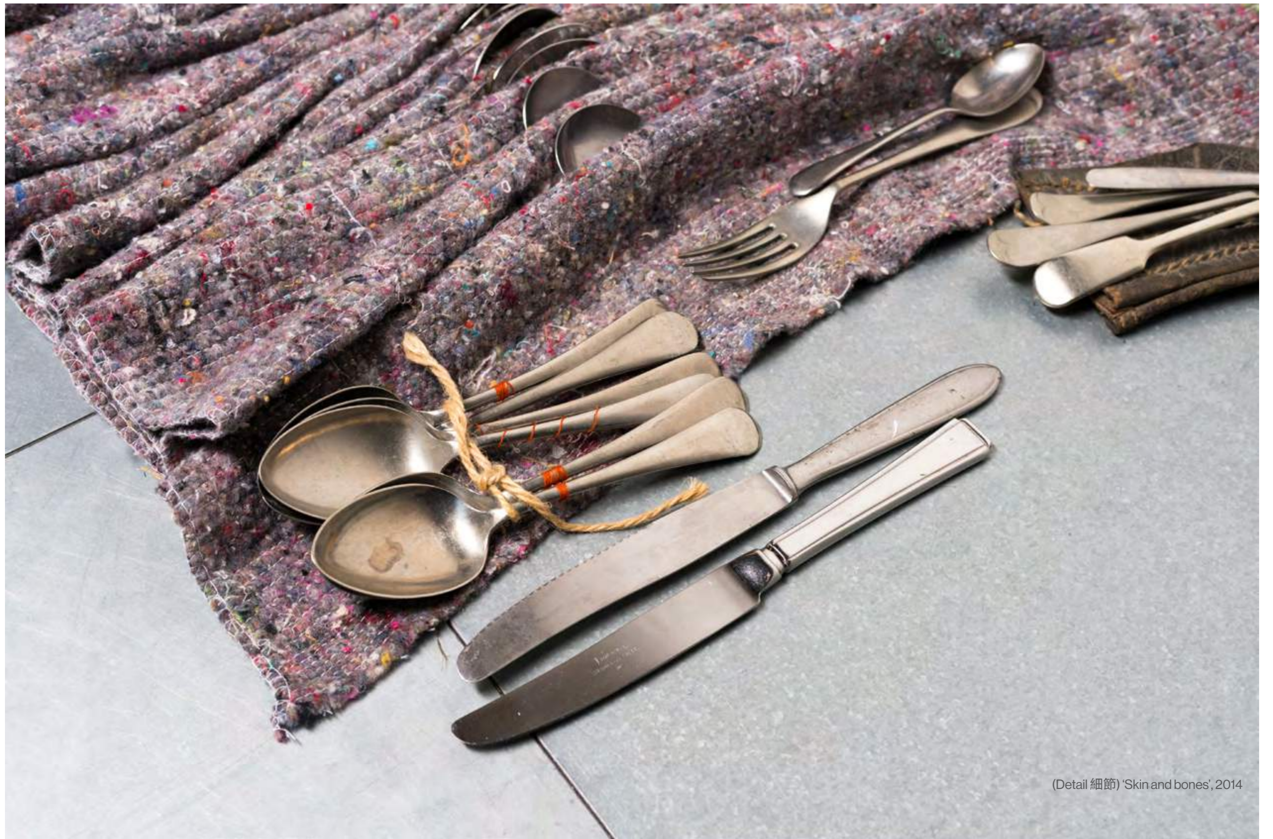
(Detail 細節) 'Skin and bones', 2014