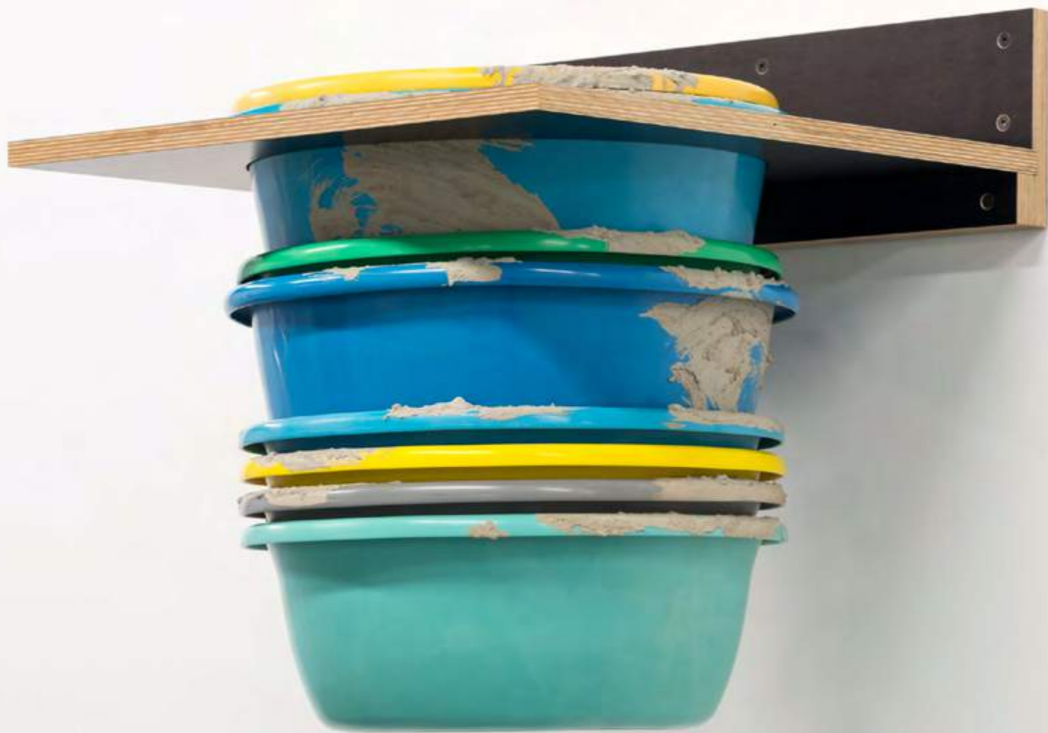
(Detail 細節) 'Untitled', 2018