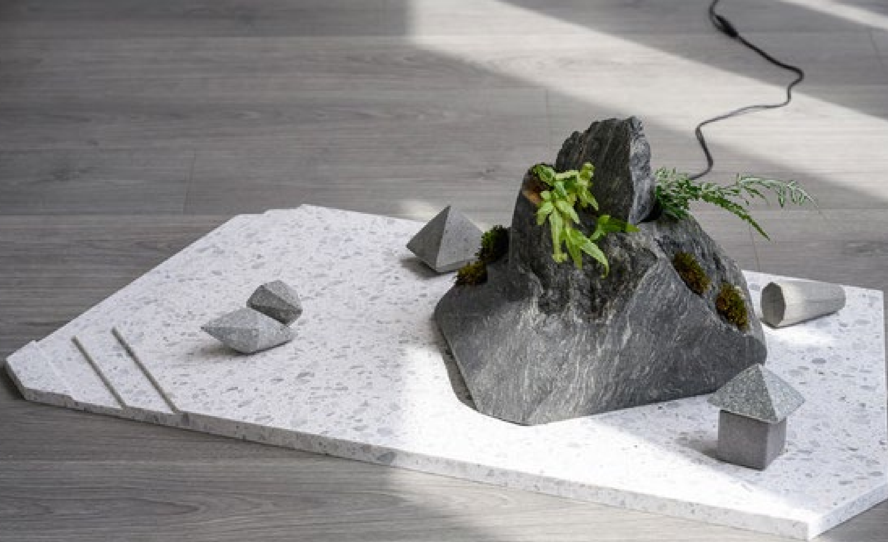
Foggy Mountain 《山雨霧》 2022

guan-yin stone , textured stone, medical stone, volcanic rock, artificial stone, organic compounds extracted from plants, atomizer 觀音石、紋石、麥飯石、火山岩、人造石、植物萃取有機化合物、水、霧化器