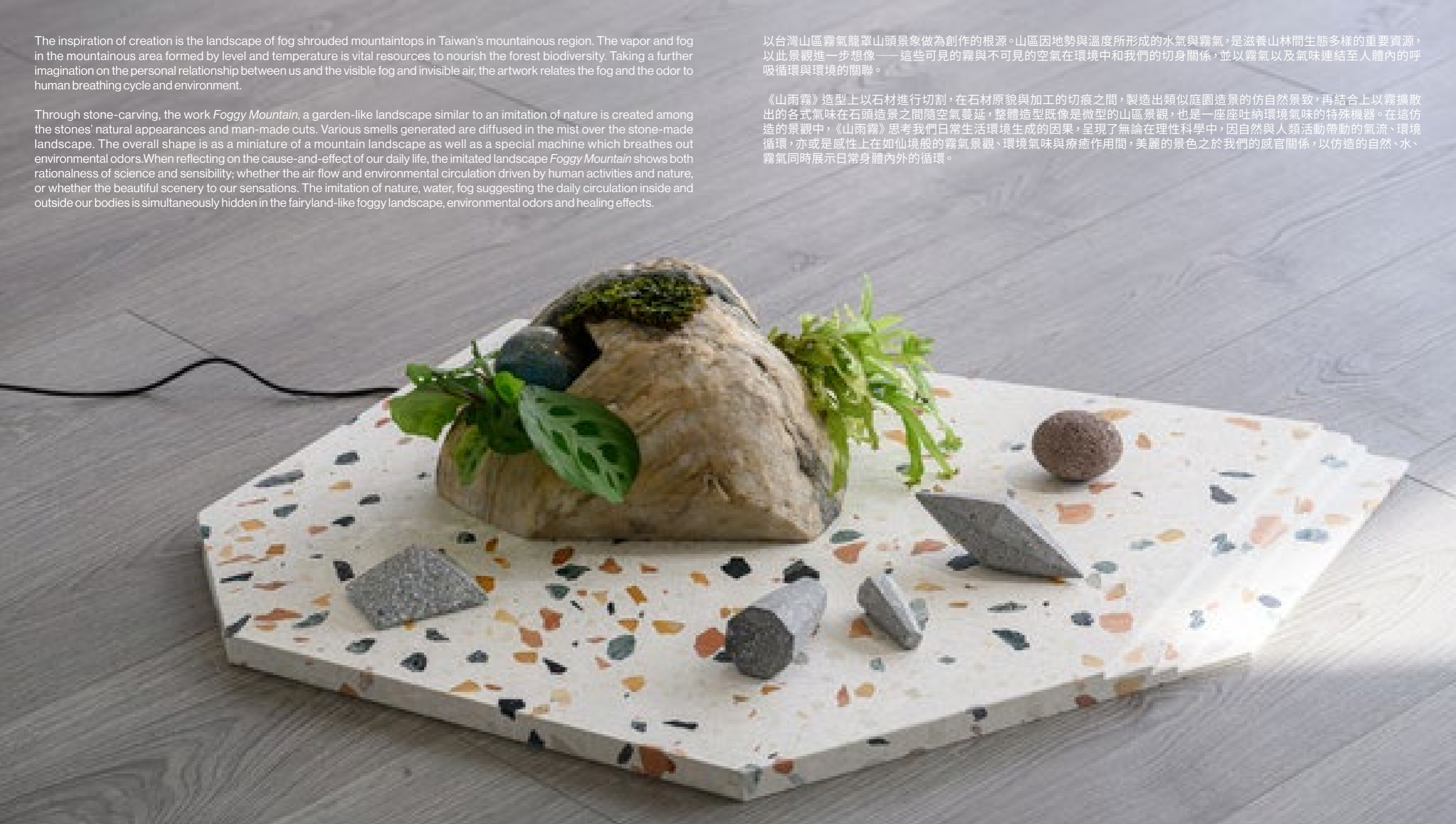
Foggy Mountain 《山雨霧》 2022

《山雨霧》造型上以石材進行切割，在石材原貌與加工的切痕之間，製造出類似庭園造景的仿自然景致，再結合上以霧擴散出的各式氣味在石頭造景之間隨空氣蔓延，整體造型既像是微型的山區景觀，也是一座座吐納環境氣味的特殊機器。在這仿造的景觀中，《山雨霧》思考我們日常生活環境生成的因果，呈現了無論在理性科學中，因自然與人類活動帶動的氣流、環境循環，亦或是感性上在如仙境般的霧氣景觀、環境氣味與療癒作用間，美麗的景色之於我們的感官關係，以仿造的自然、水、霧氣同時展示日常身體內外的循環。