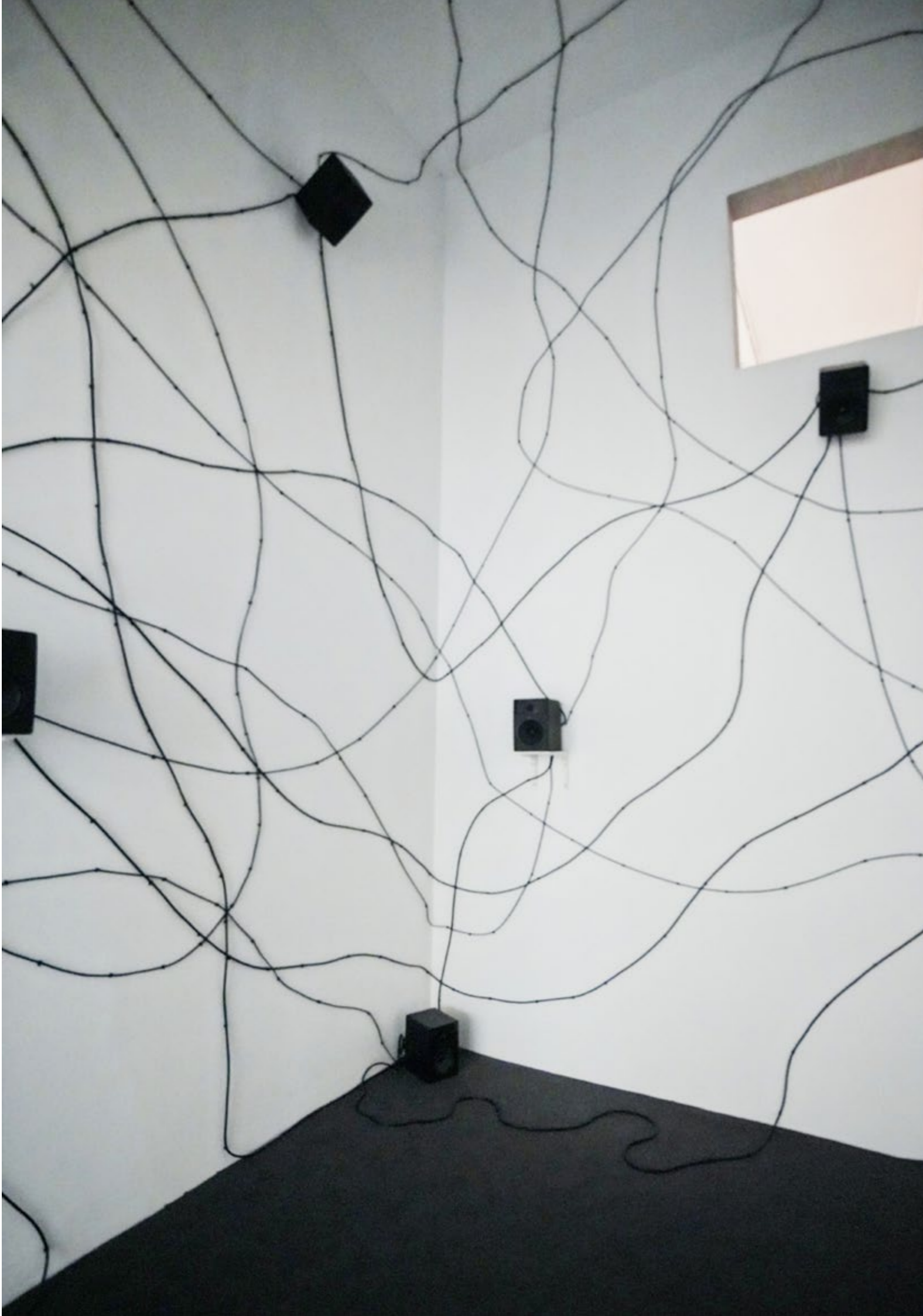
Small House 《我是一間小房子》 2021

10-channel sound installation, dimensions variable 10 聲道聲音裝置，尺寸因空間而異