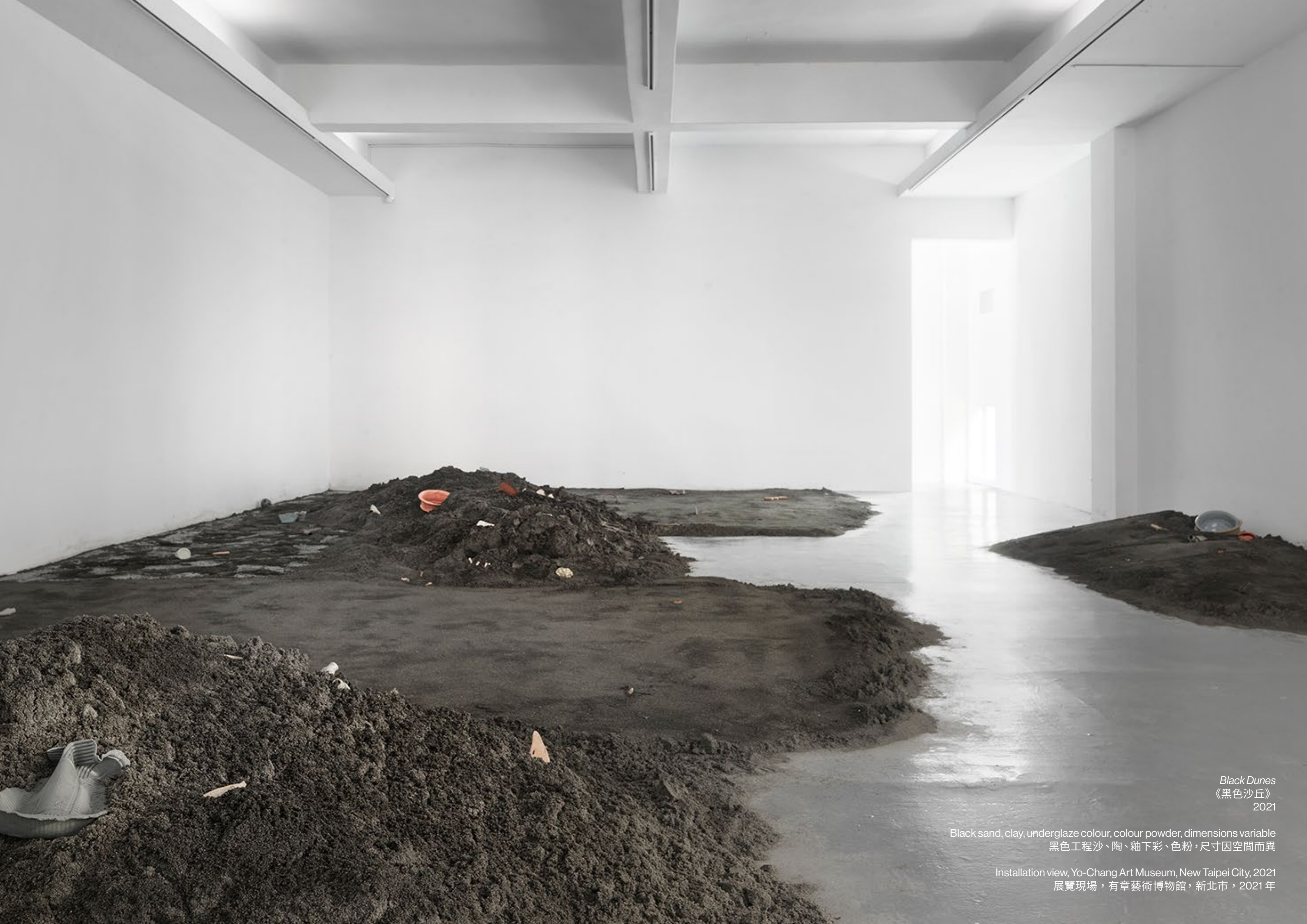
Black Dunes 《黑色沙丘》 2021

Black sand, clay, underglaze colour, colour powder, dimensions variable 黑色工程沙、陶、釉下彩、色粉，尺寸因空間而異