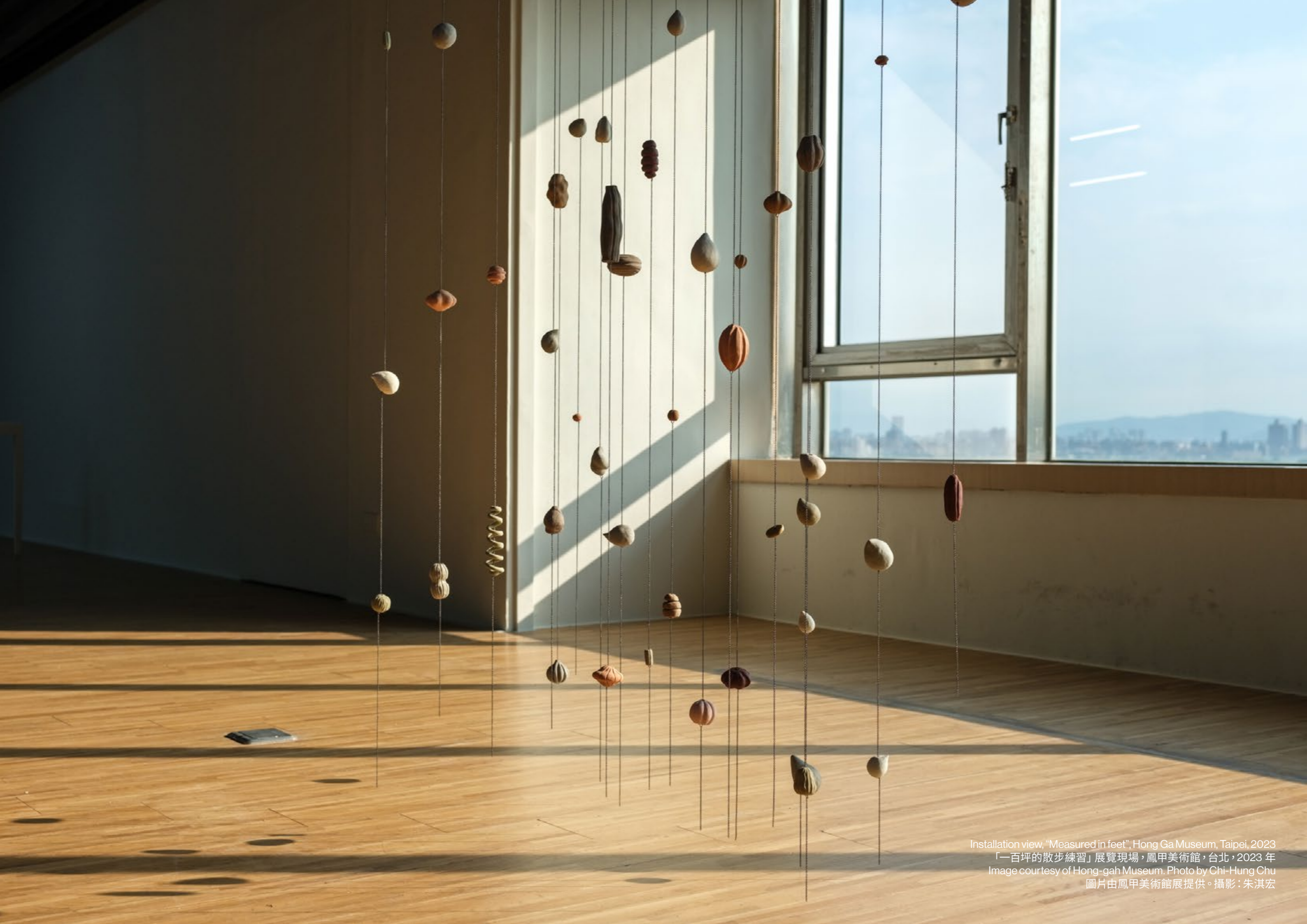
Installation view, "Measured in feet", Hong Ga Museum, Taipei, 2023 「一百坪的散步練習」展覽現場，鳳甲美術館，台北，2023 年