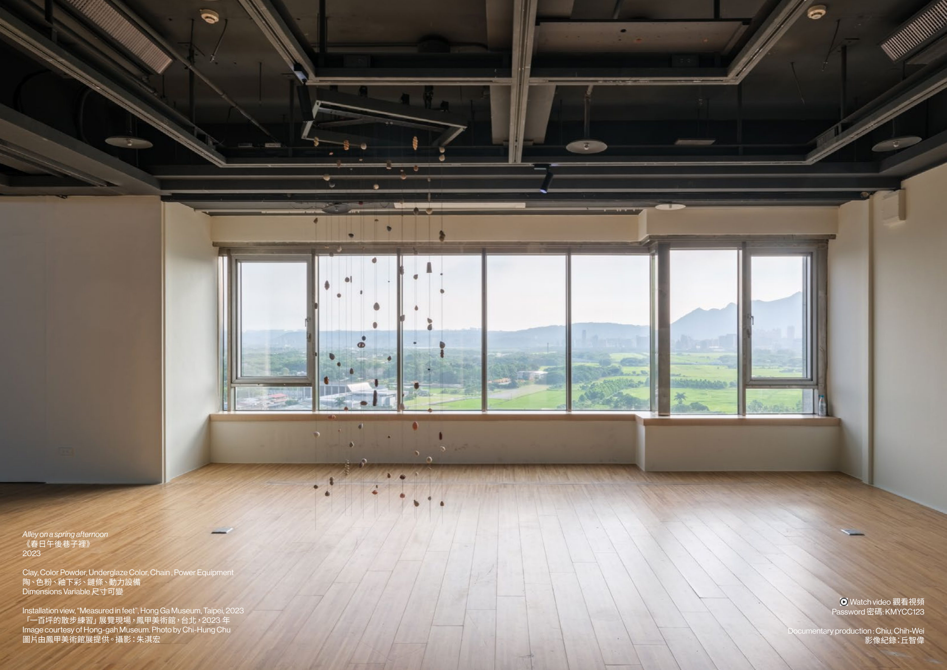
Alley on a spring afternoon 《春日午後巷子裡》 2023

Clay, Color Powder, Underglaze Color, Chain, Power Equipment 陶、色粉、釉下彩、鏈條、動力設備 Dimensions Variable 尺寸可變