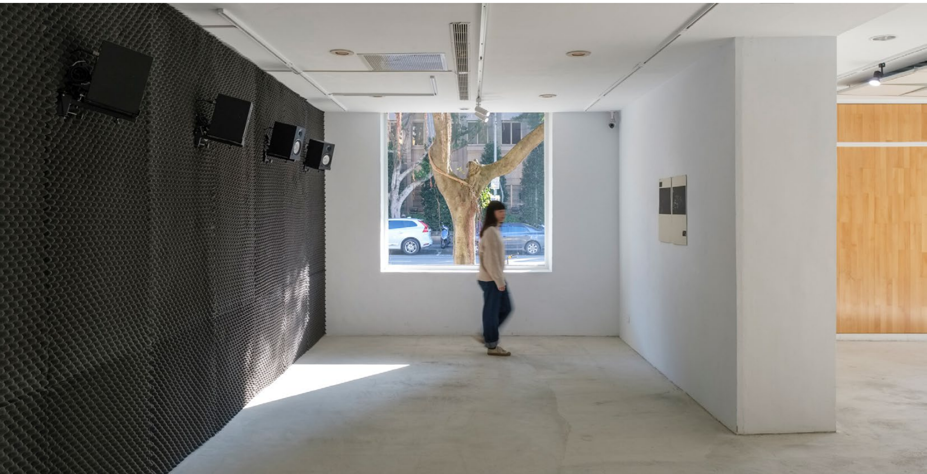
The Rhythm Inside 每個人的身體裡都有一段旋律 2021