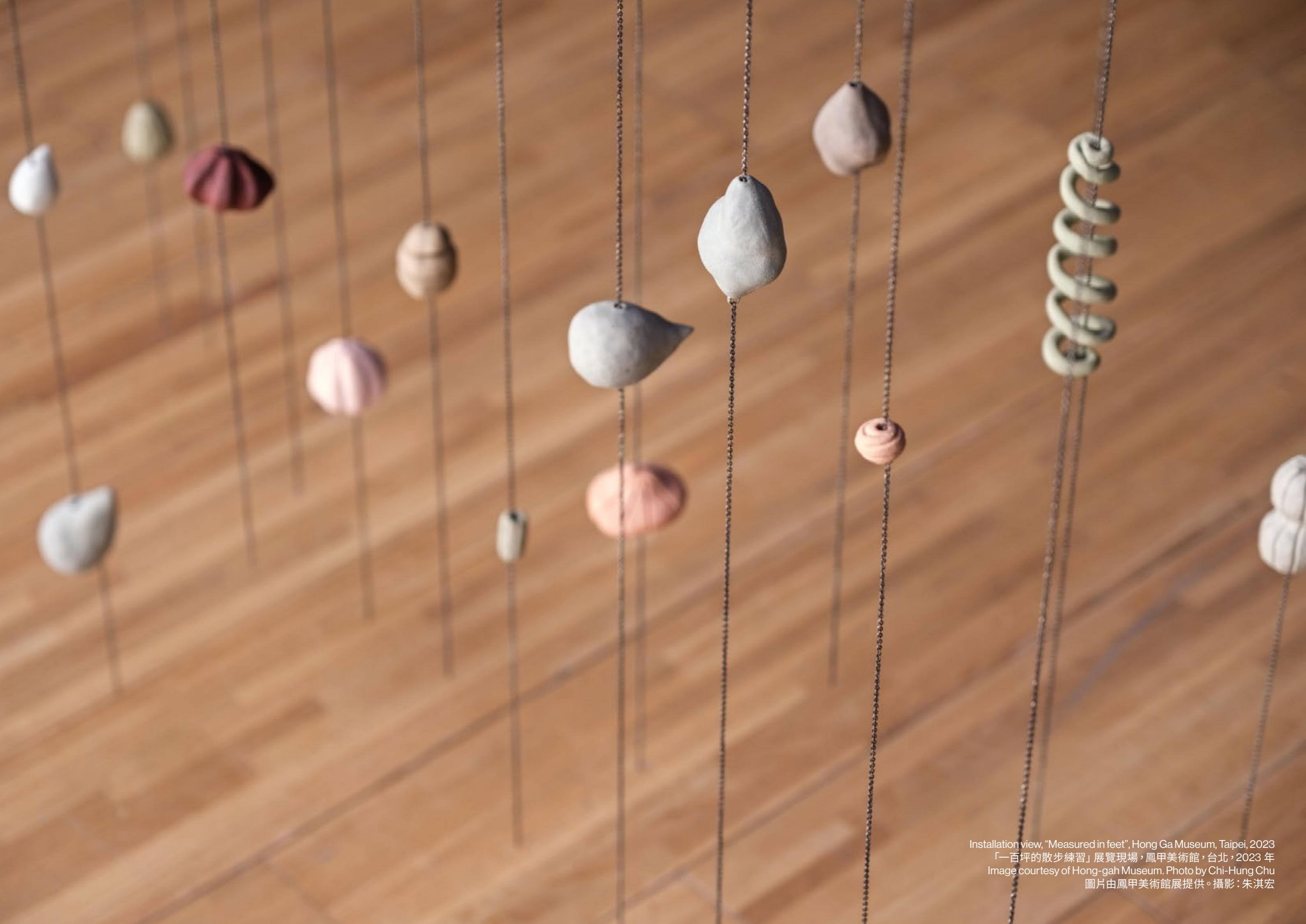
Installation view, "Measured in feet", Hong Ga Museum, Taipei, 2023 「一百坪的散步練習」展覽現場，鳳甲美術館，台北，2023 年