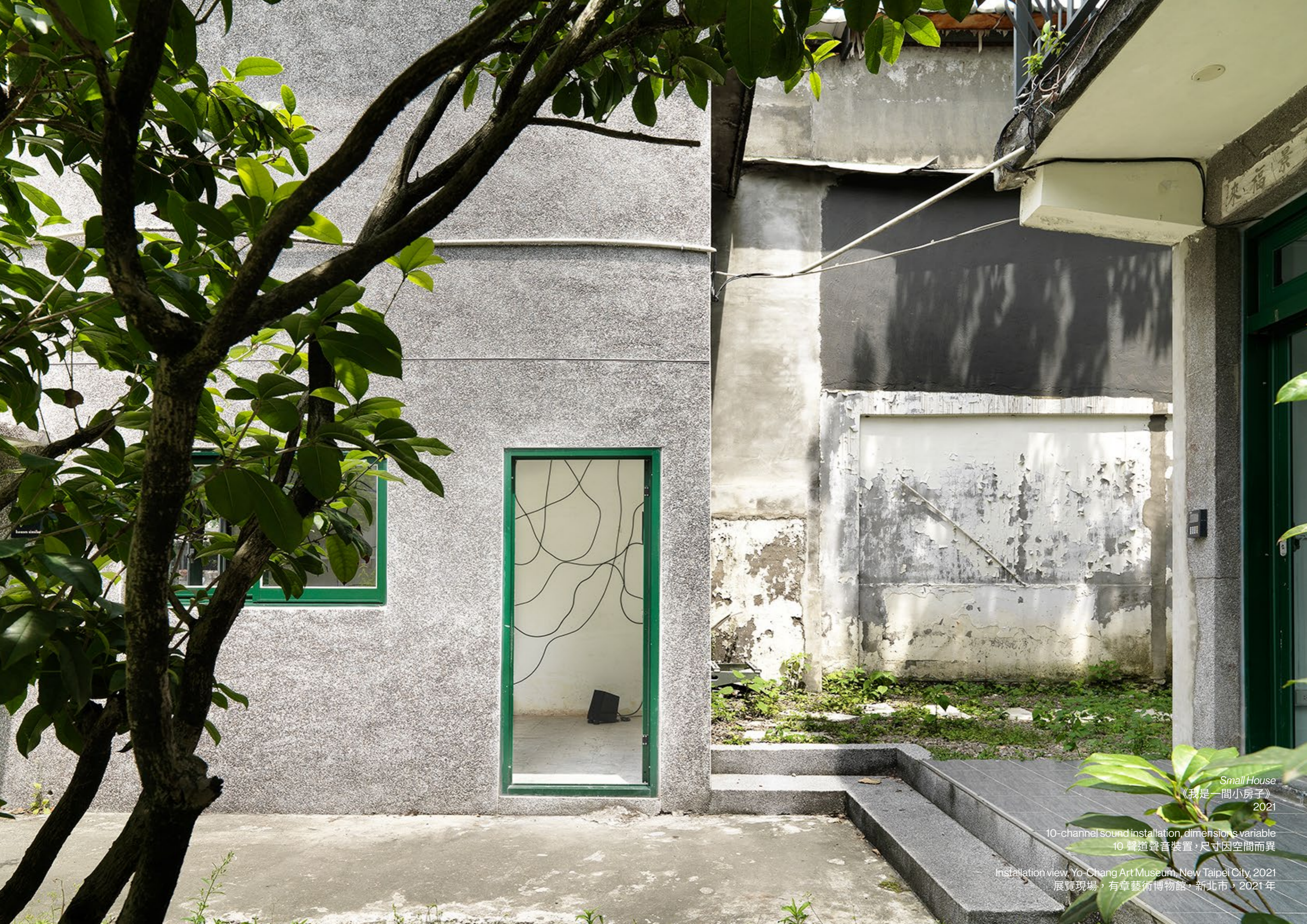
Small House 《我是一間小房子》 2021

10-channel sound installation, dimension's variable 10 聲道聲音裝置，尺寸因空間而異