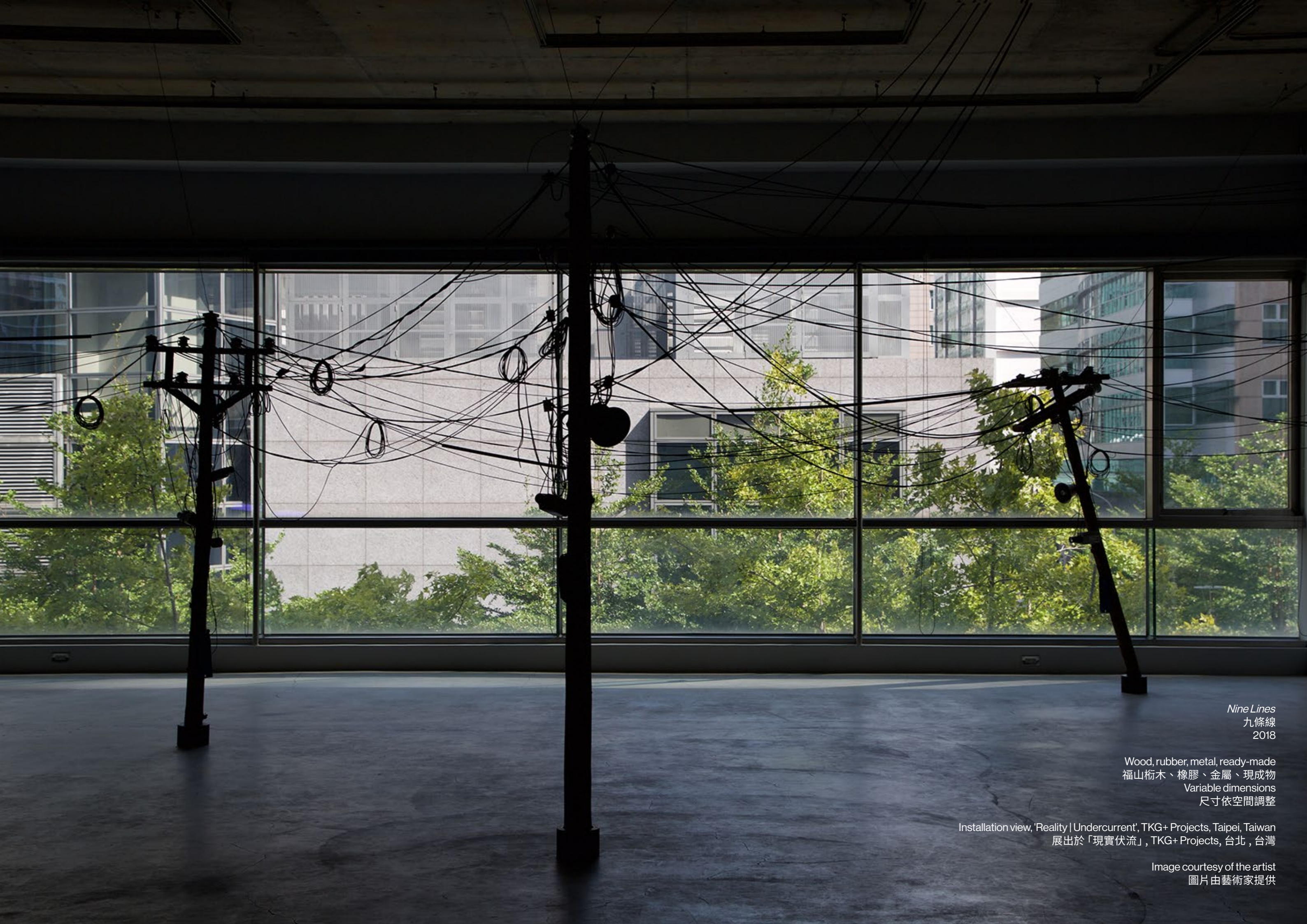
Nine Lines 九條線 2018

Wood, rubber, metal, ready-made 福山桁木、橡膠、金屬、現成物 Variable dimensions 尺寸依空間調整