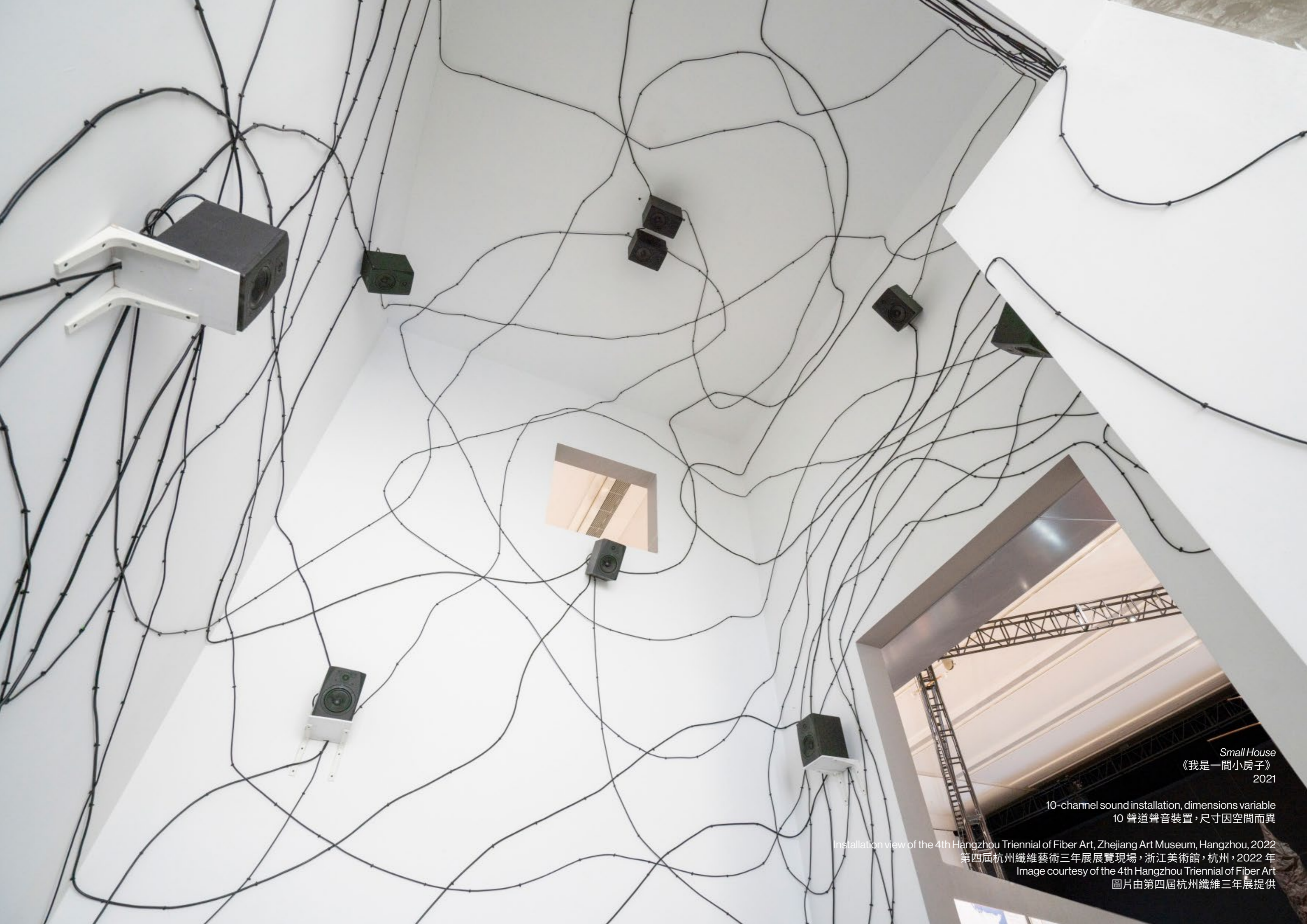
Small House 《我是一間小房子》 2021

10-channel sound installation, dimensions variable 10 聲道聲音裝置，尺寸因空間而異