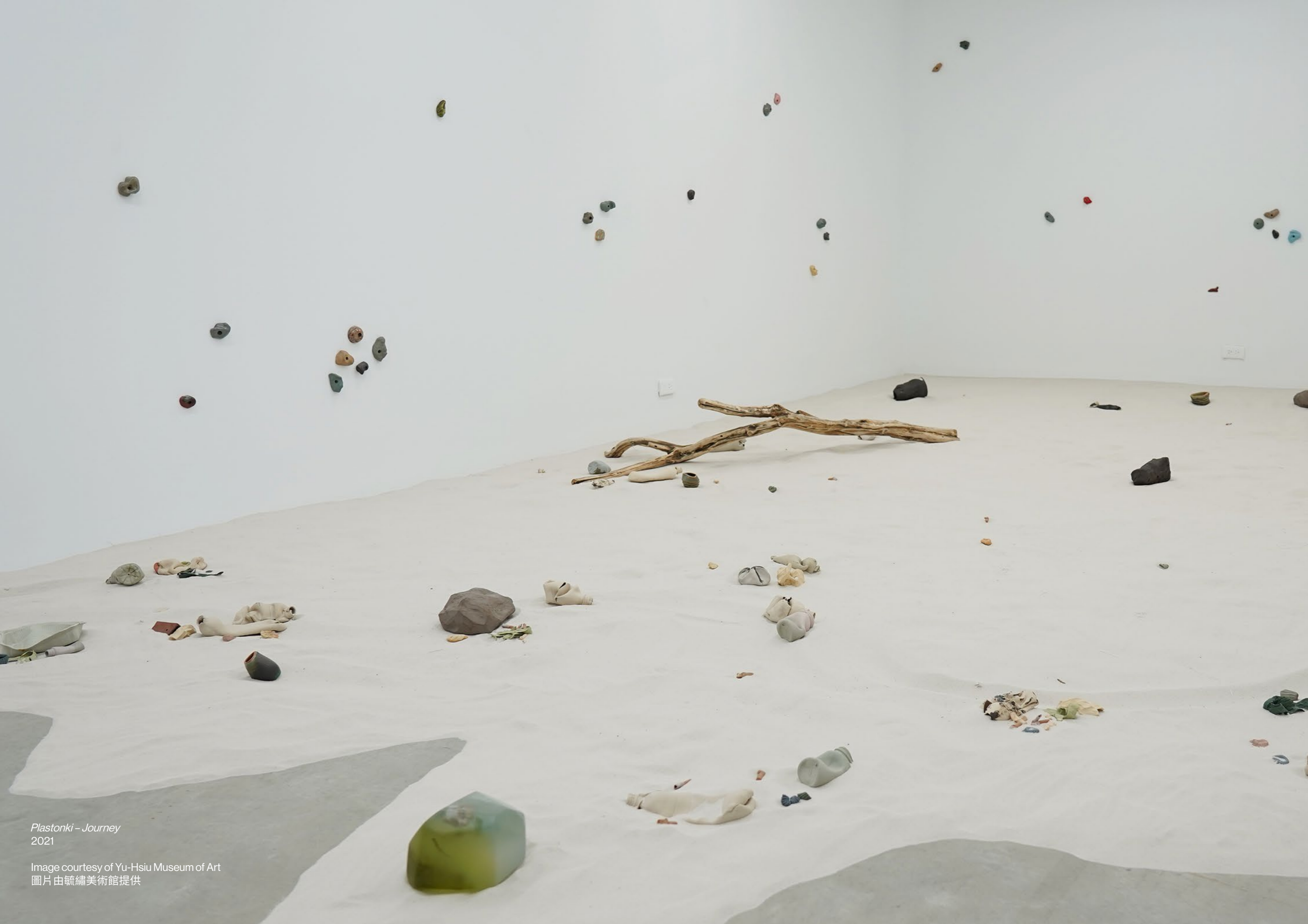
Plastonki - Journey 2021