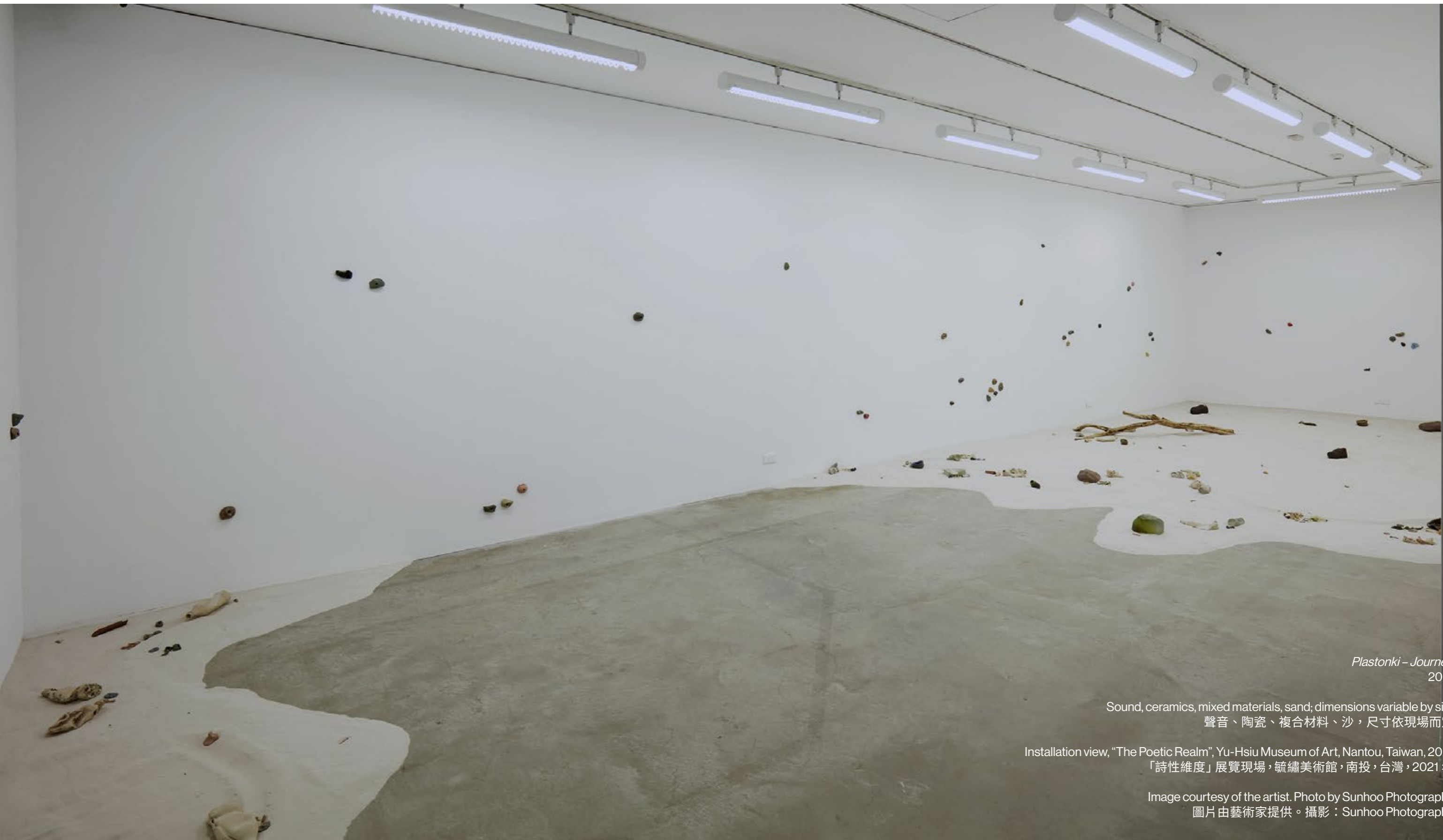
Plastonki - Journey 2021

Sound, ceramics, mixed materials, sand; dimensions variable by site 聲音、陶瓷、複合材料、沙，尺寸依現場而定