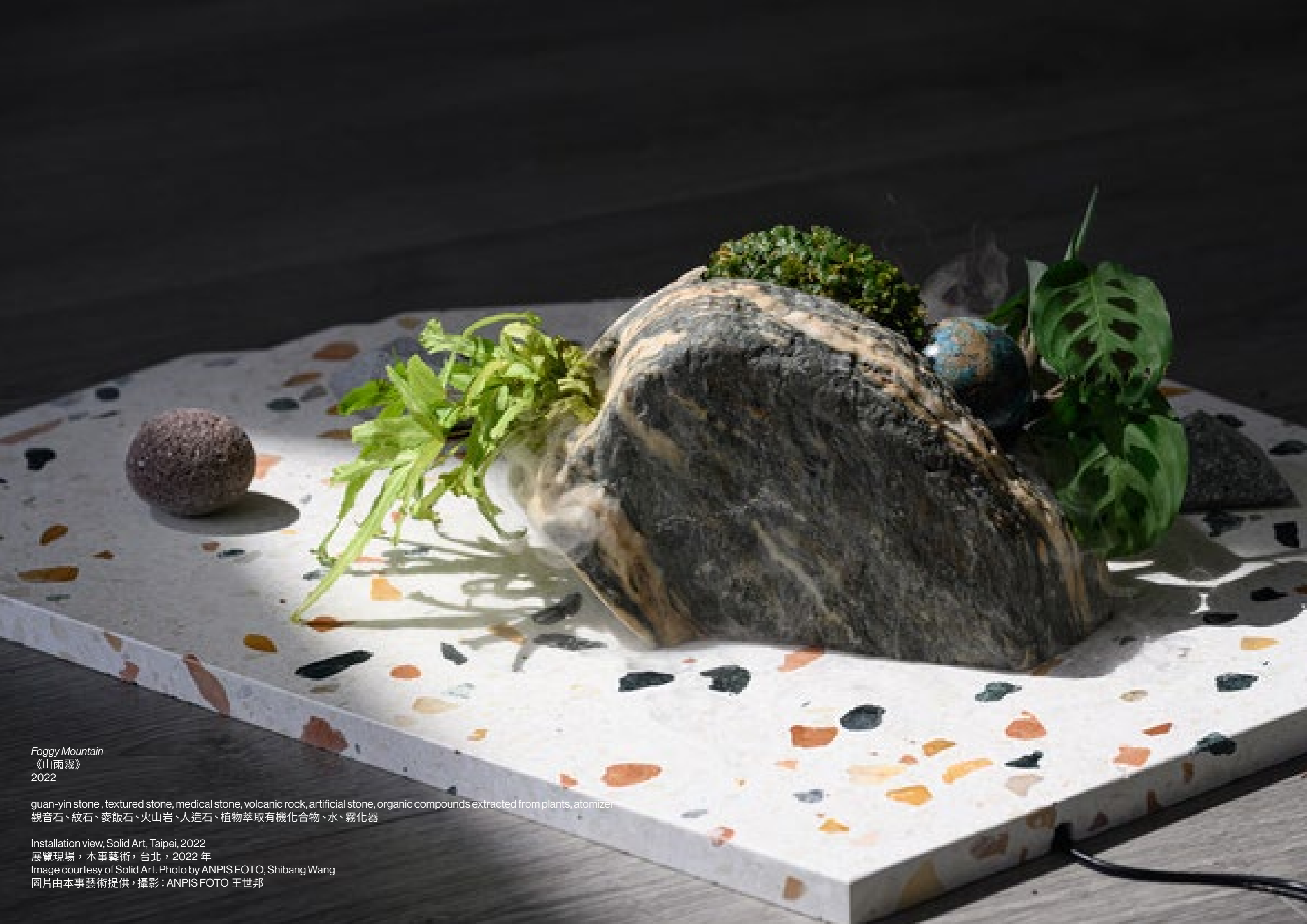
Foggy Mountain 《山雨霧》 2022

guan-yin stone , textured stone, medical stone, volcanic rock, artificial stone, organic compounds extracted from plants, atomizer 觀音石、紋石、麥飯石、火山岩、人造石、植物萃取有機化合物、水、霧化器