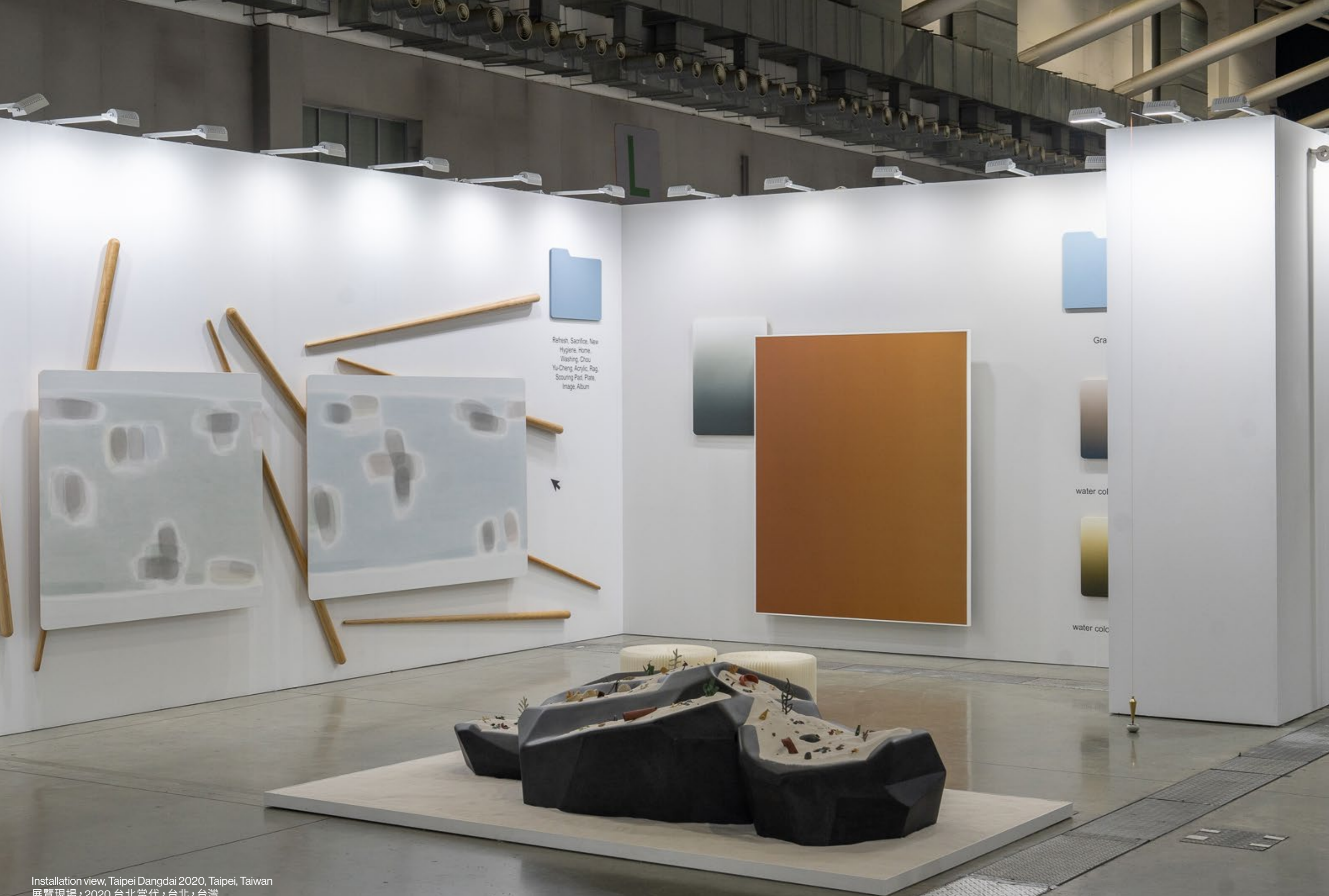
Installation view, Taipei Dangdai 2020, Taipei, Taiwan 展覽現場，2020 台北當代，台北，台灣