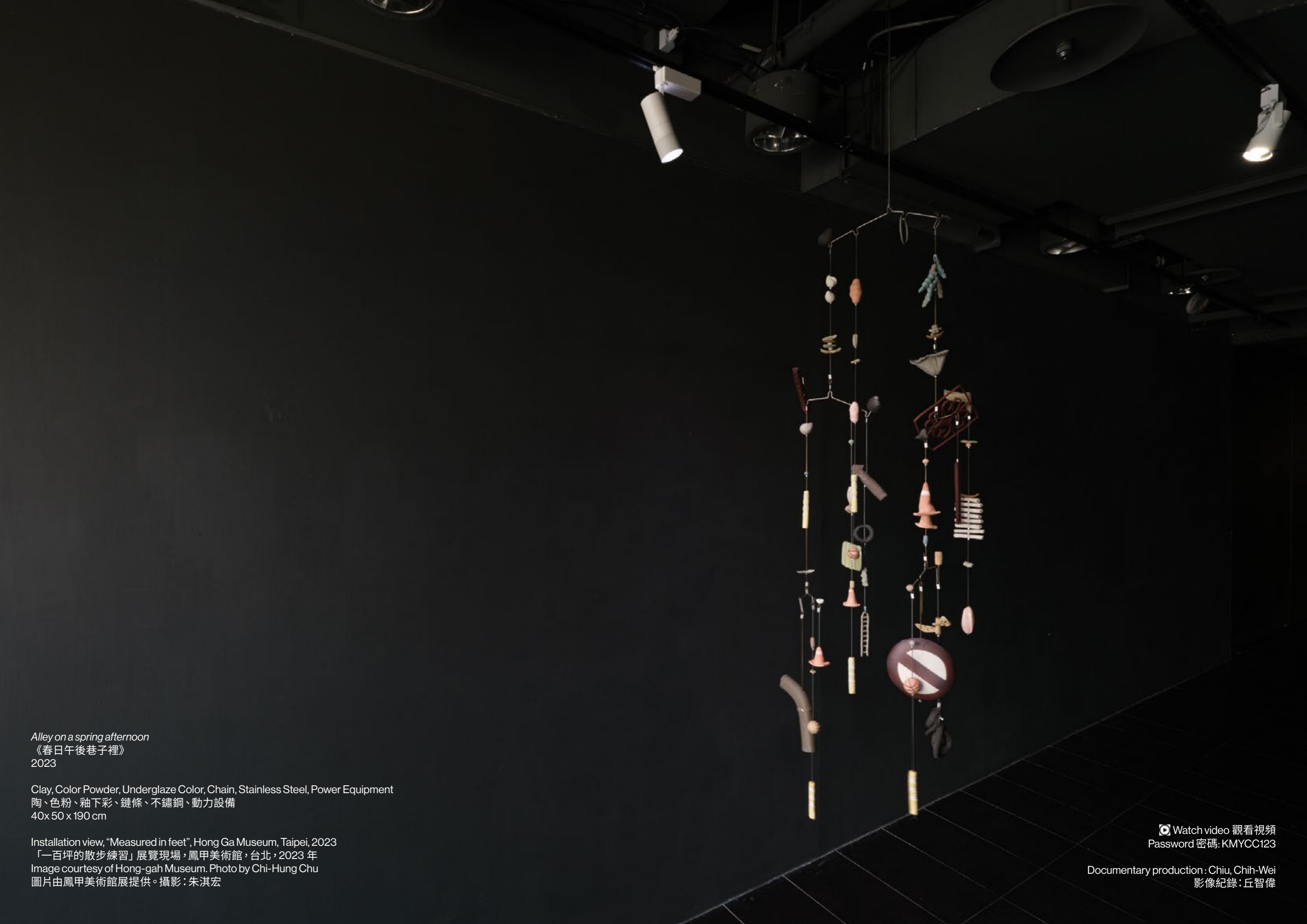
Alley on a spring afternoon 《春日午後巷子裡》 2023

Clay, Color Powder, Underglaze Color, Chain, Stainless Steel, Power Equipment 陶、色粉、釉下彩、鏈條、不鏽鋼、動力設備 40x 50 x 190 cm