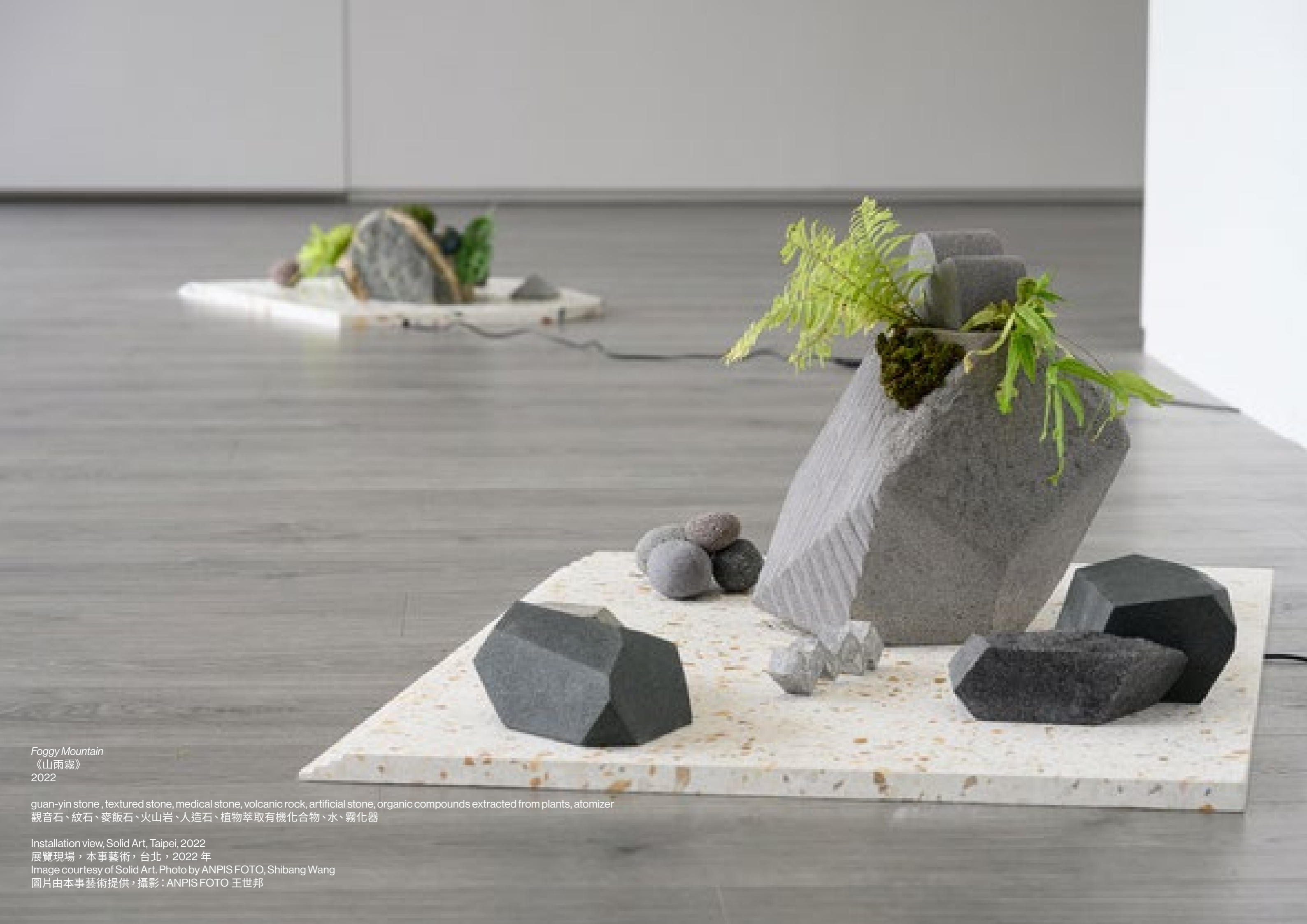
Foggy Mountain 《山雨霧》 2022

guan-yin stone , textured stone, medical stone, volcanic rock, artificial stone, organic compounds extracted from plants, atomizer 觀音石、紋石、麥飯石、火山岩、人造石、植物萃取有機化合物、水、霧化器