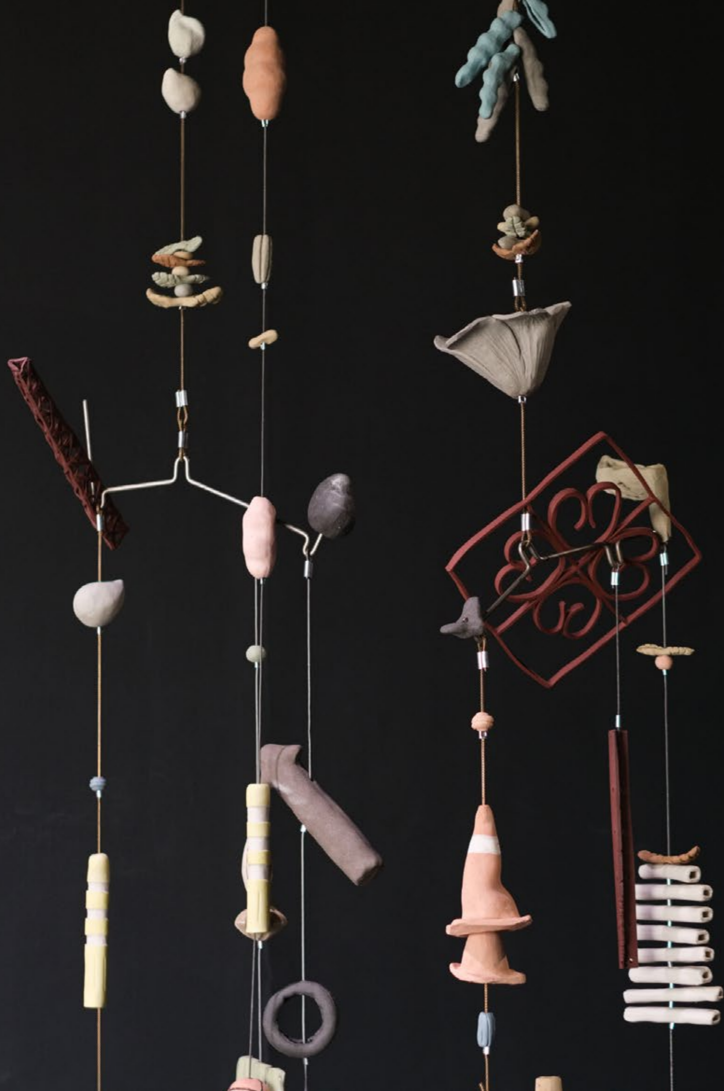
Installation view, "Measured in feet", Hong Ga Museum, Taipei, 2023 「一百坪的散步練習」展覽現場，鳳甲美術館，台北，2023 年