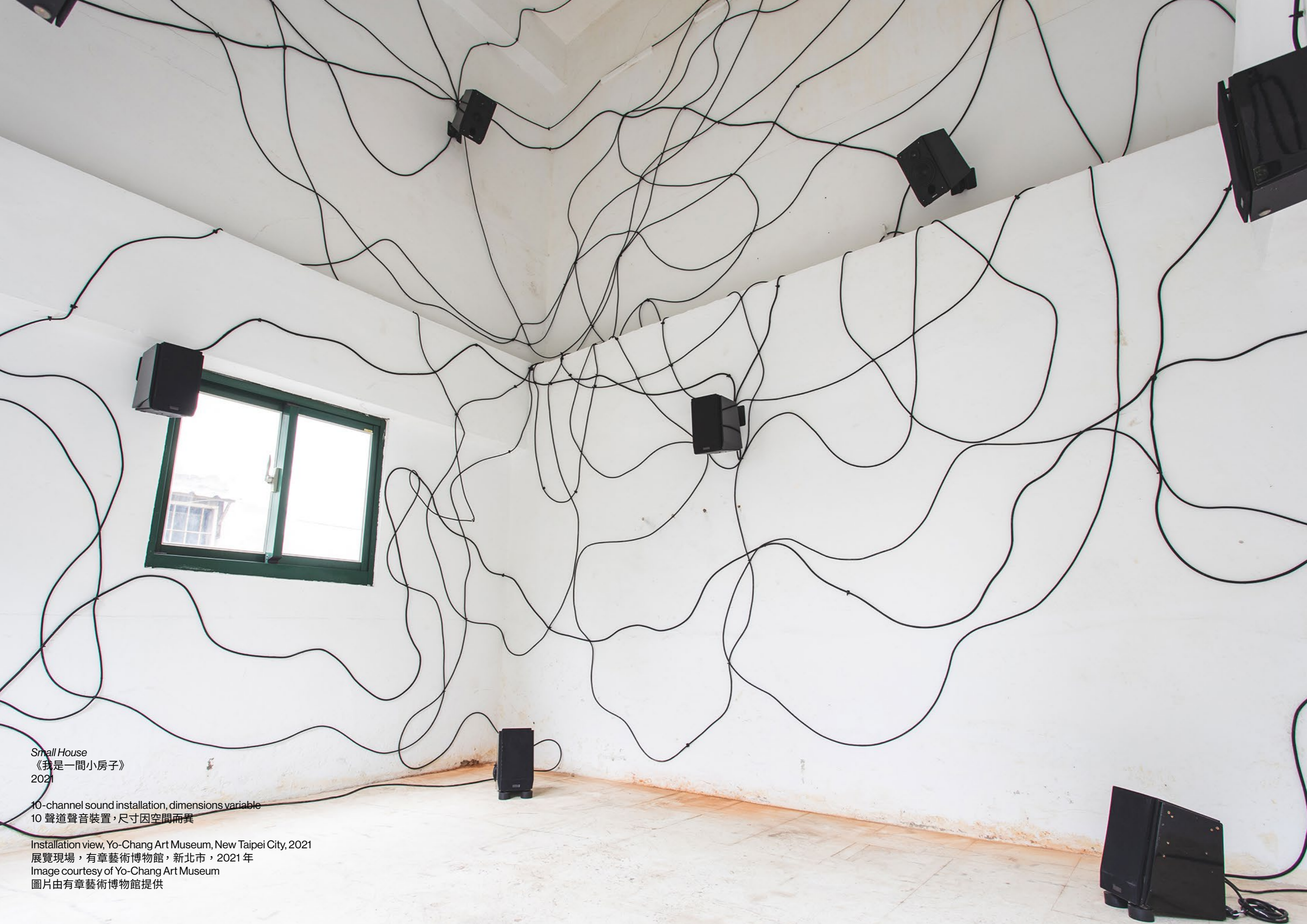
Small House 《我是一間小房子》 2021

10-channel sound installation, dimensions variable 10 聲道聲音裝置，尺寸因空間而異