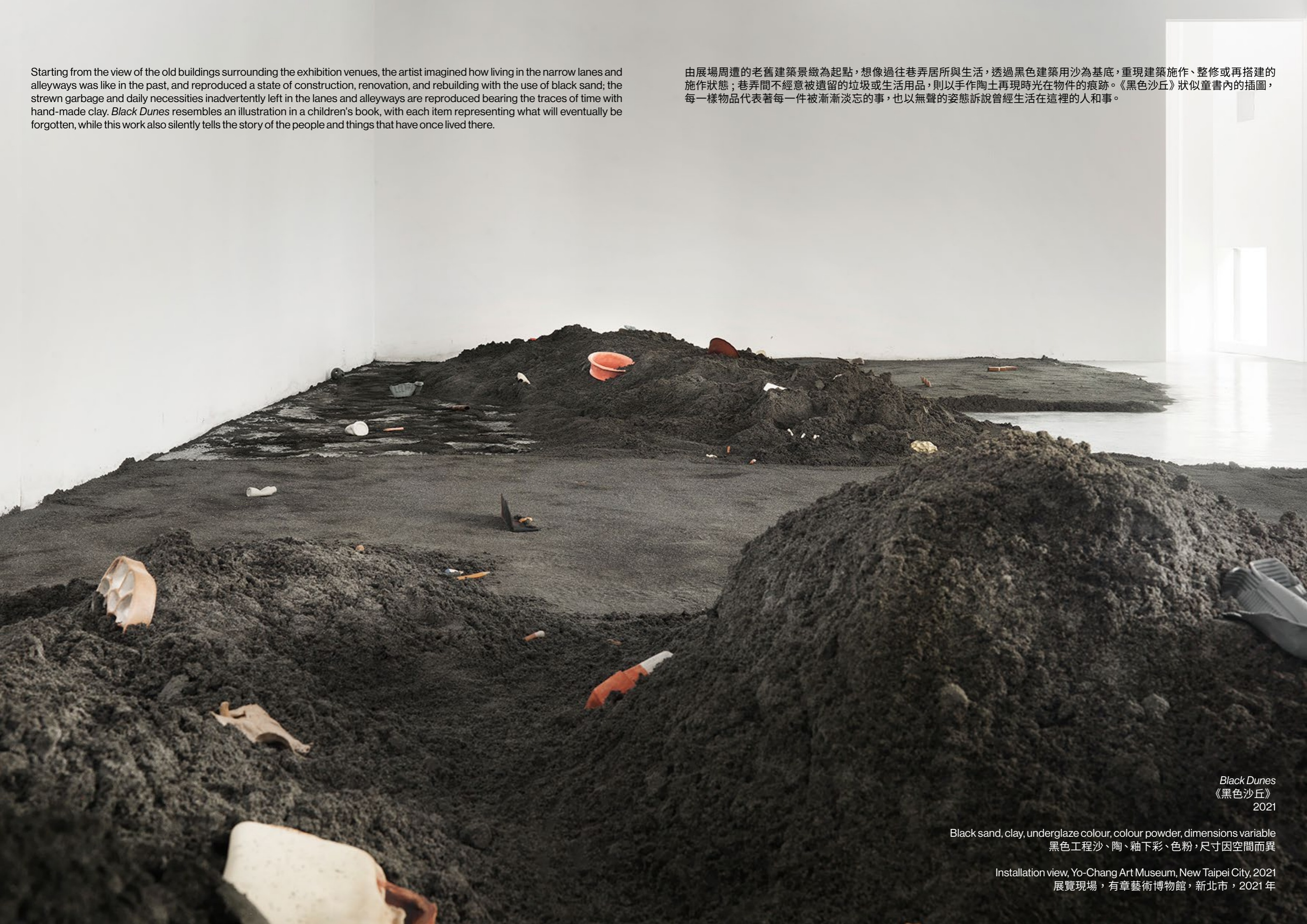
Black Dunes 《黑色沙丘》 2021

由展場周遭的老舊建築景緻為起點，想像過往巷弄居所與生活，透過黑色建築用沙為基底，重現建築施作、整修或再搭建的施作狀態；巷弄間不經意被遺留的垃圾或生活用品，則以手作陶土再現時光在物件的痕跡。《黑色沙丘》狀似童書內的插圖，每一樣物品代表著每一件被漸漸淡忘的事，也以無聲的姿態訴說曾經生活在這裡的人和事。