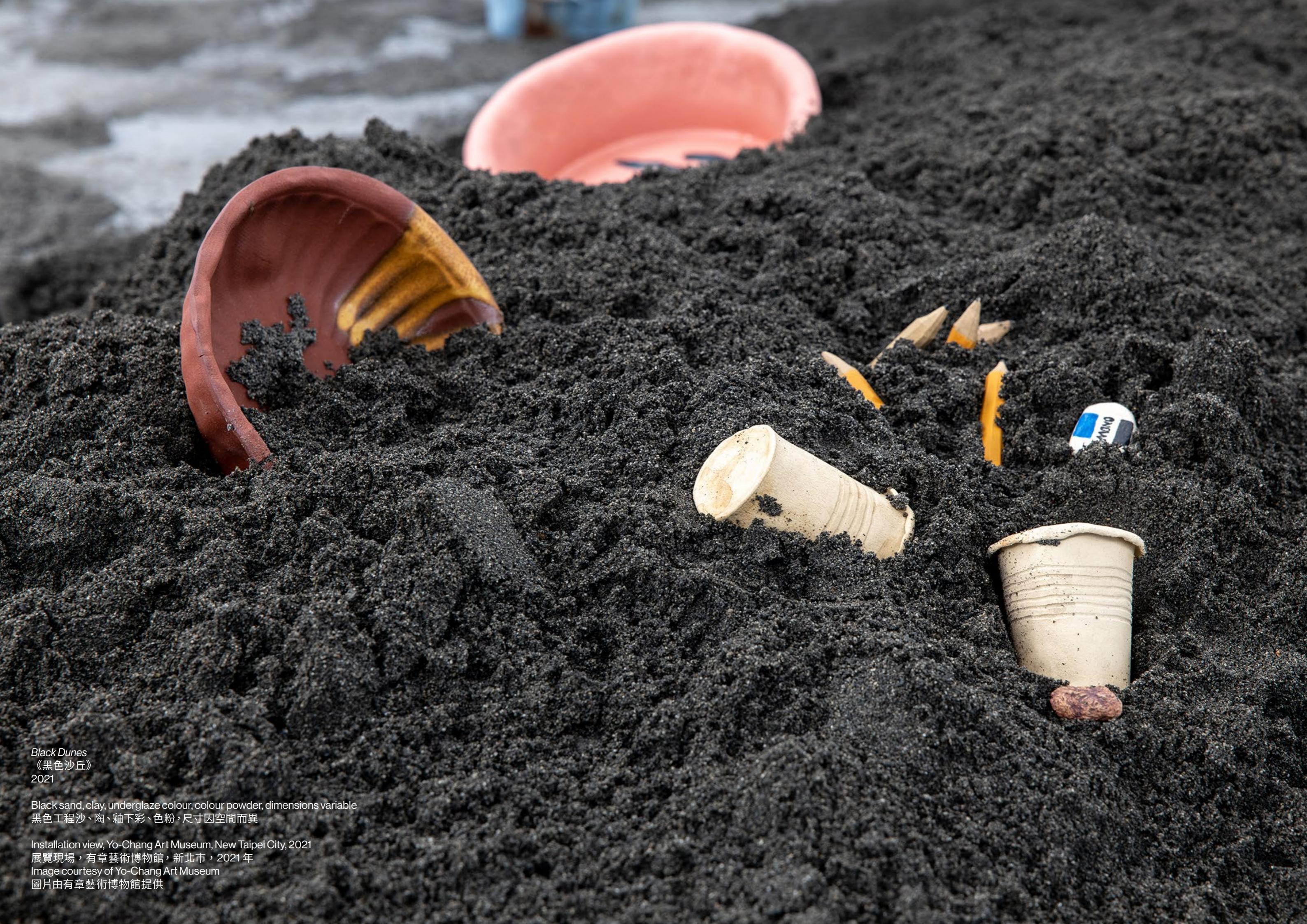
Black Dunes 《黑色沙丘》 2021

Black sand, clay, underglaze colour, colour powder, dimensions variable 黑色工程沙、陶、釉下彩、色粉，尺寸因空間而異