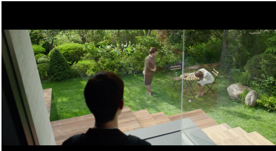
Scene from Bong Joon Ho's Parasite (image courtesy Bong Joon Ho and CJ Entertainment).

Like the Parasite home, Kyung-Me's rooms induce anxiety through the illusion of openness and transparency. Modern architects such as Le Corbusier and Frank Lloyd Wright originally favored the "open plan" concept for its possibility and sociability; openness was freedom. Now, the concept of unpartitioned expanses mainly signals moneyed taste; openness implies a free market. Open floor designs are apparently falling out of favor in the United States, in part, because homeowners complain that too much is on display . The vitrine-like showroom offers more opportunities to be surveilled in your own home. Some who can afford it have begun to ameliorate the pressure for a home to be both lived in and not appear lived in by duplicating communal areas. For example, a main open kitchen will disguise a smaller "mess kitchen," indicating a regression into old classist (and gendered) divisions between servant's and master's quarters. The capitalist private realm is so haunted by crowdsourced idealism, at the mercy of international (in the case of Parasite , Western) scrutiny and judgement, that it can only be sustained by a malignant split. A highly staged, cosmetic home masks a separate, operational phantom home. The irony of the Parasite house, and what we are led to speculate about Kyung-Me's rooms, is that its surface-level perfection only articulates its failure at its most basic function, which is keeping its occupants safe.