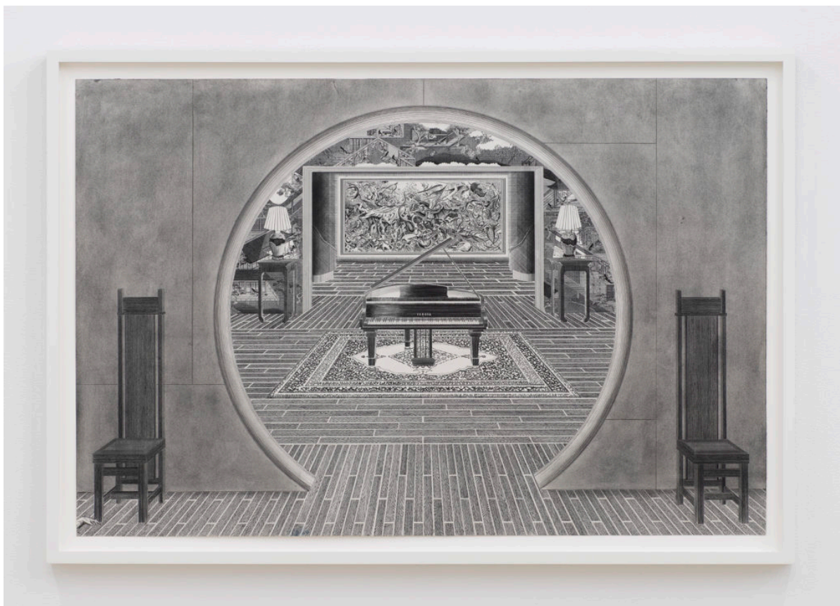
Kyung-Me, Papillon de Nuit V , 2019. Ink, charcoal and graphite on Arches paper 23 5/8 × 35 3/4 in.

When viewing works by Kyung-Me and Harry Gould Harvey IV in Coniunctio , I could not help but recall an early, relatively innocuous scene in Parasite . In the film, the camera introduces us to a sleeping architectural beast by first gliding through a stately entryway that opens into the foot of the stairs, before pivoting from the sitting room to the dining area to show the building's full girth in one take. Kiwoo, who hails from more meager means, looks breathlessly upward, outside the frame, indicating that there is still more to be admired. Later, we will witness this admiration for the abode not dissipate, but rather transform into something more sinister. As we follow Kiwoo's stare into an exquisite abyss, we too are filled with ineluctable greed that leeches away our self-control, and we watch it bleed into the texture of a scene.