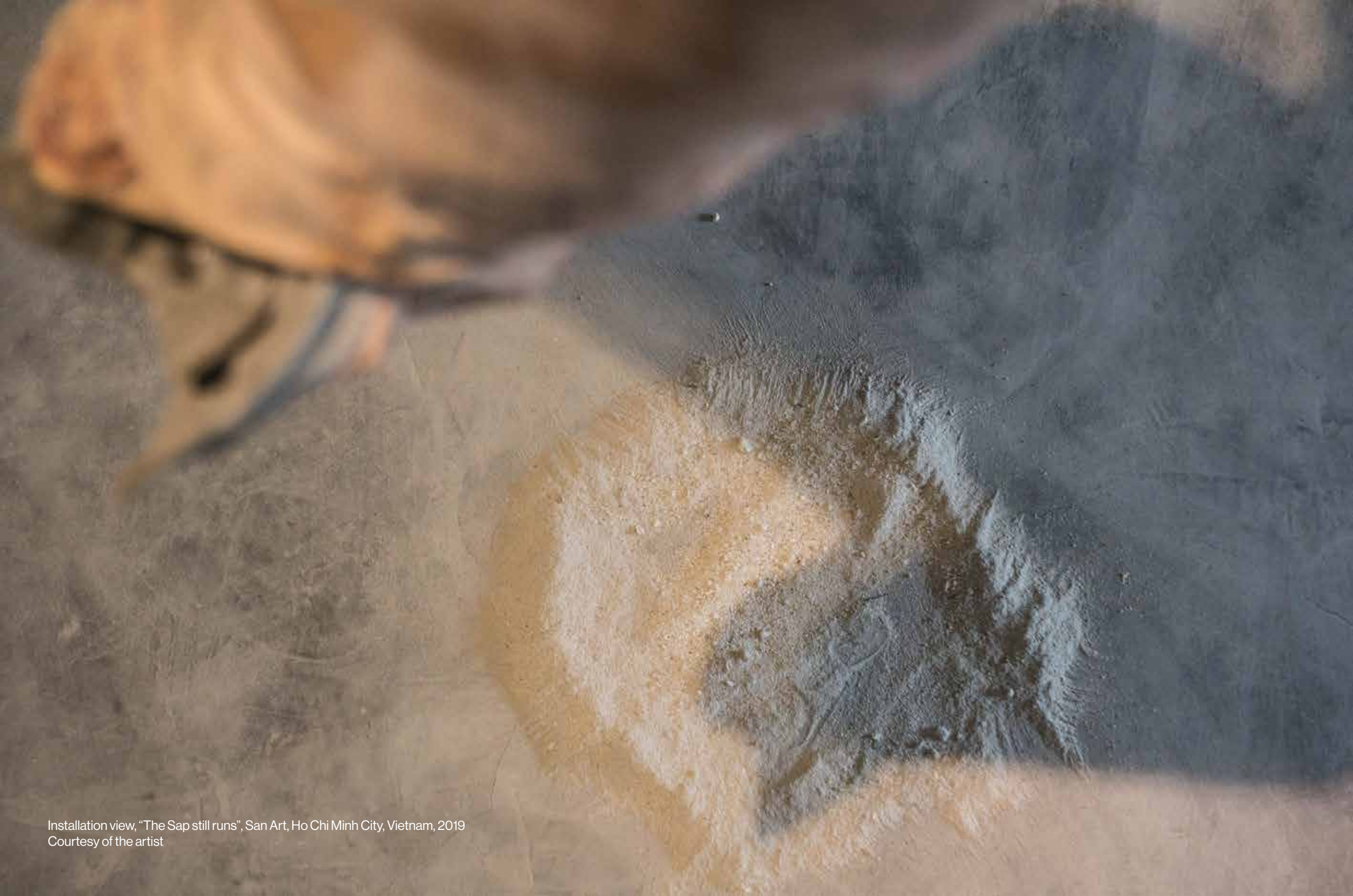
Installation view, "The Sap still runs", San Art, Ho Chi Minh City, Vietnam, 2019