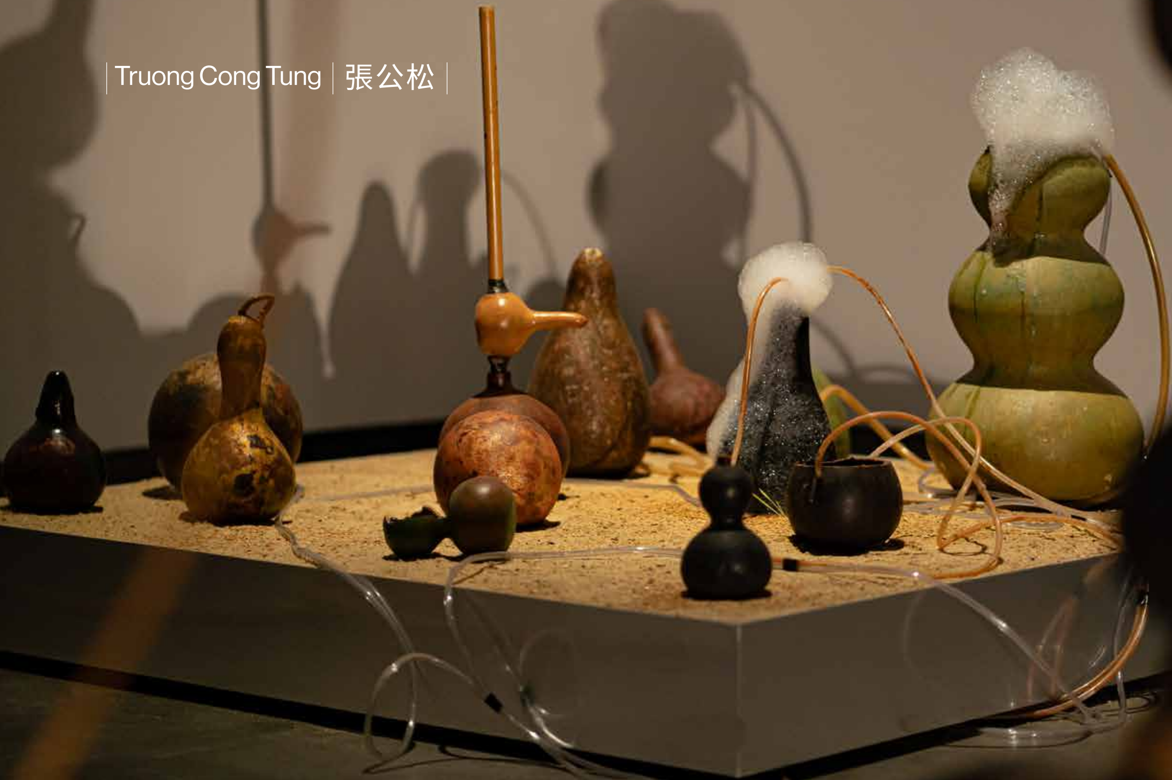
| Truong Cong Tung | 張公松 |