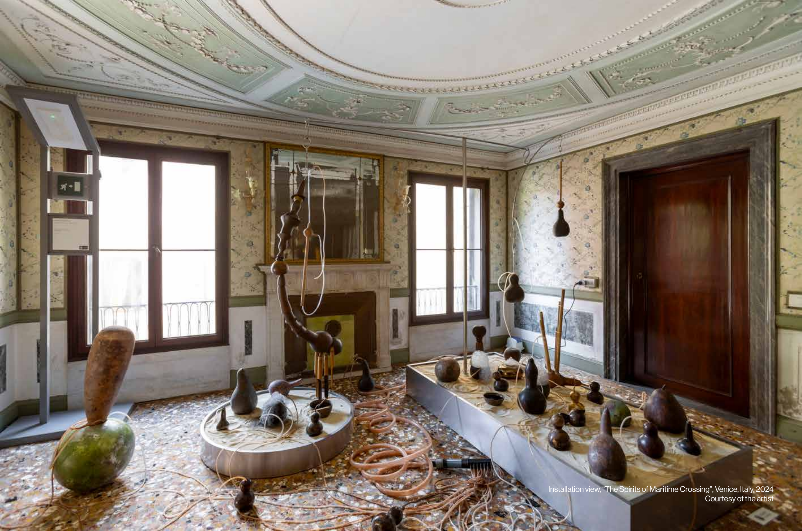
Installation view, "The Spirits of Maritime Crossing", Venice, Italy, 2024