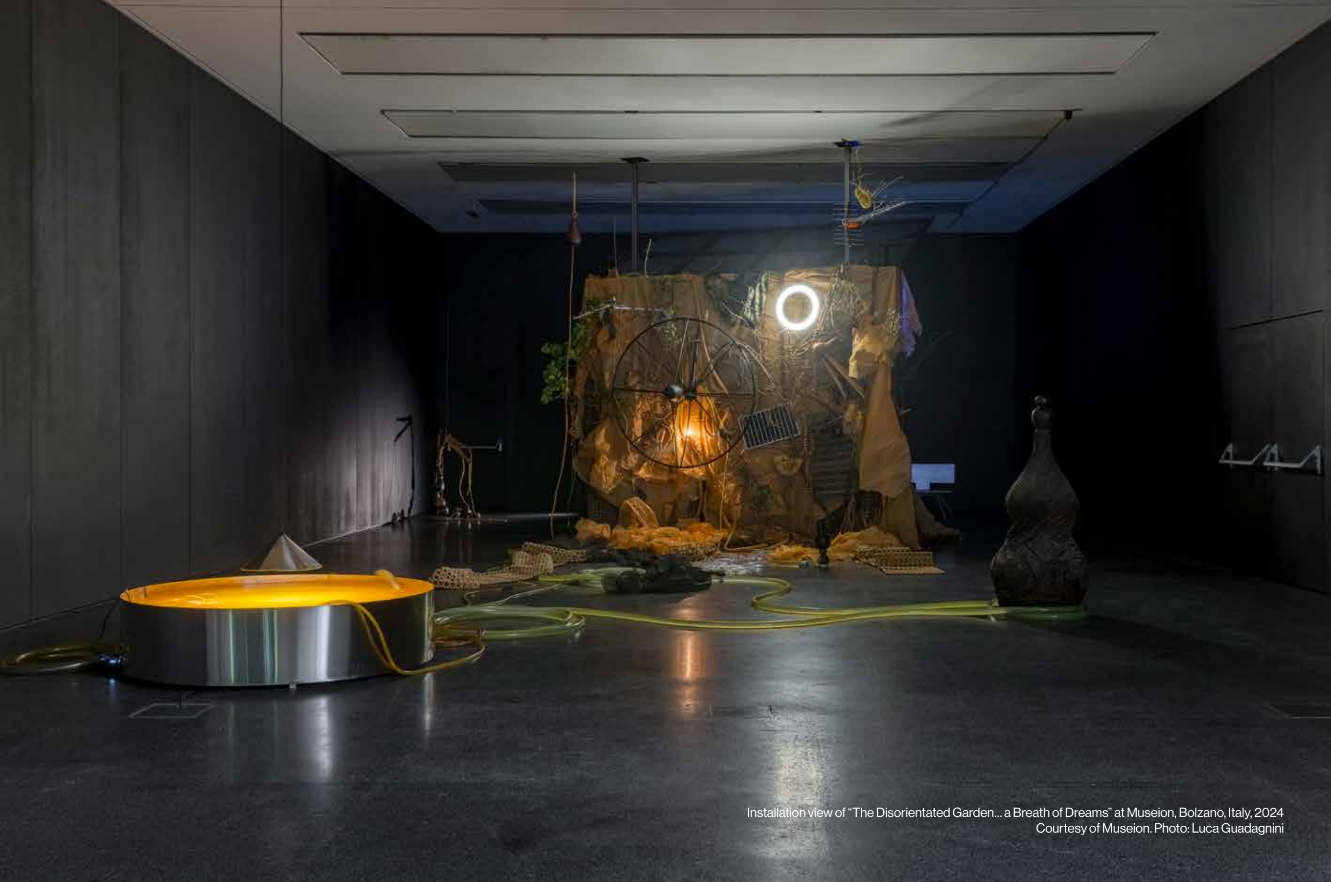
Installation view of "The Disorientated Garden... a Breath of Dreams" at Museion, Bolzano, Italy, 2024