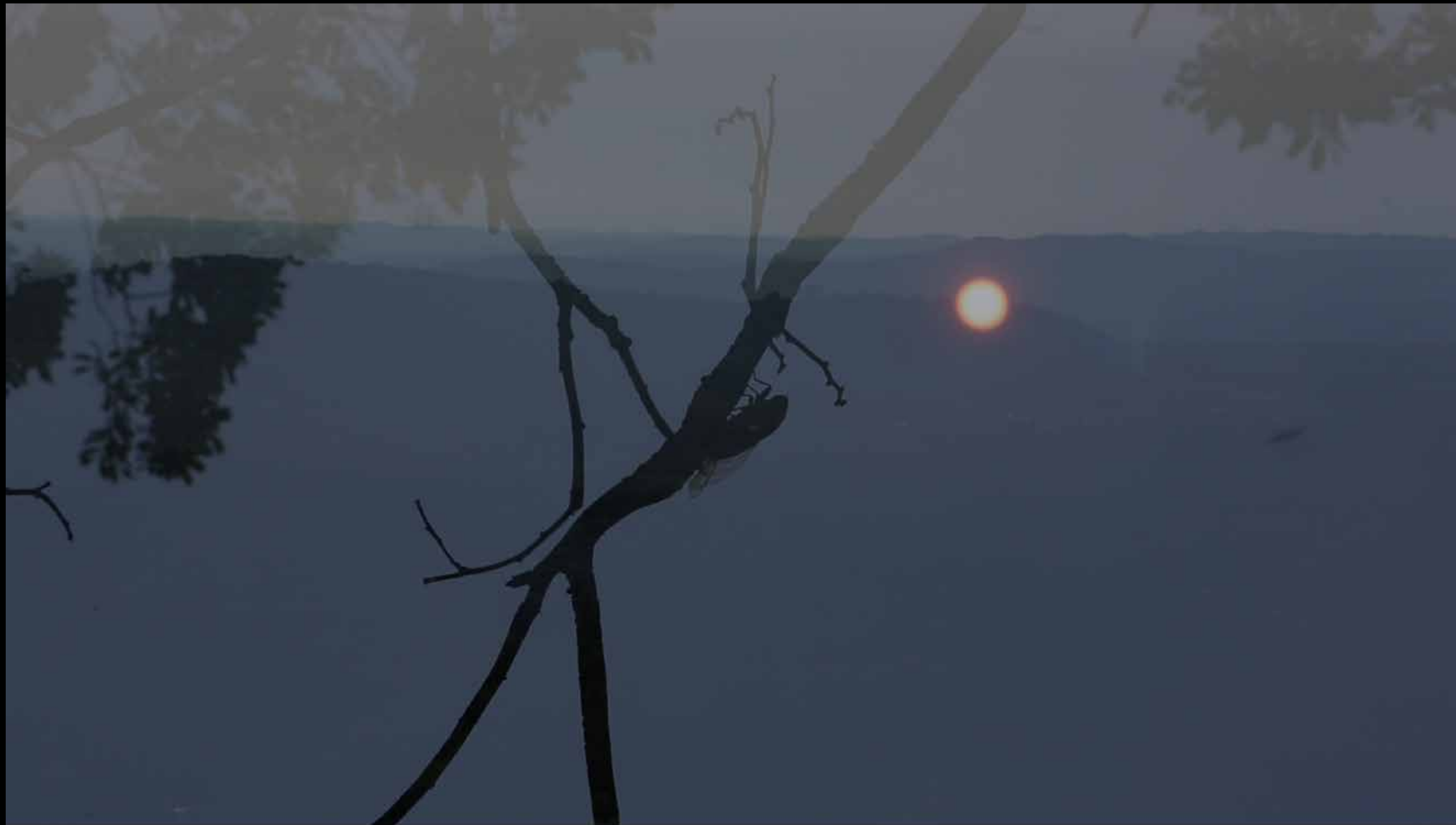
(Video still) The Disoriented Garden... A Breath of Dream (2023–ongoing) © Truong Cong Tung. Courtesy of Galerie Bao