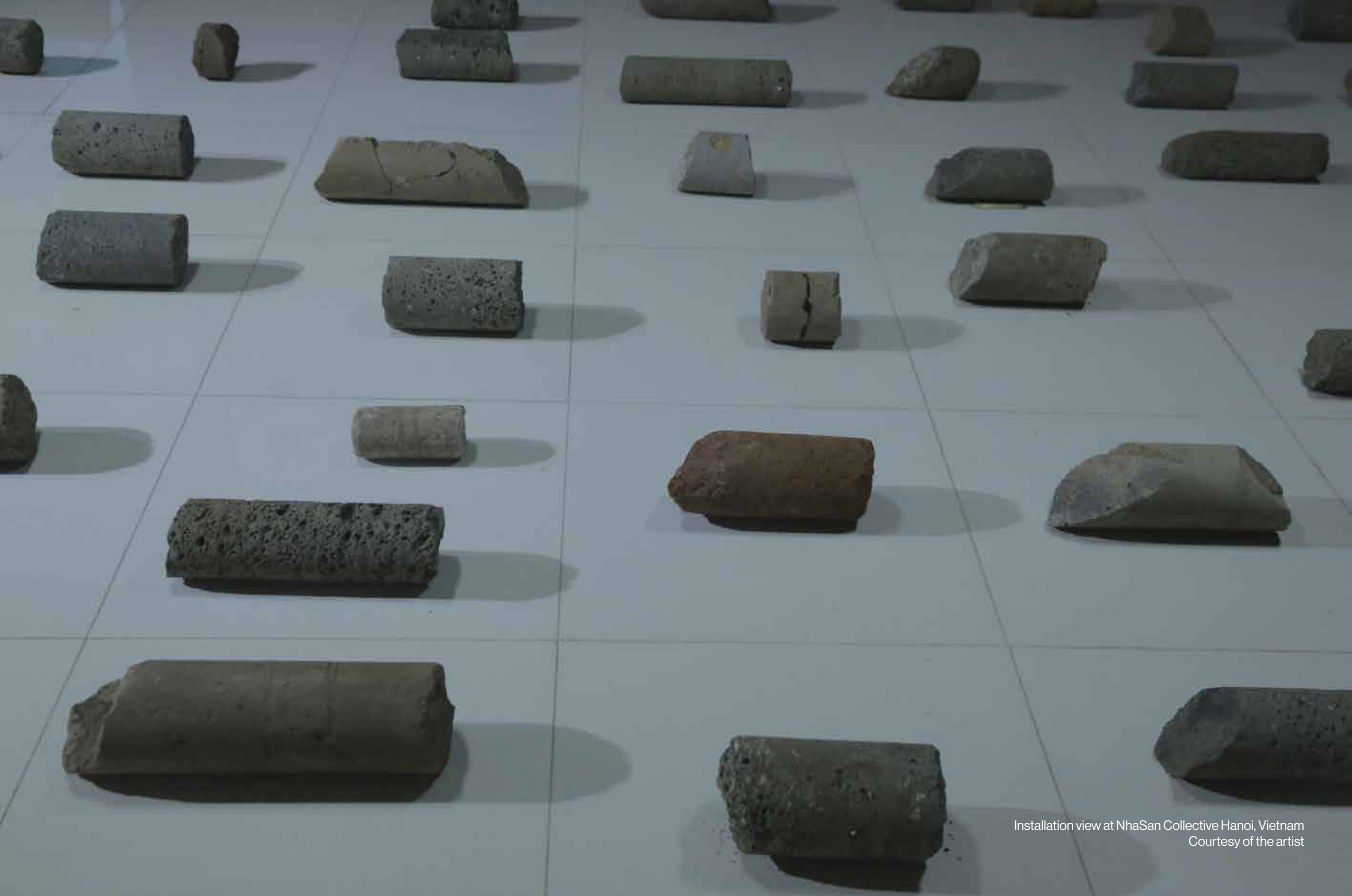
Installation view at NhaSan Collective Hanoi, Vietnam