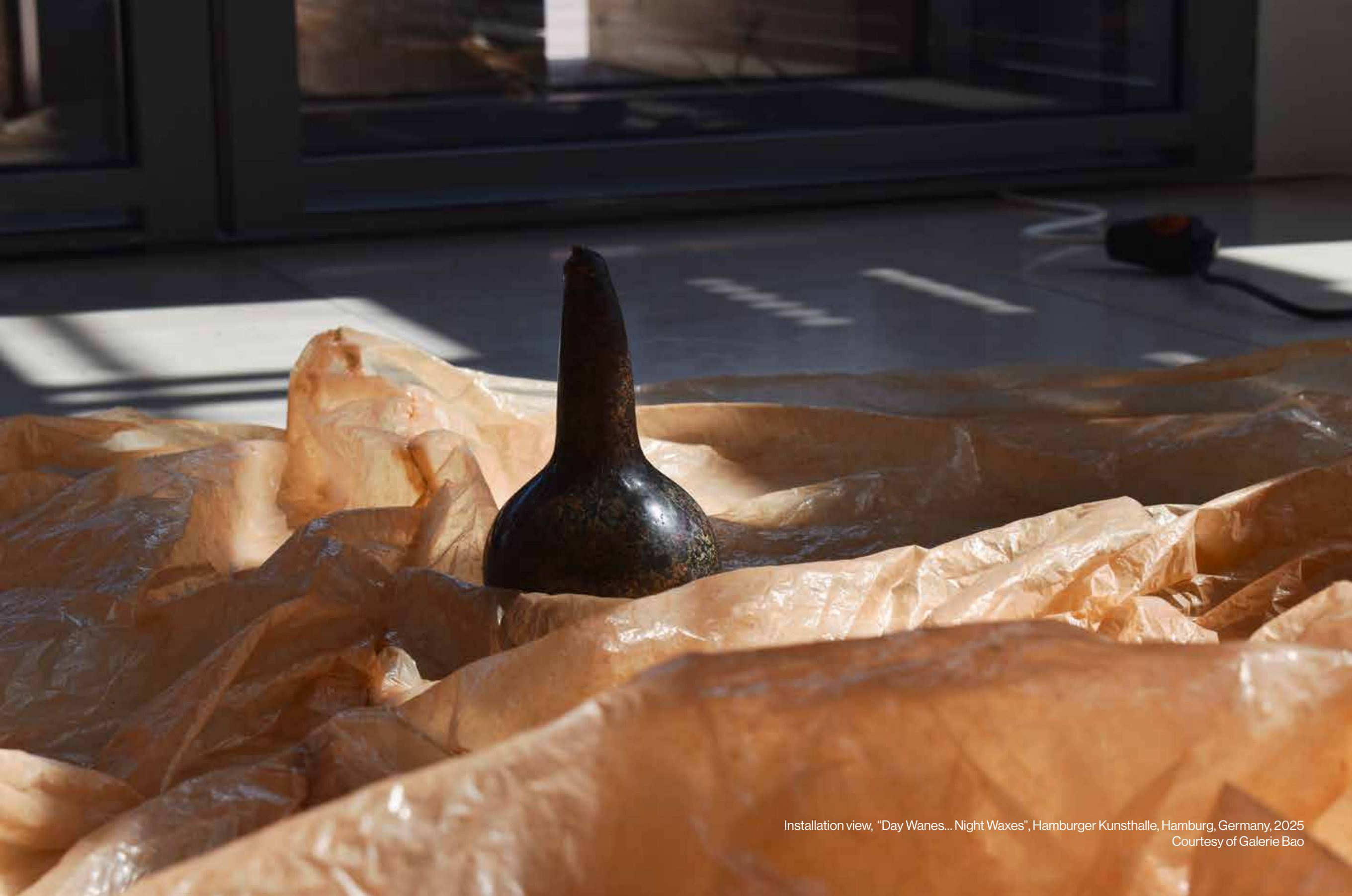
Installation view, "Day Wanes... Night Waxes", Hamburger Kunsthalle, Hamburg, Germany, 2025