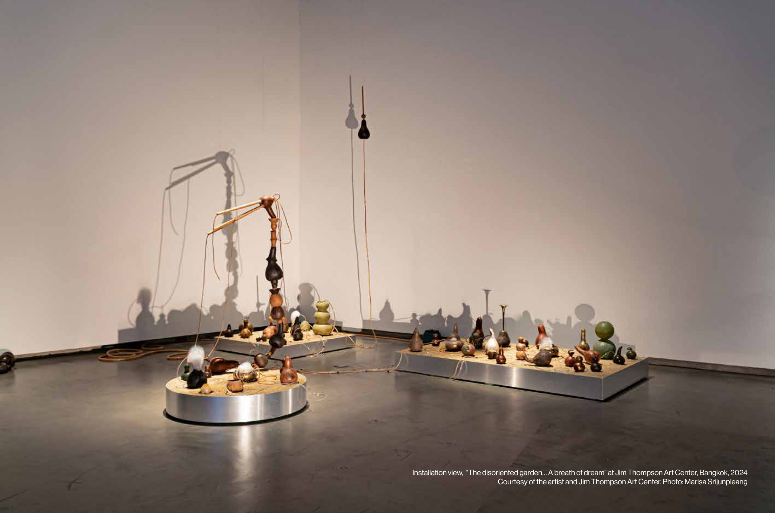
Installation view, "The disoriented garden... A breath of dream" at Jim Thompson Art Center, Bangkok, 2024 Courtesy of the artist and Jim Thompson Art Center. Photo: Marisa Srijunpleang