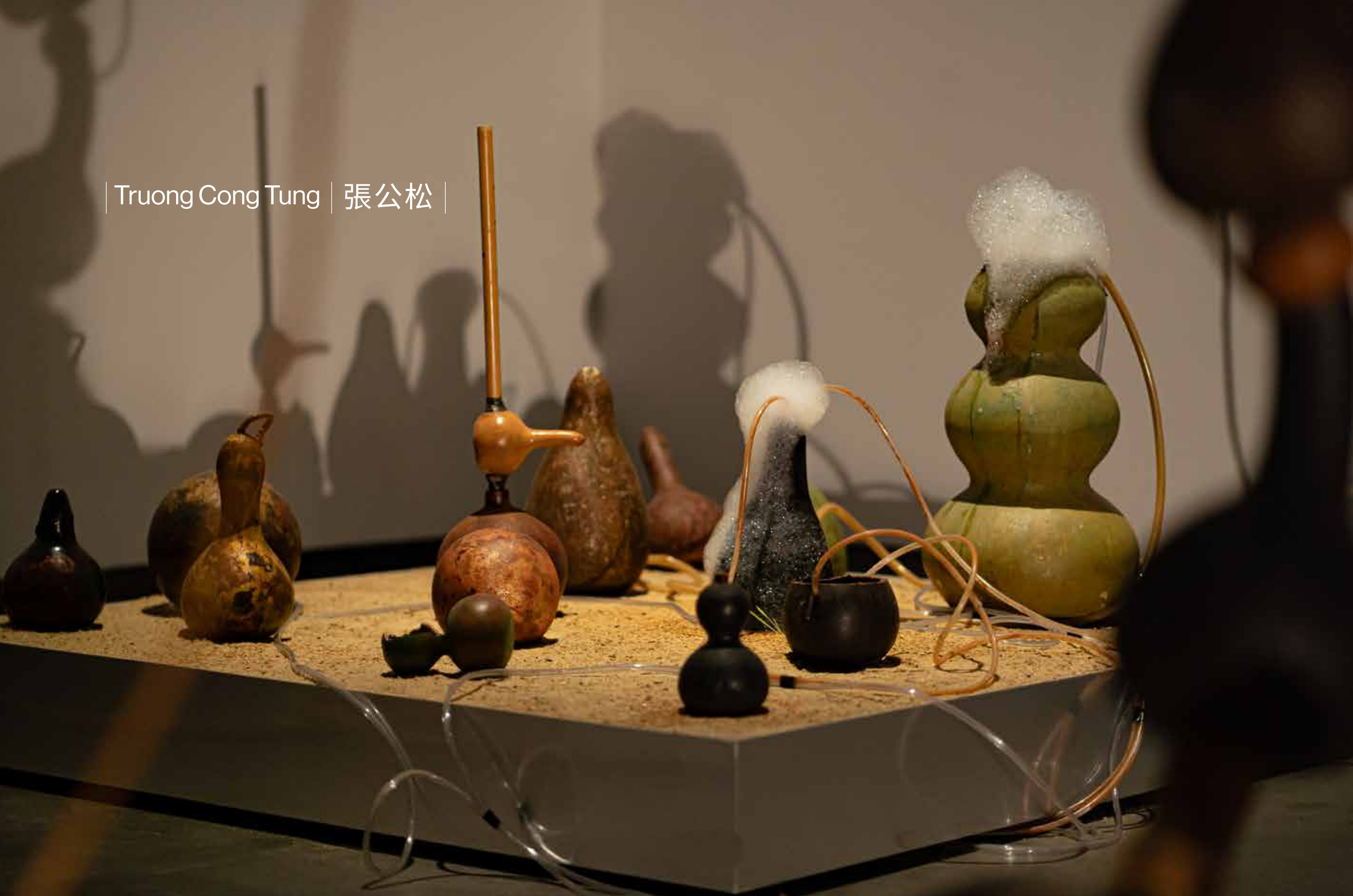
| Truong Cong Tung | 張公松 |