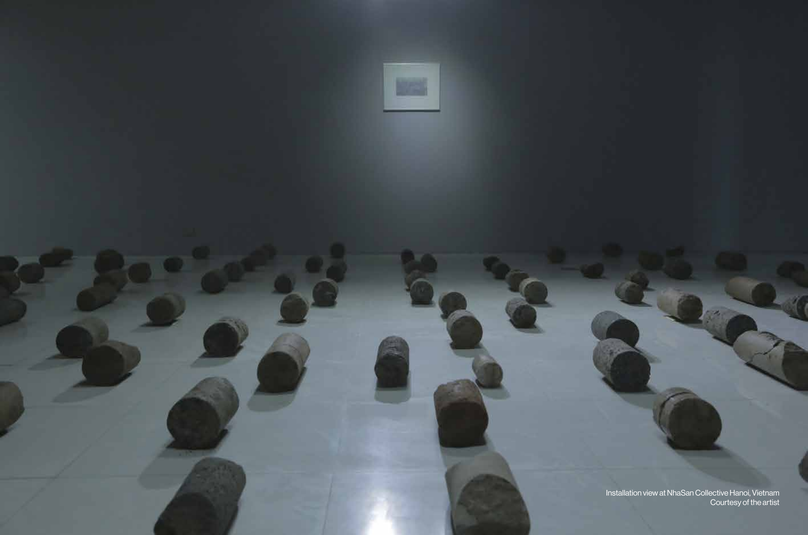
Installation view at NhaSan Collective Hanoi, Vietnam