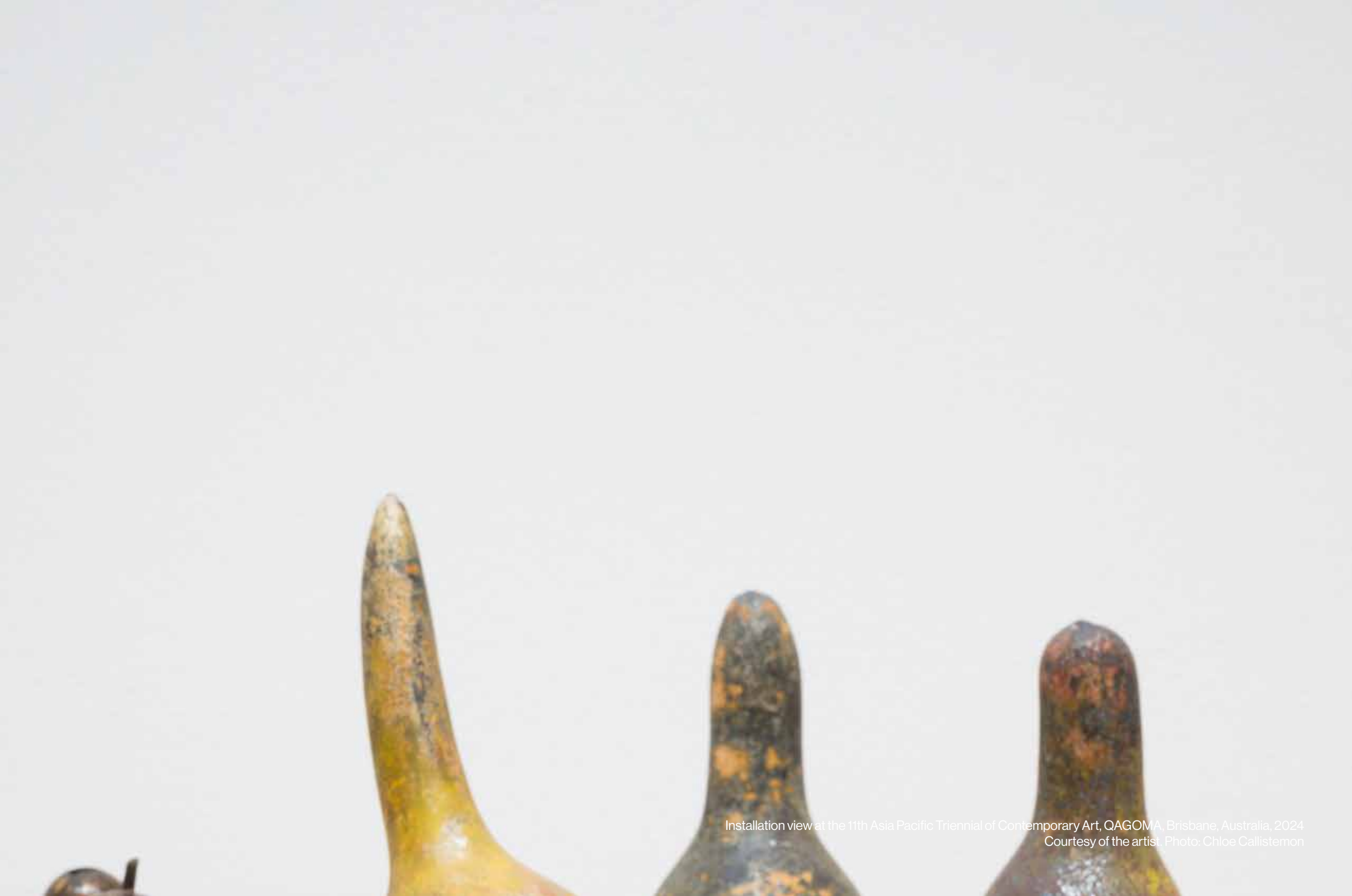
Installation view at the 11th Asia Pacific Triennial of Contemporary Art, QAGOMA, Brisbane, Australia, 2024