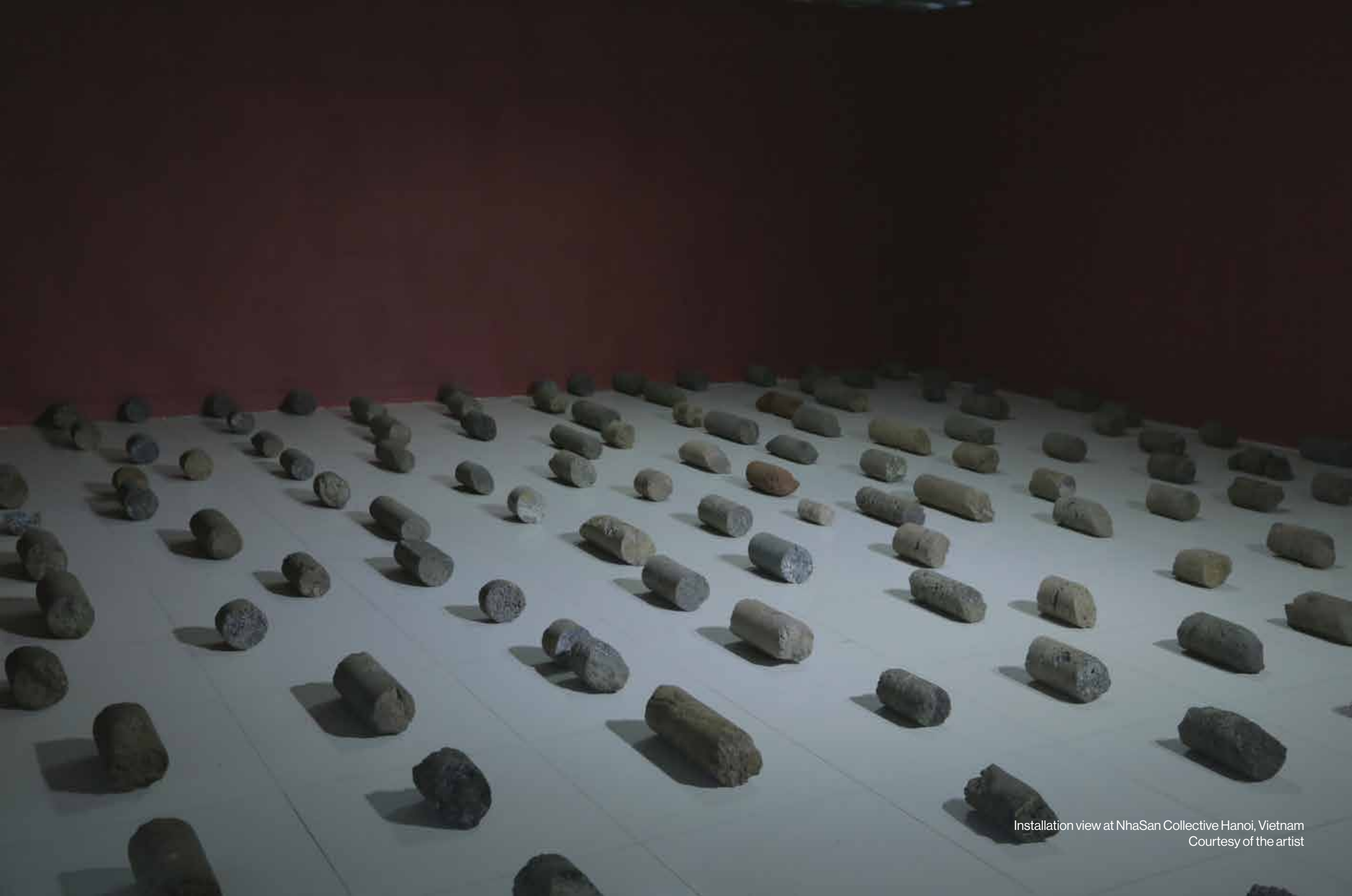
Installation view at NhaSan Collective Hanoi, Vietnam