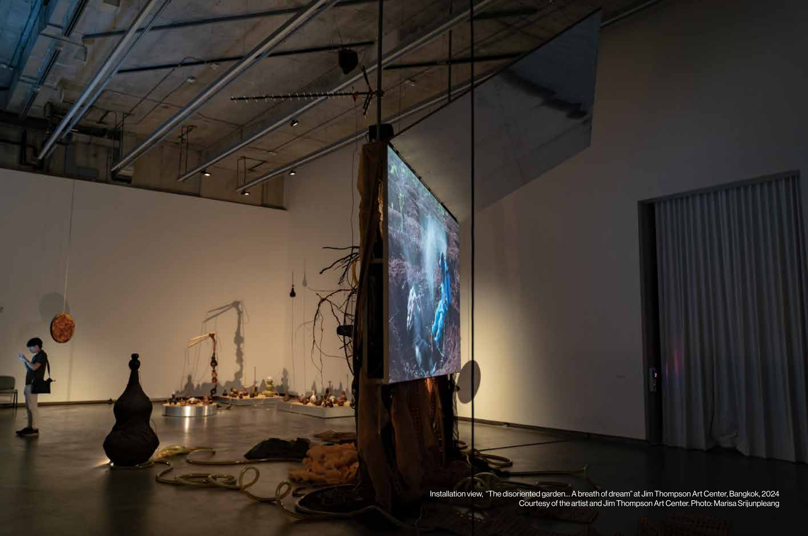
Installation view, "The disoriented garden... A breath of dream" at Jim Thompson Art Center, Bangkok, 2024