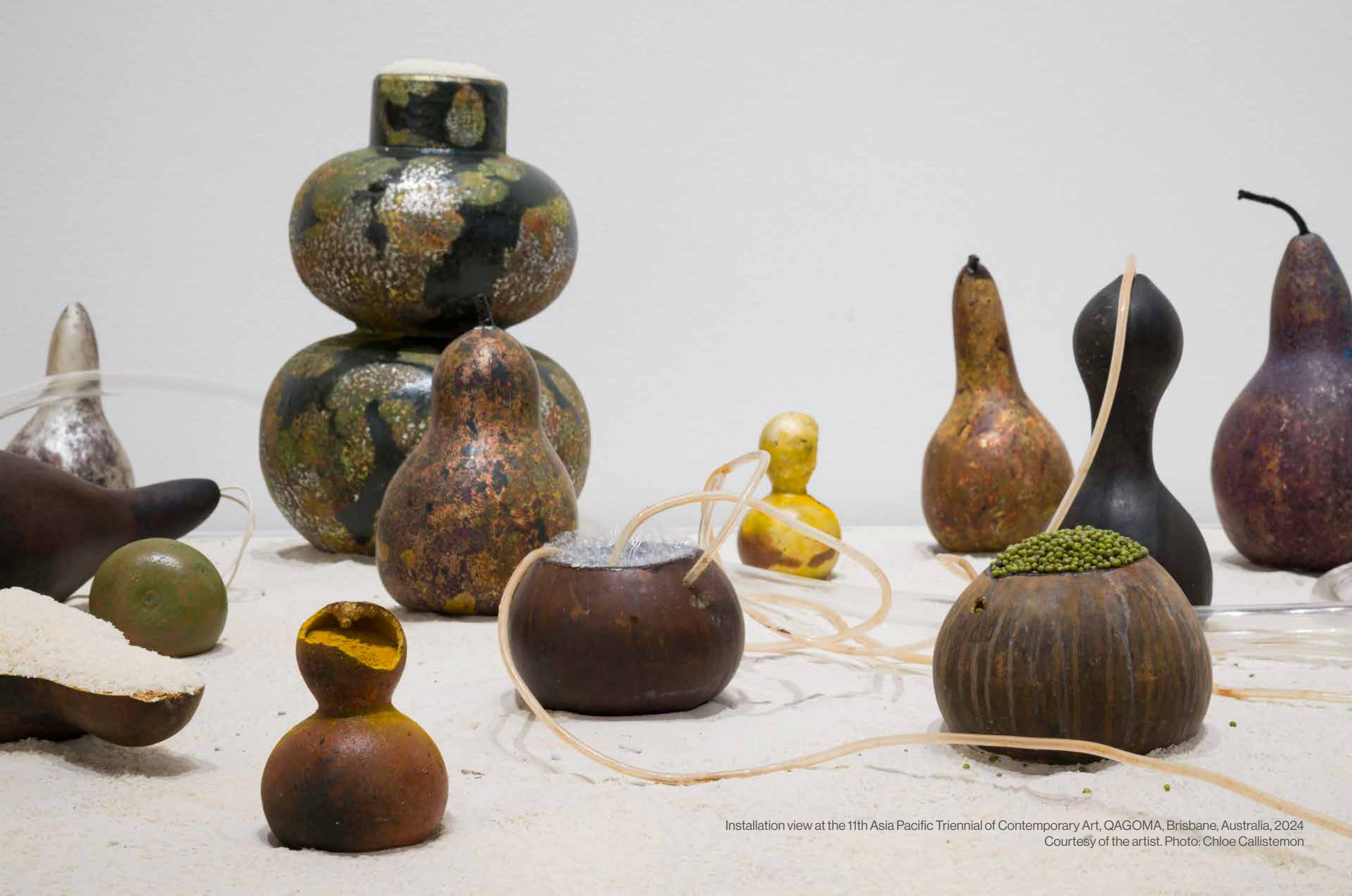
Installation view at the 11th Asia Pacific Triennial of Contemporary Art, QAGOMA, Brisbane, Australia, 2024