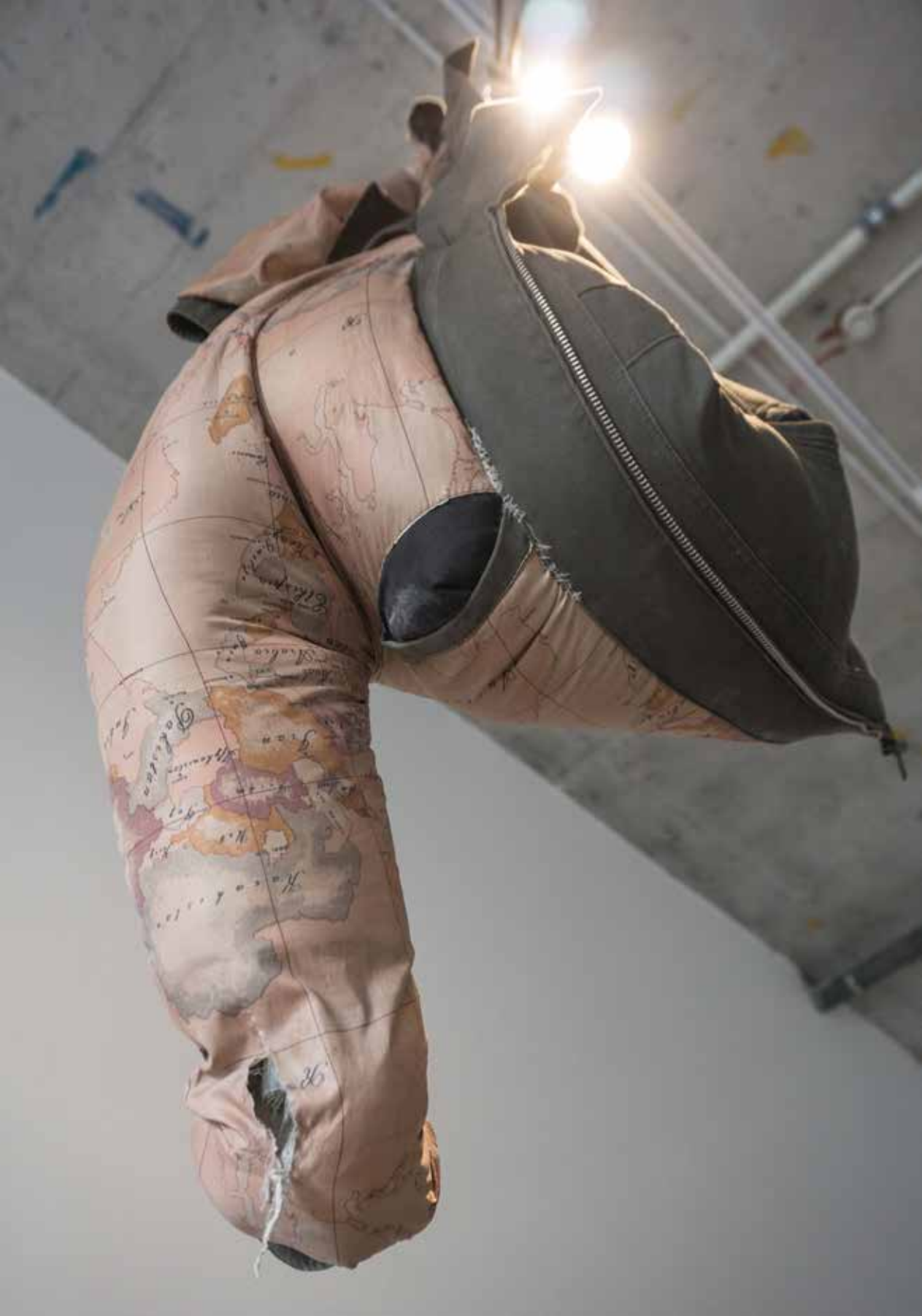
Installation view, "The Sap still runs", San Art, Ho Chi Minh City, Vietnam, 2019