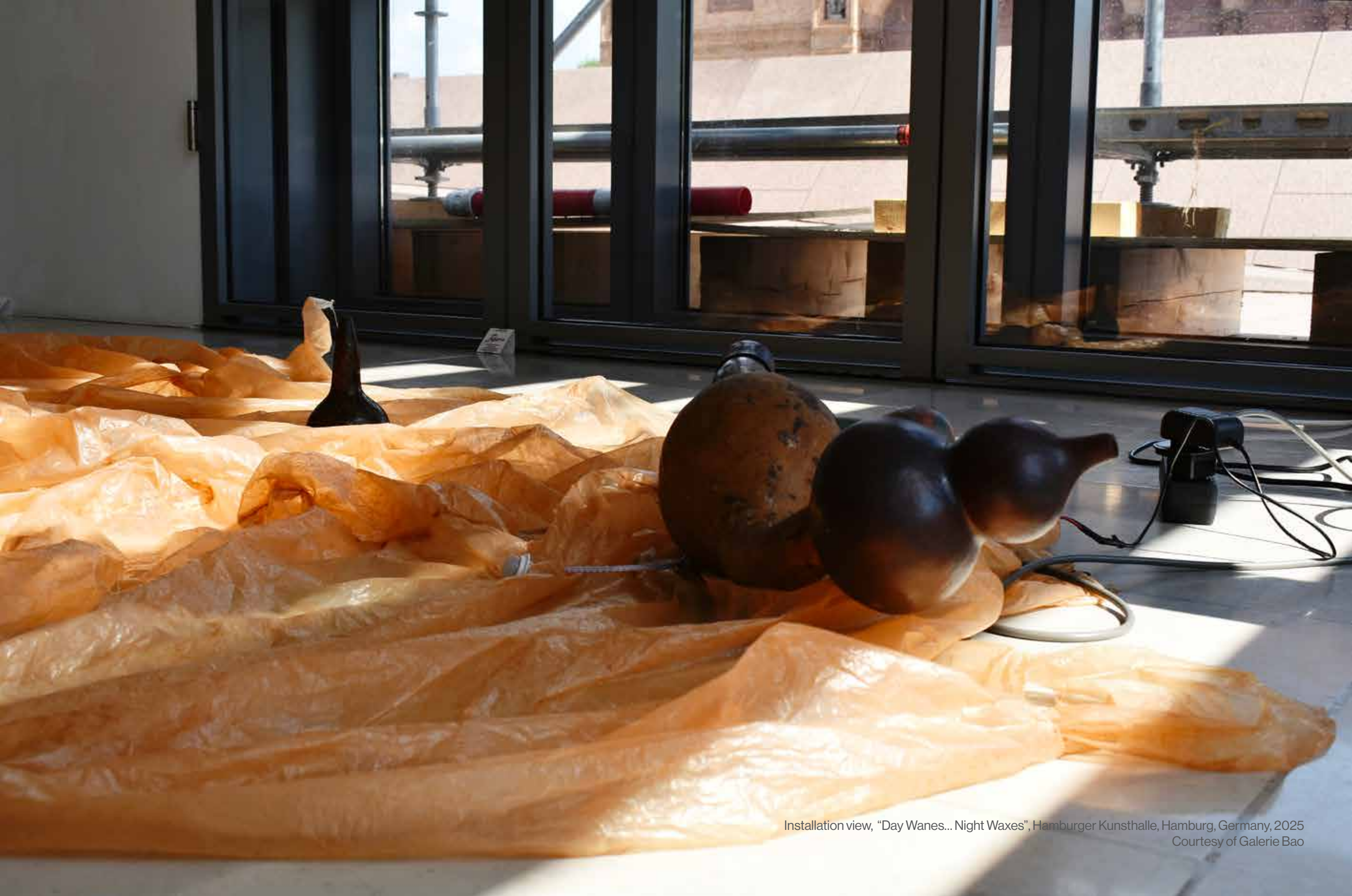
Installation view, "Day Wanes... Night Waxes", Hamburger Kunsthalle, Hamburg, Germany, 2025