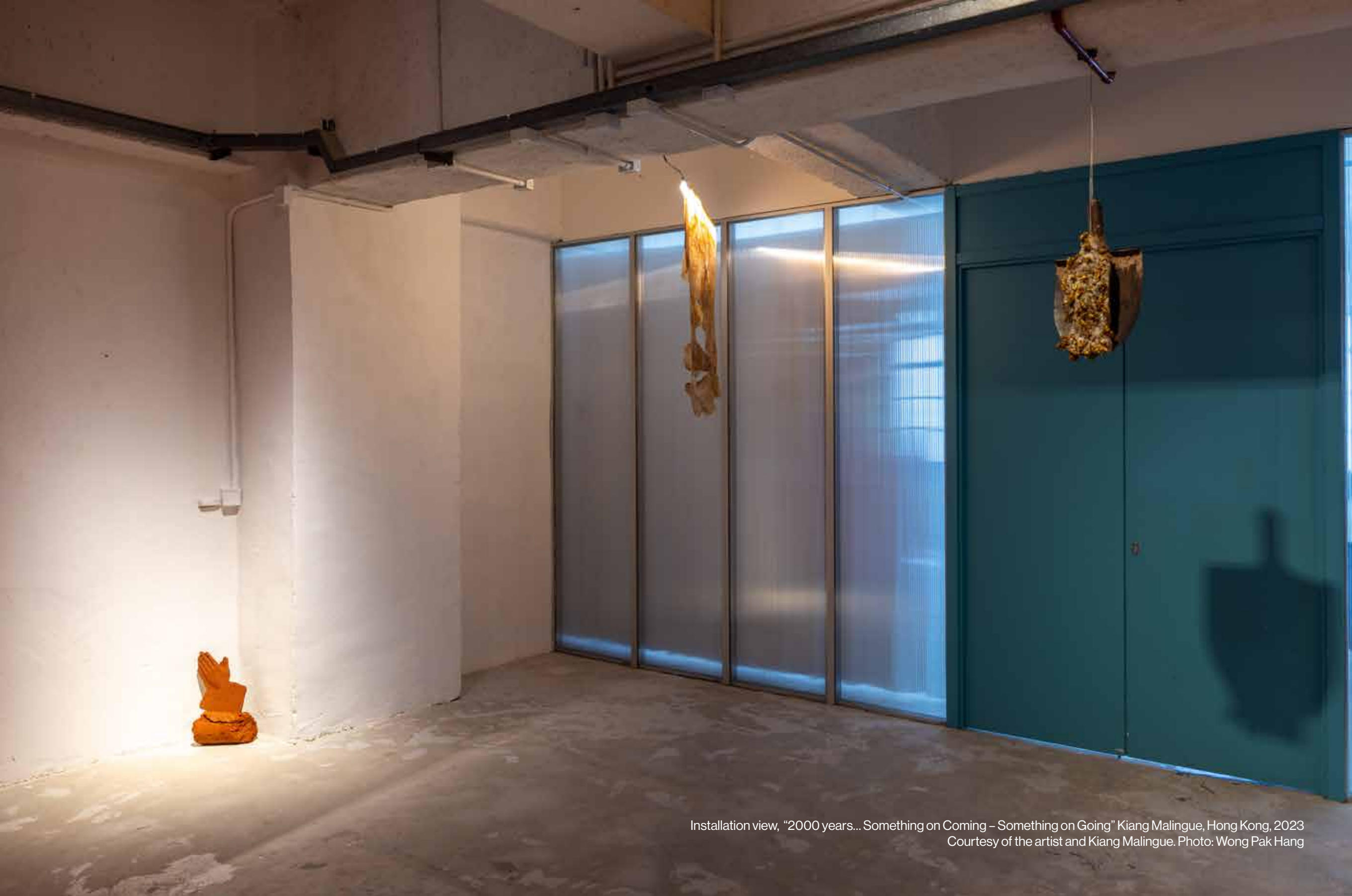
Installation view, "2000 years... Something on Coming – Something on Going" Kiang Malingue, Hong Kong, 2023