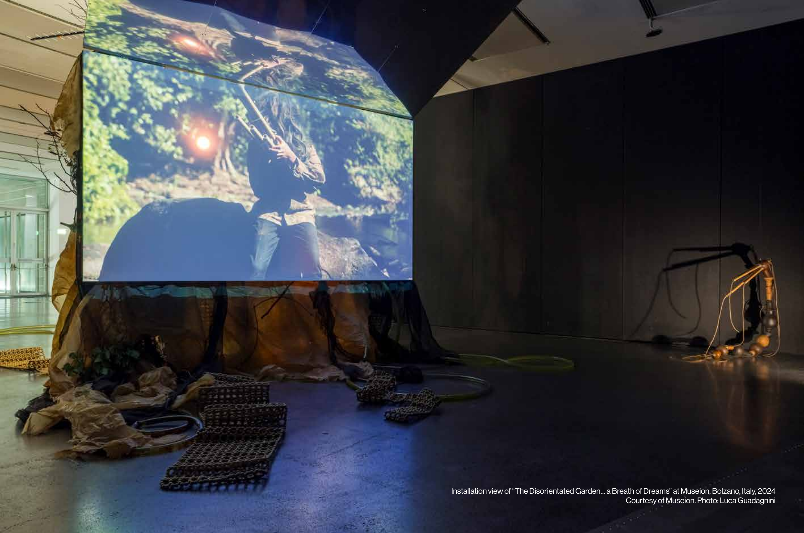
Installation view of "The Disorientated Garden... a Breath of Dreams" at Museion, Bolzano, Italy, 2024