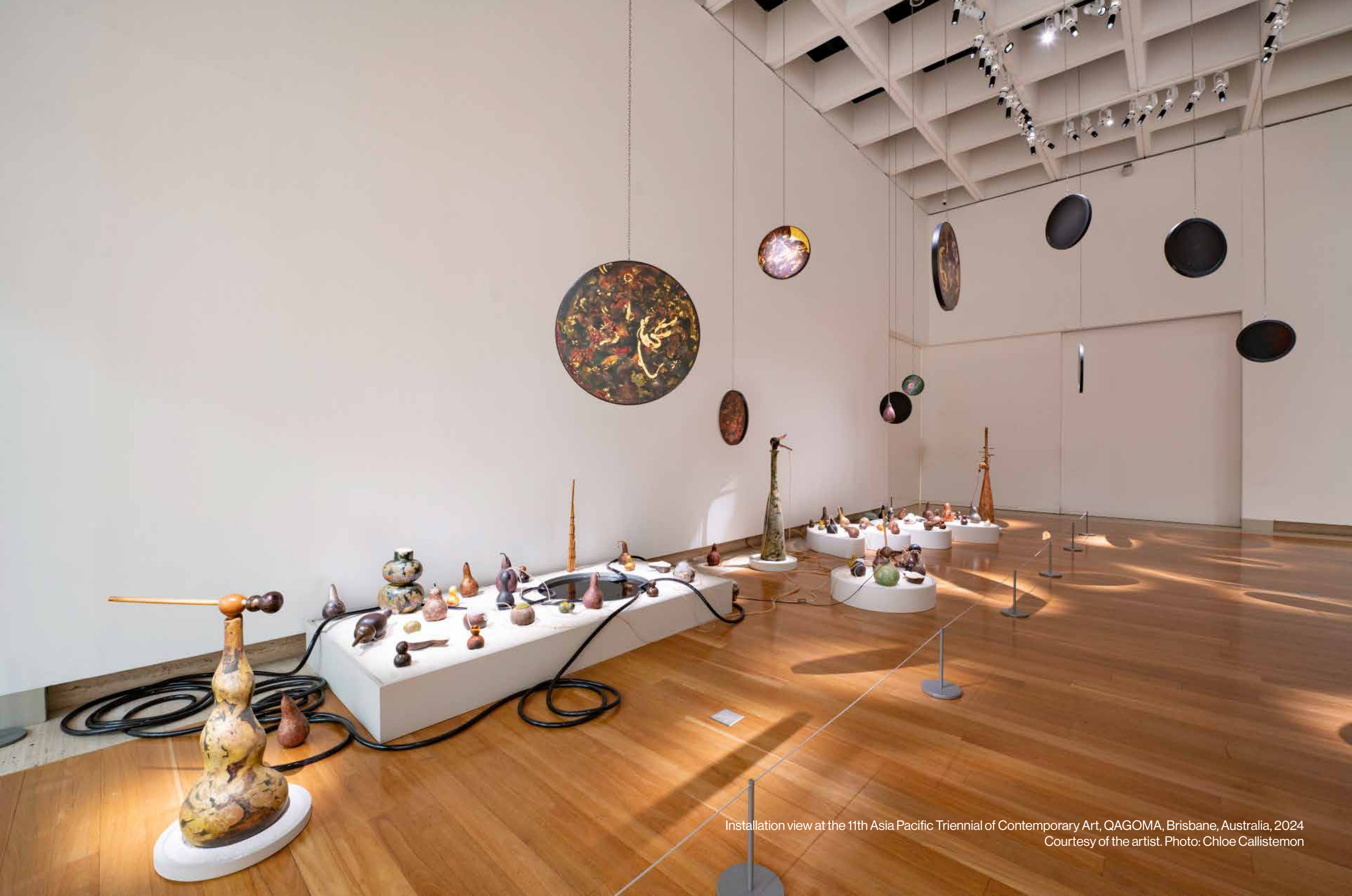
Installation view at the 11th Asia Pacific Triennial of Contemporary Art, QAGOMA, Brisbane, Australia, 2024