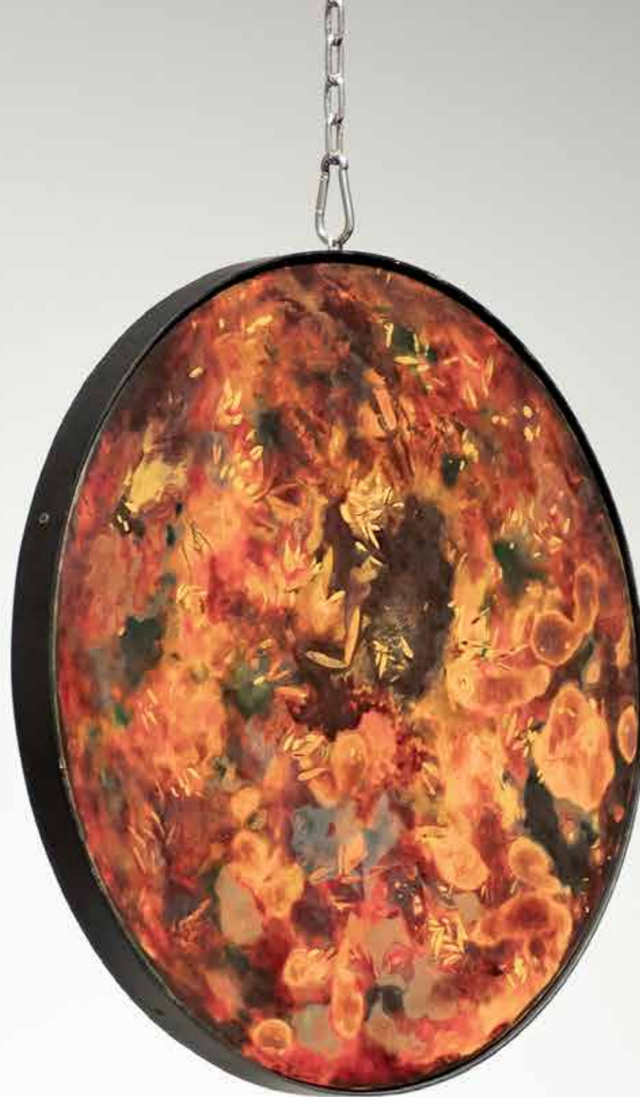
Installation view, "The disoriented garden... A breath of dream" at Jim Thompson Art Center, Bangkok, 2024 Courtesy of the artist and Jim Thompson Art Center. Photo: Marisa Srijunpleang