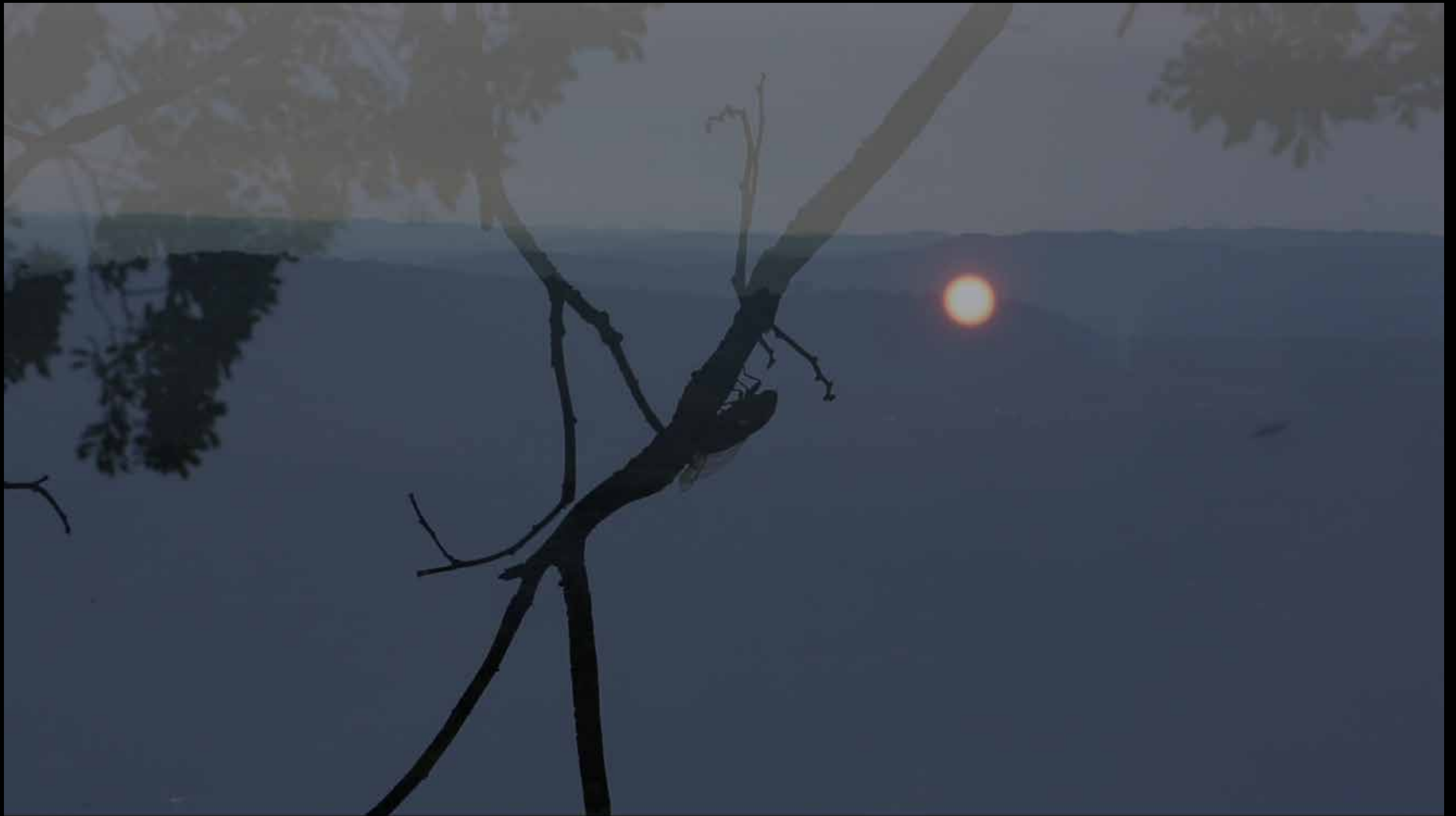
(Video still) The Disoriented Garden... A Breath of Dream (2023–ongoing) © Truong Cong Tung. Courtesy of Galerie Bao