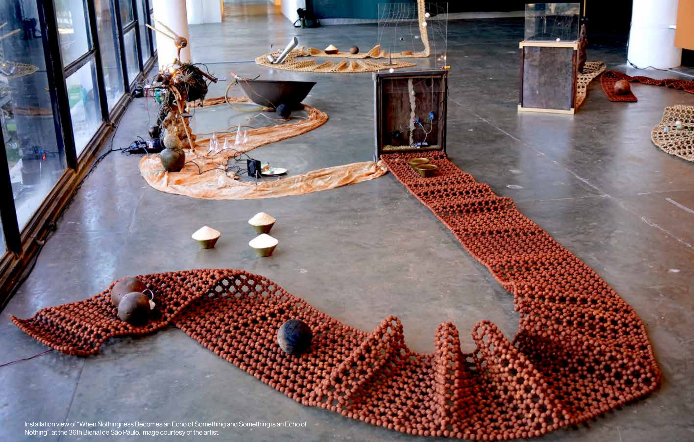
Installation view of "When Nothingness Becomes an Echo of Something and Something is an Echo of Nothing", at the 36th Bienal de São Paulo.