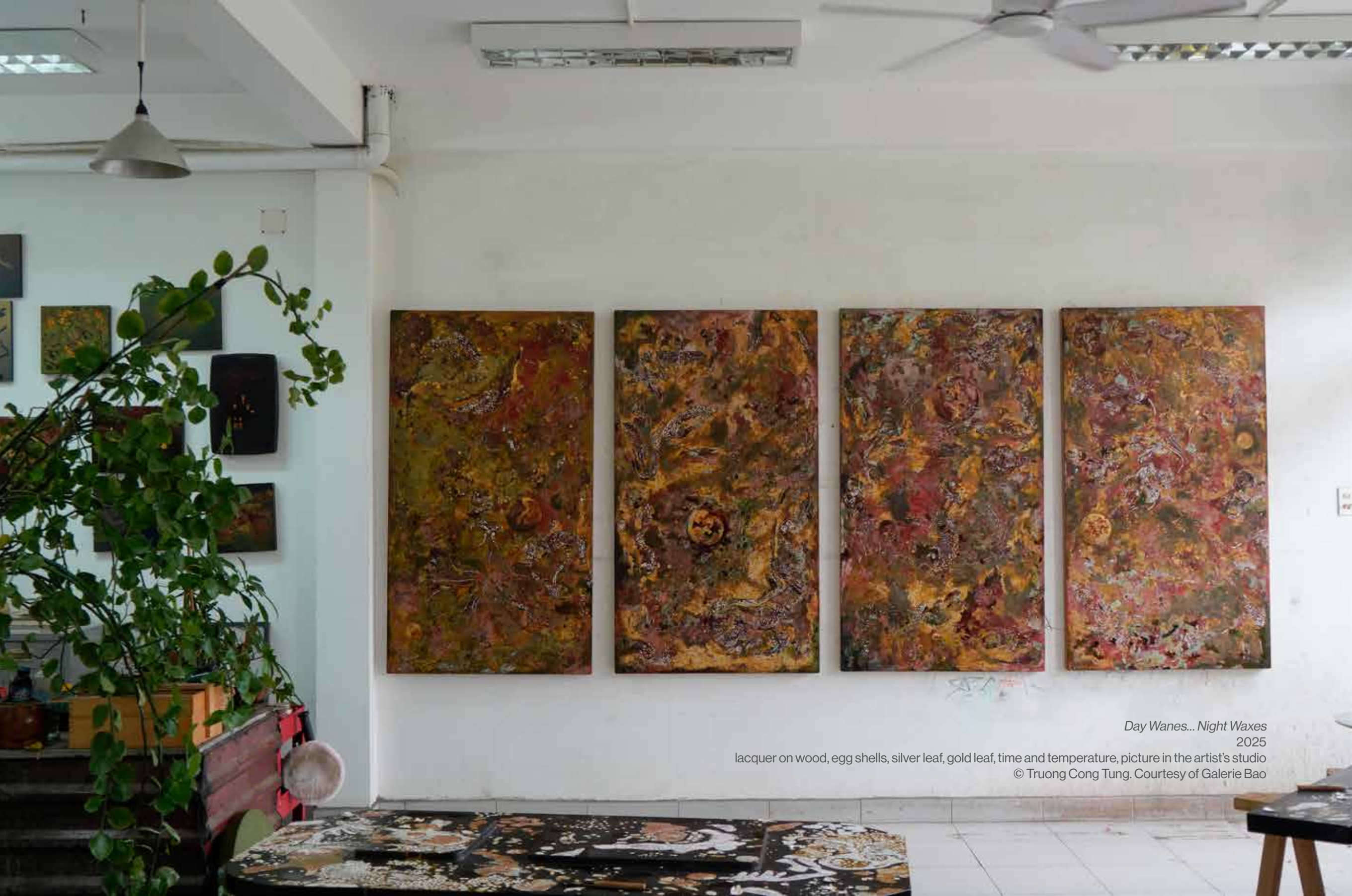
Day Wanes... Night Waxes 2025

lacquer on wood, egg shells, silver leaf, gold leaf, time and temperature, picture in the artist's studio