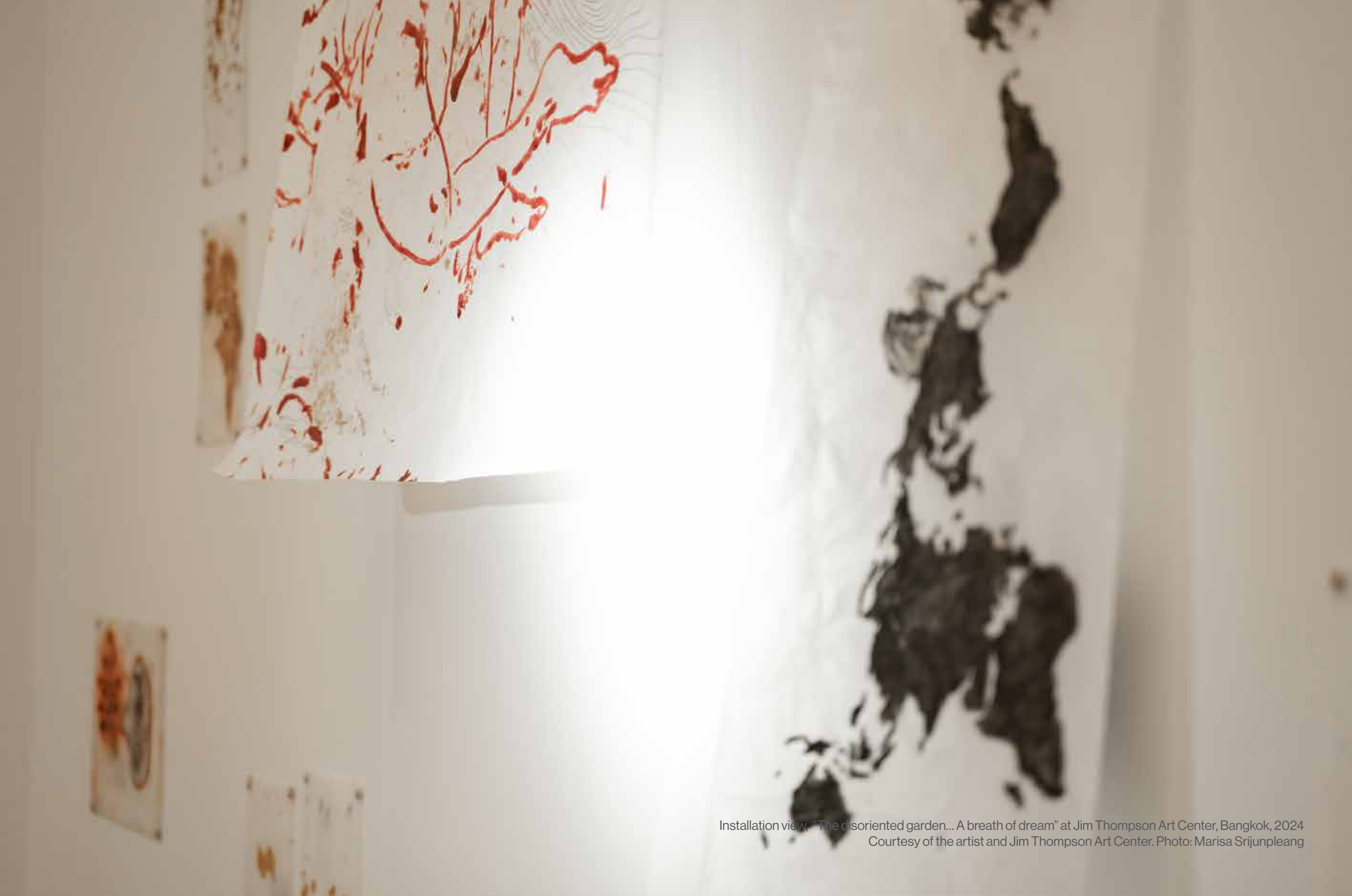
Installation view, "The disoriented garden... A breath of dream" at Jim Thompson Art Center, Bangkok, 2024