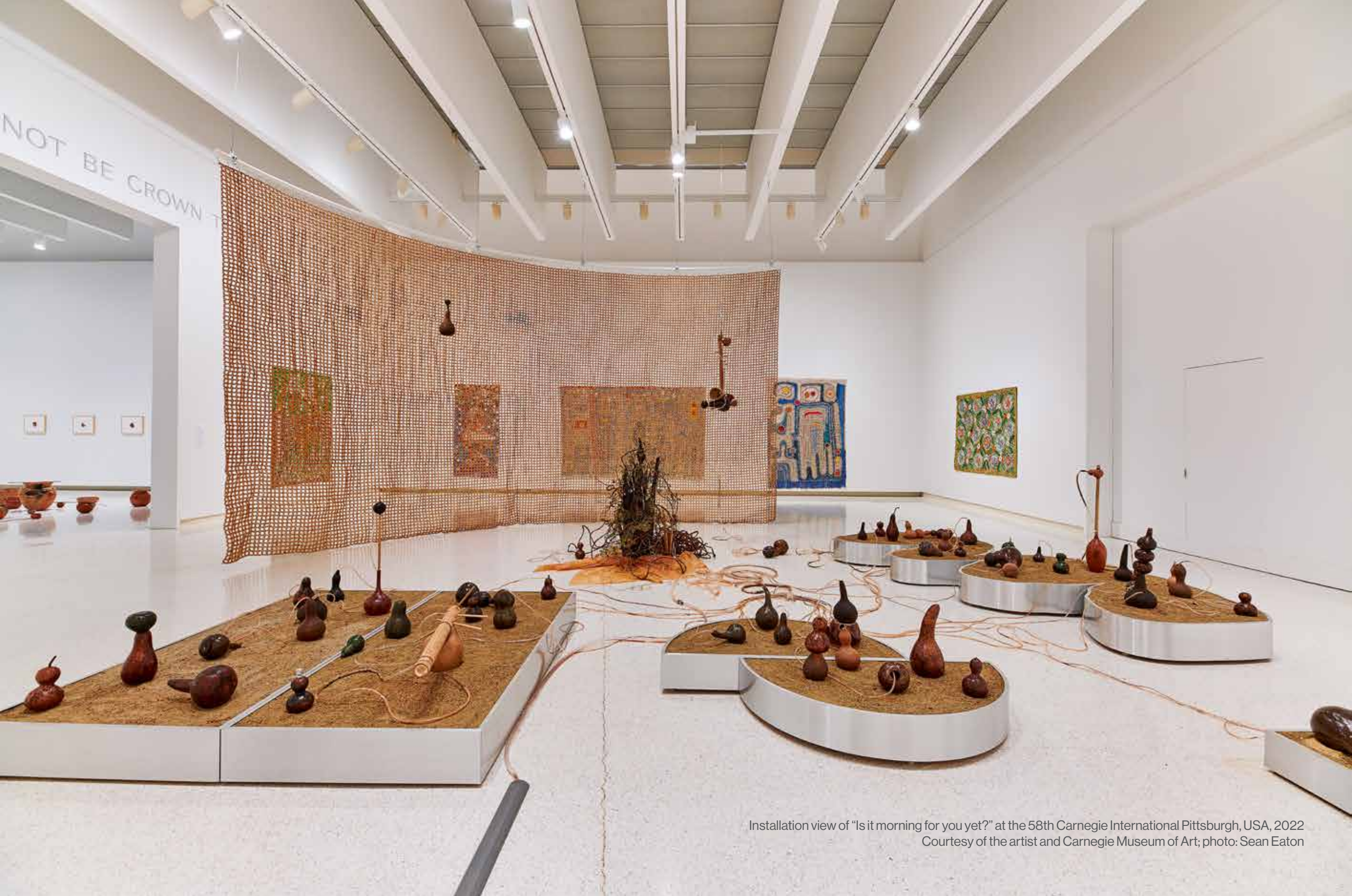
Installation view of "Is it morning for you yet?" at the 58th Carnegie International Pittsburgh, USA, 2022