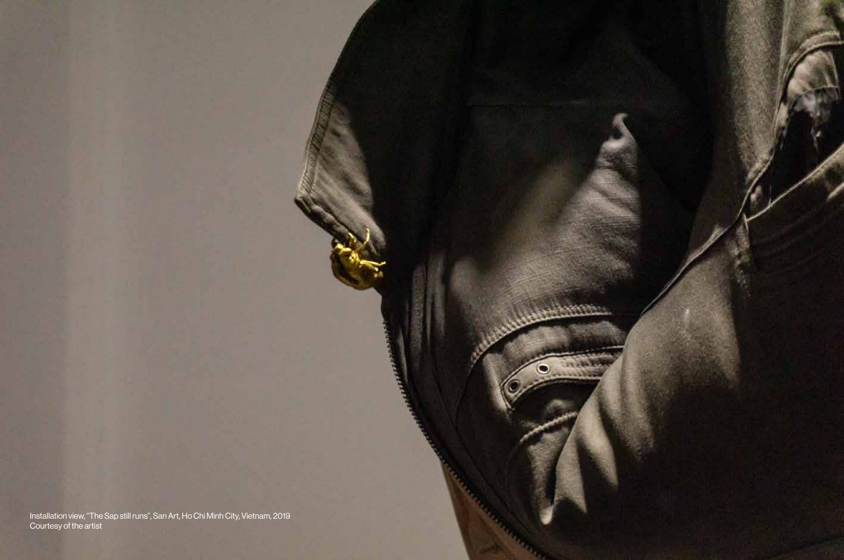
Installation view, "The Sap still runs", San Art, Ho Chi Minh City, Vietnam, 2019