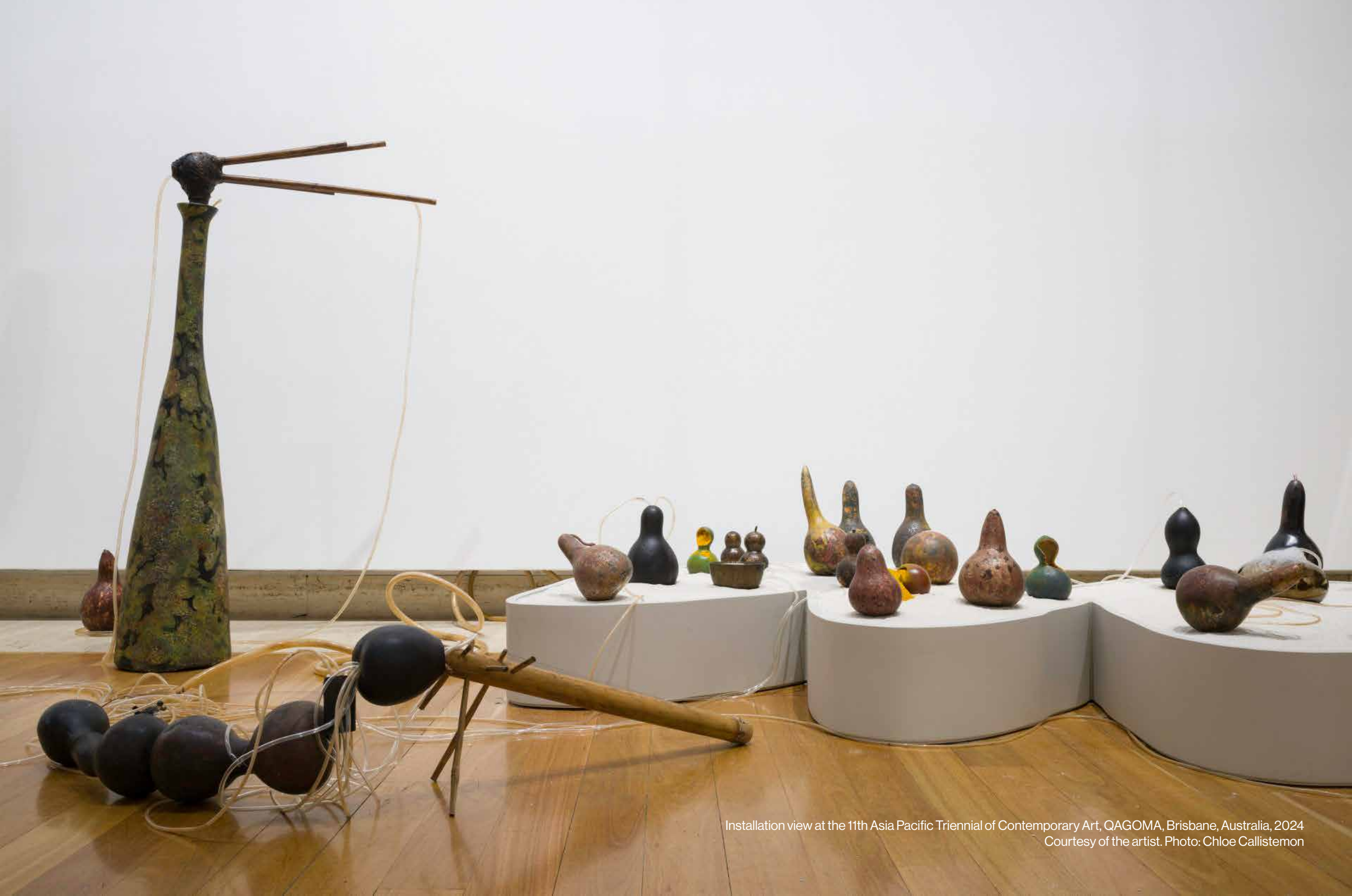
Installation view at the 11th Asia Pacific Triennial of Contemporary Art, QAGOMA, Brisbane, Australia, 2024