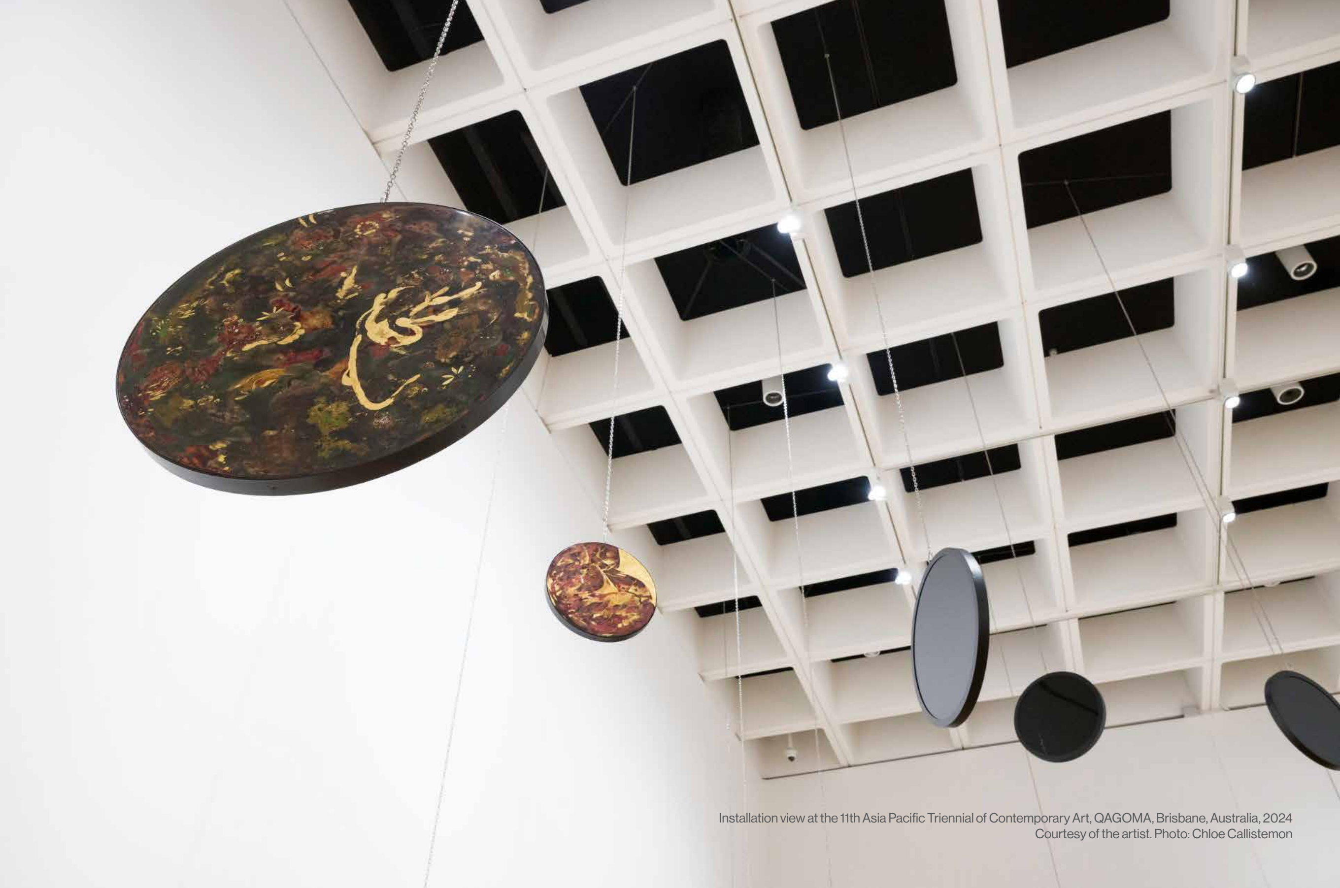
Installation view at the 11th Asia Pacific Triennial of Contemporary Art, QAGOMA, Brisbane, Australia, 2024