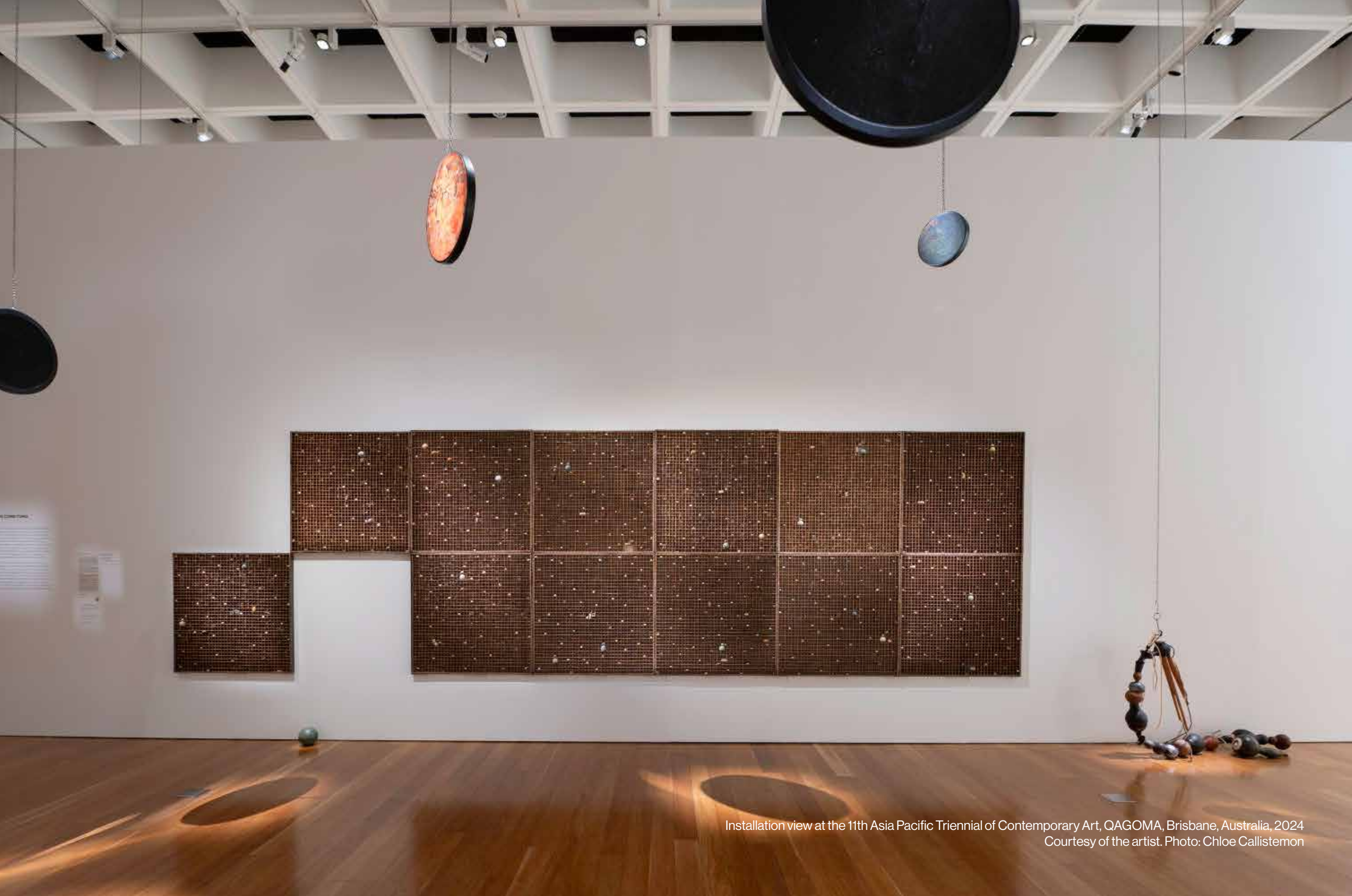
Installation view at the 11th Asia Pacific Triennial of Contemporary Art, QAGOMA, Brisbane, Australia, 2024