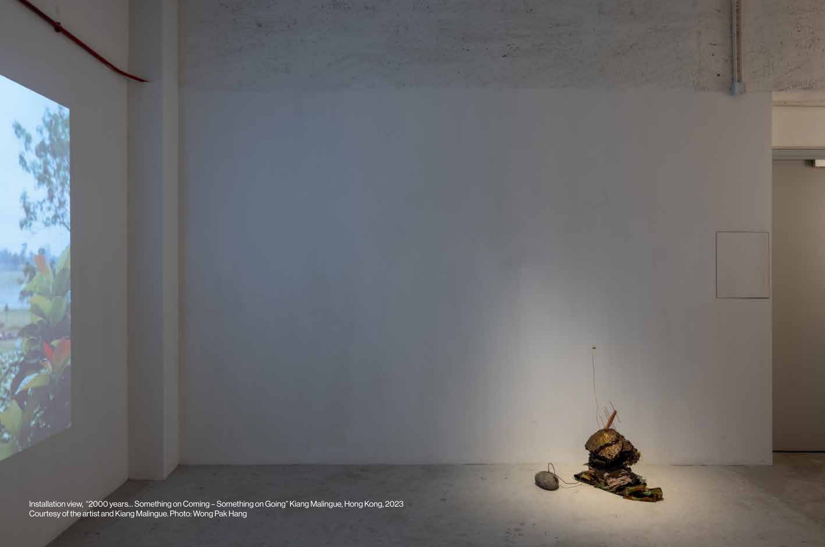
Installation view, "2000 years... Something on Coming – Something on Going" Kiang Malingue, Hong Kong, 2023