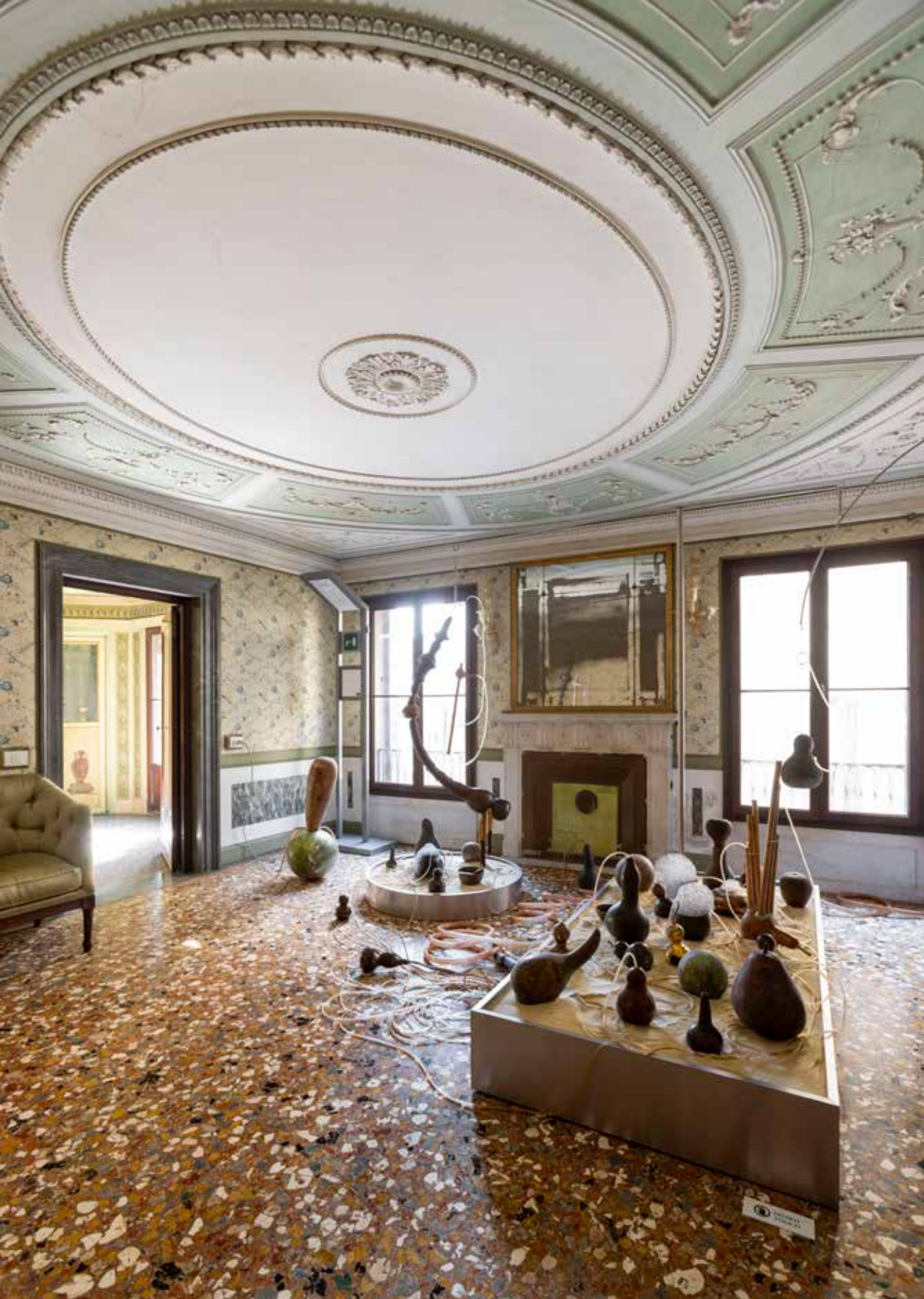
Installation view, "The Spirits of Maritime Crossing", Venice, Italy, 2024