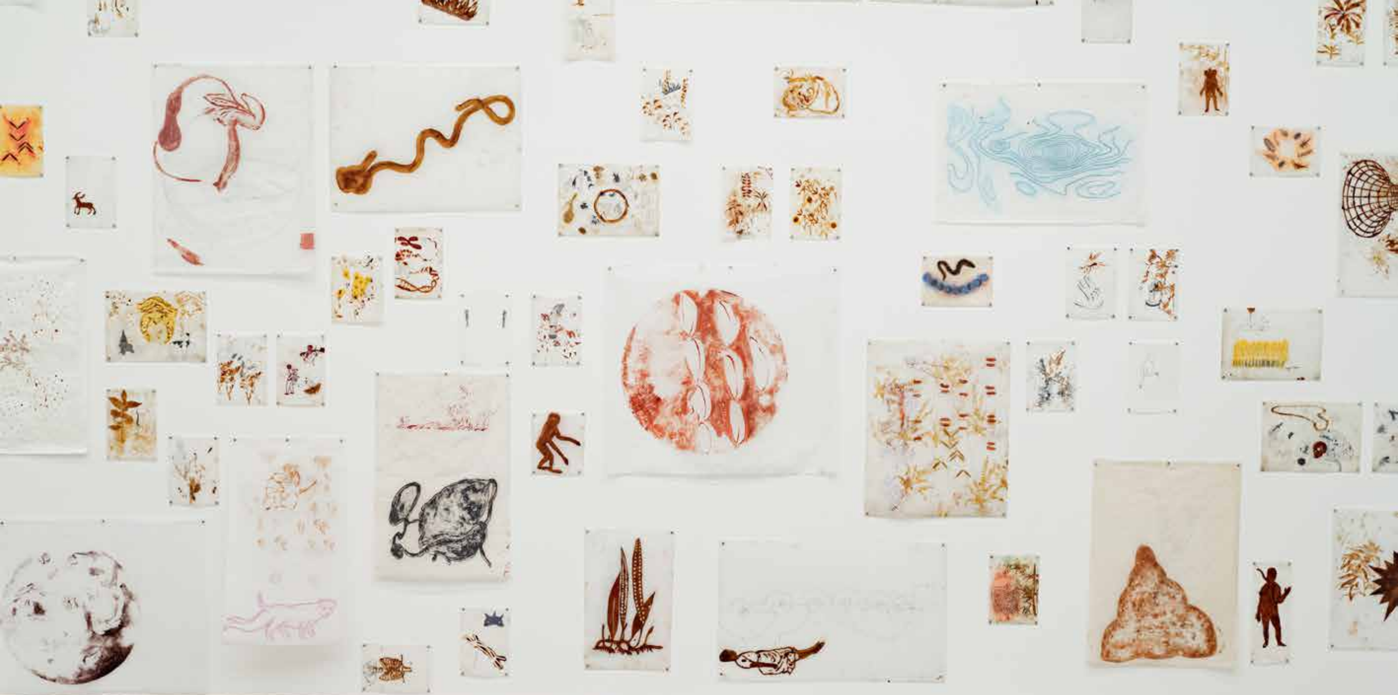
Installation view, "The disoriented garden... A breath of dream" at Jim Thompson Art Center, Bangkok, 2024