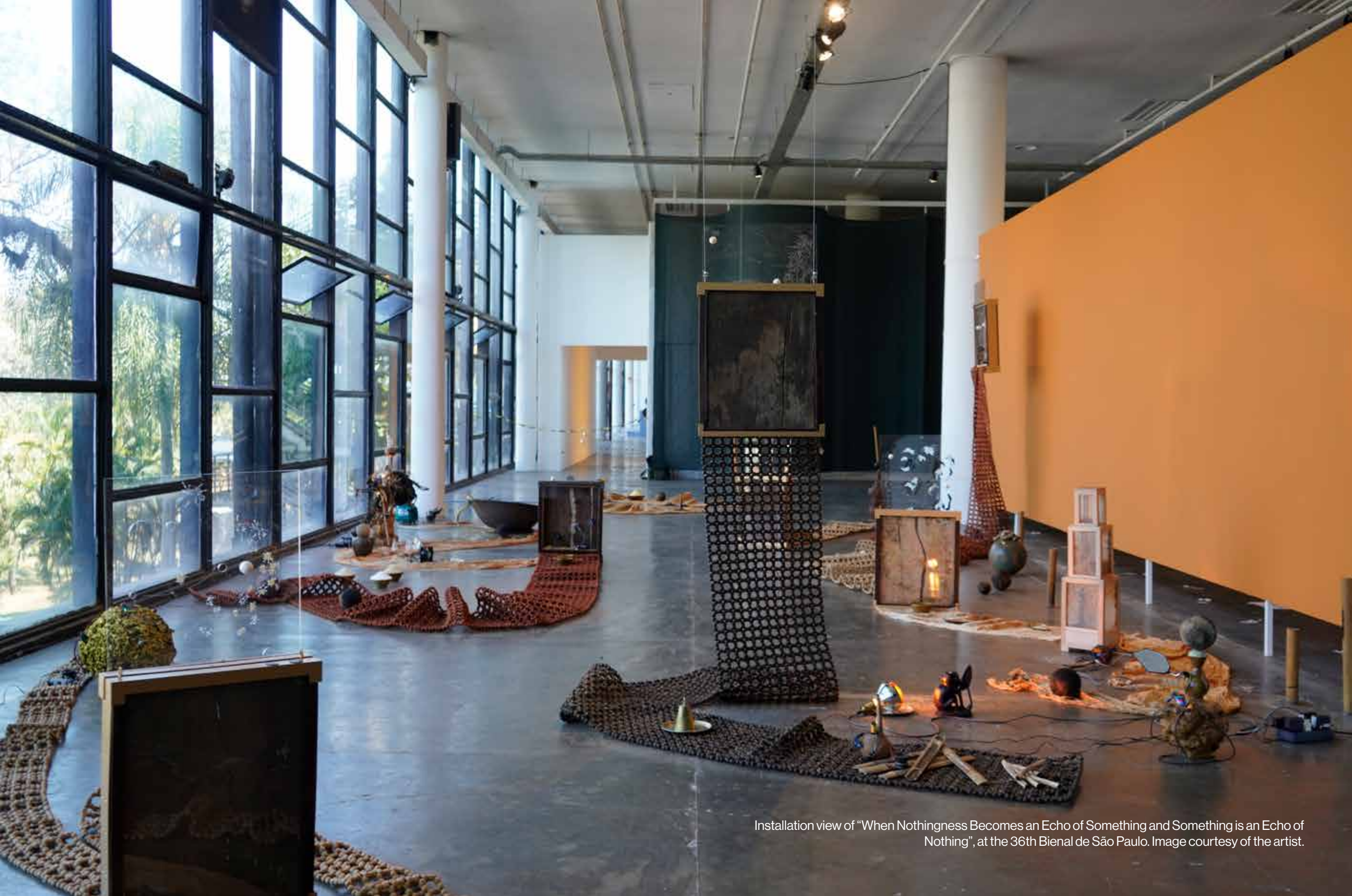
Installation view of "When Nothingness Becomes an Echo of Something and Something is an Echo of Nothing", at the 36th Bienal de São Paulo.