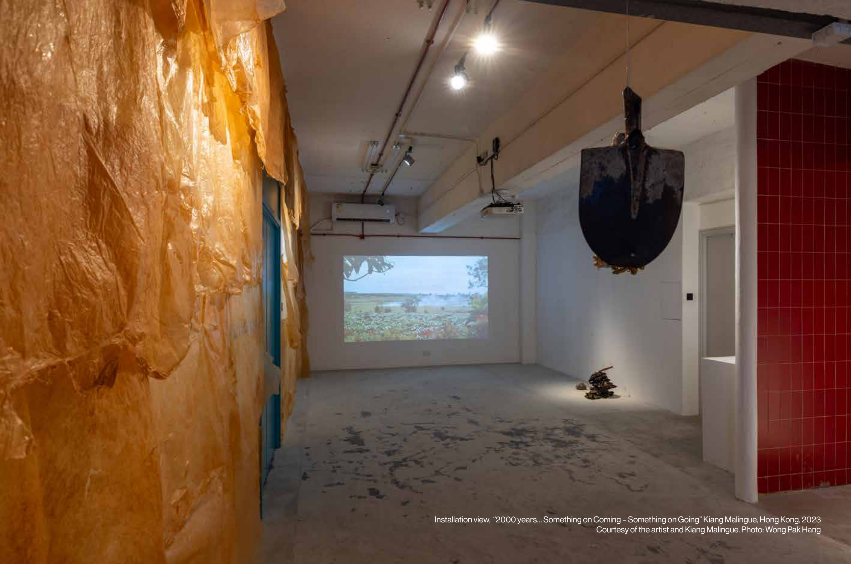
Installation view, "2000 years... Something on Coming – Something on Going" Kiang Malingue, Hong Kong, 2023