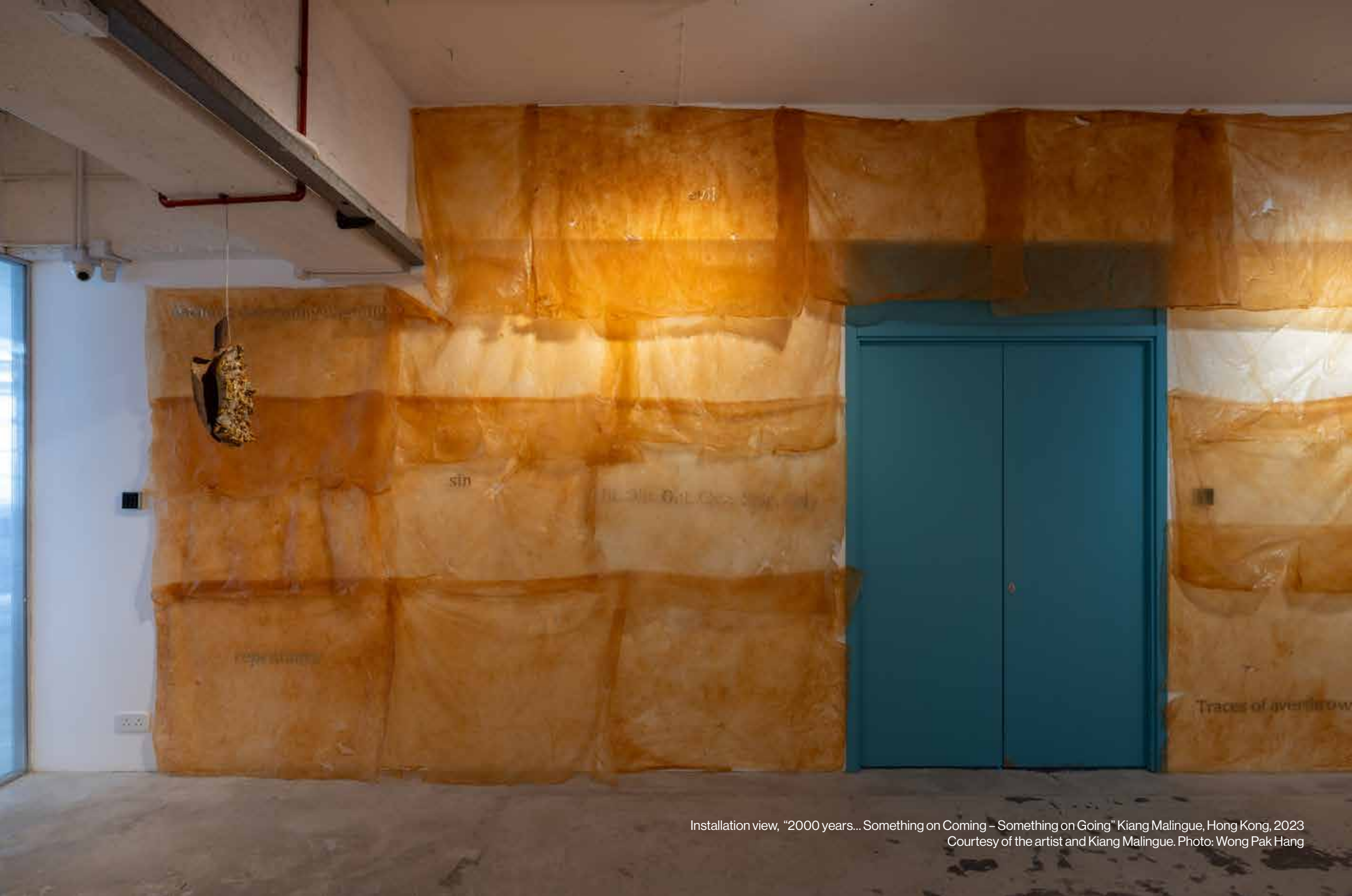
Installation view, "2000 years... Something on Coming – Something on Going" Kiang Malingue, Hong Kong, 2023 Courtesy of the artist and Kiang Malingue. Photo: Wong Pak Hang