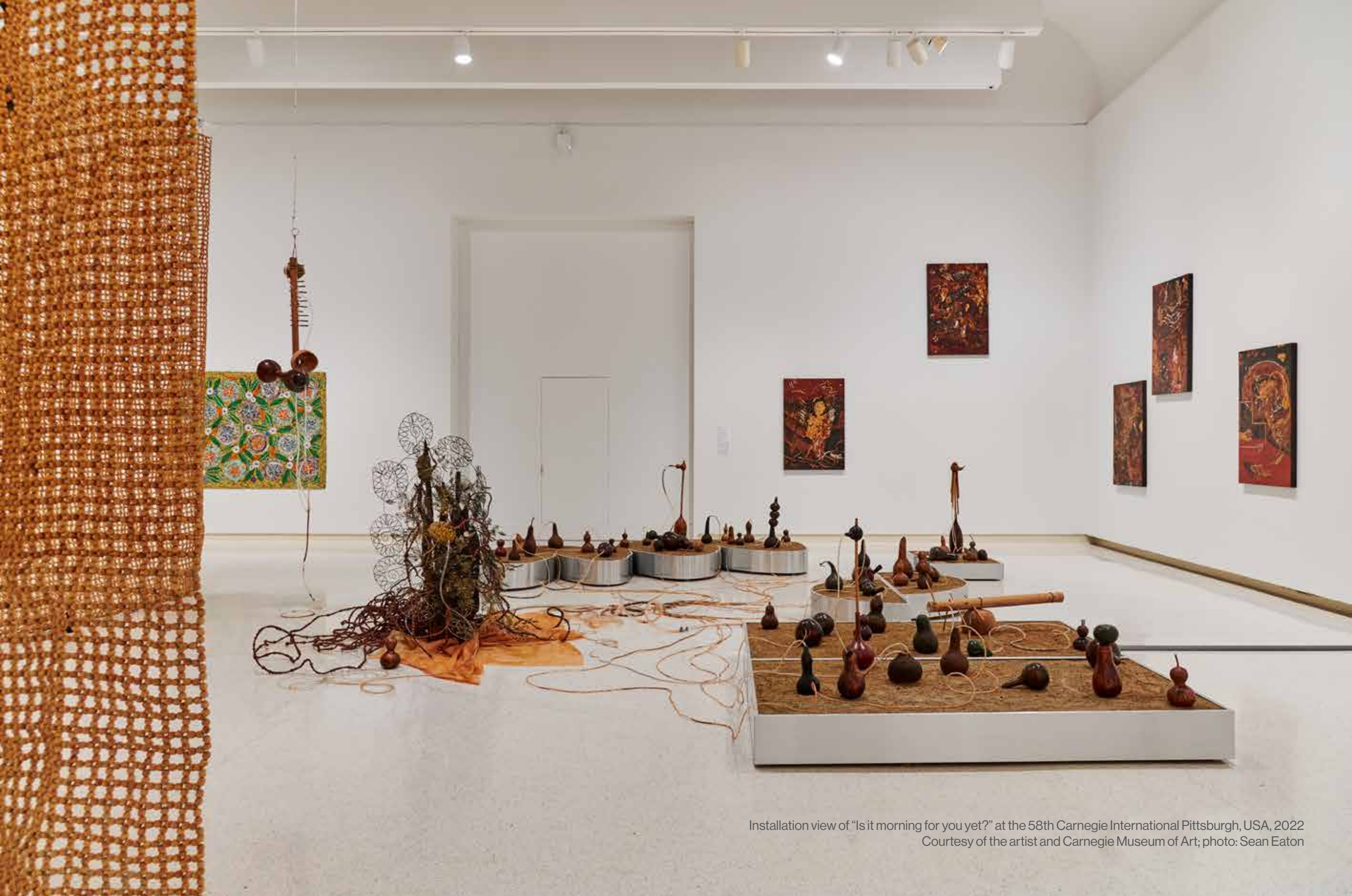
Installation view of "Is it morning for you yet?" at the 58th Carnegie International Pittsburgh, USA, 2022