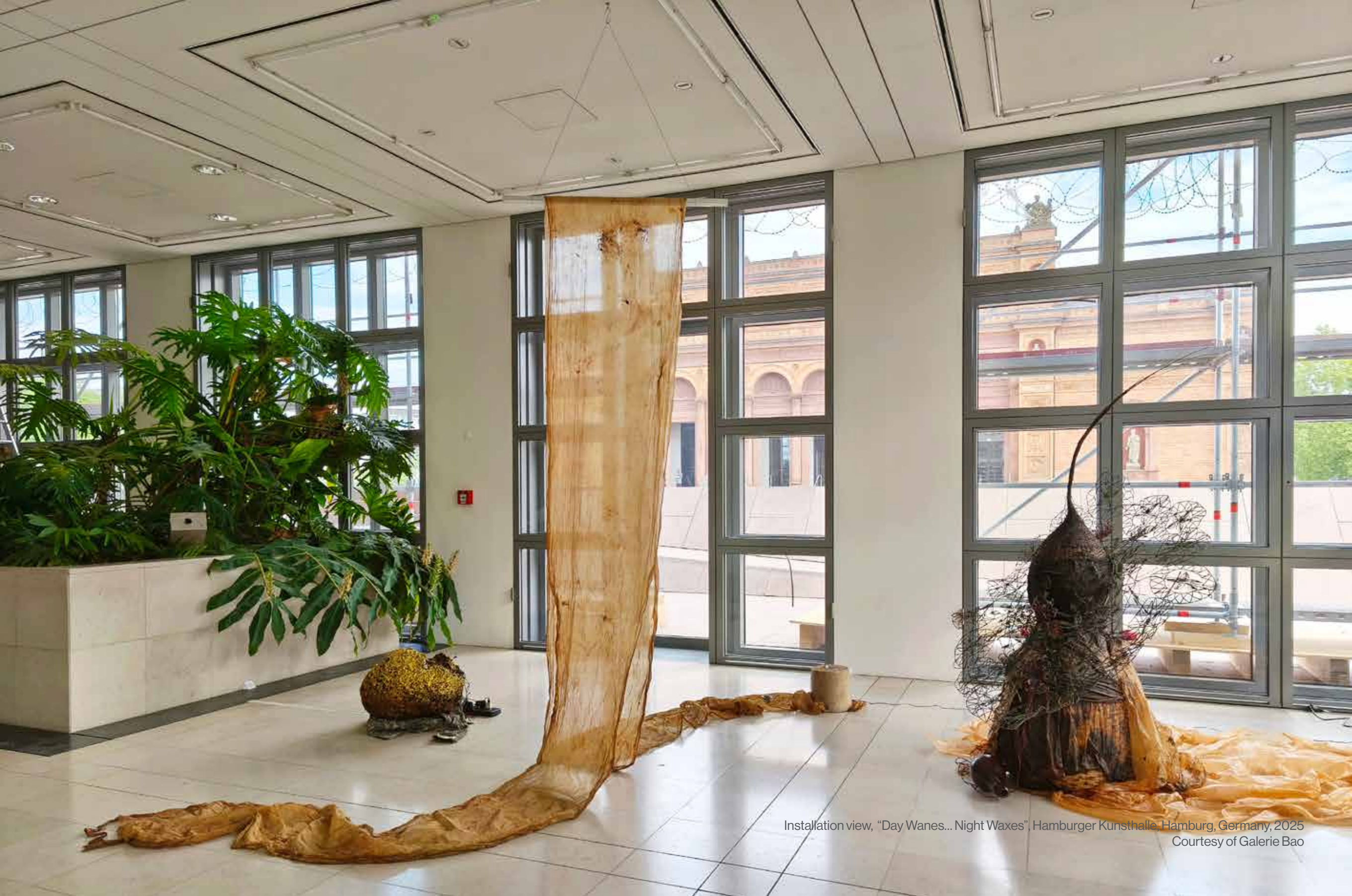
Installation view, "Day Wanes... Night Waxes", Hamburger Kunsthalle, Hamburg, Germany, 2025