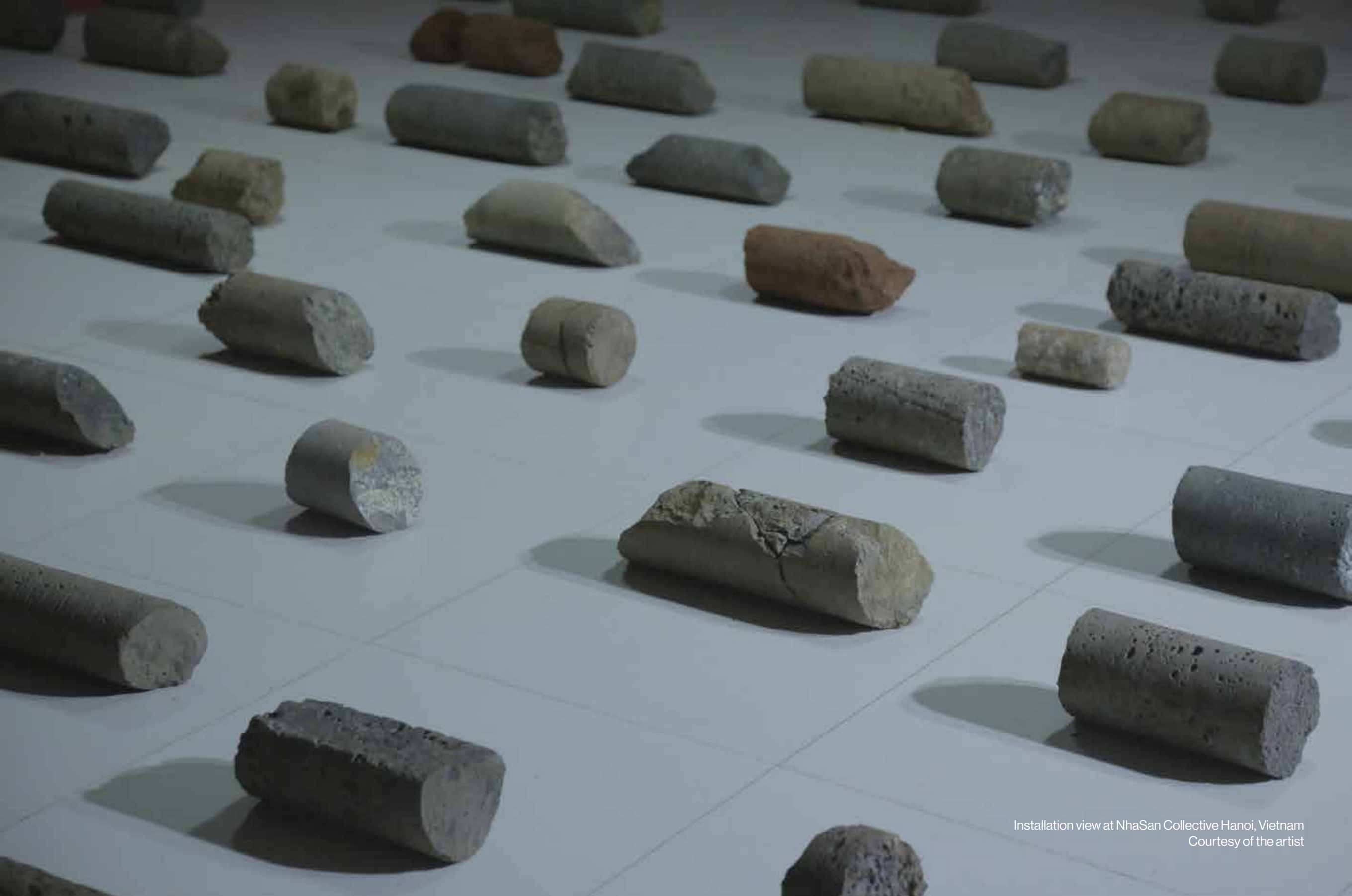
Installation view at NhaSan Collective Hanoi, Vietnam