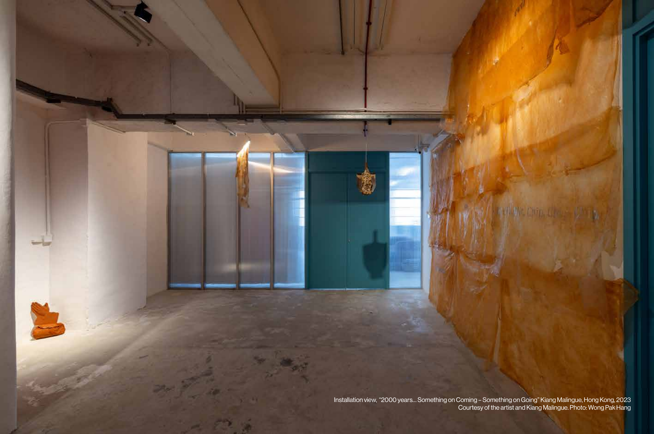
Installation view, "2000 years... Something on Coming – Something on Going" Kiang Malingue, Hong Kong, 2023