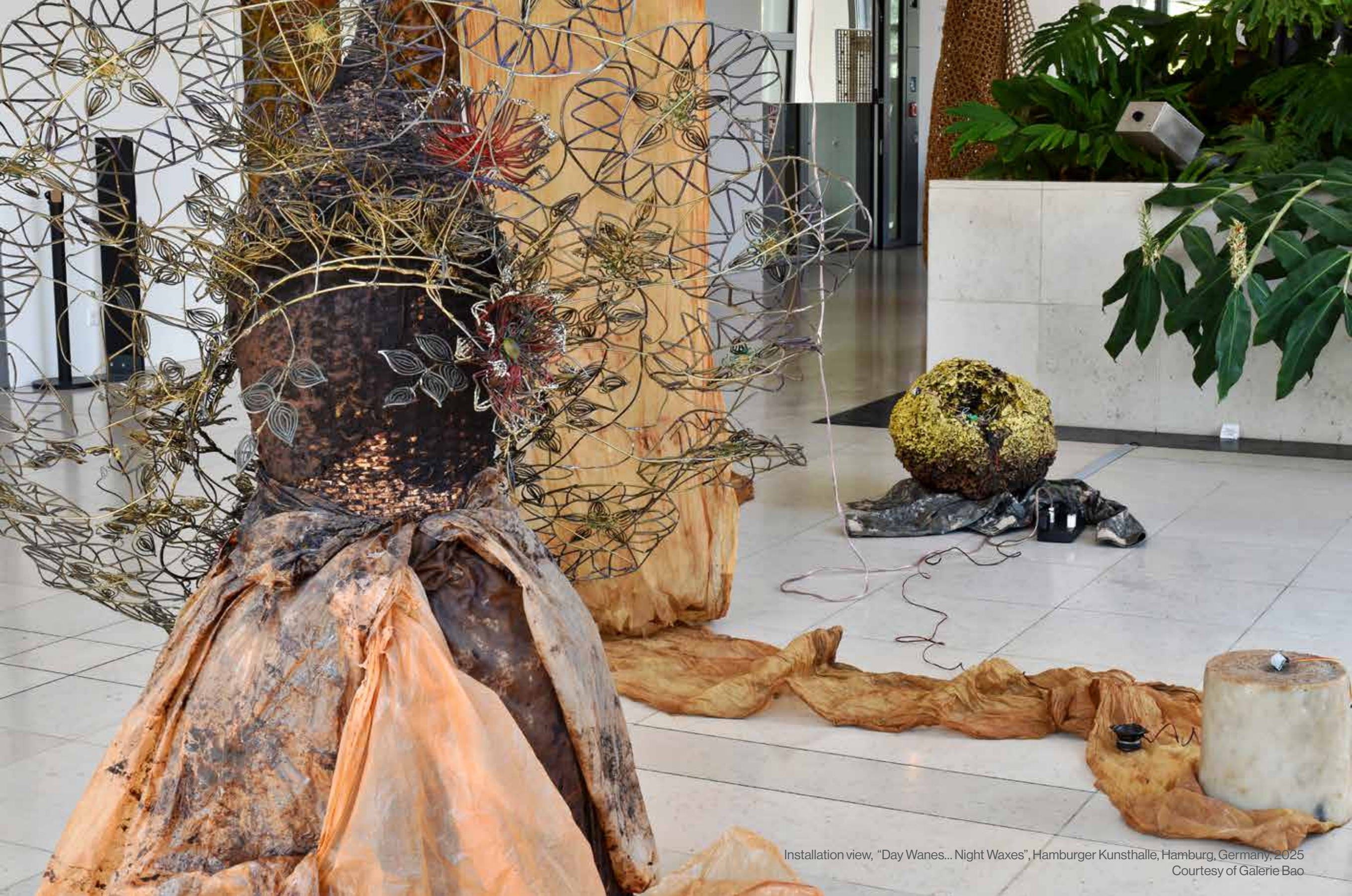
Installation view, "Day Wanes... Night Waxes", Hamburger Kunsthalle, Hamburg, Germany, 2025