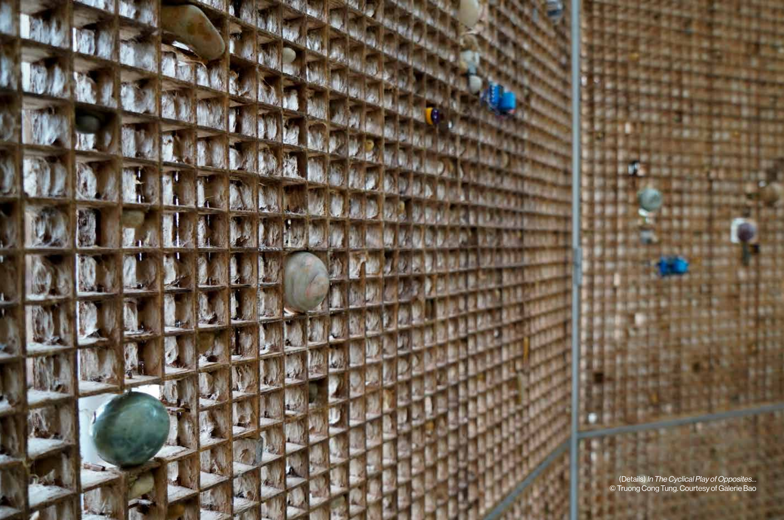
(Details) In The Cyclical Play of Opposites... © Truong Cong Tung.