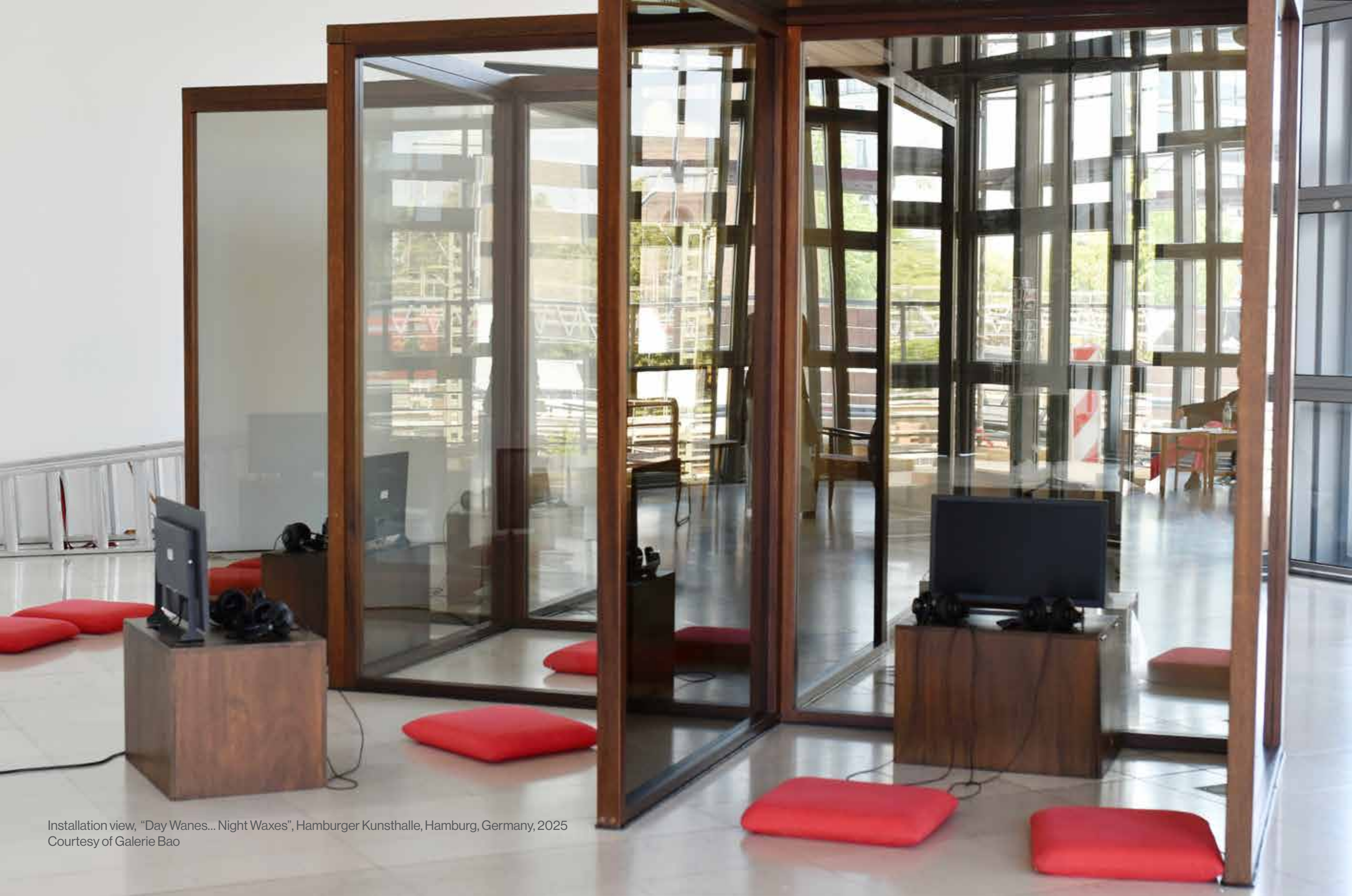
Installation view, "Day Wanes... Night Waxes", Hamburger Kunsthalle, Hamburg, Germany, 2025