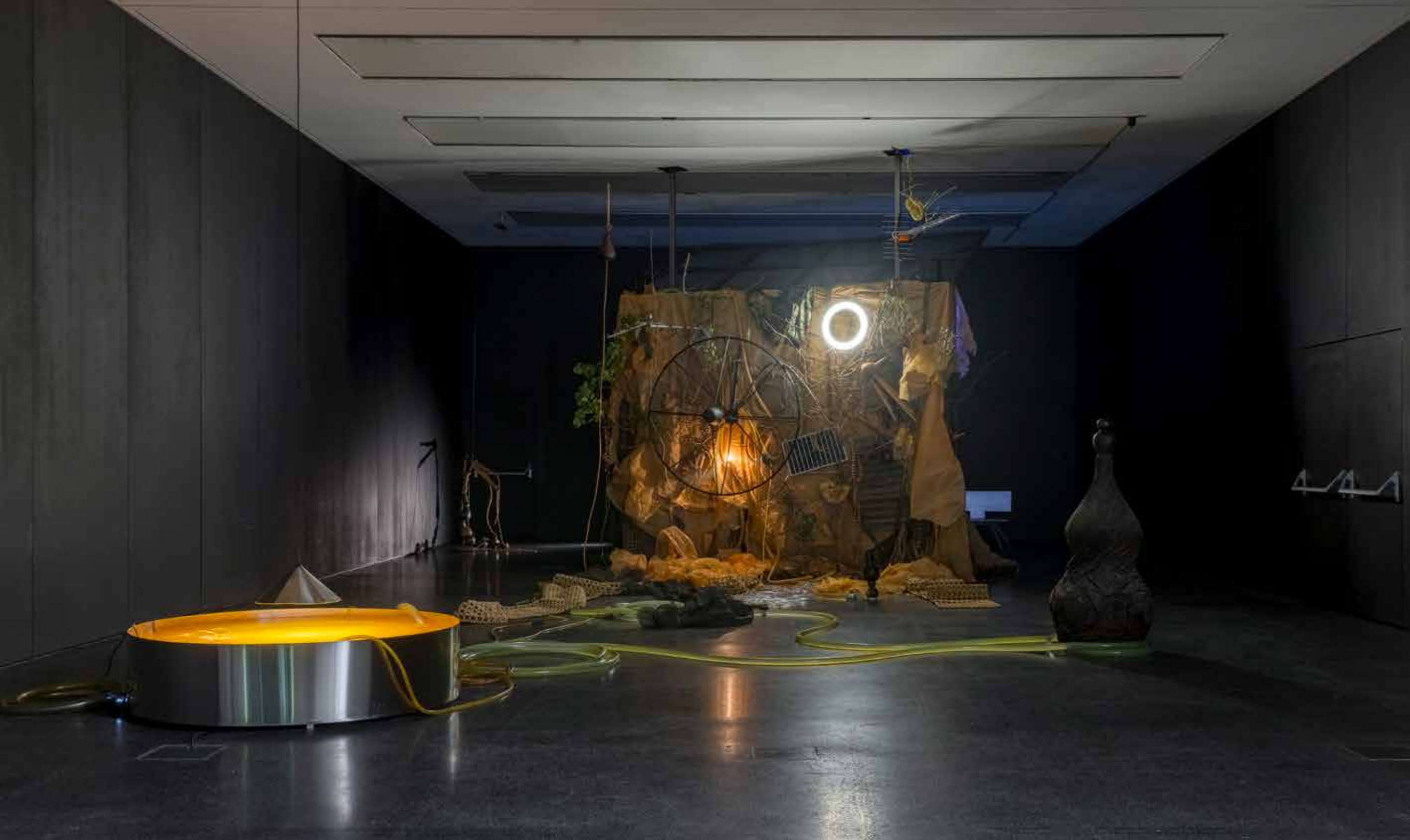
Installation view of "The Disorientated Garden... a Breath of Dreams" at Museion, Bolzano, Italy, 2024