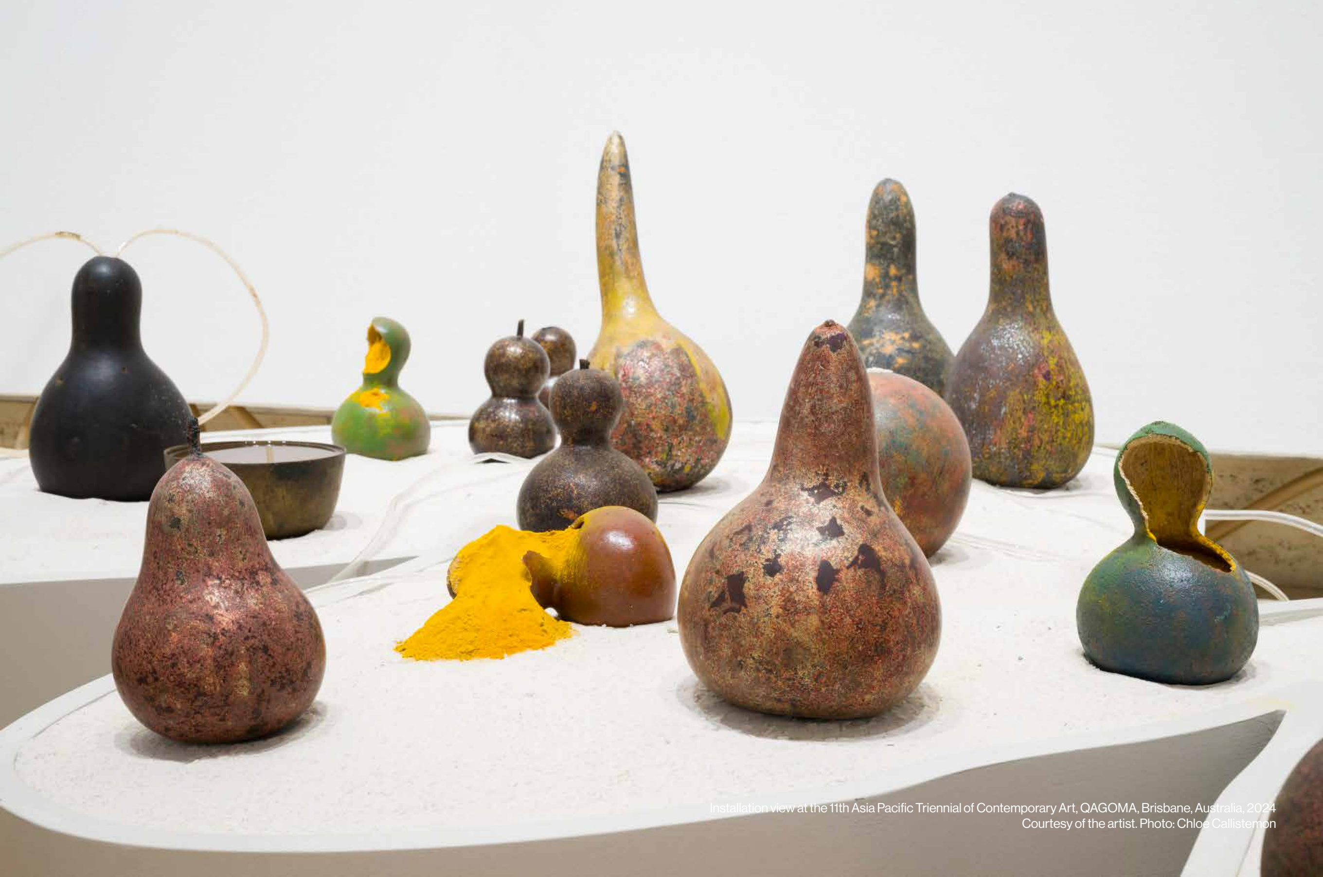
Installation view at the 11th Asia Pacific Triennial of Contemporary Art, QAGOMA, Brisbane, Australia, 2024