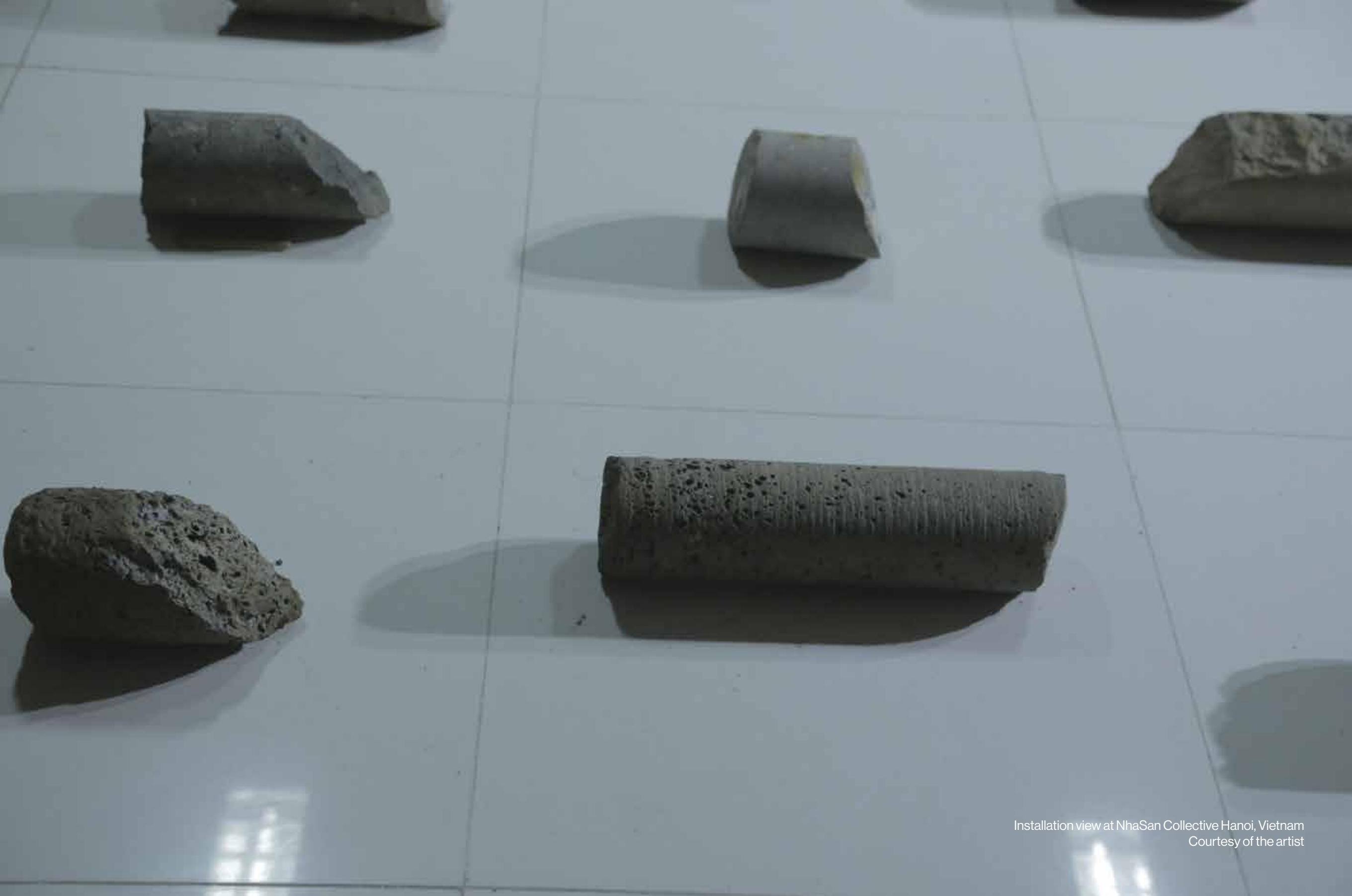
Installation view at NhaSan Collective Hanoi, Vietnam