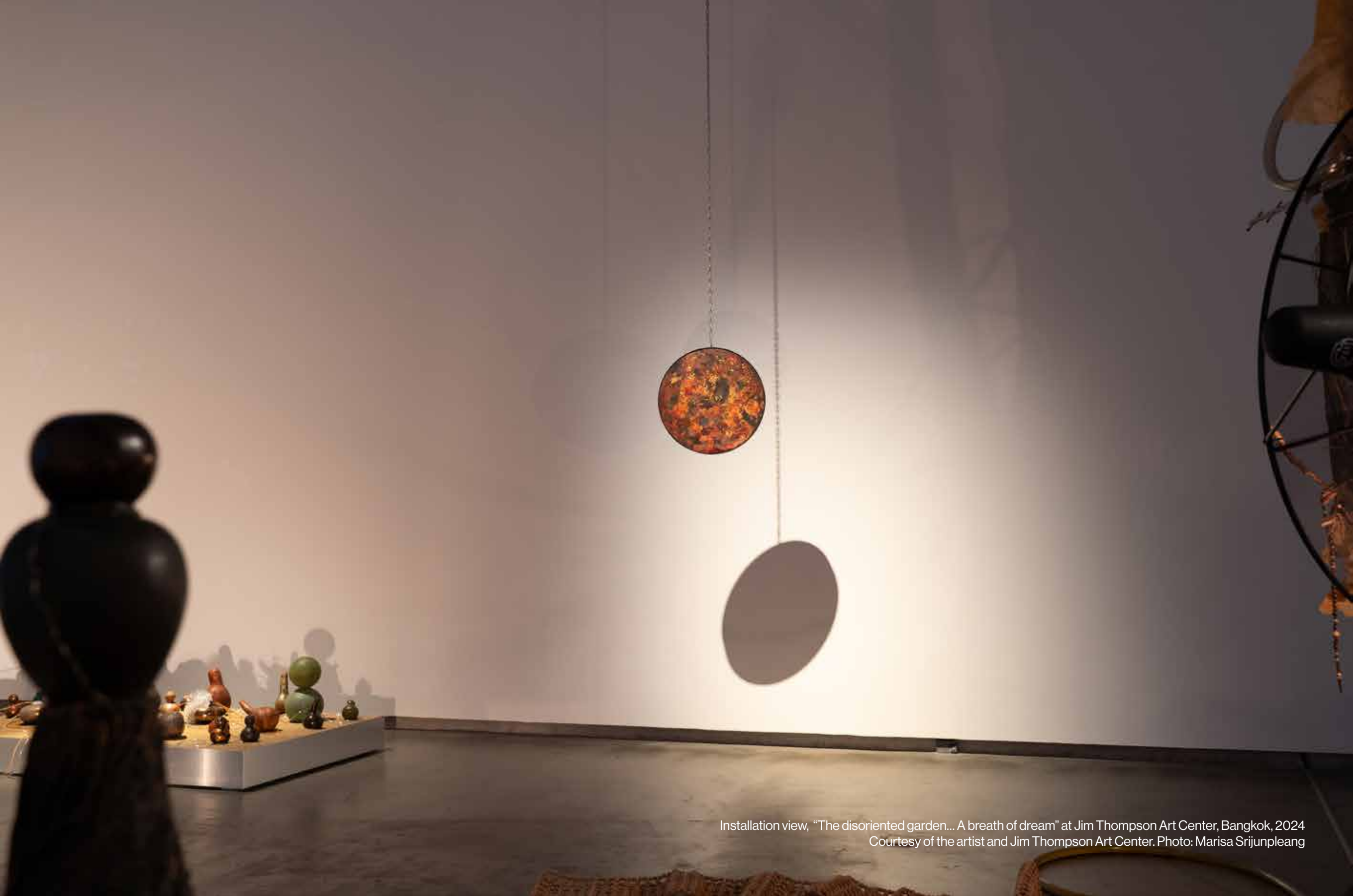
Installation view, "The disoriented garden... A breath of dream" at Jim Thompson Art Center, Bangkok, 2024