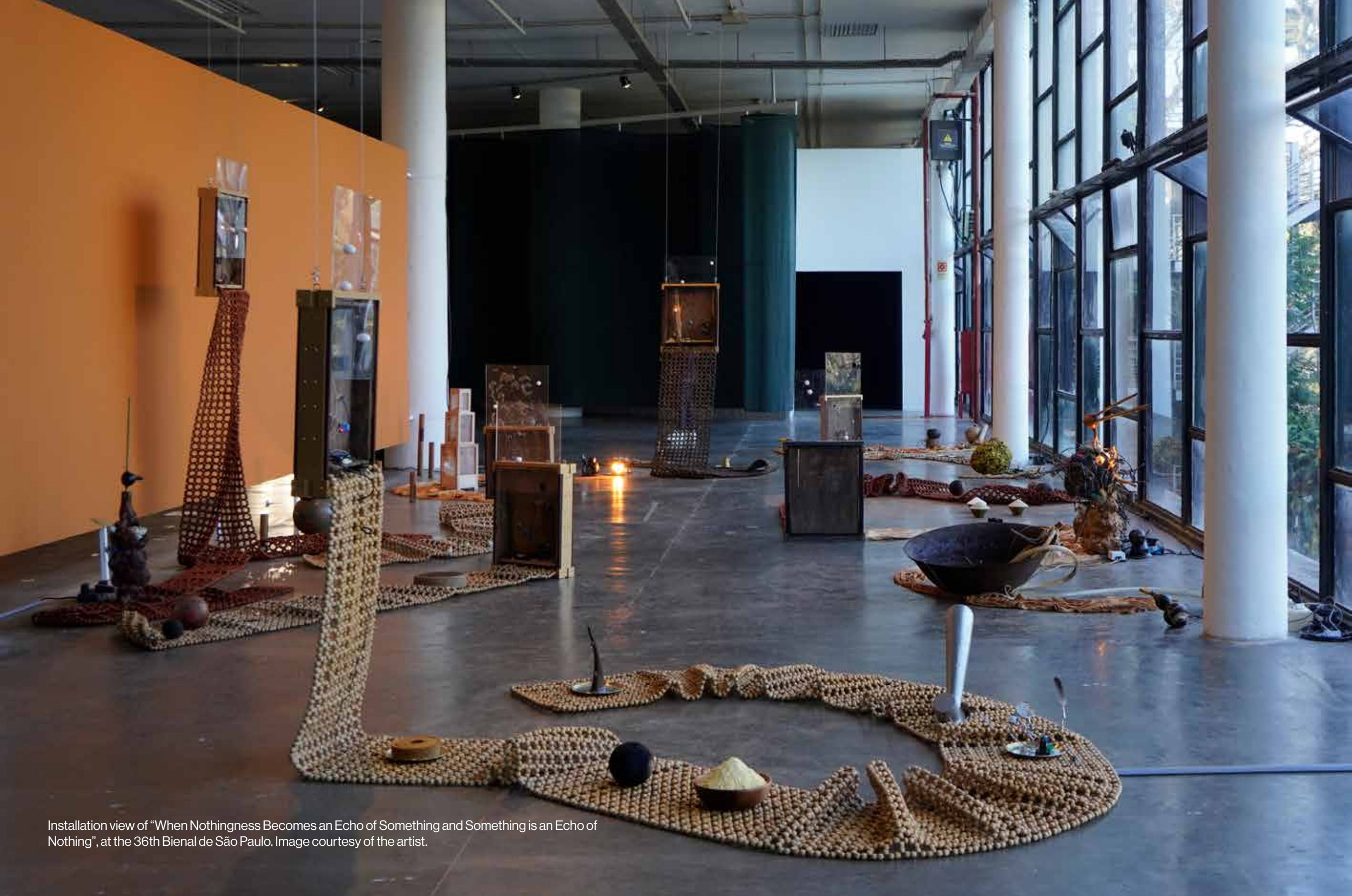
Installation view of "When Nothingness Becomes an Echo of Something and Something is an Echo of Nothing", at the 36th Bienal de São Paulo.