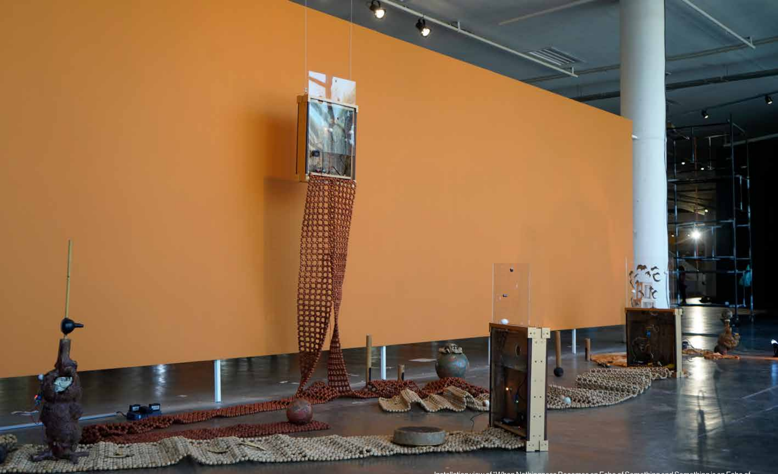
Installation view of "When Nothingness Becomes an Echo of Something and Something is an Echo of Nothing", at the 36th Bienal de São Paulo.