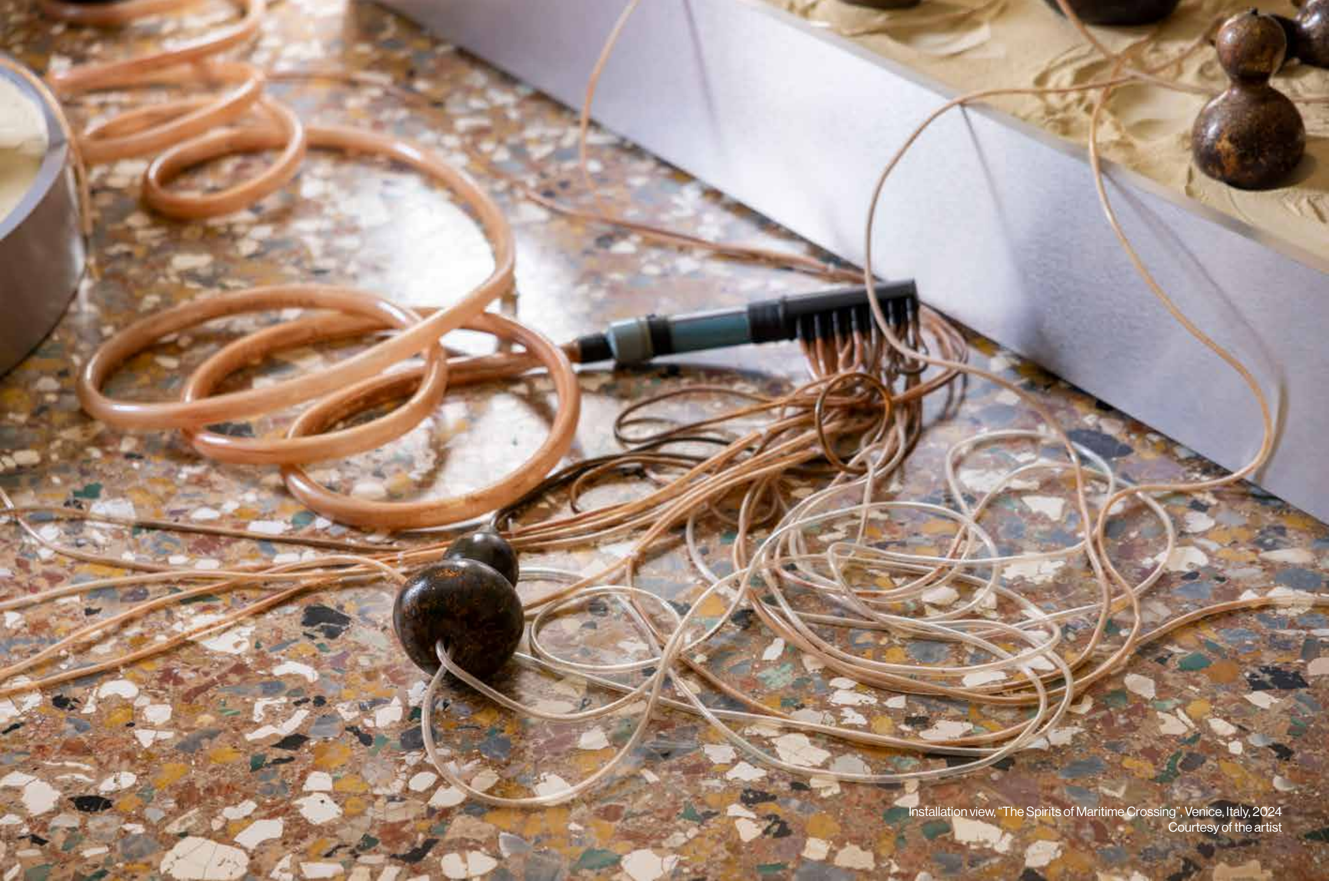
Installation view, "The Spirits of Maritime Crossing", Venice, Italy, 2024