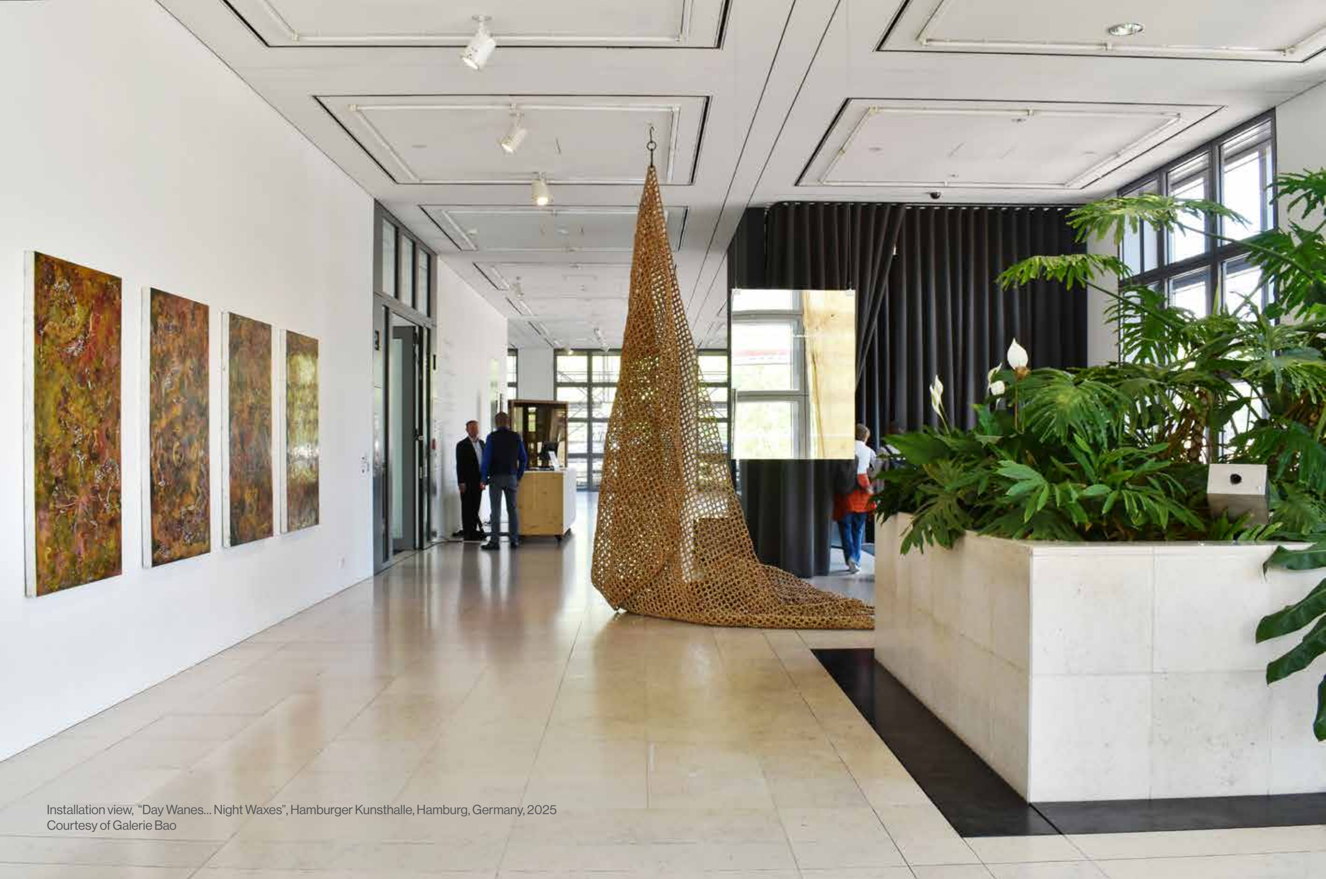
Installation view, "Day Wanes... Night Waxes", Hamburger Kunsthalle, Hamburg, Germany, 2025