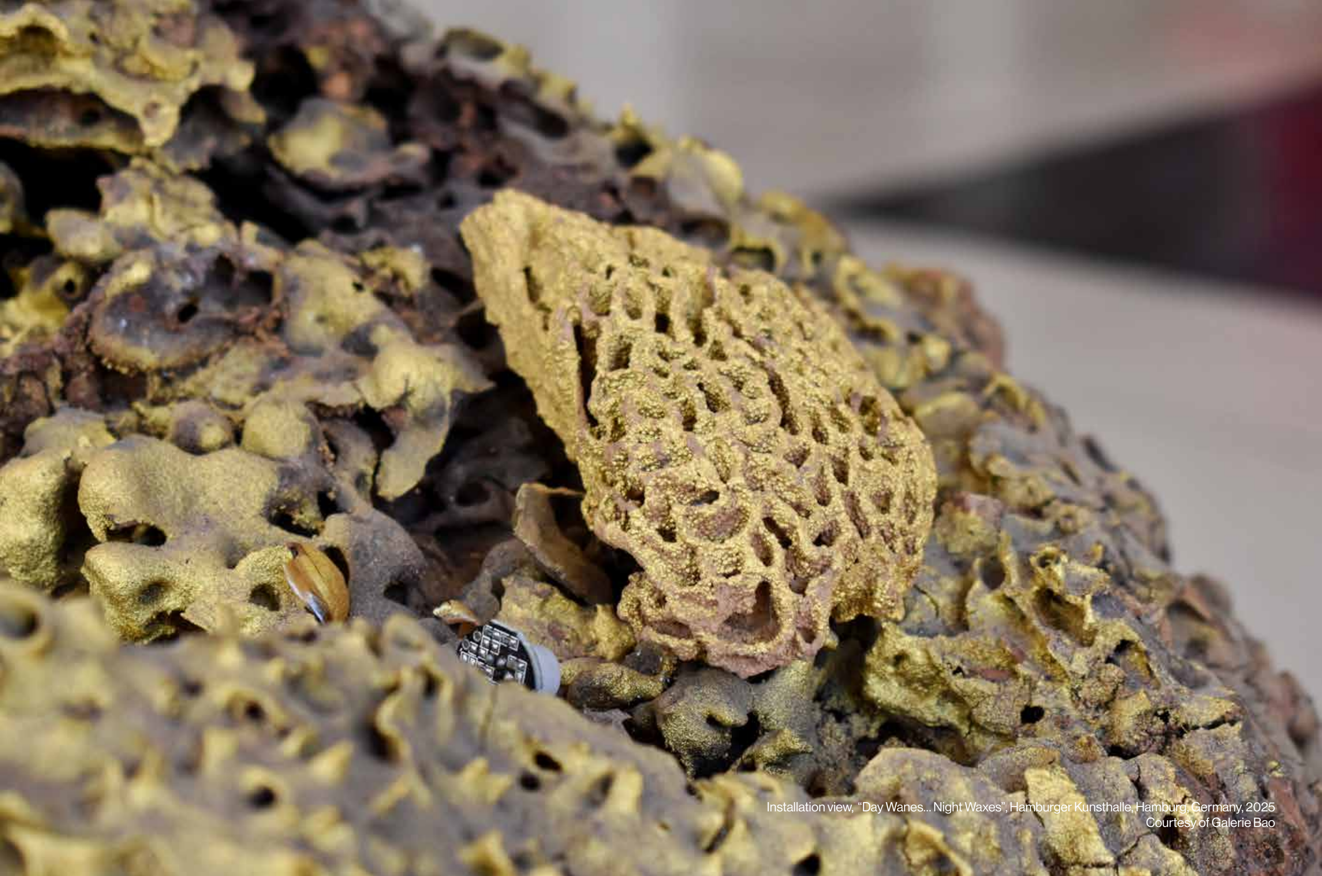
Installation view, "Day Wanes... Night Waxes", Hamburger Kunsthalle, Hamburg, Germany, 2025