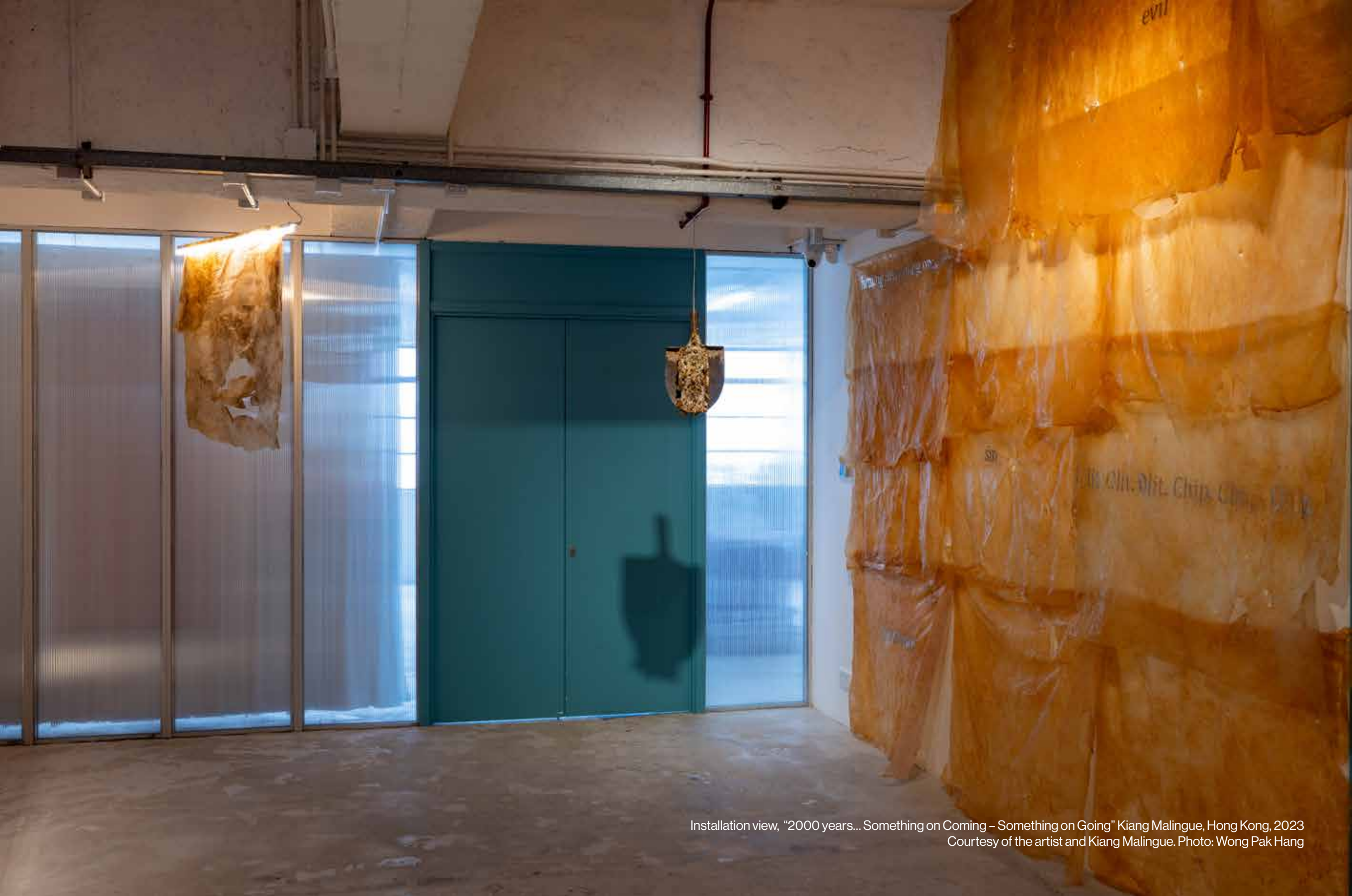
Installation view, "2000 years... Something on Coming - Something on Going" Kiang Malingue, Hong Kong, 2023