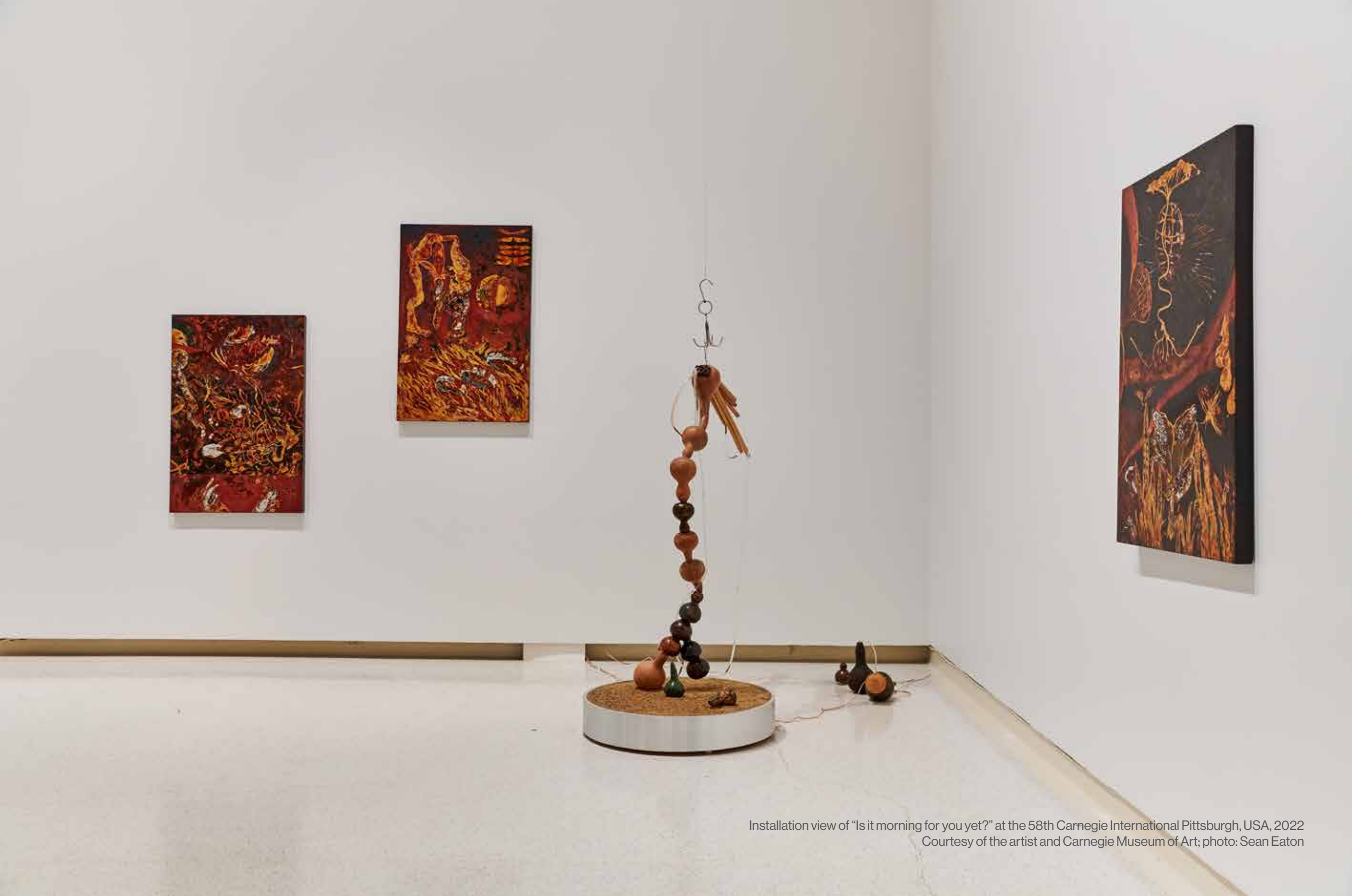
Installation view of "Is it morning for you yet?" at the 58th Carnegie International Pittsburgh, USA, 2022