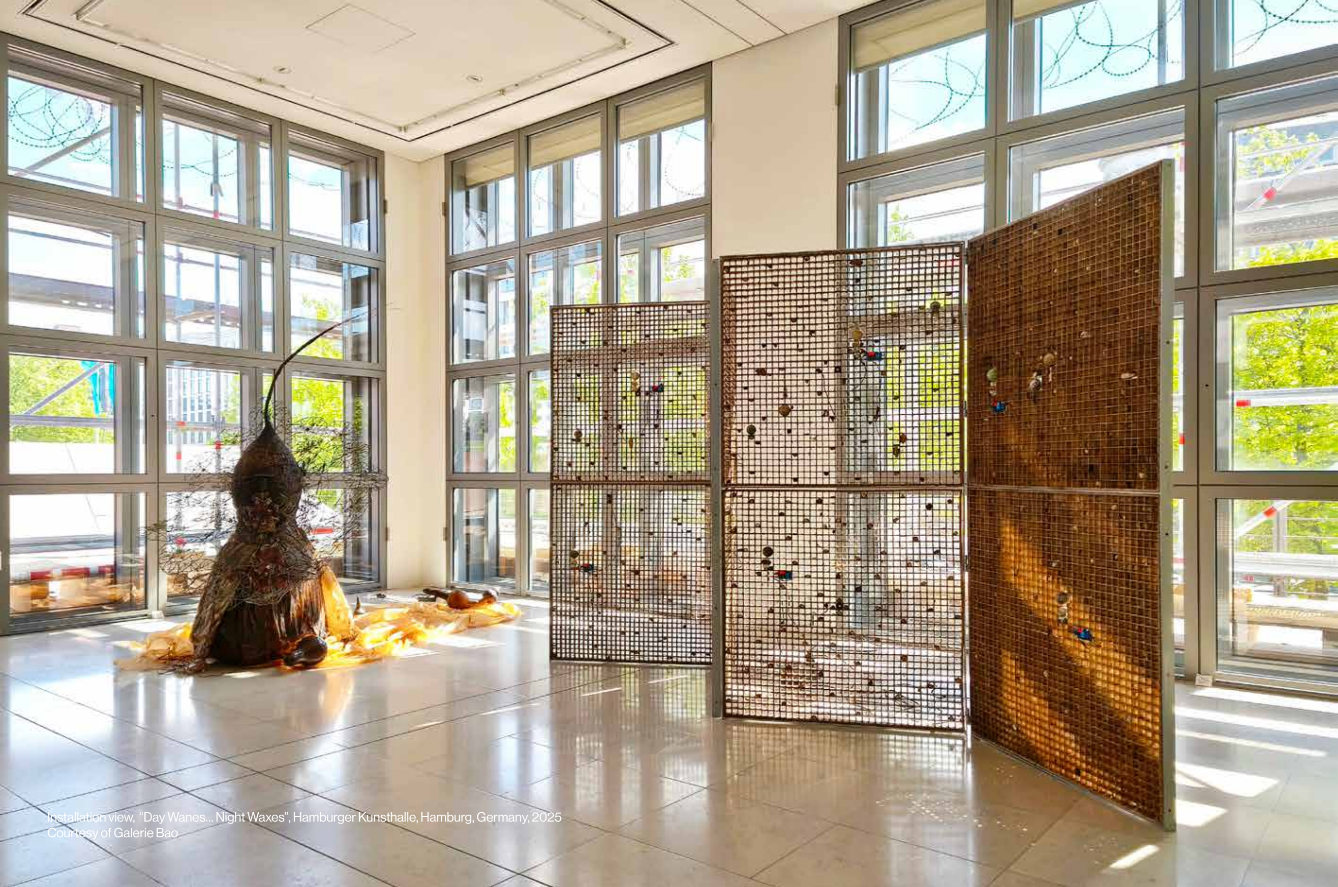
Installation view, "Day Wanes... Night Waxes", Hamburger Kunsthalle, Hamburg, Germany, 2025