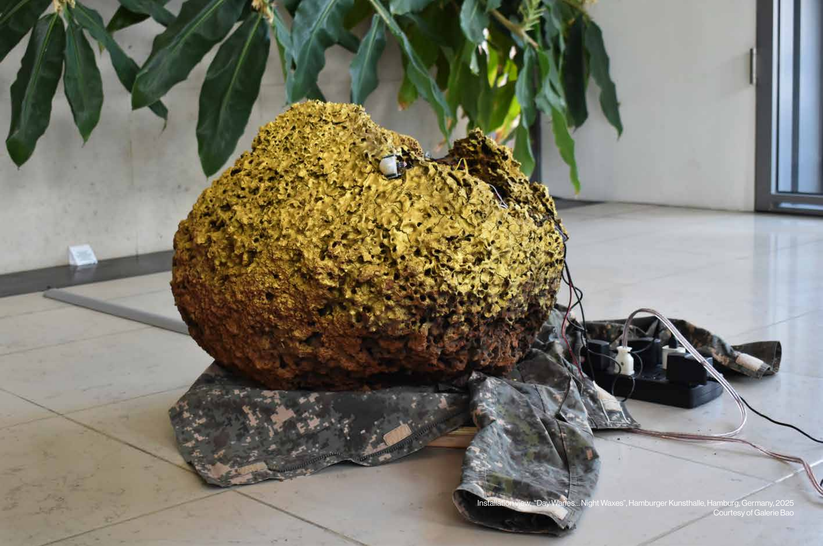
Installation view, "Day Wanes... Night Waxes", Hamburger Kunsthalle, Hamburg, Germany, 2025