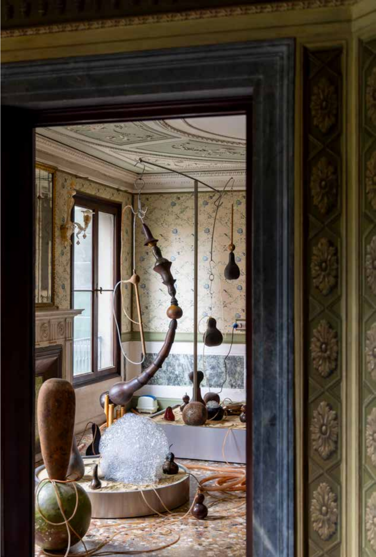
Installation view, "The Spirits of Maritime Crossing", Venice, Italy, 2024