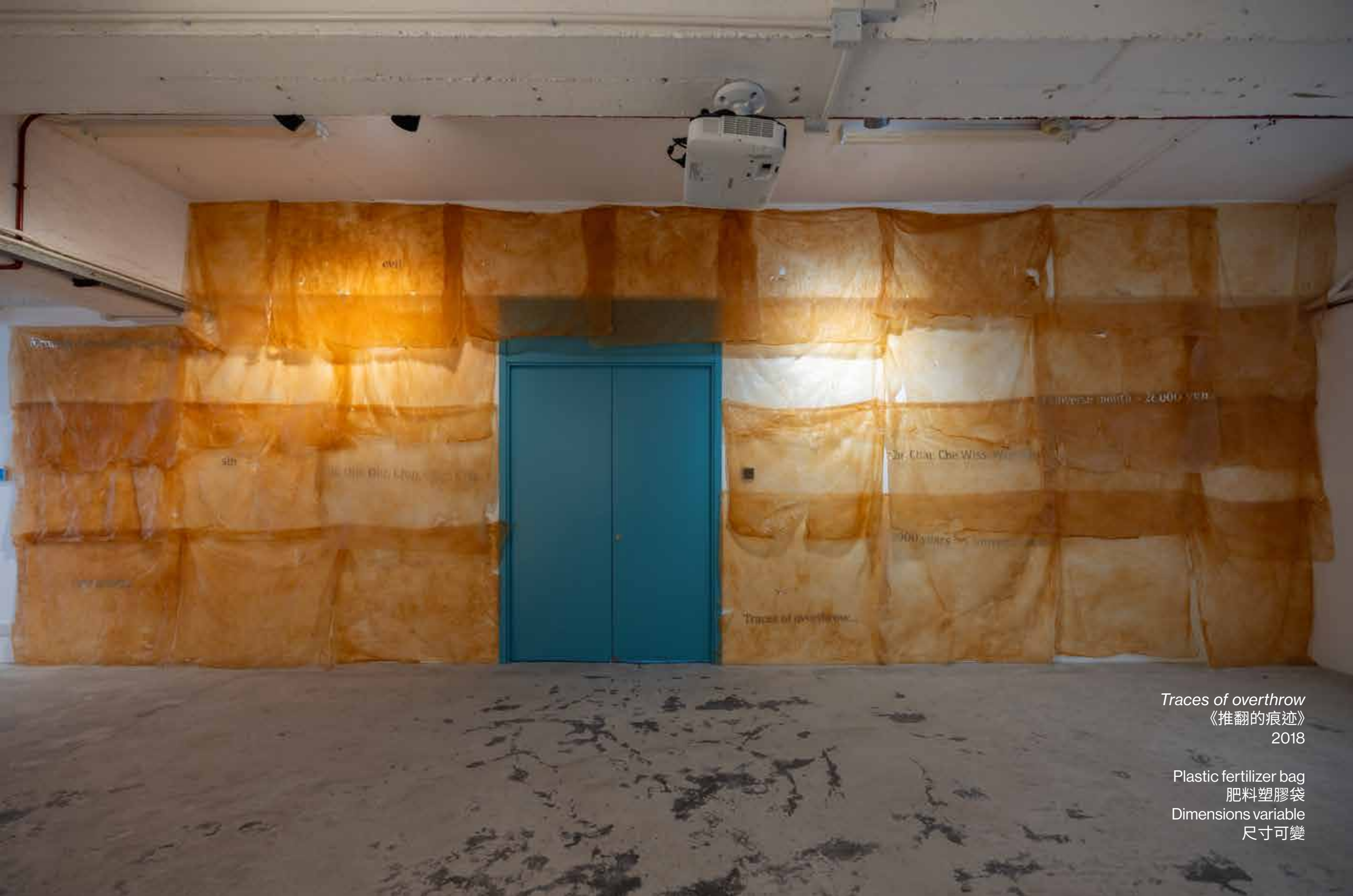
Traces of overthrow 《推翻的痕迹》 2018

Plastic fertilizer bag 肥料塑膠袋 Dimensions variable 尺寸可變