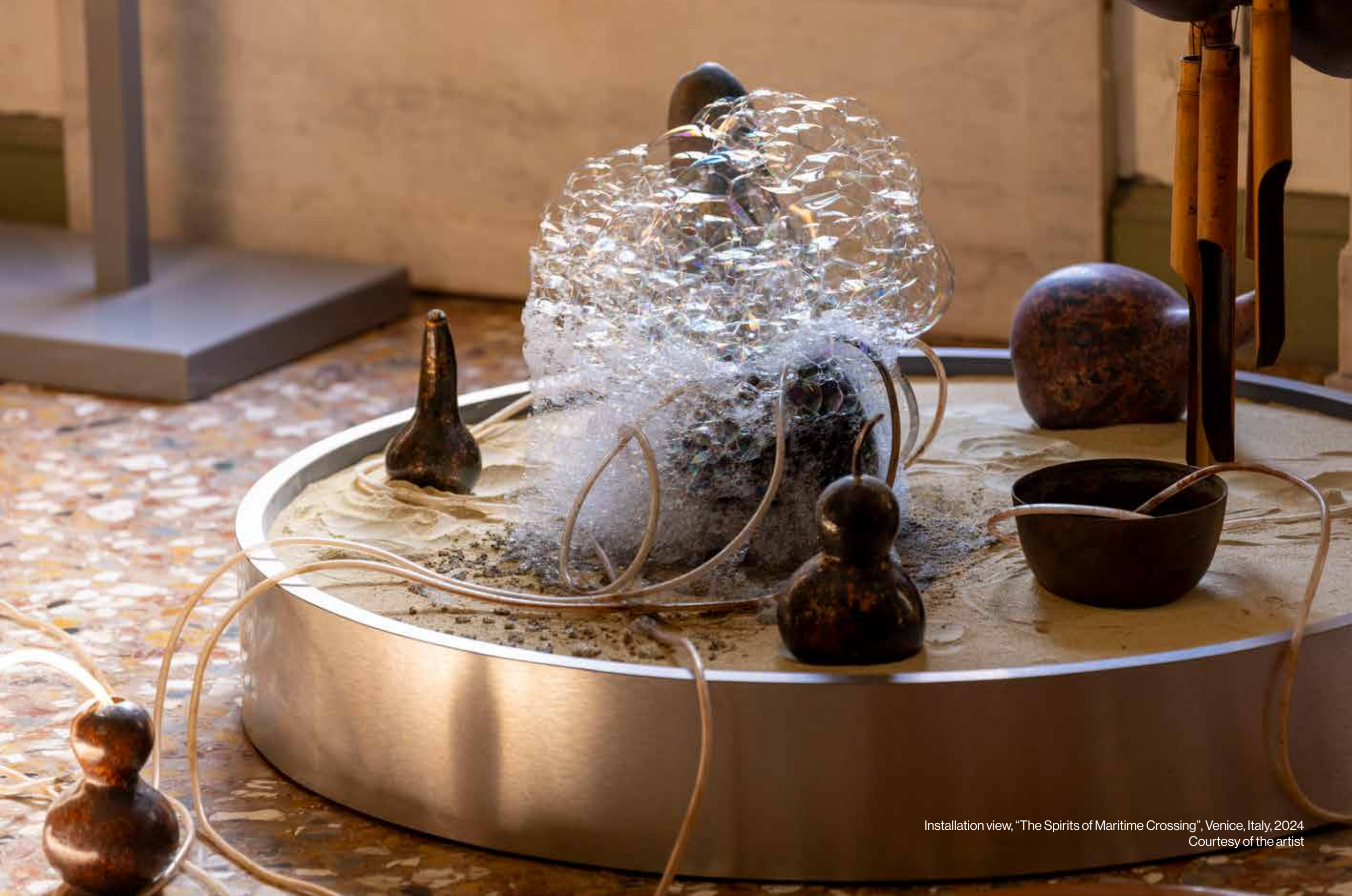
Installation view, "The Spirits of Maritime Crossing", Venice, Italy, 2024