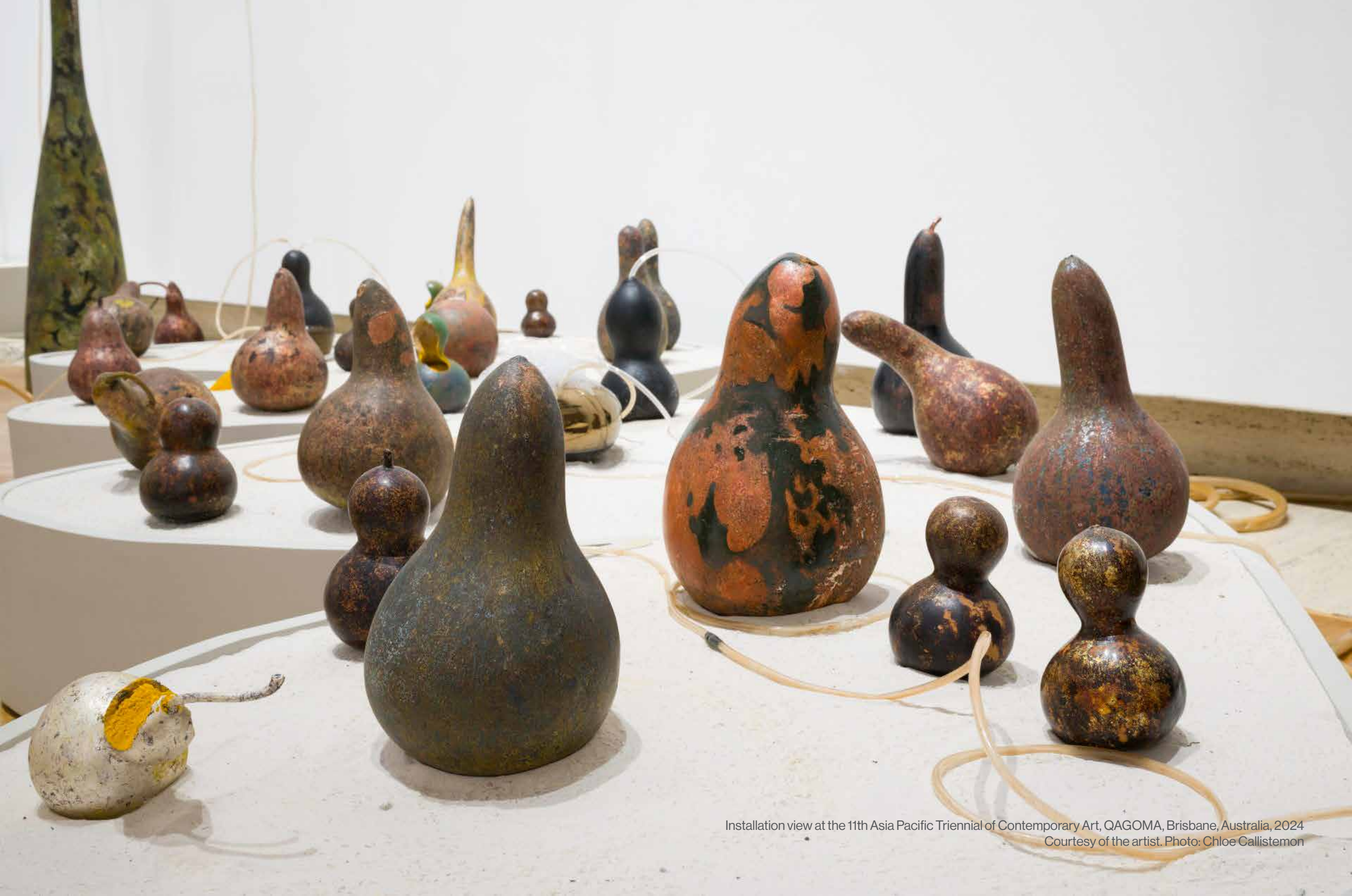
Installation view at the 11th Asia Pacific Triennial of Contemporary Art, QAGOMA, Brisbane, Australia, 2024