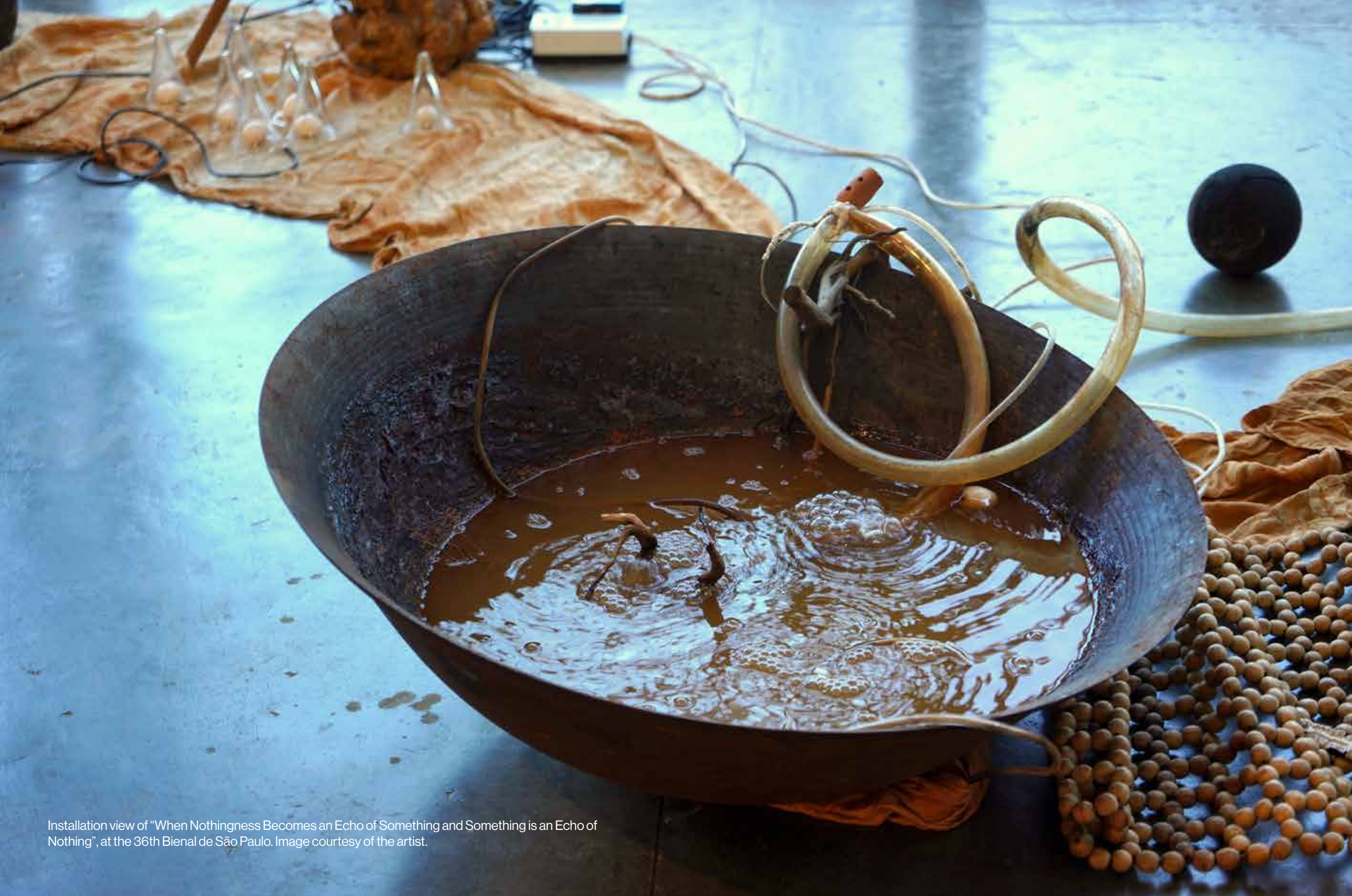
Installation view of "When Nothingness Becomes an Echo of Something and Something is an Echo of Nothing", at the 36th Bienal de São Paulo.