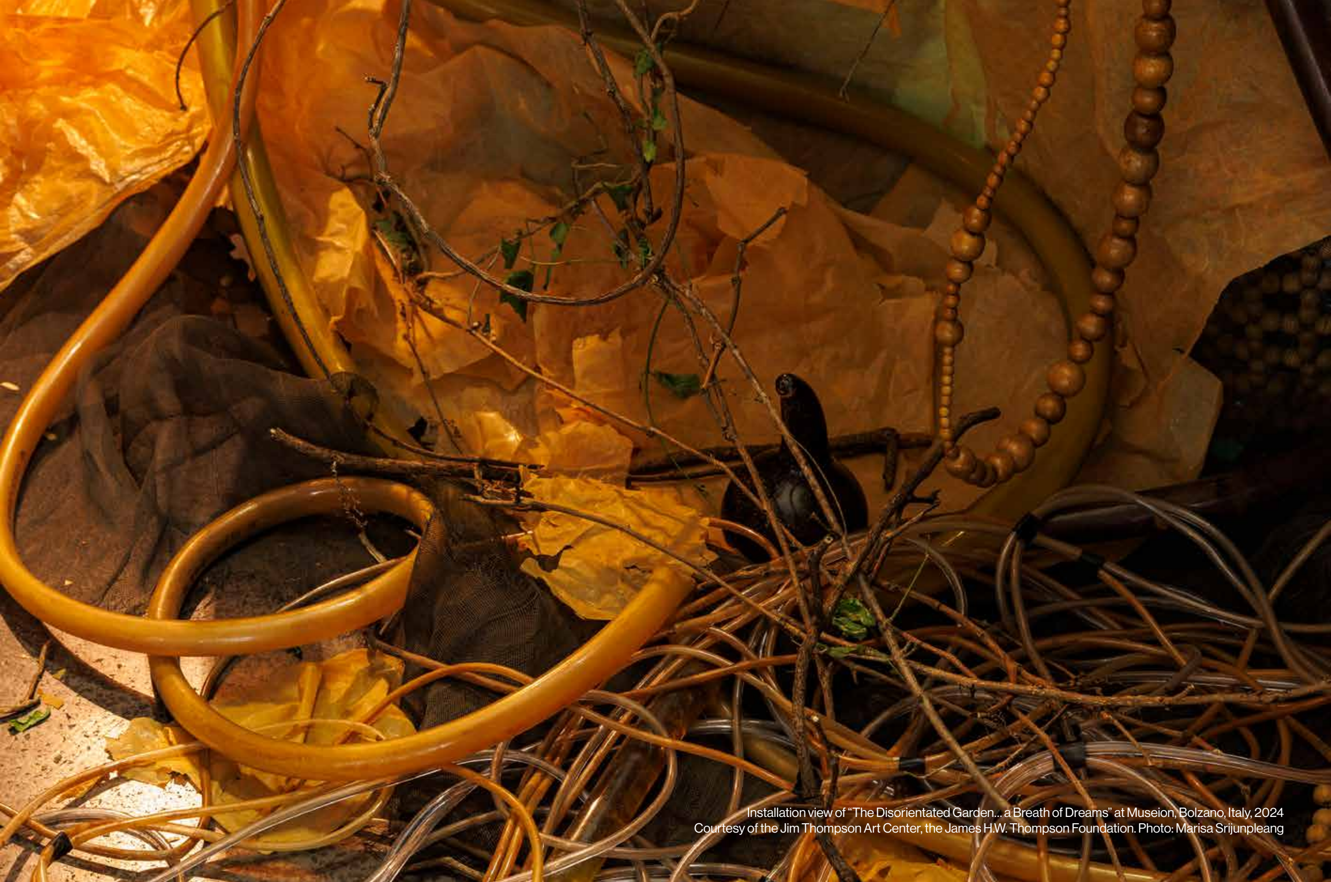
Installation view of "The Disorientated Garden... a Breath of Dreams" at Museion, Bolzano, Italy, 2024 Courtesy of the Jim Thompson Art Center, the James H.W. Thompson Foundation. Photo: Marisa Srijunpleang