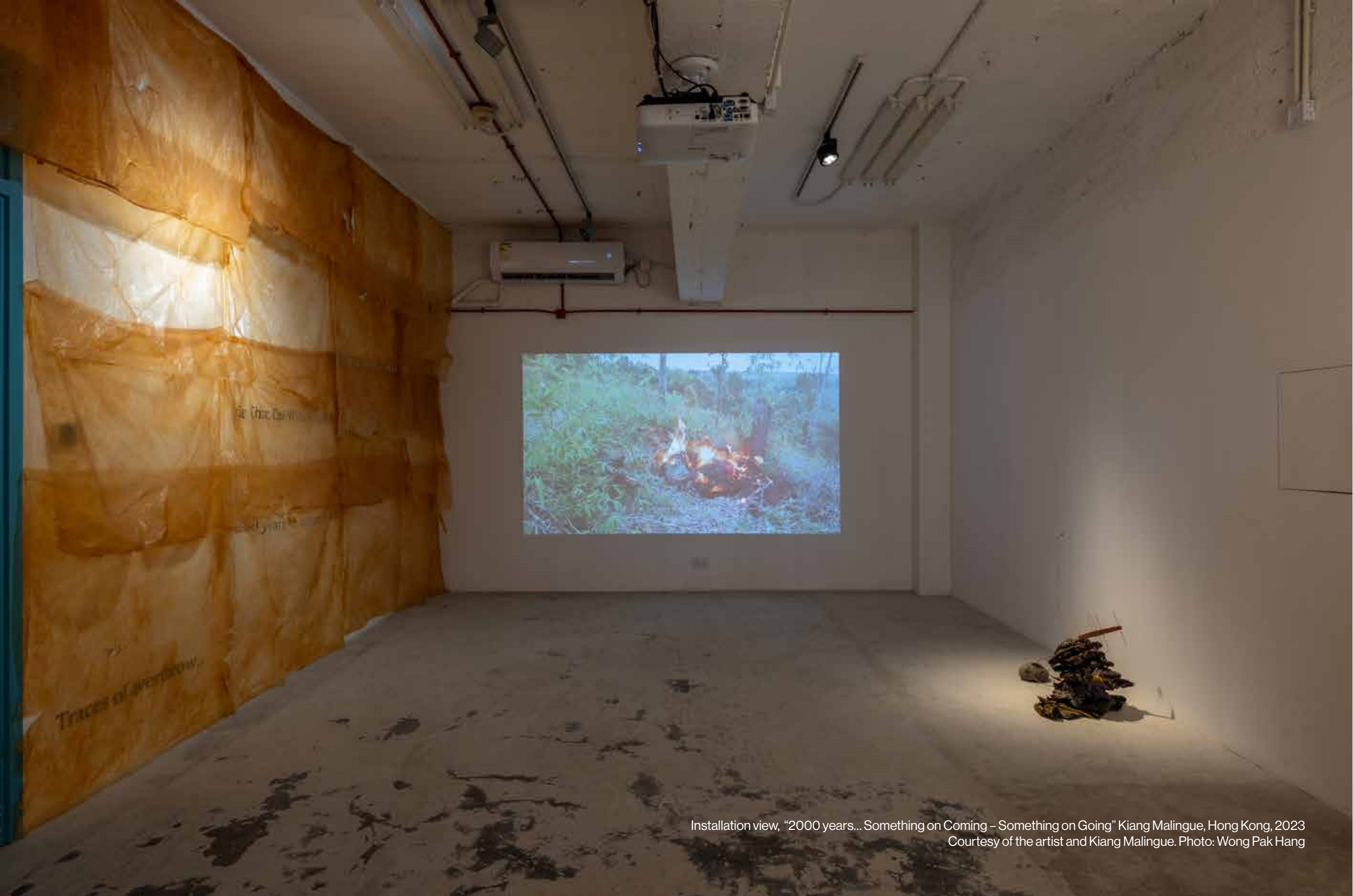
Installation view, "2000 years... Something on Coming – Something on Going" Kiang Malingue, Hong Kong, 2023 Courtesy of the artist and Kiang Malingue. Photo: Wong Pak Hang