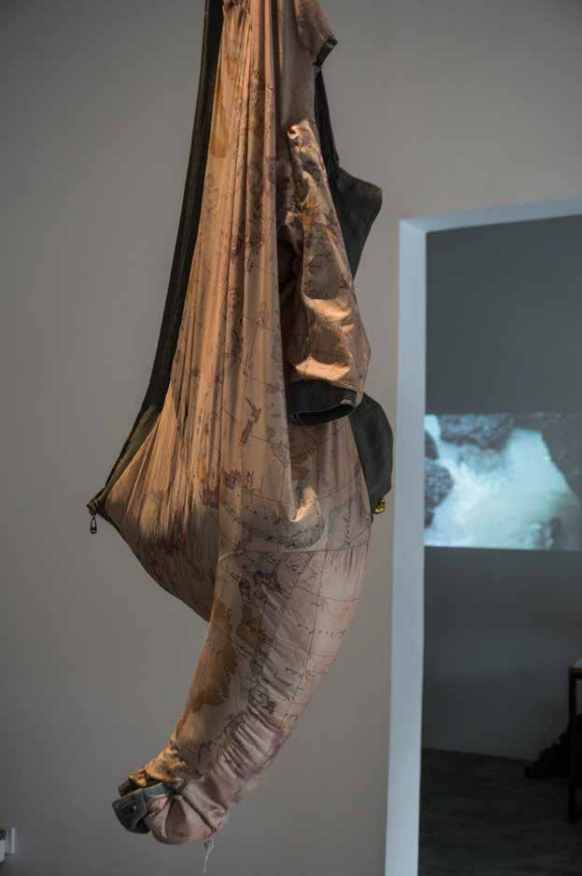
Installation view, "The Sap still runs", San Art, Ho Chi Minh City, Vietnam, 2019