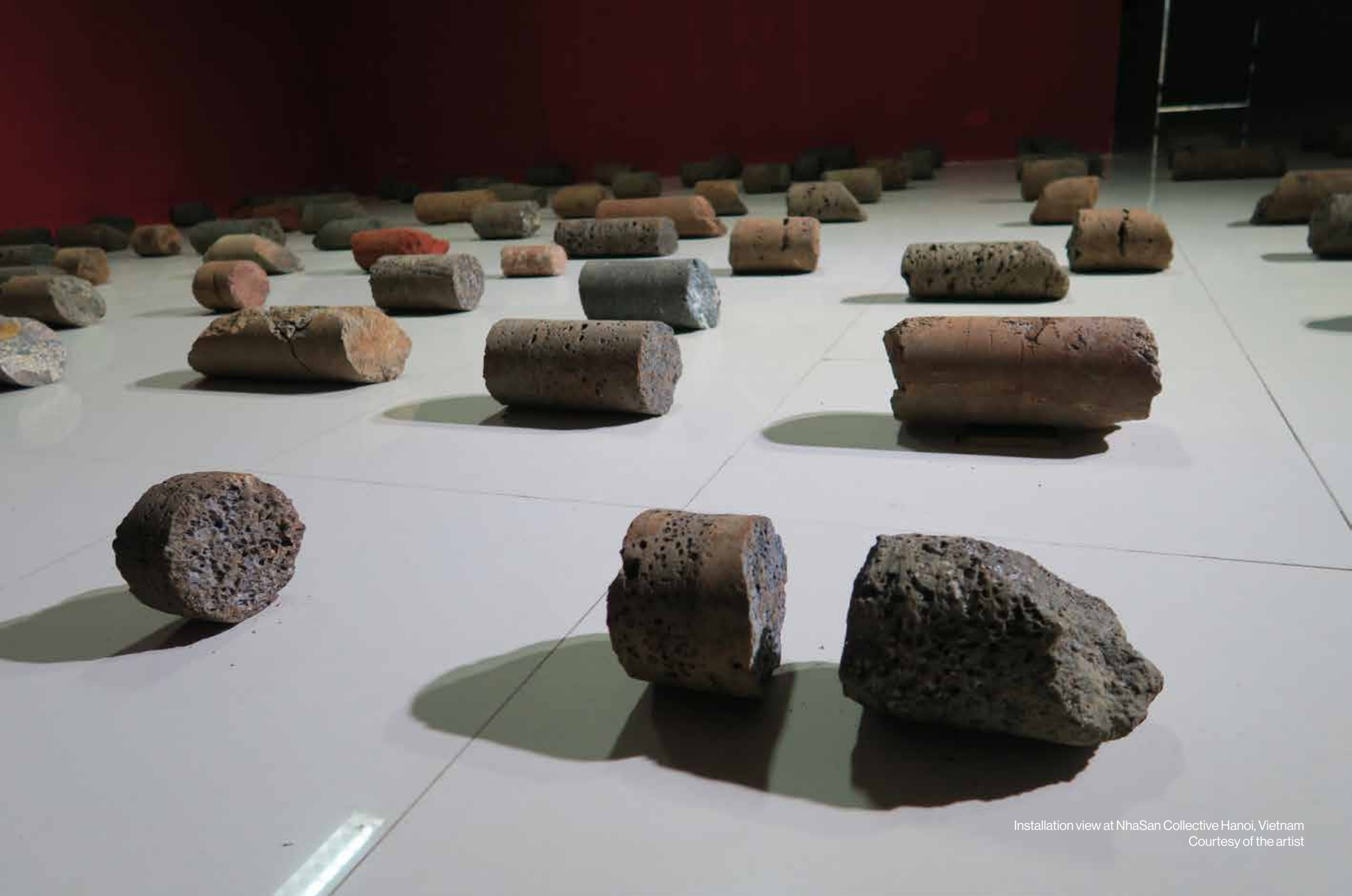
Installation view at NhaSan Collective Hanoi, Vietnam