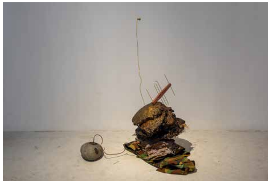
2000 years...Something on Coming – Something on Going 《兩千年.....來者來，去者去》 2018 - Ongoing

Soil, plaster, cicada shell, gold spray paint, found spade, found plaster statue, beehive, antenna, rock, honey, wood, plastic fertilizer bag, soil, text, LED light, weather, time 泥土，石膏，蟬殼，金色噴漆，現成鏟，現成石 膏雕像，蜂箱，天線，石，蜂蜜，木，肥料塑膠 袋，泥土，文字，LED燈，天氣，時間 Unique, dimension variable according to temperature, space and time 唯一版本，尺寸隨溫度、空間和時間而變化