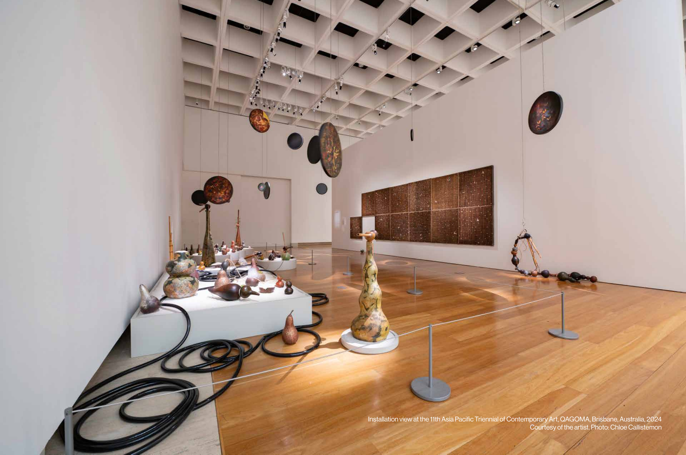
Installation view at the 11th Asia Pacific Triennial of Contemporary Art, QAGOMA, Brisbane, Australia, 2024