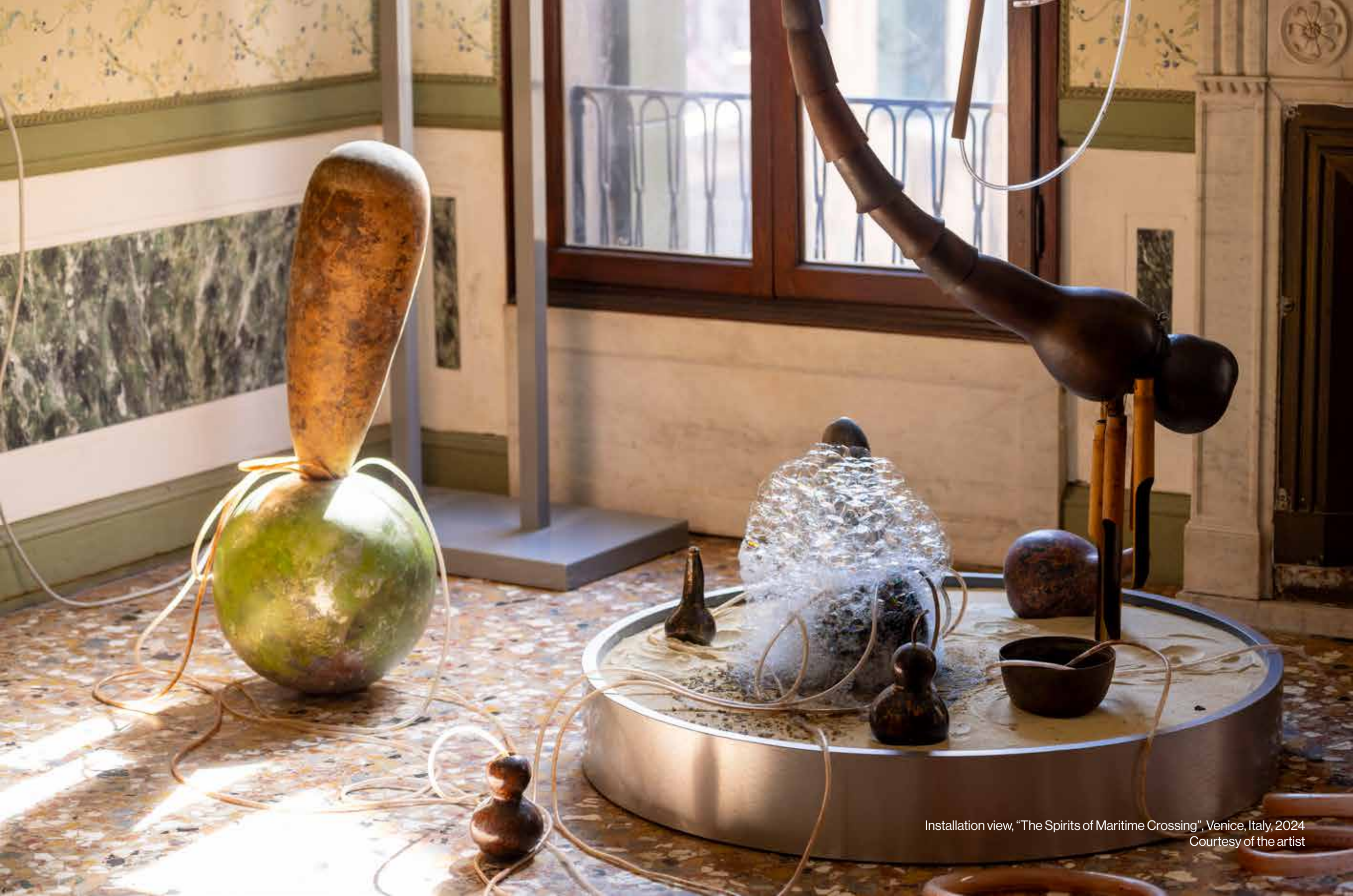
Installation view, "The Spirits of Maritime Crossing", Venice, Italy, 2024