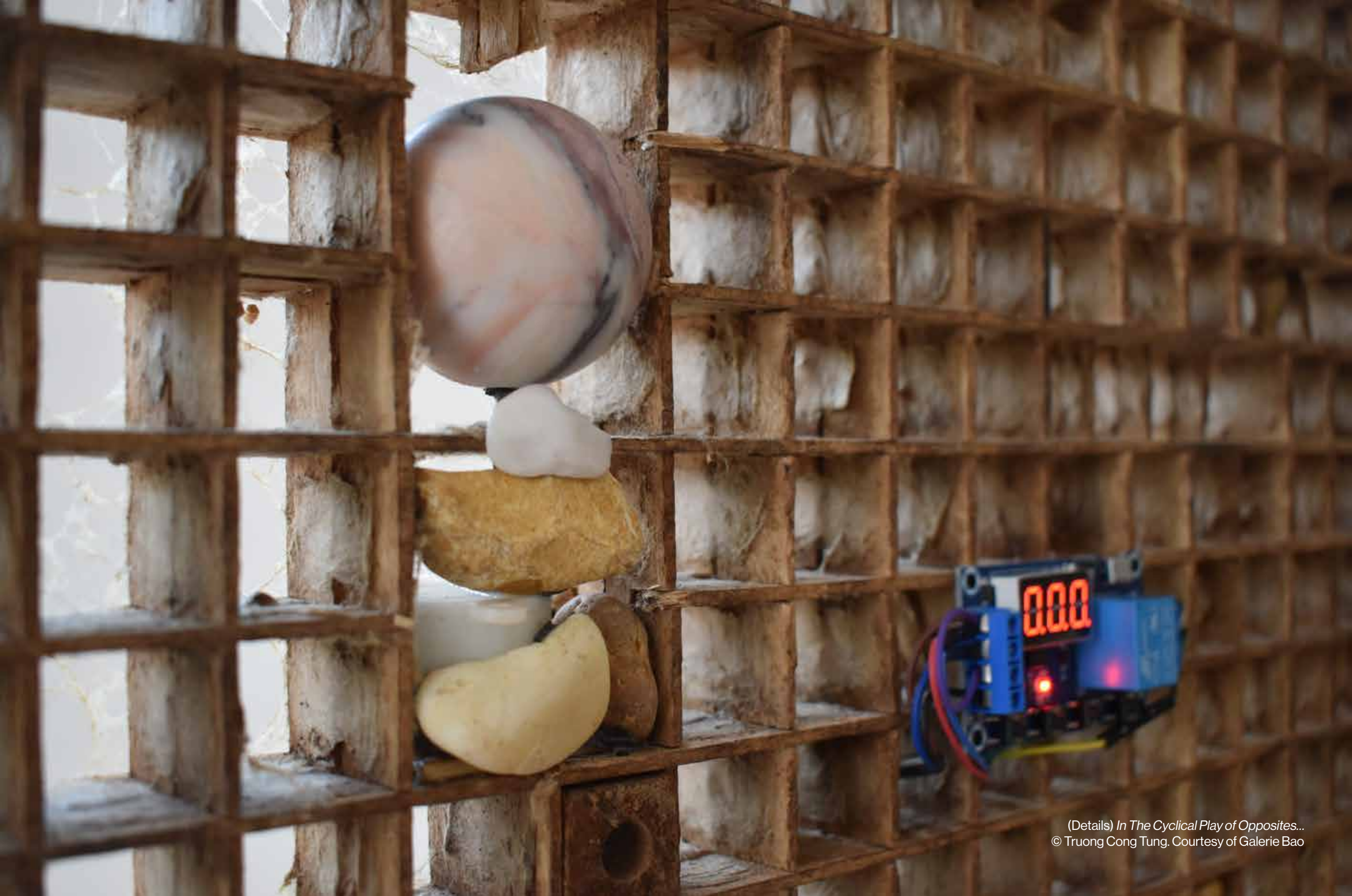
(Details) In The Cyclical Play of Opposites... © Truong Cong Tung. Courtesy of Galerie Bao