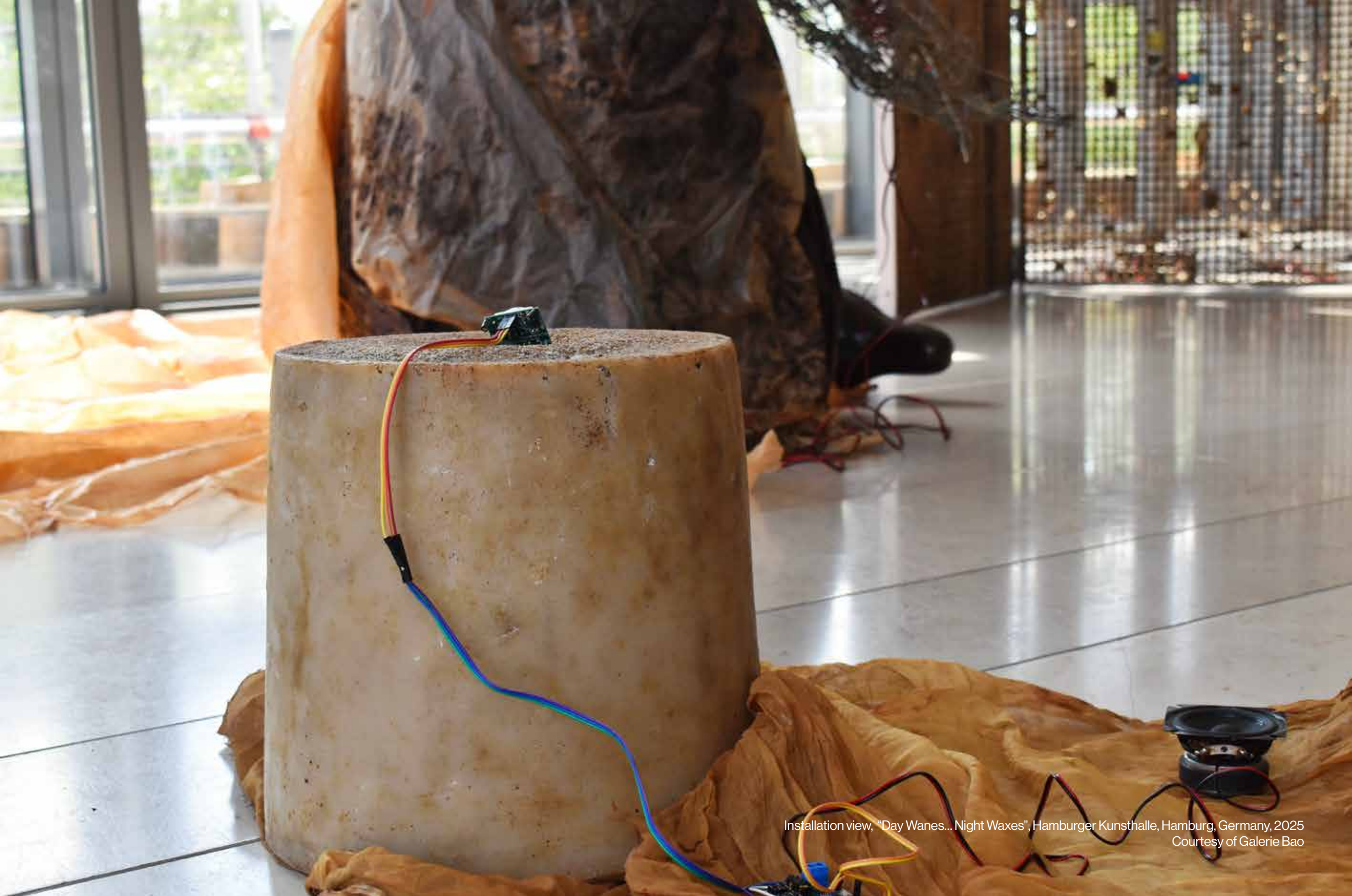
Installation view, "Day Wanes... Night Waxes", Hamburger Kunsthalle, Hamburg, Germany, 2025