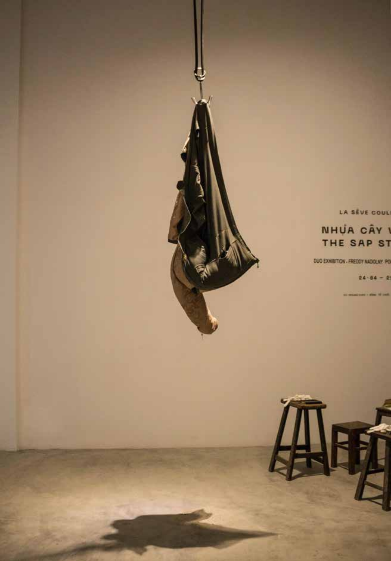
Installation view, "The Sap still runs", San Art, Ho Chi Minh City, Vietnam, 2019