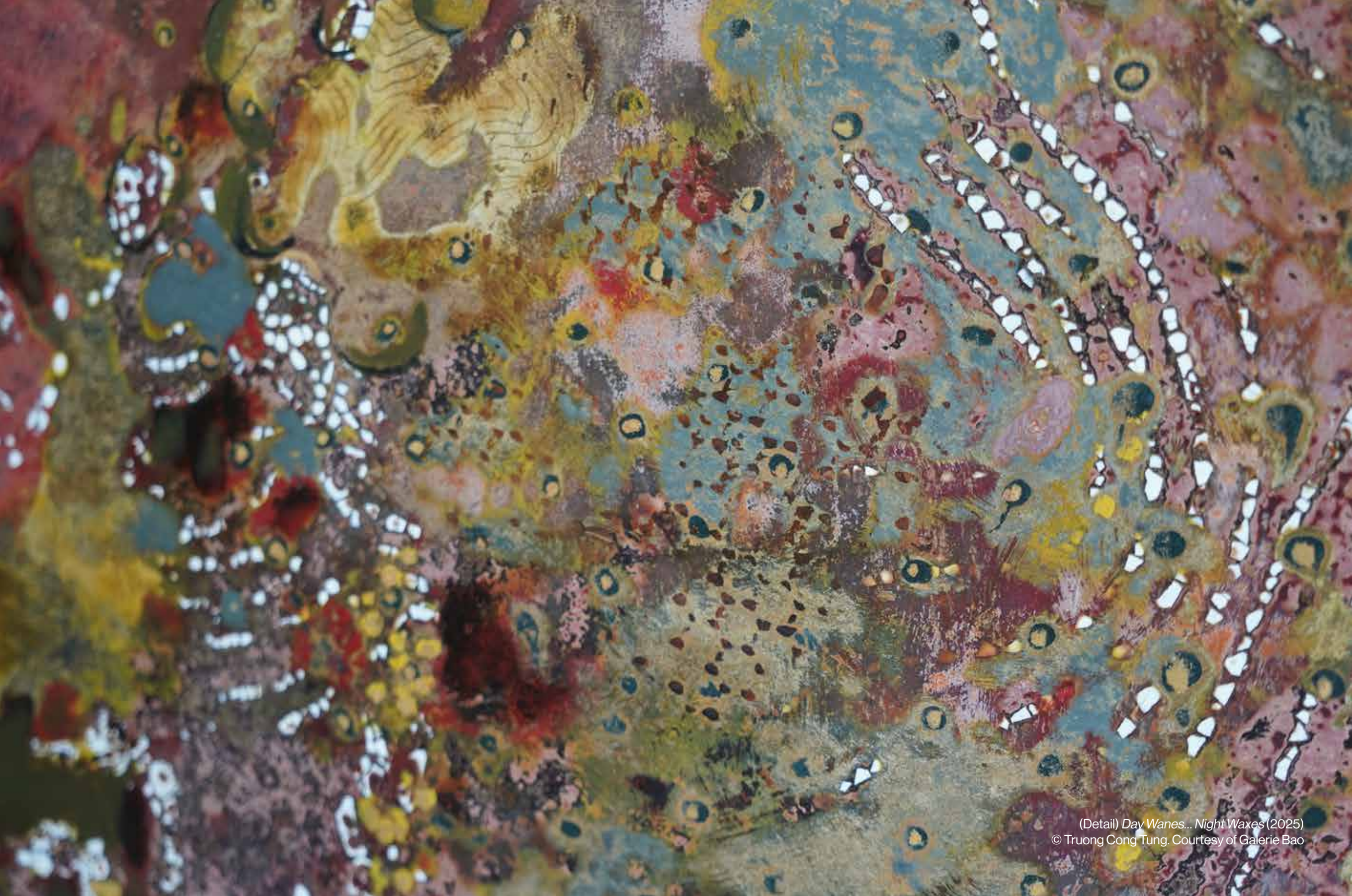
(Detail) Day Wanes... Night Waxes (2025) © Trung Cong Tung. Courtesy of Galerie Bao