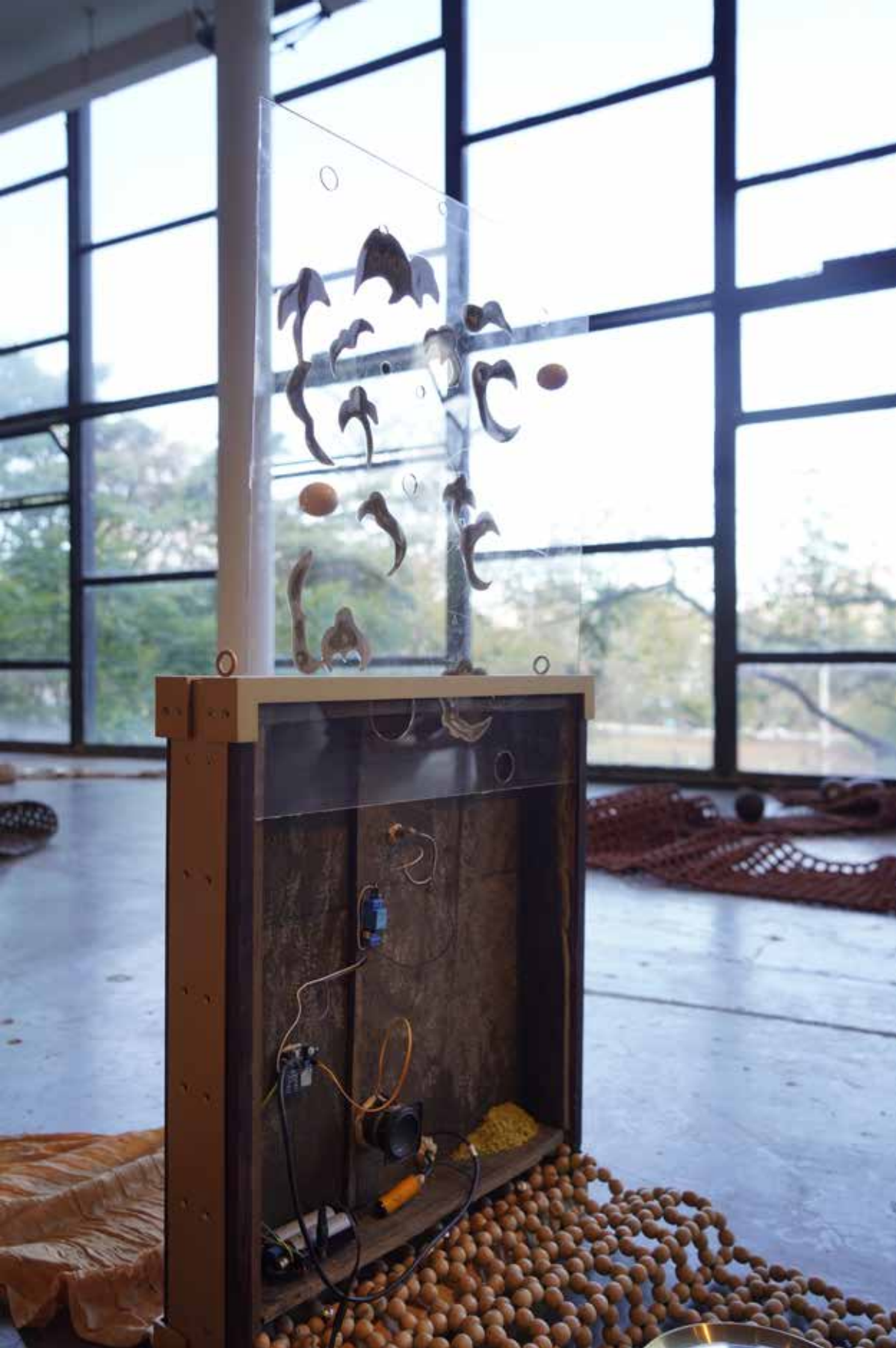
Installation view of "When Nothingness Becomes an Echo of Something and Something is an Echo of Nothing", at the 36th Bienal de São Paulo.