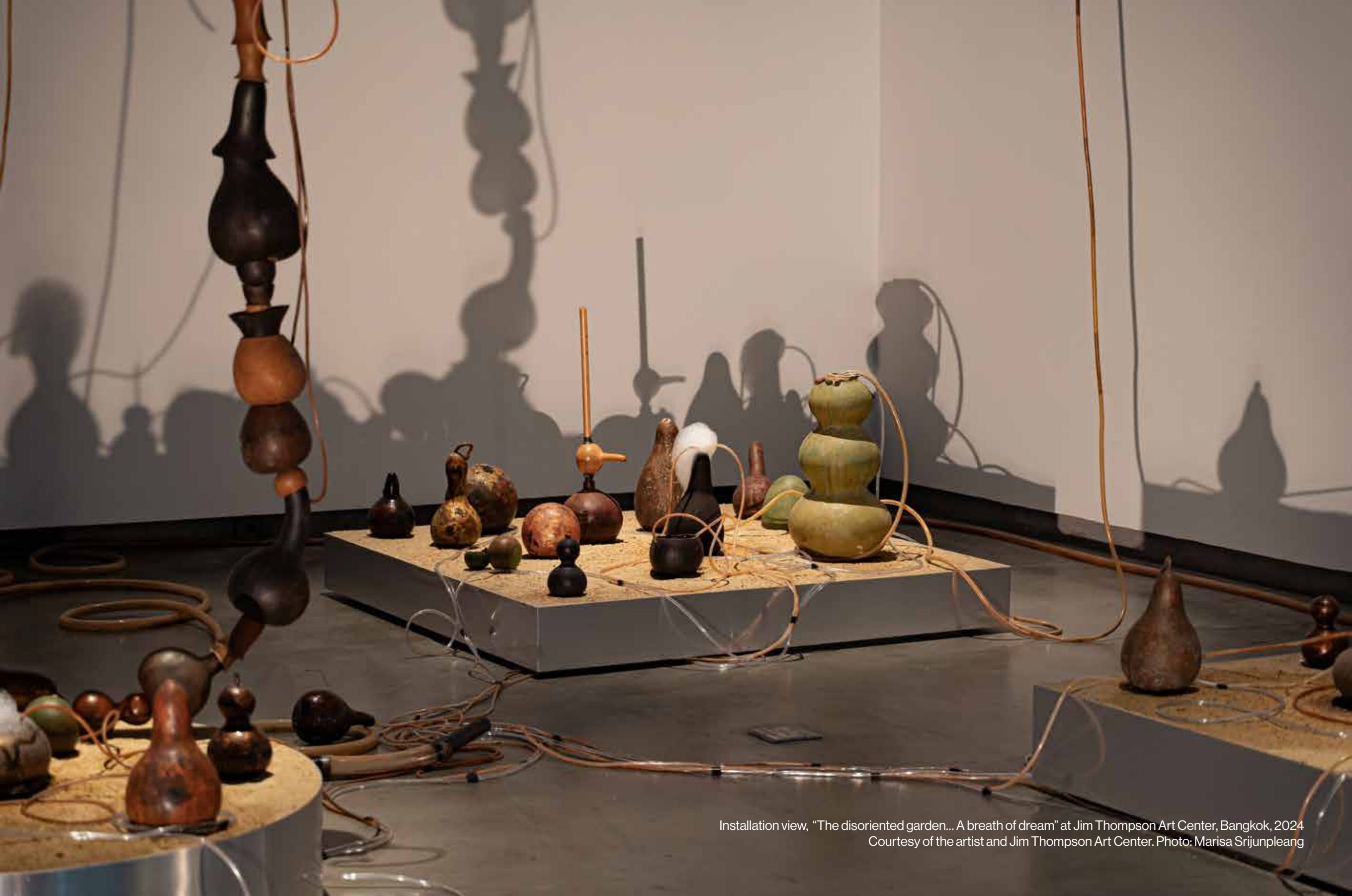
Installation view, "The disoriented garden... A breath of dream" at Jim Thompson Art Center, Bangkok, 2024 Courtesy of the artist and Jim Thompson Art Center. Photo: Marisa Srijunpleang