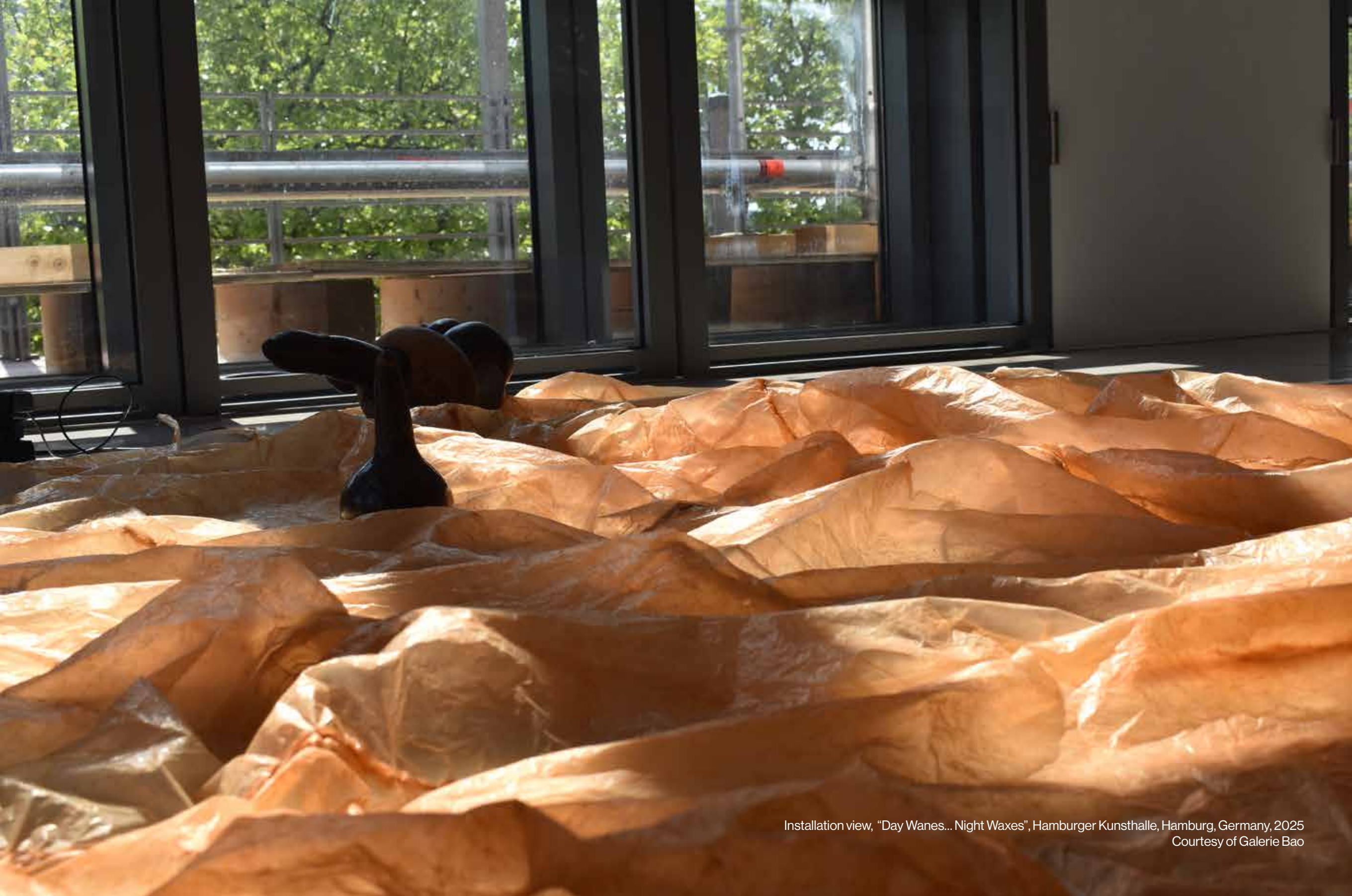
Installation view, "Day Wanes... Night Waxes", Hamburger Kunsthalle, Hamburg, Germany, 2025