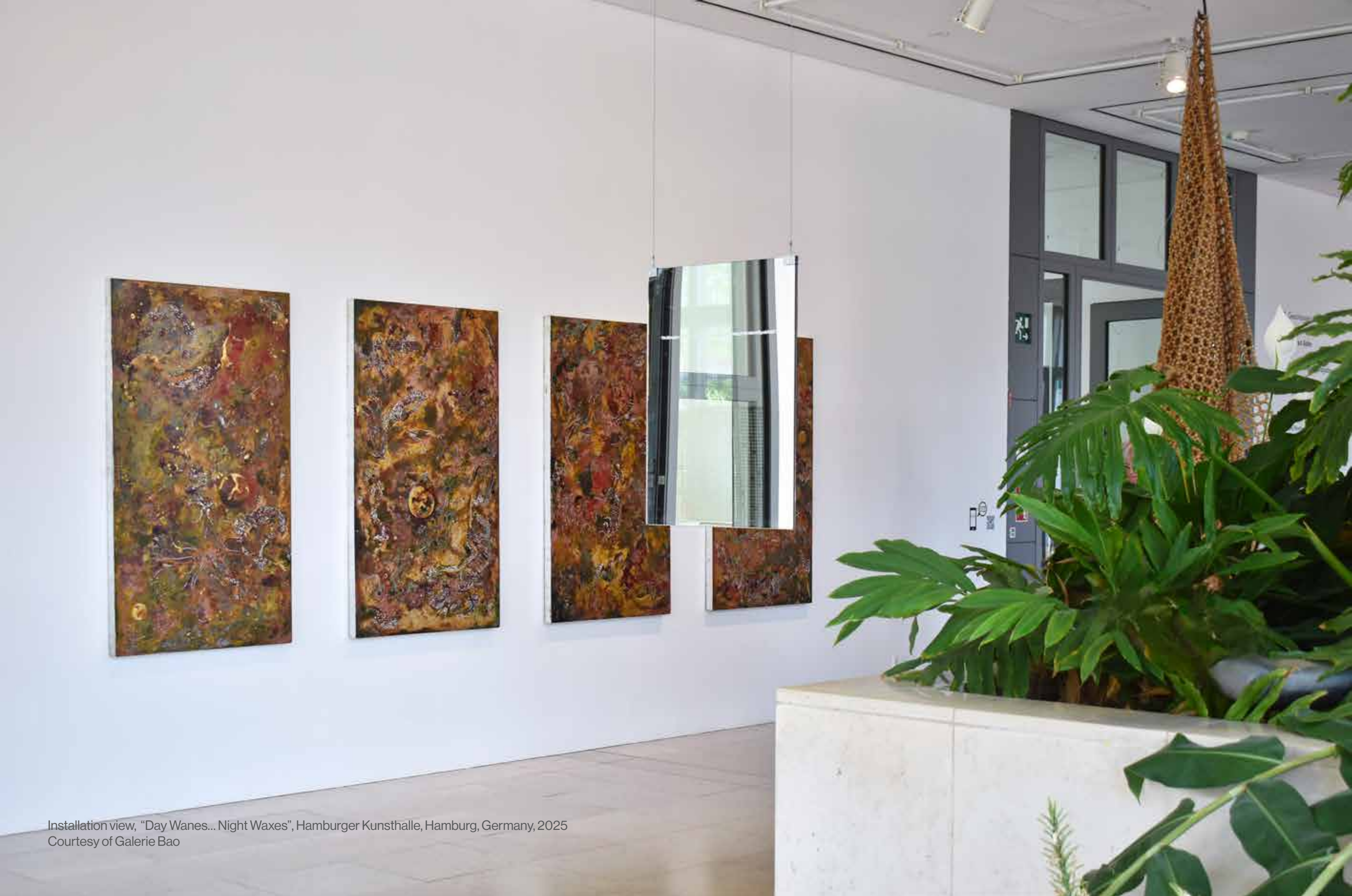
Installation view, "Day Wanes... Night Waxes", Hamburger Kunsthalle, Hamburg, Germany, 2025