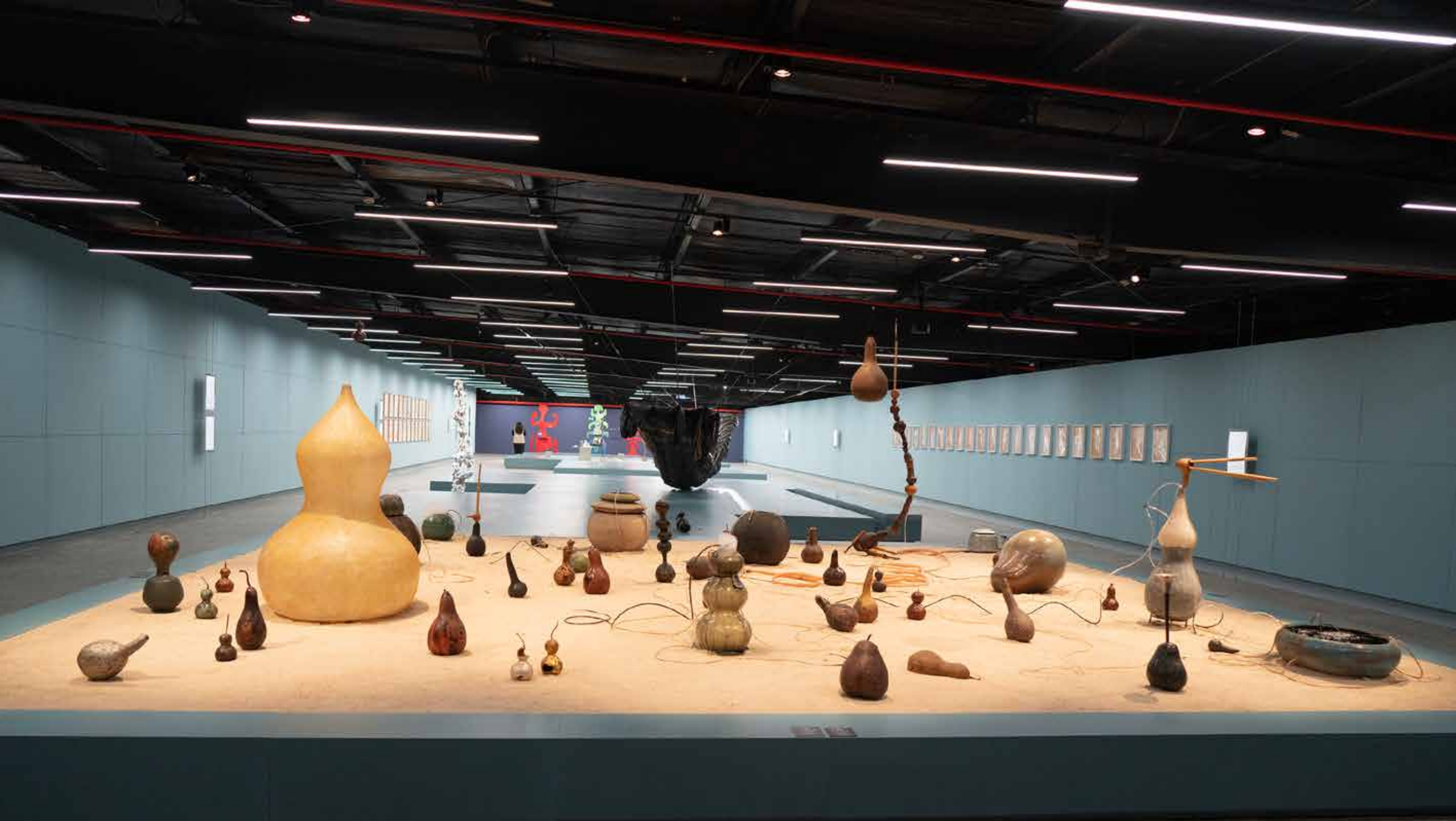
Installation view of "The State of Absence... Voices from Outside", at the 3rd Diriyah Contemporary Art Biennale.