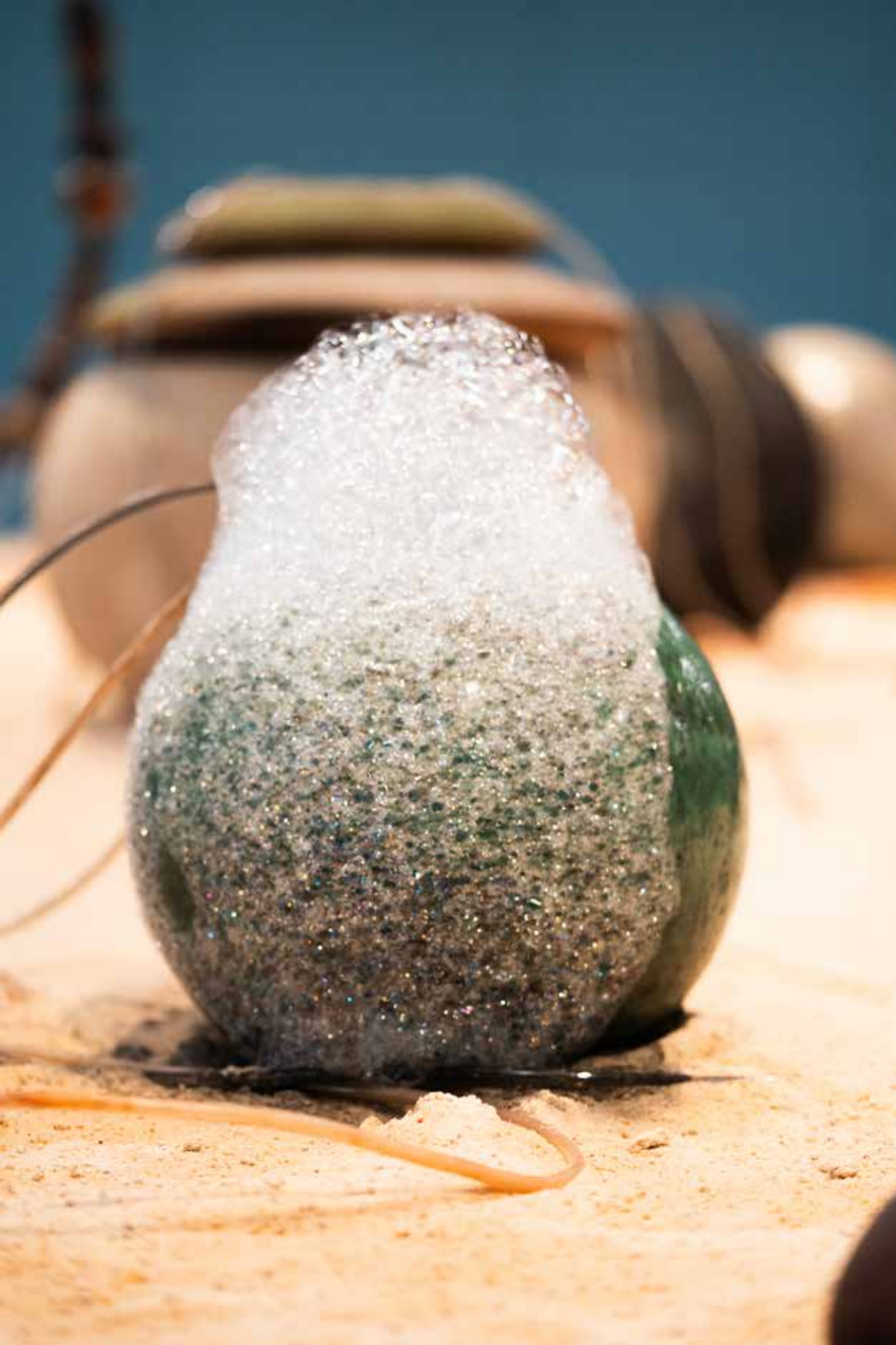
Installation view of "The State of Absence... Voices from Outside", at the 3rd Diriyah Contemporary Art Biennale.