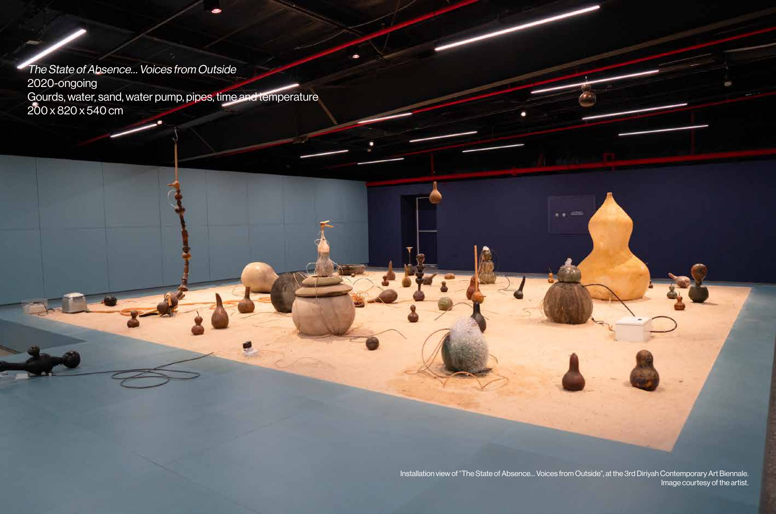
Installation view of "The State of Absence... Voices from Outside", at the 3rd Diriyah Contemporary Art Biennale.

The State of Absence... Voices from Outside 2020-ongoing Gourds, water, sand, water pump, pipes, time and temperature 200 x 820 x 540 cm