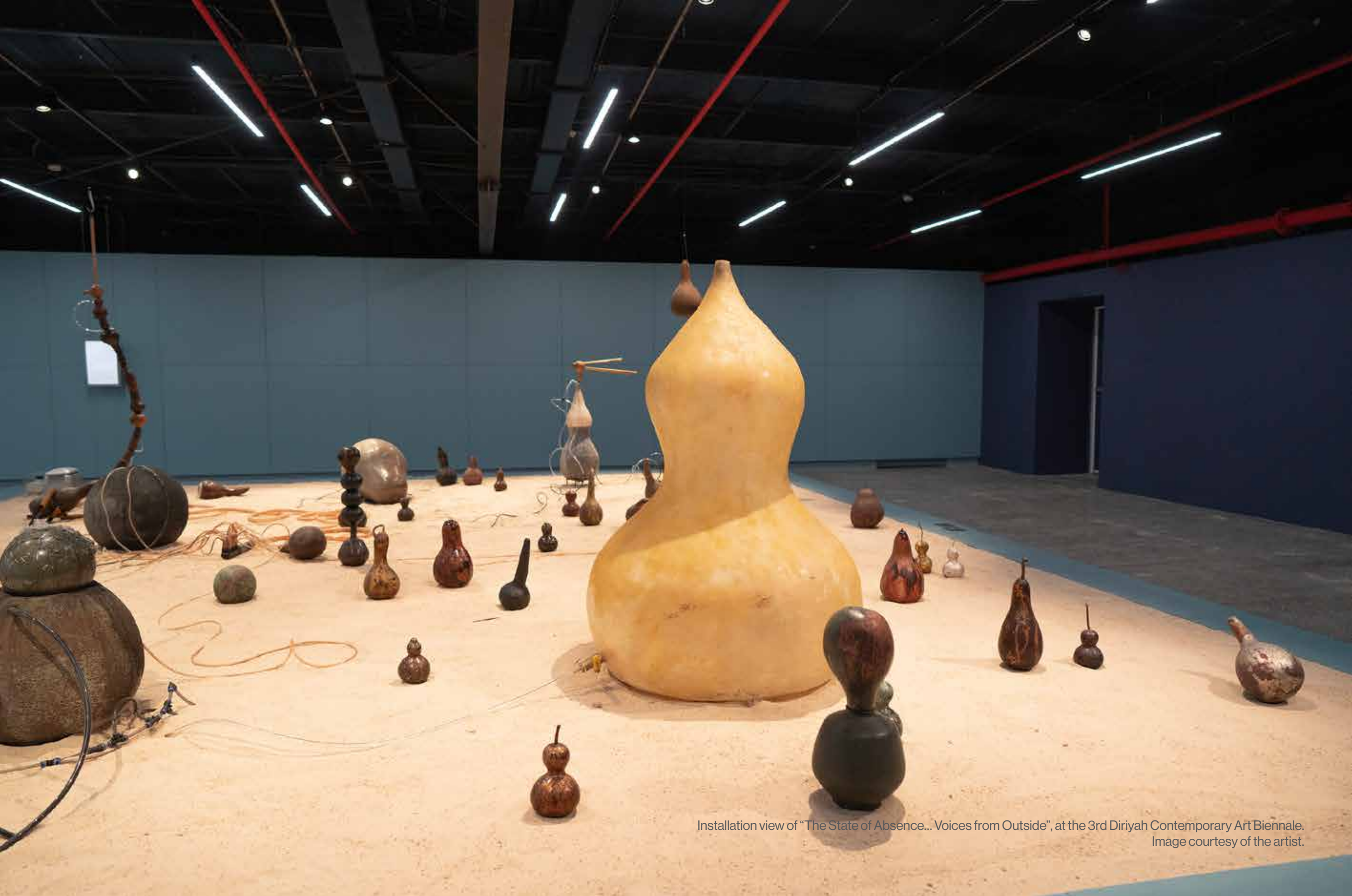
Installation view of "The State of Absence... Voices from Outside", at the 3rd Diriyah Contemporary Art Biennale.