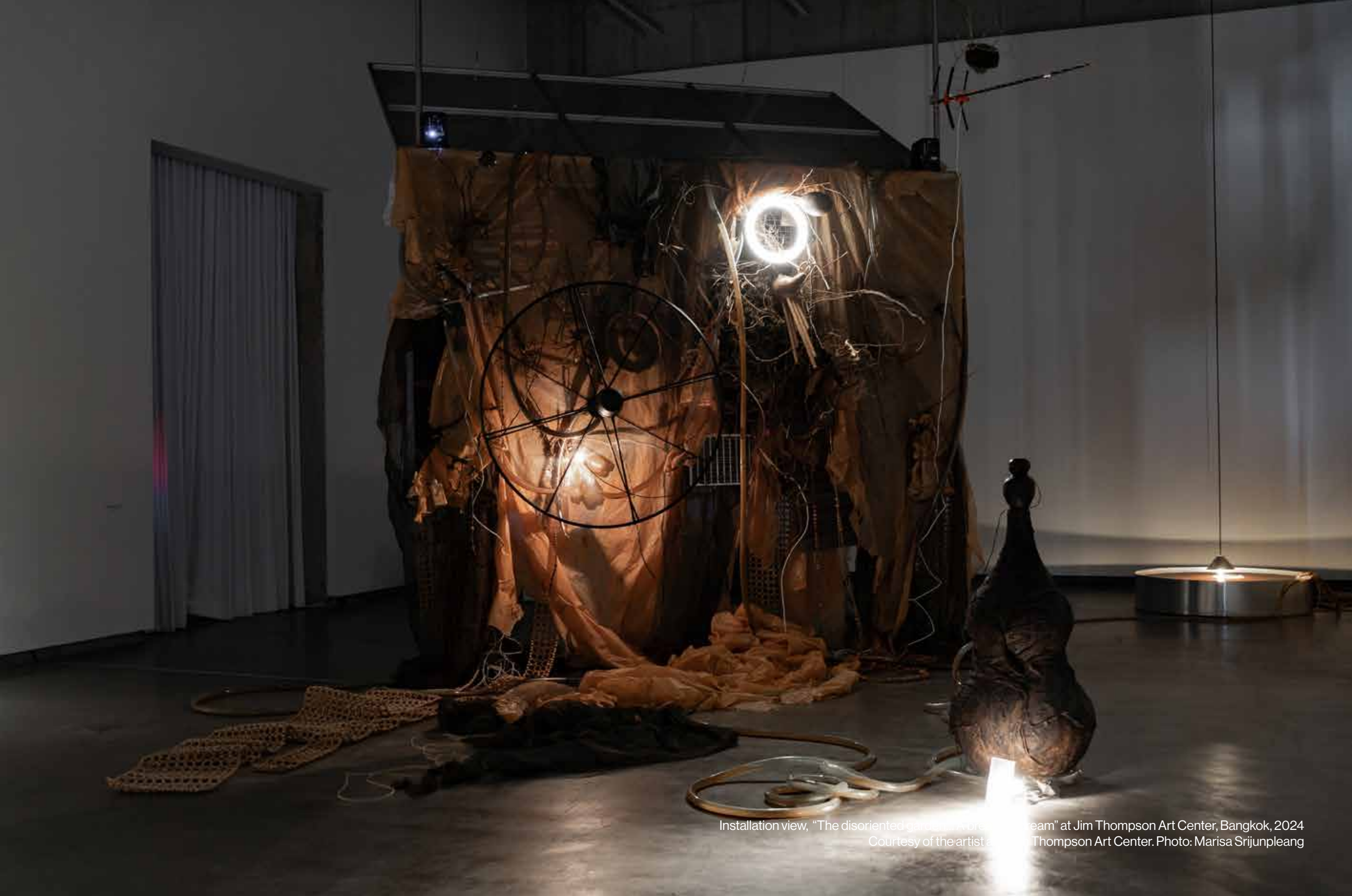
Installation view, "The disoriented garden: A forest in a dream" at Jim Thompson Art Center, Bangkok, 2024