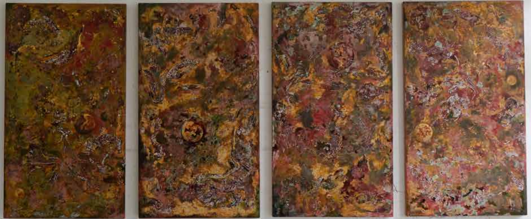
Day Wanes... Night Waxes 2025

lacquer on wood, egg shells, silver leaf, gold leaf, time and temperature, picture in the artist's studio