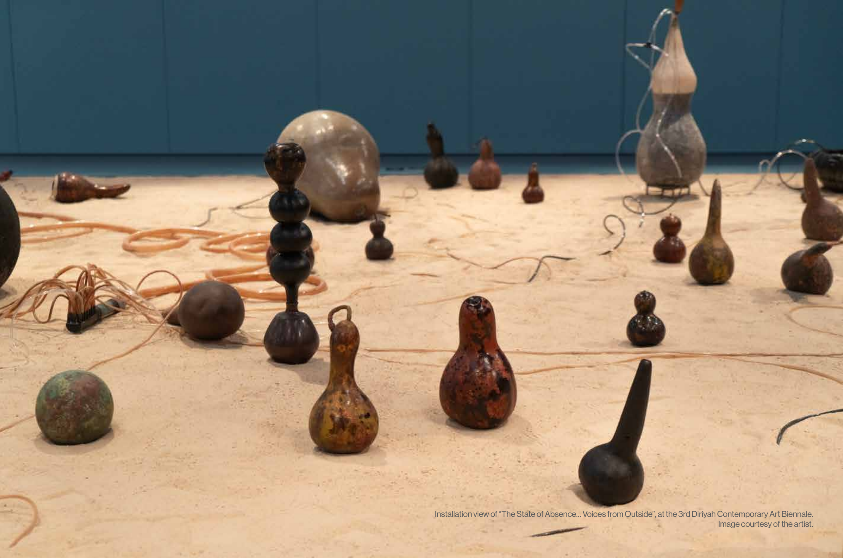
Installation view of "The State of Absence... Voices from Outside", at the 3rd Diriyah Contemporary Art Biennale.