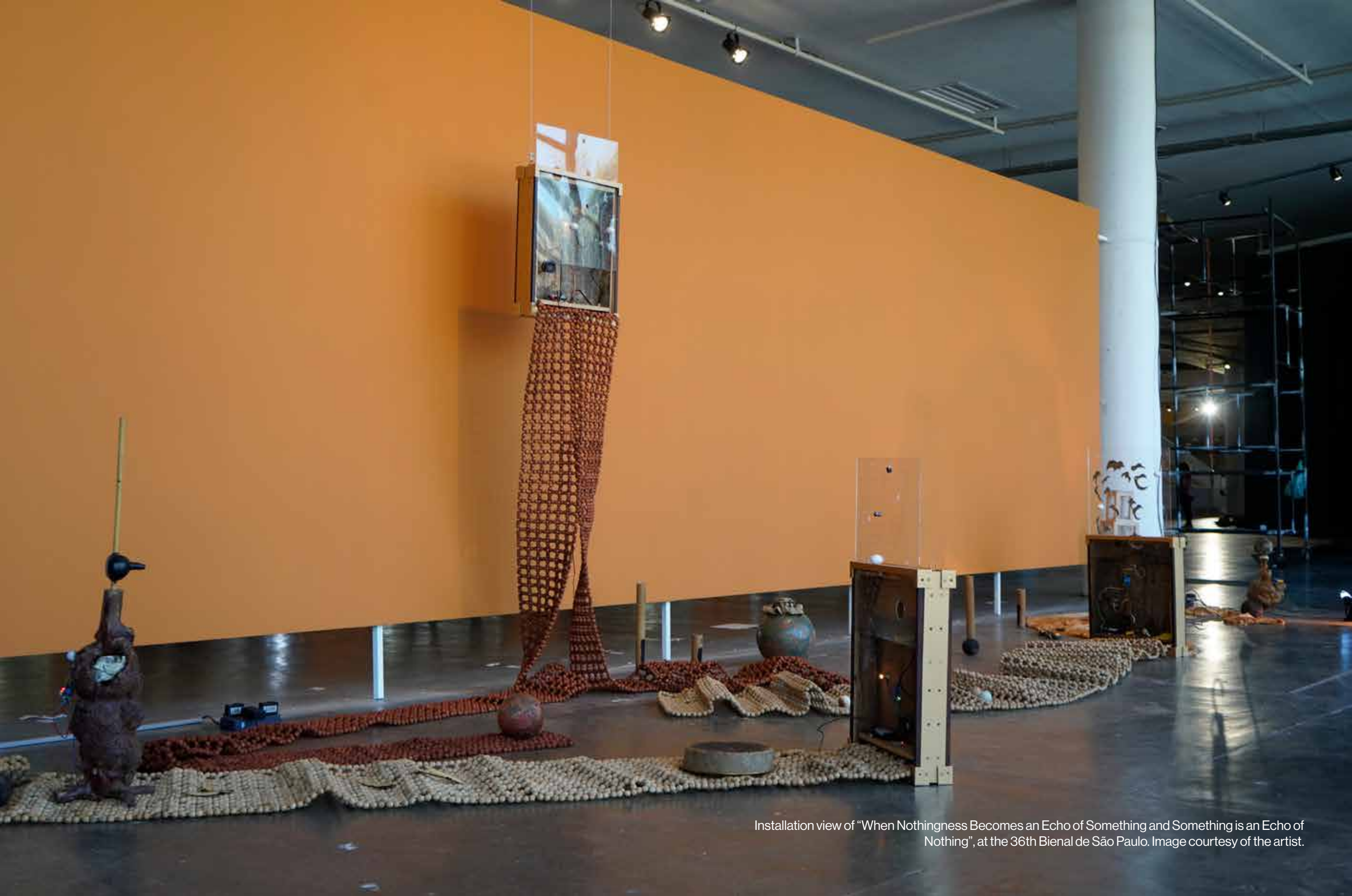
Installation view of "When Nothingness Becomes an Echo of Something and Something is an Echo of Nothing", at the 36th Bienal de São Paulo.