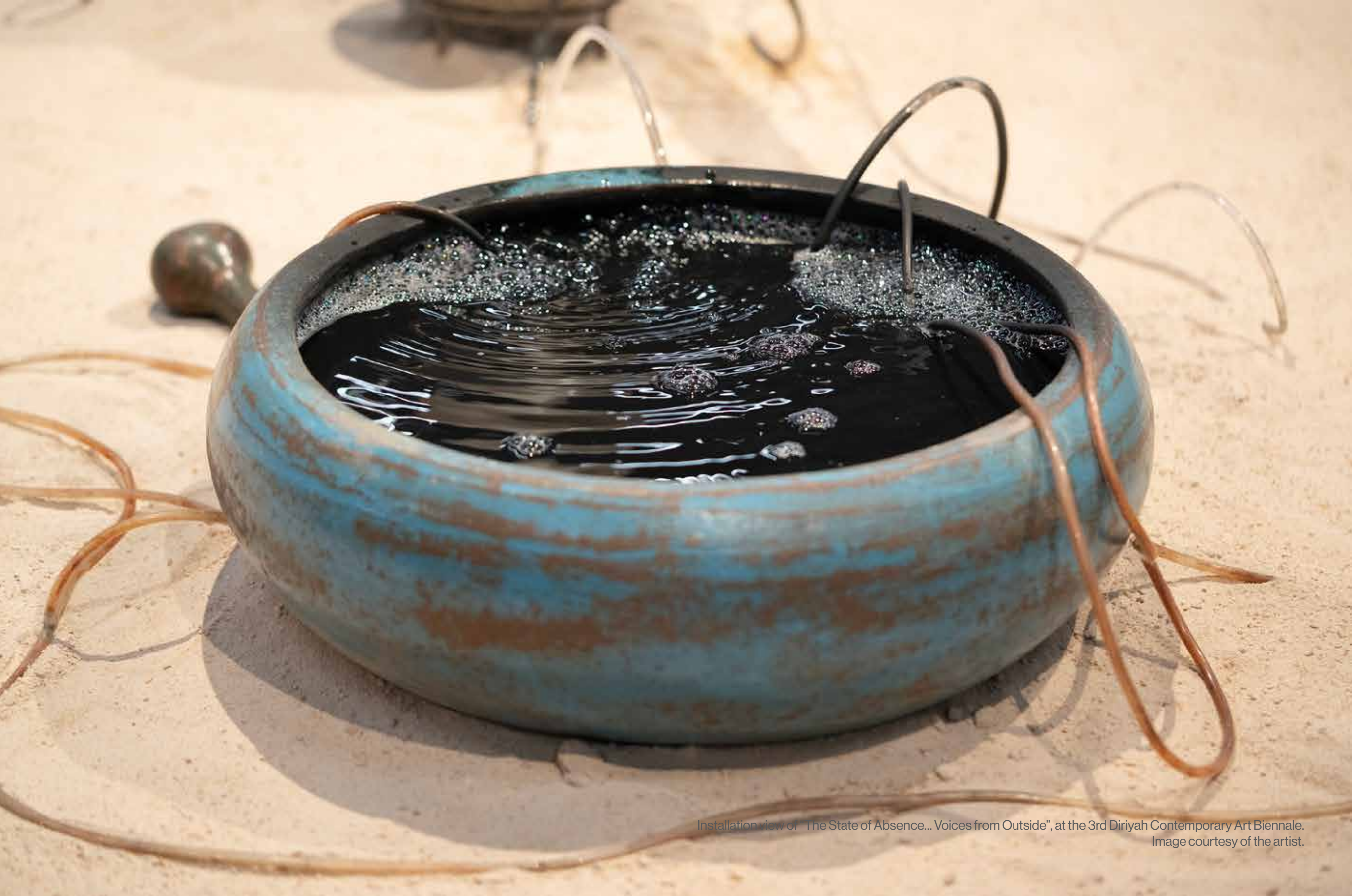
Installation view of "The State of Absence... Voices from Outside", at the 3rd Diriyah Contemporary Art Biennale.