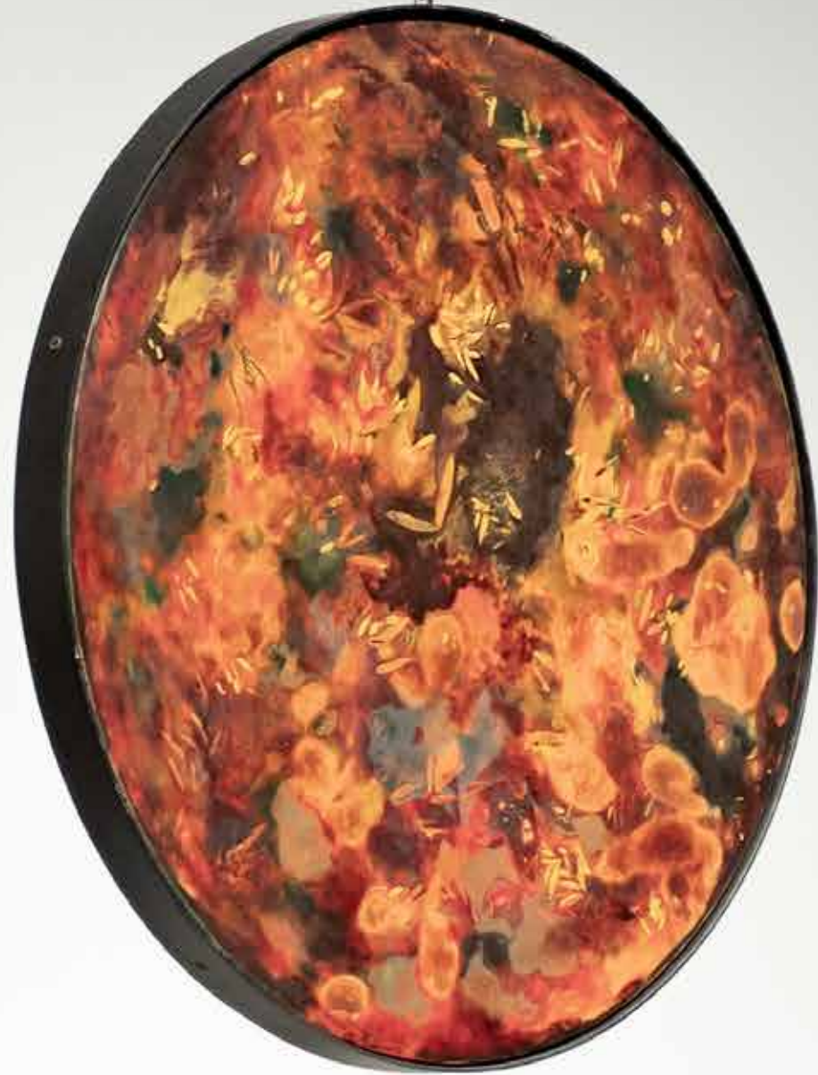
Installation view, "The disoriented garden... A breath of dream" at Jim Thompson Art Center, Bangkok, 2024