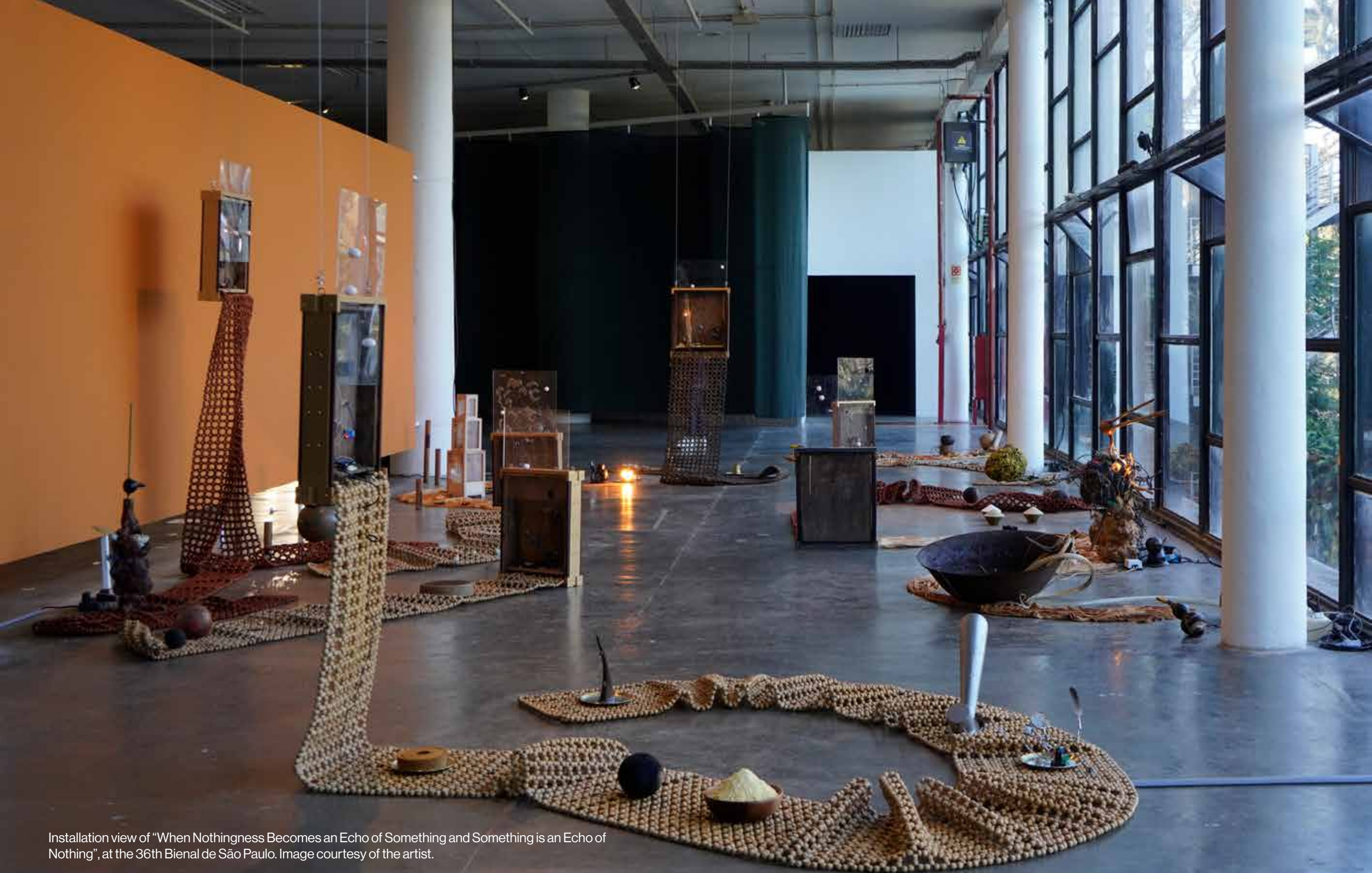
Installation view of "When Nothingness Becomes an Echo of Something and Something is an Echo of Nothing", at the 36th Bienal de São Paulo. Image courtesy of the artist.