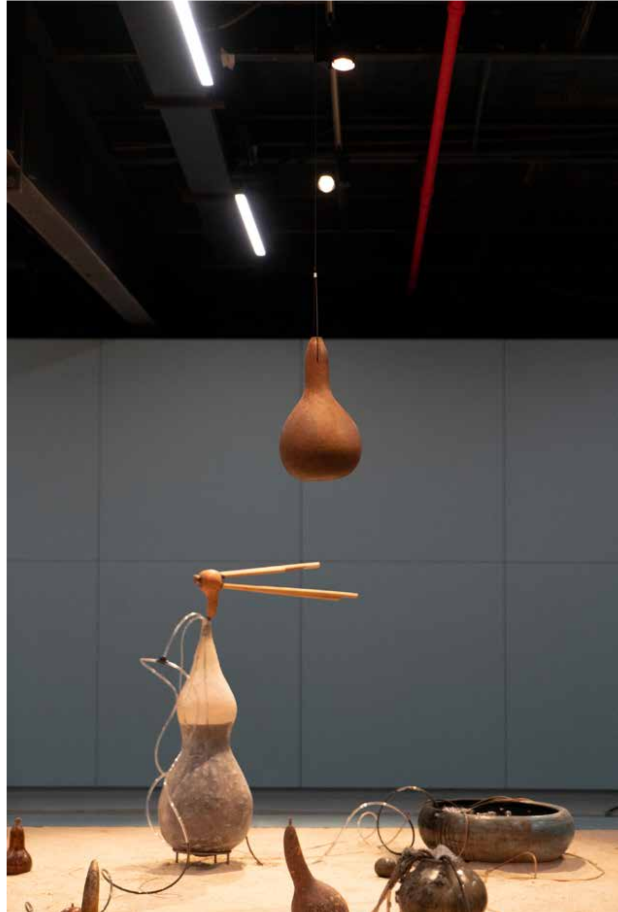
Installation view of "The State of Absence... Voices from Outside", at the 3rd Diriyah Contemporary Art Biennale.